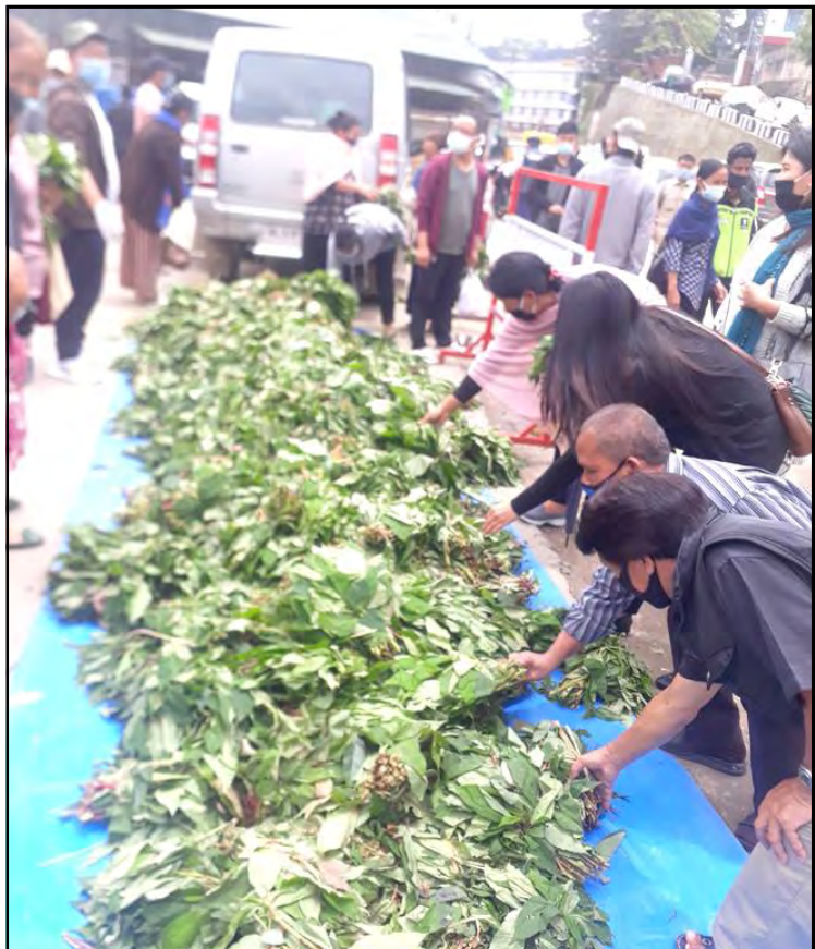
April 29, 2020 nü PHQ junction, Kohima nung nisungtemi angati aonsotsü lemzüka noksa nung angur. Item aonsotsü ya Chakhesang nung yim asemi tenla aser iba maparen ya CBCMHK-i achaayanga inyak.

Kohima, April 30 (TYO): Coronavirus tashidak prokba nokdangtsü atema India linük tesem ajak shibanger aliba mapang nung nungdabapurtem yaritsü asoshi Bodhbarnü (April 29) PHQ Junction, Kohima nung Chakhesang Baptist Church Ministers' Hill, Kohima (CBCMHK)-i Kohima yimti nung alirtem nem aonsotsü angati lemtsüogo, ta CBCMHK