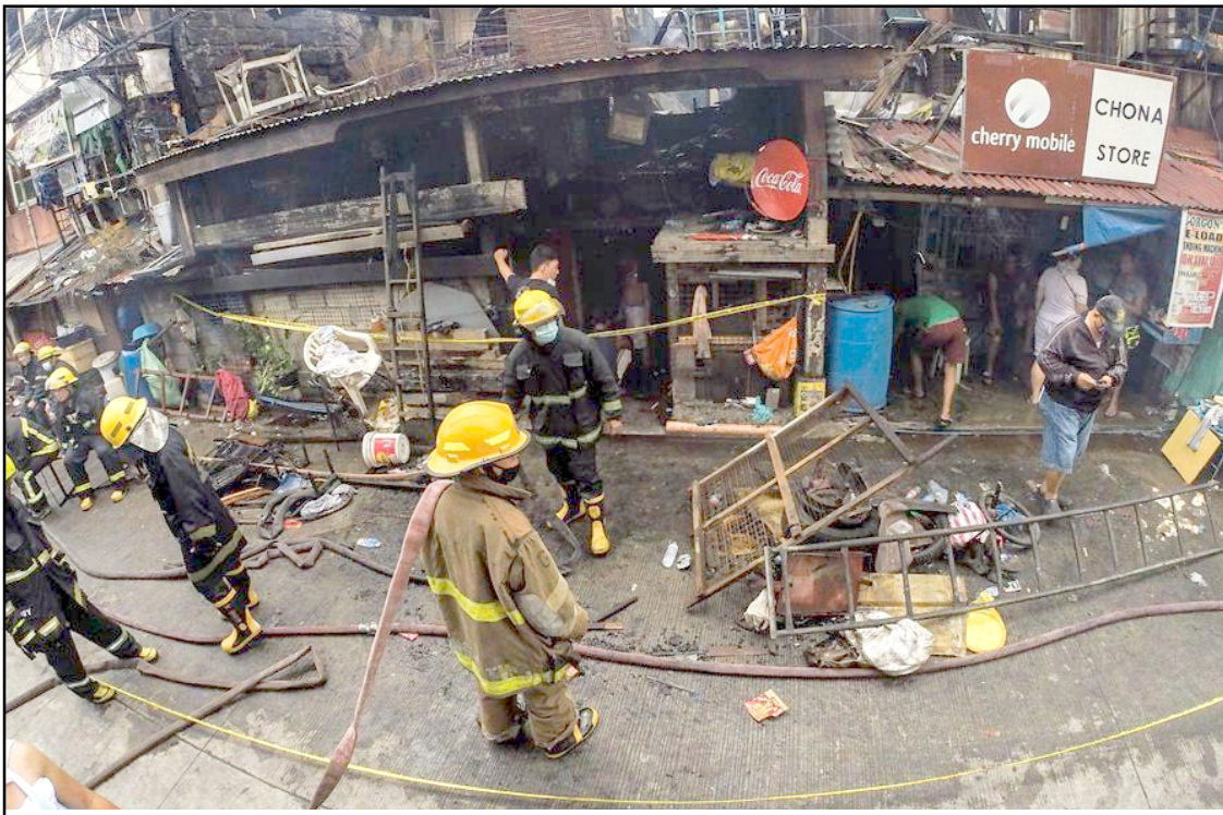
Manila, Philippines nung April 30, 2020 nü nisung aliba tesem ka nung mi adokba sülen firefighter tem ki rongdoker aliba ka jakdang nokdaka aliba noksa nung angur. Brehostibarnep Manila indang Tondo distric nung mi agi ki ishika rongdoka nisung trok asü.