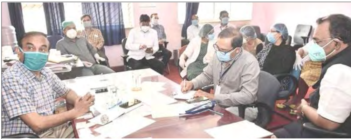
Ranchi, Rongchii/April 30, 2020: Brihostibarnü Ranchi nung coronavirus tashidak tensa atema doctor tem rongdak senden ka nung adenba noksa nung angur.