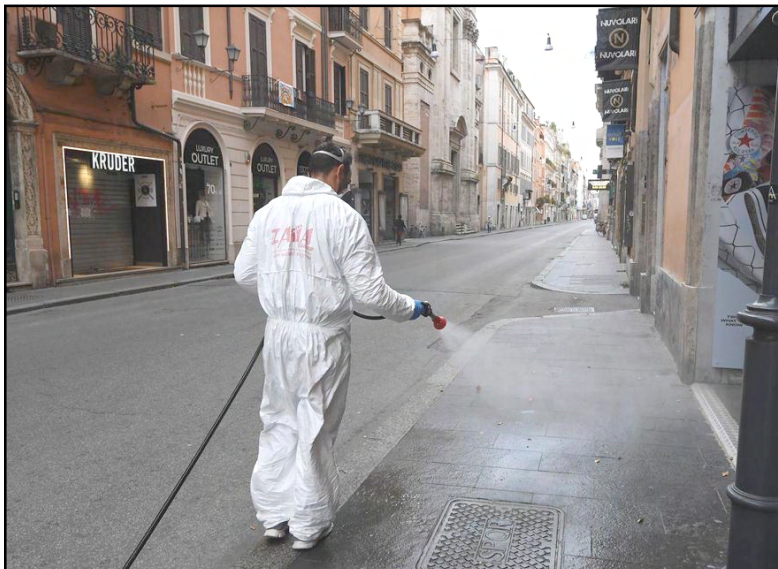
Rome, Italy nung April 29, 2020 nü ketdangser kati ki ka kima mesen südaktsüba mozü akhaba noksa nung angur. COVID-19 tashidak wara agi anempong nung aliba linük, Italy nung nisung taküm 27,600 dak tema agiogo. Iba linük nung COVID-19 agi asüba, menepba aser taneptsü anguba ajak senteper nisung 203,591 lir, ta linük indang Civil Protection Department ajanga Bodhbarnü ashi.

Nisung onsara asüba ajanga hopta aika nisung tasü mang aremstsü mesüra rongdoktsü menur, ta asüpila sentong agiba tesemtem nung inyakertemi ashir.