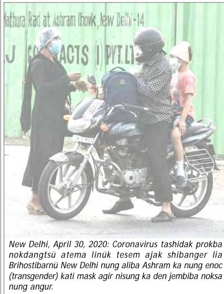
New Delhi, April 30, 2020: Coronavirus tashidak prokba nokdangtsü atema linük tesem ajak shibanger lia Brihostibarnü New Delhi nung aliba Ashram ka nung enoc (transgender) kati mask agir nisung ka den jembiba noksa nung angur.

April 27 nü Ato kilonser, Narendra Modi-i ayongba senden nung adener chief minister aikati, linük nung coronavirus tashidak maneni aika dak puteter, anungji ano maneni linük shibangtsüla, ta benoka liasü.