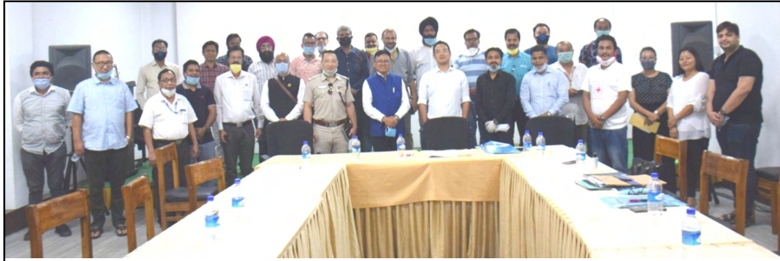
Marwari Samaj, Bengali Samaj, Jain Samaj, Oswal Samaj, Aggrawal Samaj, Gorkha Samaj, Kachari Tribal Council, Punjab Samaj, Kerala Samaj, Bhojpuri Samaj, Muslim Council nungi senden nung adener ketdangsertem tangokba noksa nung angur.