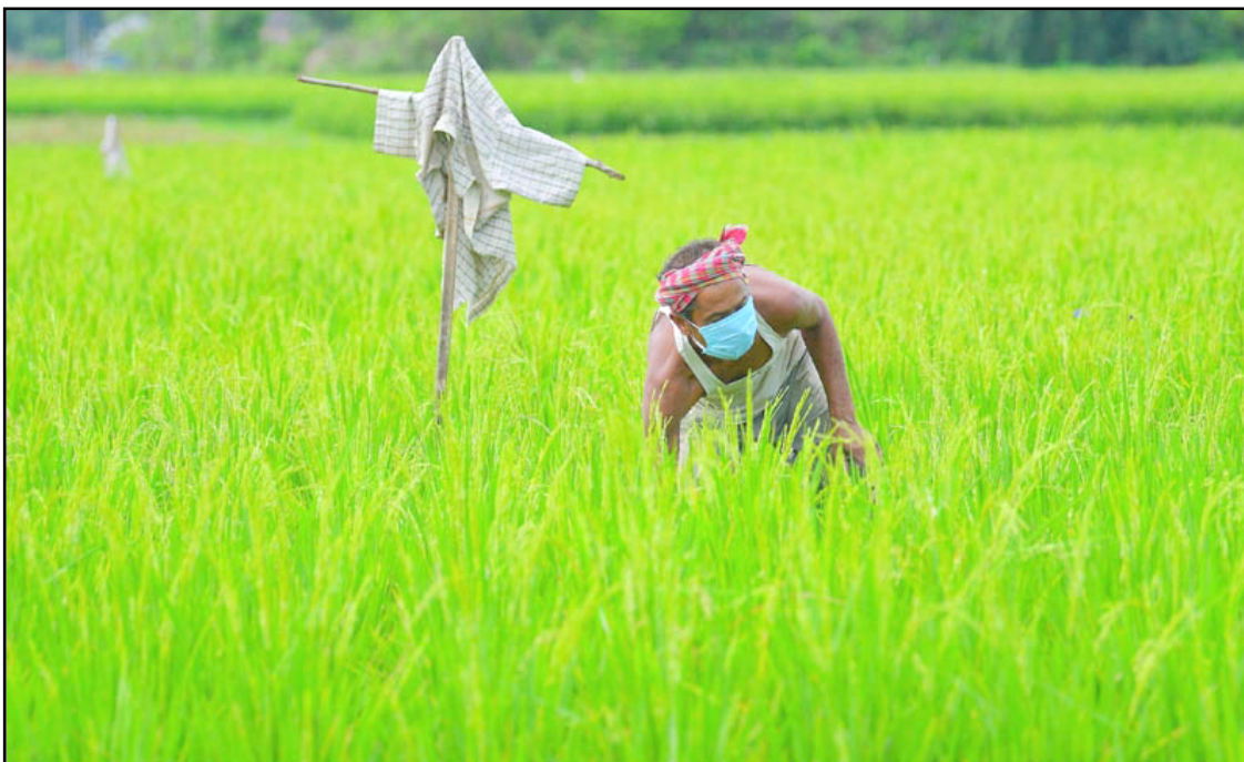
Agartala, April 30: Coronavirus prokshia meyoktsü asoshi sorkari linük ajunga mokdanga yur aliba mapang Agartala nung Brehostibarnü aluyimertem mask semer alu nung inyakba noksa nung angur.

Atom aser Anand na tzü agi abonger bener aoba/ tzü nung arakseta asüba osang police nem metetdaktsüba sülen tena mang bushitsü atema maparen tenzükka liasü, ta kasa sangdong ajanga metetdaktsü.