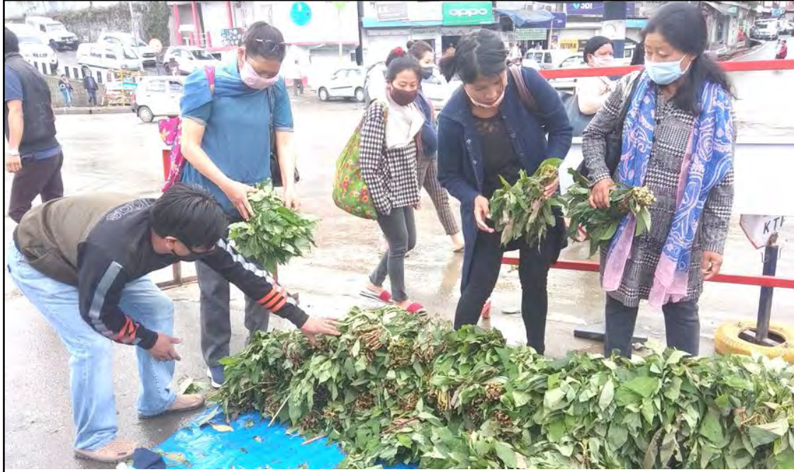
Kohima, Rongchii 30: April 29 nü PHQ junction, Kohima nung Phek district kübok yimtsüng aseme bener arutsüba anosotsü balala angati agizükba noksa nung angur.

Kohima, Rongchii/April 30 (TYO): Phek district kübok Thevopisu, Khulazu Basa, aser Porba yimtsü agütsüba organic aonsotsütem April 29 nü Kohima nung Chakhesang Arogotemi angati lemstsüogo.