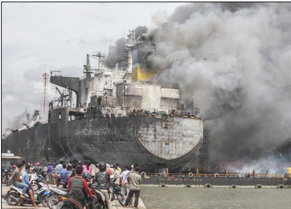
Indonesia indang North Sumatra province kübok Port of Belawan nung aliba Waruna Shipyard nung totzü tazü bena aliba rong tuluka May 11, 2020 nü raksar mi adoka aliba mapang tangokba noksa nung angur. Port of Belawan nung rong anendak, Waruna Shipyard nung anena aliba crude oil tanker ka nung Hombarnep mi adoka iba lendong nung nisung tenet yirua liasü.