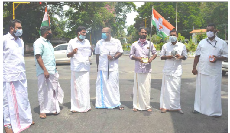
Thiruvananthapuram (Kerala), May 11, 2020: Coronavirus tashidak nokdangtsü atema linük shibangba ajanga Kerala nung aika linük tesem balala nungi maruteti aliba anema Hombarnü Kerala yimtiba, Thiruvananthapuram nung Youth Congress nung inyakertermi Cabinet rank nung sorkar ketdangser, A Sampath'er kidangi longkak aita aoba noksa nung angur.

90 jelia train station atongtsüla. Passenger ajaki Aarogya Setu app download süa amshitsüla. Passenger ajaki pei meyong blankets abentsüla aser chiyungtsü den tzü bener arutsüla, kechiyong train nung catering services malitsü. Railways-i sen yong chiyungtsü tilateri den tajemtsü tzü agütsütsü. Advance reservation period ji timtiba agi anogo 7 asütsü; RAC malitsü, waiting list ticket aser train nung booking memelatsü. e-ticket malirtem railway station telungi maitdaksütsü. Passenger temi railway station aser train naprongla nung mask agitsüla; station aser coaches nung passenger ajak nem hand sanitiser agütsütsü. Journey tembangba sülen state aser Union territories-i lateta aliba inyakyim ajak nung passenger temi amaliteptsüla. Train-i ayaketa atudang aser aludang passenger ajaki social distancing benshitsüla.