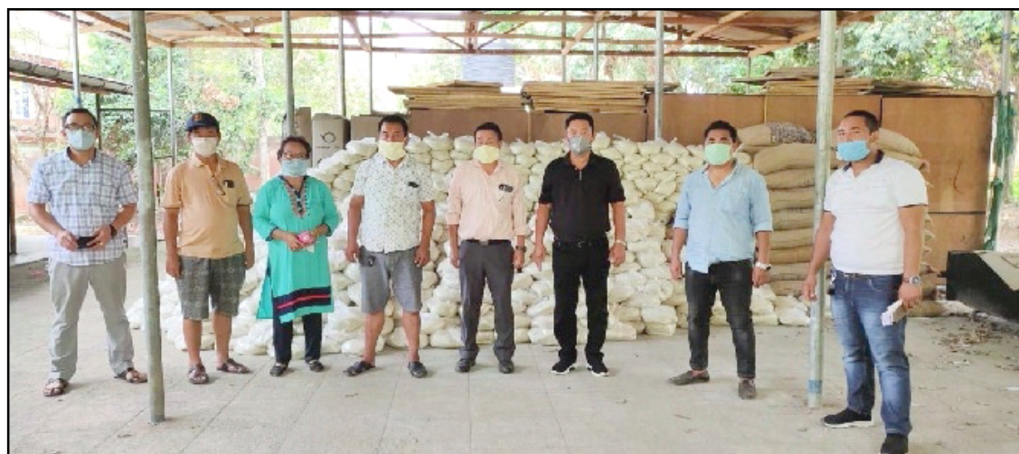
Dimapur, Monupii/May 11, 2020: Hombarnü, Moatoshi Longkumer-i 2 Dimapur II AC nung timtema alir kibongtem nem jang-o-tzü lema agütsütsü asoshi renemba mapang tangokba noksa ka yangi angur. MLA Moatoshi-i pa indang constituency atema agütsüba relief teyari ya tanabuba shilem asütsü aser taoba mapang mezüng shilem nung matar/mangur tem iba shilem nung agütsüogo.

Maneni, Tipping tesem nung alir lisopurtemi pua alisang Karkik anema temerenshi tulu agütsütsü asoshi takhangba agütsüogo.