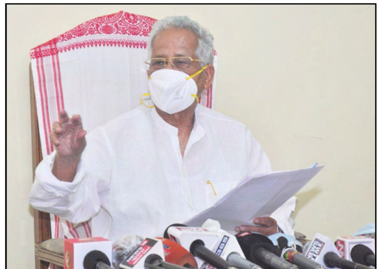
Taoba Assam Chief Minister aser Congress lennir Tarun Gogoi-i Hombarnü Guwahati nung osangbener den jembidang agiba noksa ka angur. Tanü pai COVID-19 sülen rongsenkettsüng jenjang ajungkettsü aser aayangertem tebilemtsü koktettsü atema tebilemba kar lemsatop. (Guwahati, May 11)

Quarantine facility nung anepalua amongba mapang, tangar lendongi idaktsütsüsa timtem agütsürtem aser iba dak sendakba ozüng nung aibelenertem dang sen 500 senchi achitsü, ta state sorkarisa metetdaktsüogo.