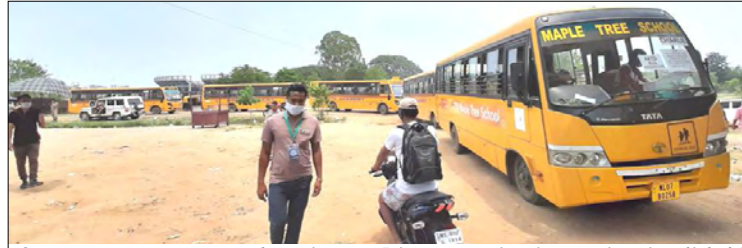
Sate nung anempongba ajanga Dimapur yimti nungi pei talidaki moteti alir nisung 500 jungnüa May 11, 2020 nü Mokokchung jila-i Ao Kaketshir Telongjem Dimapur-i achayanga yokogo. Hombarnü AKTD-i achayanga bus ter dak tema yokba mapang tangokba noksa ka yangi angur.

Dimapur, Monupii/May 11 (TYO): Alima ajanga sünga aliba COVID-19 tashidak wara nungi jenbua alitsü mechi state