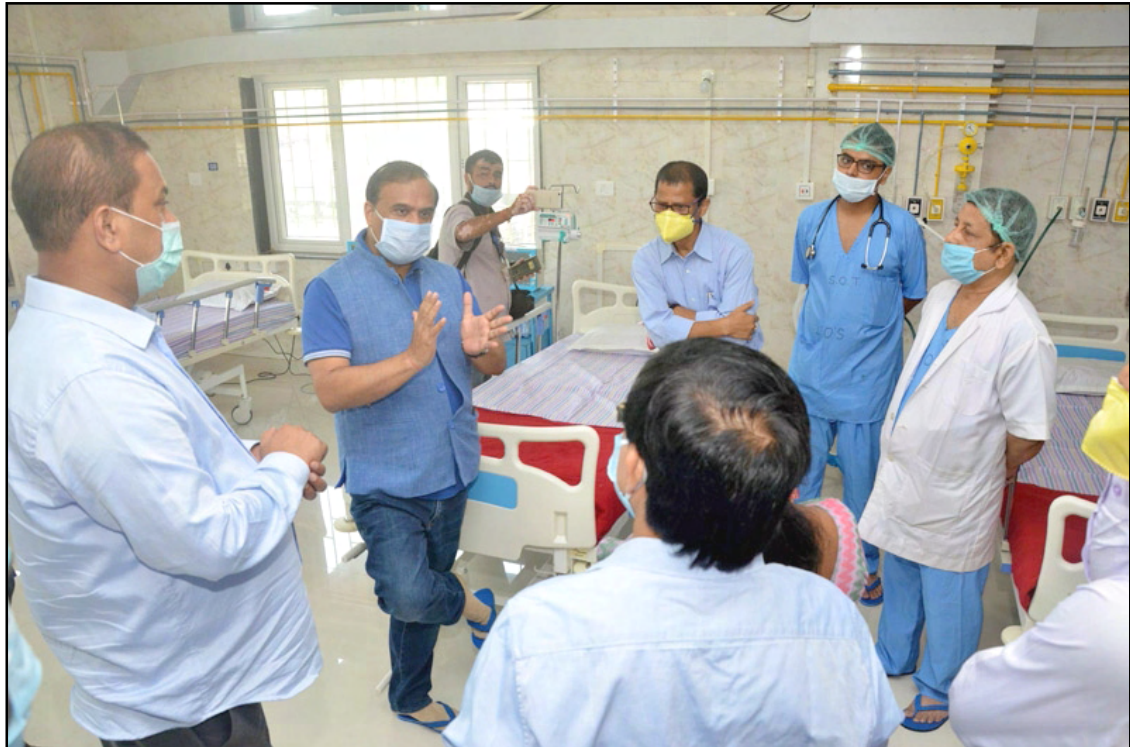
Assam Health and Family Welfare Minister Himanta Biswa Sarma-i Jorhat Medical College and Hospital (JMCH) nung yipden 50 aliba ICU ka lapoktsüba sülen hospital staff den jembiba noksa nung angur. (Jorhat, May 11)

Guwahati, May 11 (Agencies): Hombarnü Assam nung nisung ana dak COVID19 aliba putetogo aser tena züngsema nisung ajak agi 64 jungogo.