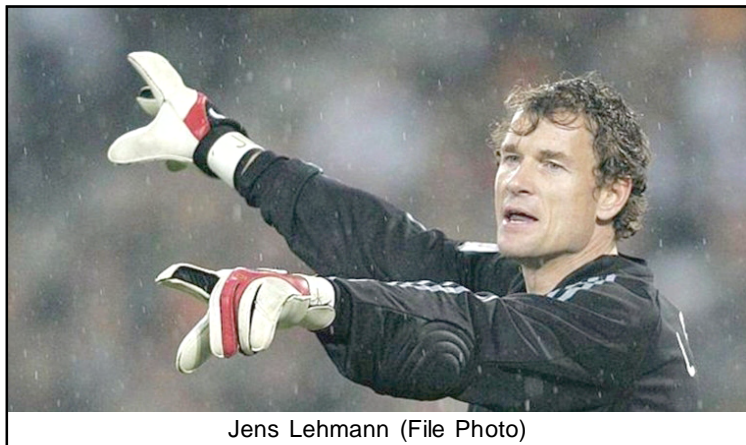
Jens Lehmann (File Photo)

Monupii/May 11, 2020 (Agencies): Hertha Berlin club indang supervisory board nung Jürgen Klinsmann melena taoba Germany goalkeeper Jens Lehmann shimogo.