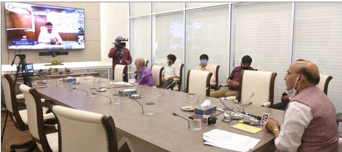
New Delhi, May 11, 2020: Hombarnü New Delhi nung National Technology Day anogomong nung Union Defence Minister, Rajnath Singh-i video conference ajanga Defence Research and Development Organisation (DRDO) nungi scientist tem den jembiba noksa nung angur. Kasa noksa nungsa Department of Defence R&D nung Secretary aser DRDO Chairman, Dr G Satheesh Reddy-a angur.