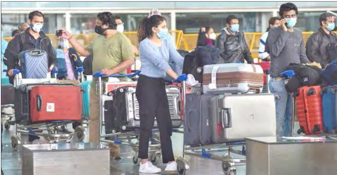
Bengaluru (Karnataka), May 11, 2020: 'VandeBharat Mission' kübok Hombarnü UK nungi India nung Bengaluru nung aliba airport tonga aruba noksa nung angur.

tashidak taliba proktsü, ta ashi. Hakim-i, "Tang ama tensa ka nung train services tenzükba ajanga tashidak prokba tali akümtsü. Centre sorkari tim masüba telemtetbatem agir. Kechi inyaksü mesüra kechi meinyaksüar parnoki mejangjar," ta ashi. Ano külen state nung coronavirus tashidak anema junga meraraba atema TMC sorkar aija state BJP Tir, Dilip Ghosh-i, ruling party nung lenirtemi item ama o mejembitsüla, kechiyong parnoki tanga state nung oa aayangertem anir maruteter, ta aitsü. "Tangalen oa aayangertem timtem atema state sorkari junga meinyaker. TMC sorkari Bengal nung linük shibangba telatetbatem junga benoka meinyaker," ta BJP lenirisa aitsü.