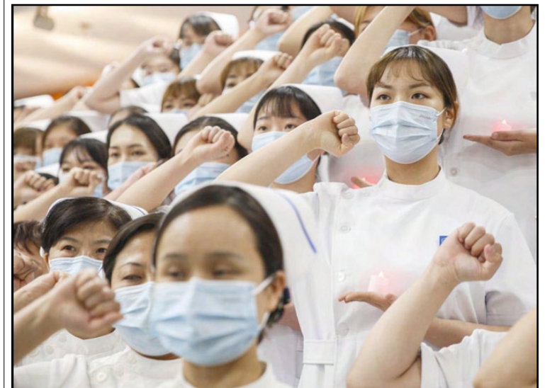
Beijing, Monupii/May 11 : China yimtiba, Beijing nung aliba Peking University People's Hospital nung tasen shima aliba nurse temi tezüngzüktep agiba noksa ka yangi angur. China Tir Xi Jinping, shiba Communist Party of China Central Committee nung tongti zülur aser Central Military Commission nung mendenpuba lir, pai May 12 nü International Nurse Day amungtsü lia nurse tem den salem lemsatapa liasü.

Iran-i iba region nung teti exercise agir, koba Strait of Hormuz anasa lir. Strait of Hormuz ya Persian Gulf nung lir aser iba tesem ya ajanga aliba nung amshiba totzü shilem 20 ajanga aor.