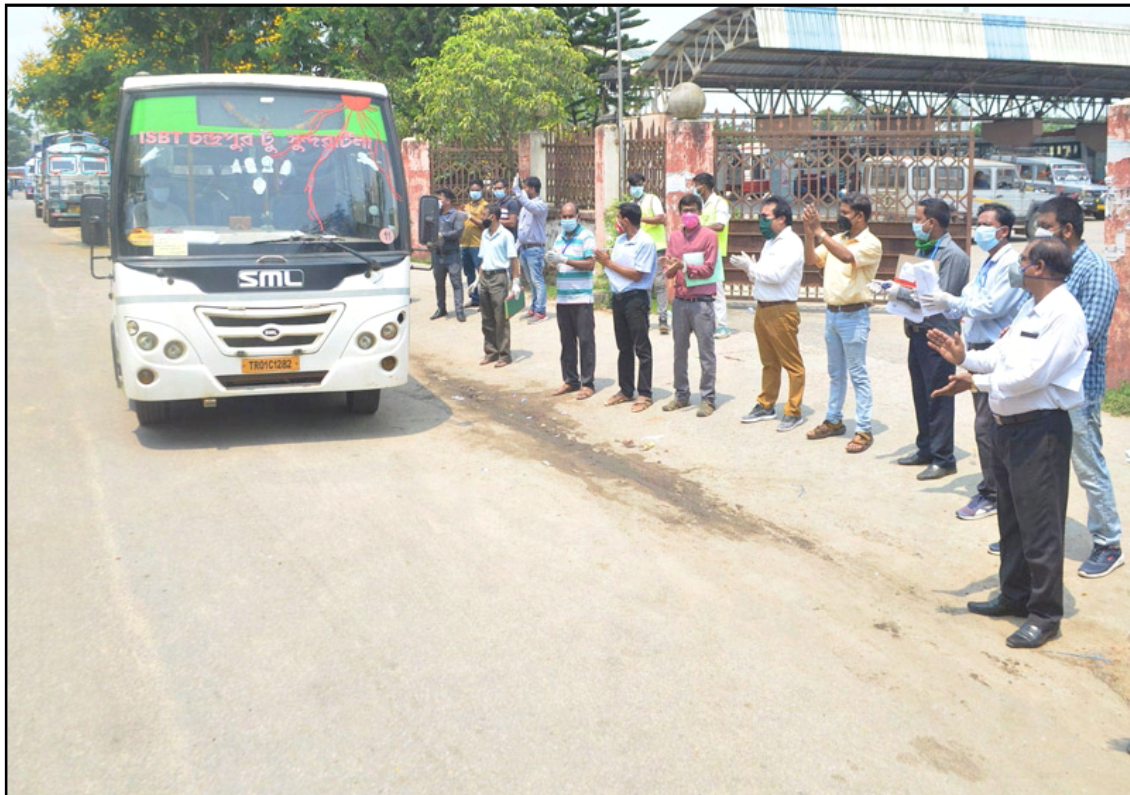
Rajasthan nungi Tripura-i arurtem ISBT (Inter State Bus Terminal) nungi pei talidaki apusoa aodang agiba noksa angur. (Agartala, May 11, 2020)