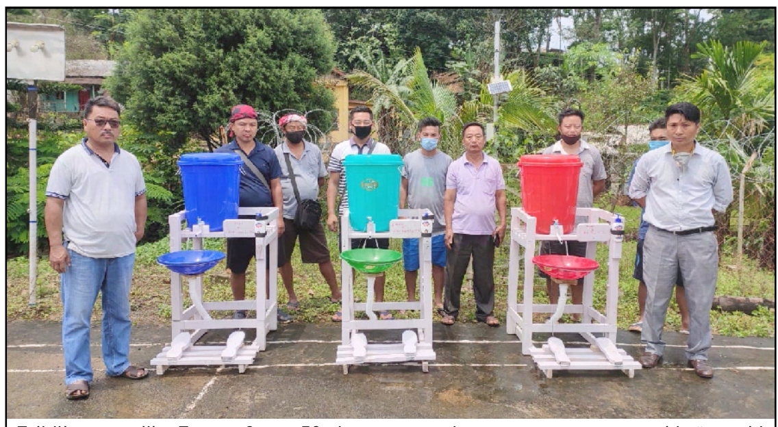
Tuli jila nung aliba Twenty Street FC ajanga quarantine centre tem nung amshitsü asoshi district administration, Tuli nem tetsüng agi amshitetba teka shitokba oset tejang asem tenla agütsü, koba club züngsemtemi yanglua liasü. Item ya quarantine centre nung kangasa nüngdaka aliba oset liasü. Iba oset ya amshitsü temela aser lokti tentet balala, office, school, NGO aser kijaia club dang nungi iba oset ya alitsü akok. Iba oset dak sendakba nung tali tejangjaba metettsü asoshi club indang tir/secretary den mobile number 9612219854/7005900338 ajanga tongteprateptsü akok.

Iba senden nung BTF züngsemtem, 7th NAP commandant. SDPO Bhandari, MO (CHC) Bhandari, OC Bhandari, Company Commander 12th IR Merapani, kaketshir lenirtem, Lotha Hoho aser Eloe Hoho tir, Head Goanbura aser arogo lenirtem dena liasü.