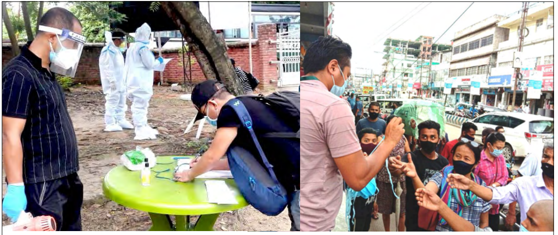
(Abelen) Hobar nü Dimapur nung Aotsür Aortemi anepaluba Quarantine center nung anentsü purtem agizüka tenung züludaktsüba noksa nung angur. (Tachiji) Dimapur Naga Students' union-teni tebang nembangba mask lemtesüba noksa nung angur (June 01, 2020)

Dimapur, June 01 (TYO) : Covid 19 tashidak wara ajanga India tesem aika nung asen nübortem melitetsüsa akümer asünungji, anogo shia tesem balala nungi Naga nungertem Nagaland bushia arudagi aser tanü Hobar nü kija nunga India tesem balala nungi nisung 649 aruogo aser asünga nisung 291 arutsü.