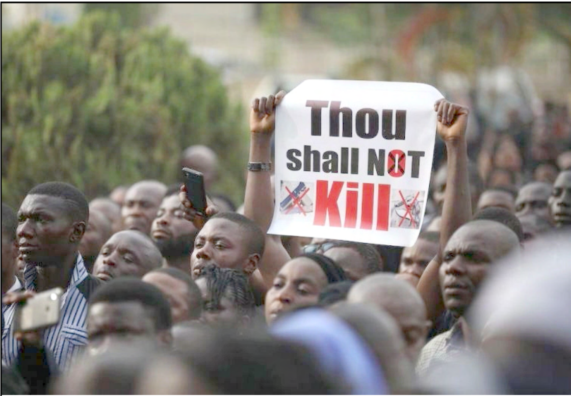
March 1, 2020 nü Abuja nung Khristantemi Nigeria nung yimjung alitsü atema yimdong süa sarasadema jajaba noksa nung angur. Nigeria nung Catholic Khristantemi Boko Haram teloki Khristantem tepsetba aser sen akhangtsü atema nisung apuba tatalokbatem aitsü.