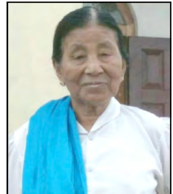
Sennüklula (Asangma) Tasüba anogo: 3/7/2019

Nai toktüsü aoba temeim chirnur, semchirtem, adinu aser kinungertem.