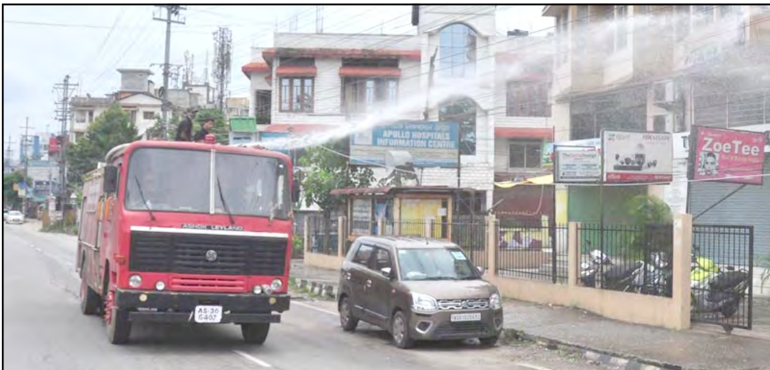
Guwahati, July 2, 2020 : Brehostibarnü Guwahati nung Fireman temi Beltola lenmang merketetba noksa nung angur. Assam nung coronavirus tashidak kanga kara prokshia odar aser defence o police densema nüburtem aikadak tashidak potetdar. Tang tashi nung police 95 dak tashidak potetogo aser parnok 1112 quarantine centre balala nung lir.

Maneni State sorkari Maniram Dewan Trade Centre, Guwahati nung yibden 450 aketba COVID19 care hospital ka amenoktsü asoshi sentong lir.