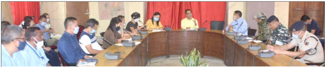
DC Dimapur Anoop Kinchi IAS ajanga July 02, 2020 nü DC Dimapur indang conference hall nung Dimapur DDMA züngsemtem den jembiba mapang tangokba noksa ka yangi angur.

Dimapur, Chiteni/July 02 (TYO): Deputy Commissioner, Dimapur, Anoop Kinchi IAS ajanga July 02, 2020 nü DDMA züngsemtem den senden ka mena taruba hopta ana tsüngda tzünglu kanga sashia arua tzümettsüng adoka mopung tesashi aontsü akok ta asadangteta nung ajemdaker renemshia alitsü asoshi onük balala lemsatepa liasü.