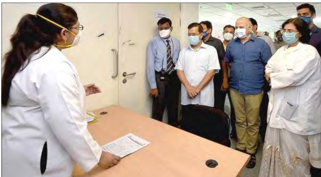
New Delhi, Chiteni/July 02, 2020: Brihostibarnü New Delhi nung Delhi Chief Minister, Arvind Kejriwal aser Deputy Chief Minister, Manish Sisodia nati ILBS Hospital nung Plasma Bank semdangba noksa nung angur.

Menden tazüng 24 aliba atema kobi melii by elections agitsü.