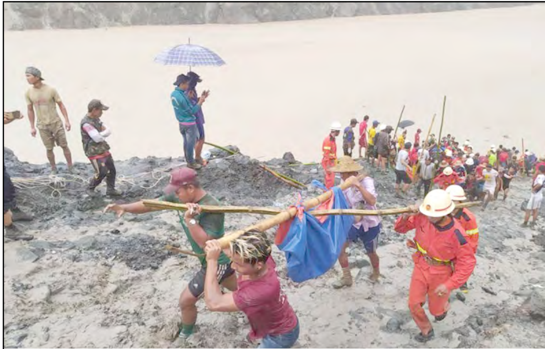
Hpakant, Chiteni/July 2, 2020 : July 2, 2020 nü cellphone ajanga tangokba noksa nung rescuer temi Hpakant, Kachin State, Myanmar nung jade mining tesem nung anentsüh aludak nisung asüba temang bener aoba angur. Brehostibarnü iba lendong nung asür temang 113 ngutetogo, ta Information Ministry ajanga sangdong ka nung ashi.

Temzüng-ozüng shidam mamshi ali rongsen bushiba Hpakant tesem nungya anentsüh aser danga lendongtem kanga bulua ajurur,