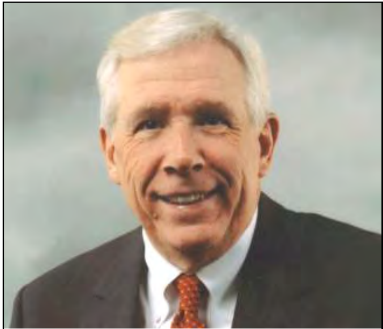
Frank Wolf (File photo)

July 02, 2020: Taoba mapang Congress züngsem, Frank Wolf-i, Nigeria nung Khristantem anema inyakra aser US sorkari iba atemaji kecha meinyakta abajanga akhidang Rwanda aser Darfur nung nisung jenti tepsetba ama Nigeria nunga ataloktsü, ta metetdaksü.