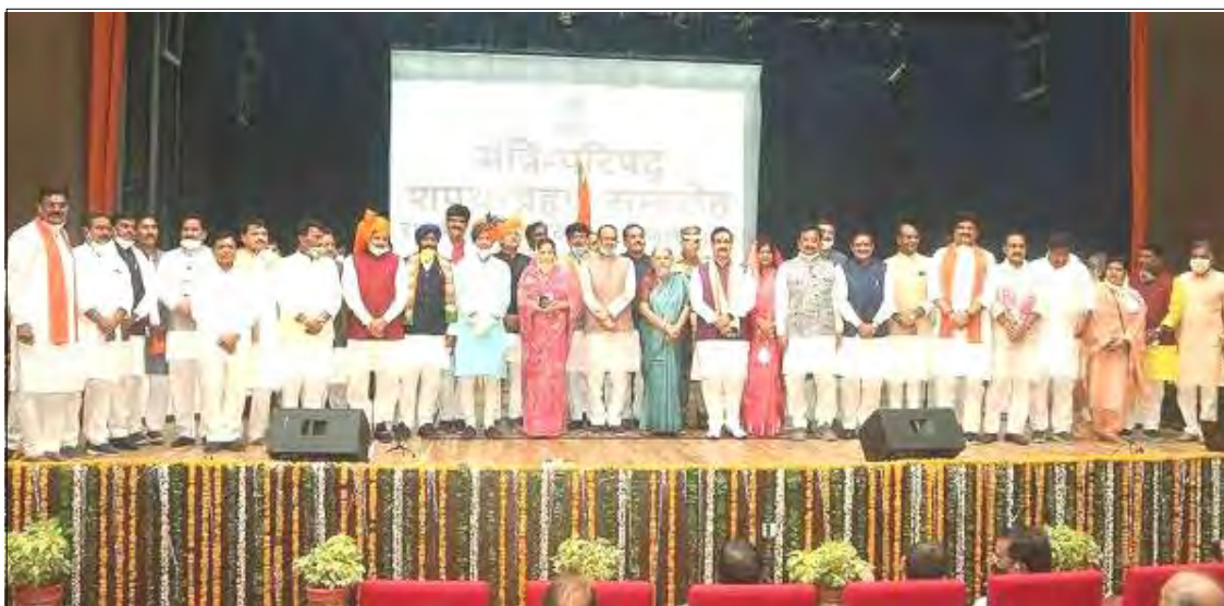
July 02, 2020 nü Raj Bhavan, Bhopal nung Madhya Pradesh Angh, Anandiben Patel aser Chief Minister Shivraj Chouhan nati tanü minister tenangzükba agirtem den külemi tangokba noksa nung angur.