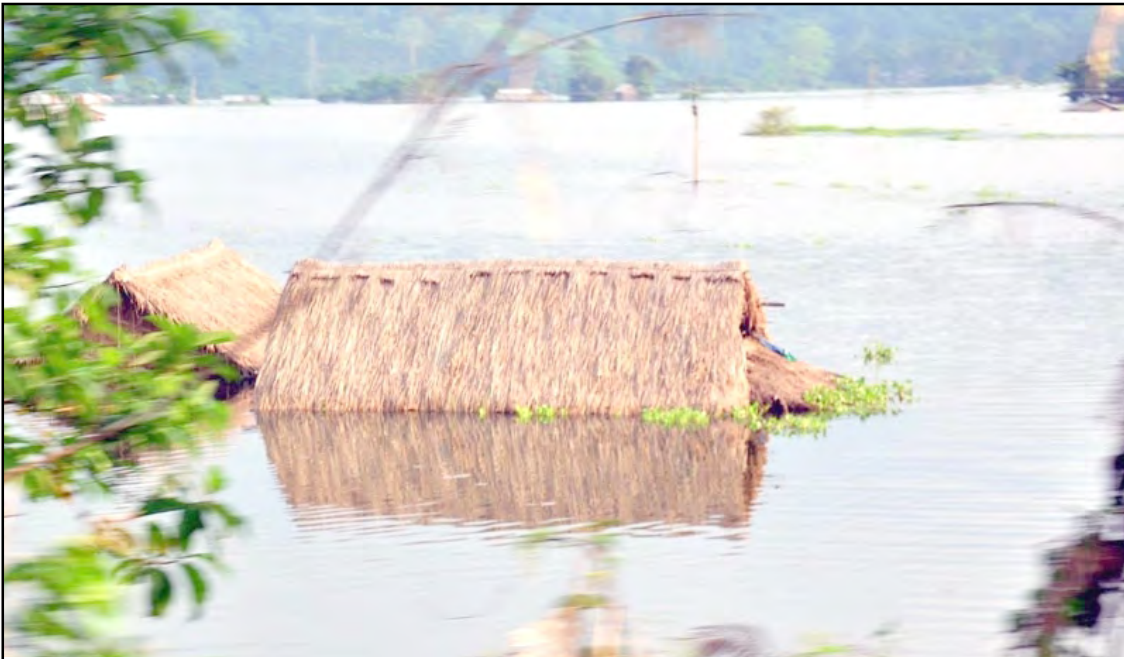
Kaziranga, July 2, 2020 : Kaziranga nung k ka tüzümsüng agi metsümbangba noksa nung angur. Assam kübok district 20 nung alir nisung lakh 12 dak tema tüzümsüng agi kangshidar. Kaziranga National Park (KNP) authority sangdong ka ajanga ashiba agi, tang tashi nung shiruru 25 tüzümsüng nung süogo.