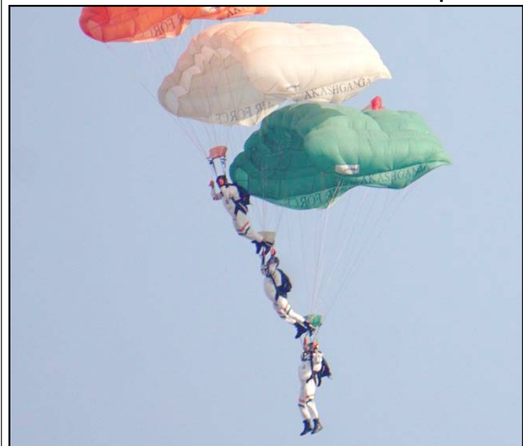
New Delhi, October 08, 2020: Brihostibarnü New Delhi nungi kilometer 80 pilar aliba Hindon Air Base nung 88buba Indian Air Force (IAF) anogomong sentong nung IAF nungi Akash Ganga Sky diving team-i shilem agiba noksa nung angur.