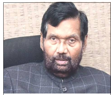
Ram Vilas Paswan (File photo)

New Delhi, Mongputeni/October 8 (Agencies): Union Consumer Affairs Minister Ram Vilas Paswan shiba tawa temulungjang surgery agia liasü pa tanü New Delhi nung mozüki ka nung süogo. Arishi küm 74 Tain minister dak ajungbena timtem ka adokba ajanga pa iba mozüki nung temang anepalua