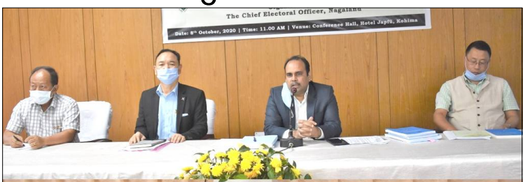
Hotel Japfu, Kohima indang Conference Hall nung October 8, 2020 nü print & electronics media den State level awareness workshop agidang Chief Electoral Officer, Nagaland, Abhijit Sinha IAS ajanga jembiba noksa nung angur.

Dimapur, Mongputeni/October 8 (TYO): Nagaland Legislative Assembly By-Election dak sendakba nung EEM, EVM, VVPAT, MCMC aser Media dak sendakba ken o tem dak ajemdaker State Level Awareness workshop ka print/Electronic den October 8 nü Hotel Japfu Conference Hall, Kohima nung agiogo.