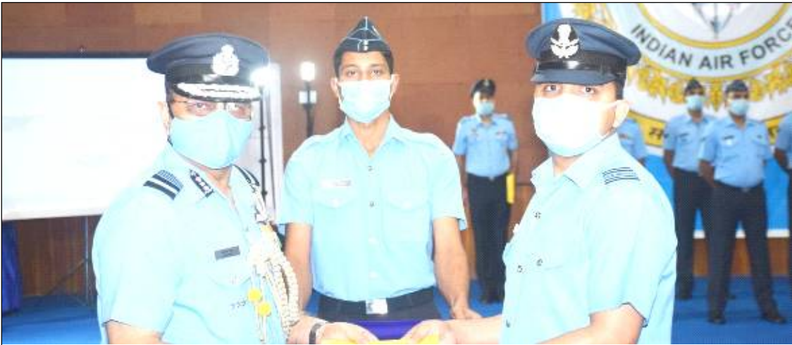
Shillong, October 8: Headquarters Eastern Air Command, Shillong nung October 8 nü 88buba Air Force Day mungogo. Iba anogo Air Marshal Amit Dev AVSM VSM, Air Officer Commanding-in-Chief, Eastern Air Command-i achayanga sepaitem tenangzüktepa agi aser wadang balala nung takok tajung nguteter aliba air warriors aser civilian tem nem tetushi agüja liasü.