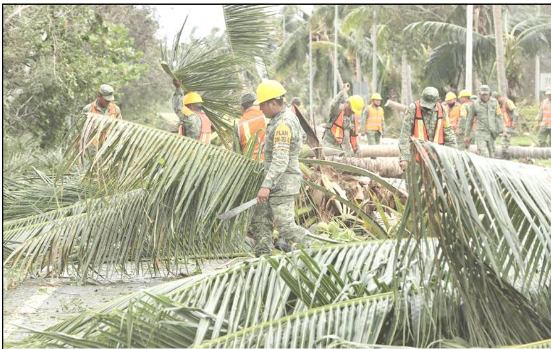
Quintana Roo, Mongputeni/Oct. 8, 2020 : Bodhbarnü Cancun, Quintana Roo state, Mexico nung Hurricane Delta agi kongshiba sülen sepaitemi süngdong laoa alibatem mürektetba noksa nung angur. Hurricane Delta-i Bodhbarnü Mexico indang Quintana Roo state tinga ariba mapang cyclone ya category 4 nungi category 2 akum, saka tzünglu kanga sashia aruba aser mopung aonba ajanga ki-o-jen kar raksatsü, ta National Meteorological Service (SMN) ajanga ashi.