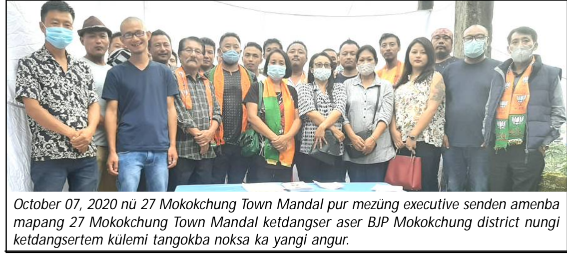
October 07, 2020 nü 27 Mokokchung Town Mandal pur mezüng executive senden amenba mapang 27 Mokokchung Town Mandal ketdangser aser BJP Mokokchung district nungi ketdangsertem külemi tangokba noksa ka yangi angur.

CEO-isa, election sadem sadema tesunep nung tebandang aser tetsükdaktsü makai agitsü asoshi yimtsüng, kiyong, loktitentet mesera media house kari danga temalen shisema aliba onük nung aibelenba ngutetra, aibelenertem anema temzüng ozüng kübok jenang tapet agitsü, ta metetdaktsüogo.