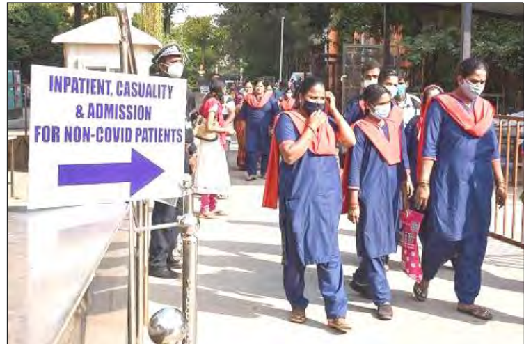
Hyderabad, November 21, 2020: Hyderabad nung aliba Gandhi Hospital nung inyakertem mapai aruba noksa nung angur. Coronavirus wara kanga prokba mapang nung iba hospital nung coronavirus tashidak agi shirangertem ang yaria liasü saka Honibar nungi tanga medical services ajak tenzüko.