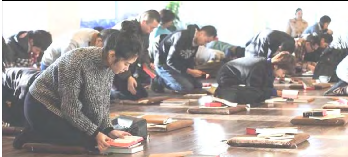
Shanxi province, China nung aliba Early Rain Covenant Arogo nung Khristantem tekülem sentong nung adenba noksa nung angur.

November 21, 2020: China nung Taiyuan, Shanxi province nung aliba Early Rain Covenant Arogo ka ketdangsertemi mita aoba sülen pastor den Arogo züngsem trok apu.