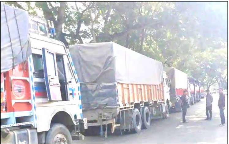
Karbi Students Association (KSA)-i Nagaland anema rongsenkettsüng mokdangba mapang khu abenba truck garitem lenmang nung anendena aliba angur. (File noksa)

Diphu, November 21 (Agencies): Assam chief minister, Sarbananda Sonowal den senden ka amentsü nangzükba sülen Karbi Students Association (KSA)-i Nagaland anema rongsenkettsüng mokdangba anenogo.