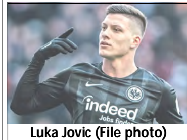
Luka Jovic (File photo)

Yimpoksüi/November 21, 2020 (Agencies): Real Madrid striker Luka Jovic dak coronavirus tashidak tejangja putetba ajanga, Honibarnü Spanish League - La Liga nung Villarreal den asayaba mapang Real Madrid nungi Luka densema tongtibang asayar anati iba asaya nung shilem magitet. Luka Jovic dak iba tashidak putetba osang ya Hokolbarnü Club-i sangdonga liasü.