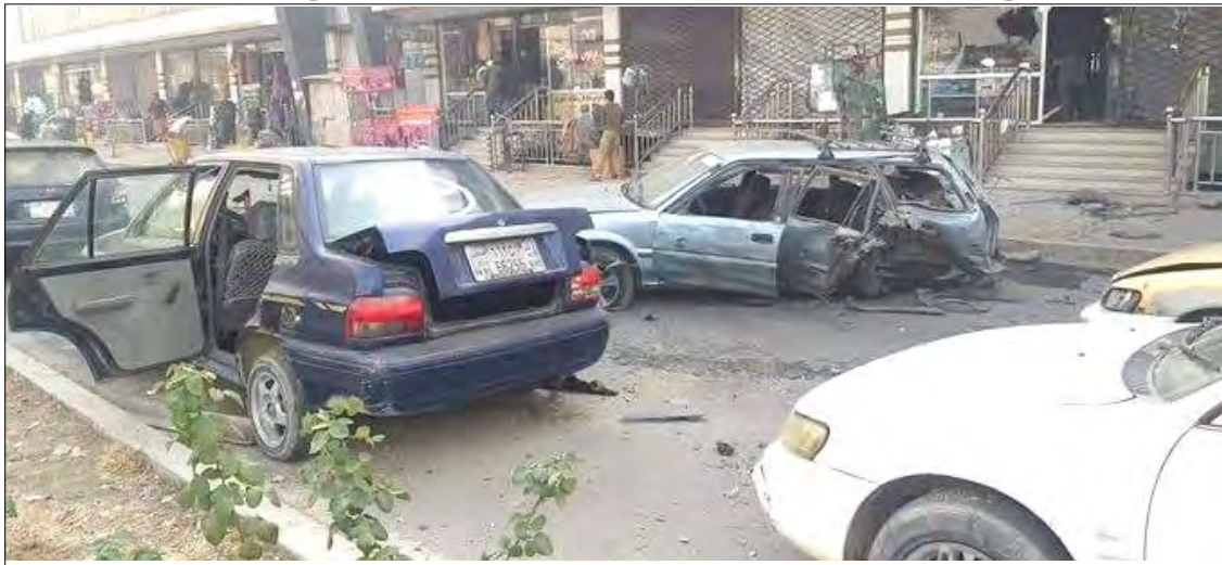
Honibarnü rocket agi Kabul amakba tesem nung garitem poksar aliba noksa nung angur.

K a b u l , Y i m p o k s ü i / November 21 (Agencies): Honibarnü rocket agi Kabul amakba lendong nung nisung ti süogo, ta ktdangsertemi metetdaksü. Tawa Afghan yimtiba nung azütokshiba lendong aika ataloka arudar.