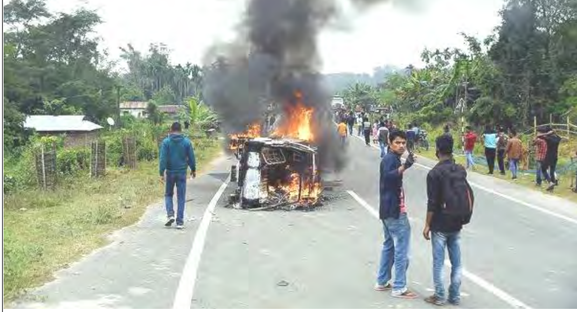
Tripura kübok Kanchanpur sub-division nung Joint Movement Committee (JMC)-i lungkak aيتدang gari ka rongdoktsüba angur.

Agartala, November 21 (Agencies): Honibarnep Tripura State Rifles (TSR) sepaitemi Kanchanpur sub-division nung Bru-Reang refugee lidaktsütsüba anema lungkak aيتدertem dak injang khaloktsüdang nisung ka khaset aser pungu yirutsü.