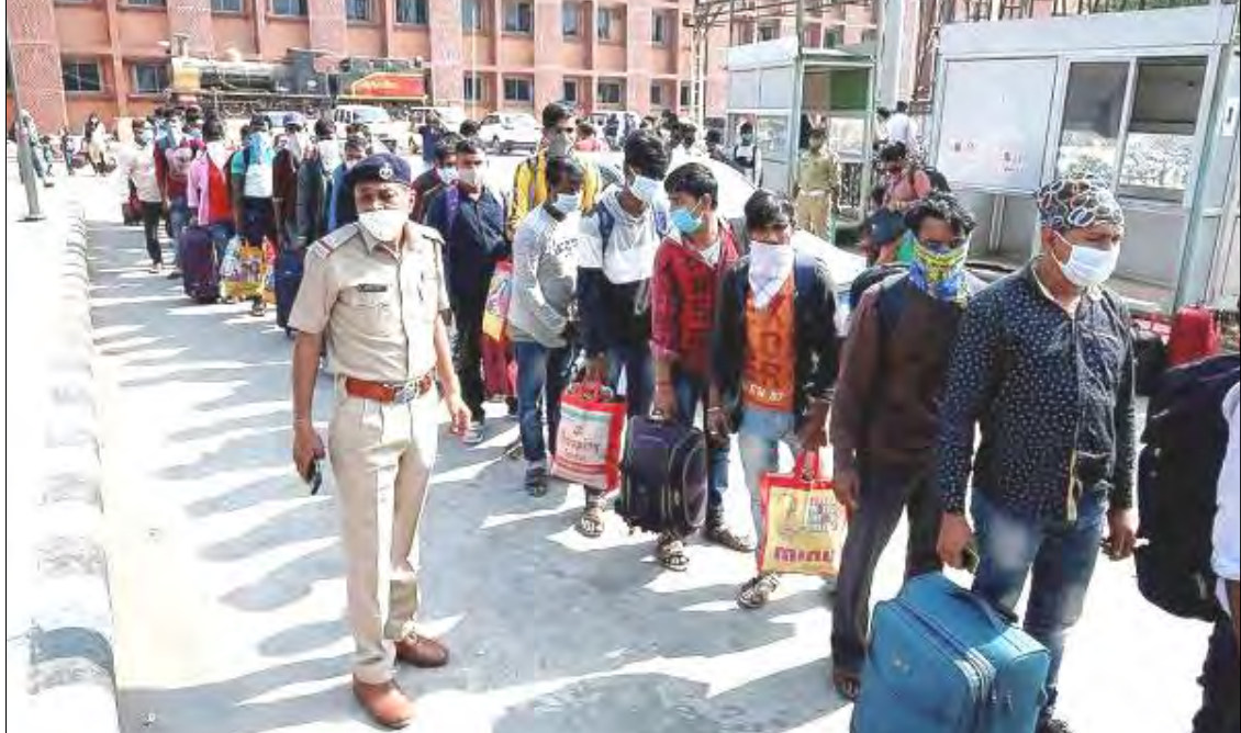
Ahmedabad, November 21, 2020: Ahmedabad nung coronavirus kanga prokba agi ghonda 60 tashi curfew özüng liasü; Honibarnü curfew tembangba sülen nüburtem train station-i aotsü atema tarensena nokdaker bus-i atuba noksa nung angur.

Linük nung iba tashidak agi shiranger ajak agi 84,78,124 anepogo aser iba tashidak agi shiranger anepba shilem 93.67 jungogo saka iba tashidak agi shiranger asüba shilembo 1.47 dang kümogo, ta parnokisa metetdaksü. August 7, 2020 nü India nung Covid case lakh 20 ajung, August 23 nü lakh 30 aser September 5 nü case lakh 40 junga liasü. ICMR-i ashiba agi, November 20, 2020 tashi nung samples ajak agi crore 13.06 tendangogo aser iba nungji Hokolbarnü samples 10,66,022 tendangba densema lir. Anü külen Honibarnü Union Health Minister, Harsh Vardhan-i, July ita tashi nung India-i coronavirus vaccine dose million 400-500 alizüktsü atema vaccine company balala den sorkari jembidar, ta metetdaksü. "Medical kulitem nung ajemdaker vaccine agütsütsü. Asen linük nung nütsüing crore 135 dak tema lir, anungji khenyongi ajak peritsüsa vaccine malizüktsütsü," ta pai metetdaksü.