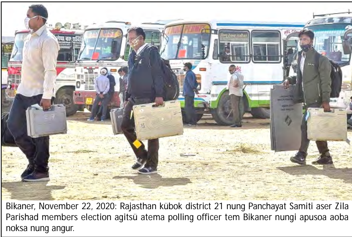
Bikaner, November 22, 2020: Rajasthan kubok district 21 nung Panchayat Samiti aser Zila Parishad members election agitsü atema polling officer tem Bikaner nungi apusoa aoba noksa nung angur.