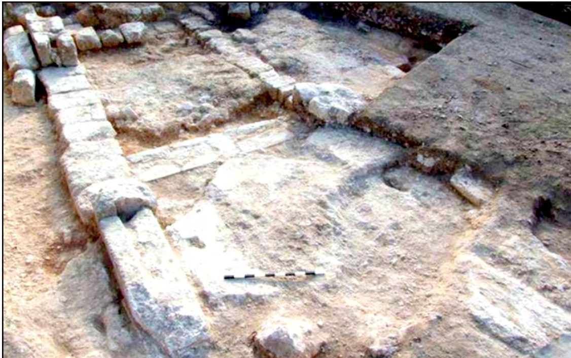
Küm 1,400 tejaklen Israel nung kanga azükarua aliba Khristan jila, Pi Metzuba noksa nung angur. Anüdoklen Galilee nung Pi Metzuba jila ya Aso 7buba (7th Century) tetenzüklen Persia-Byzantine tsüngda tongbang raraba mapang samaja liasü.

November 22, 2020: Küm 1,400 tejaklen Israel nung kanga azükarua aliba Khristan jila ka liasü, saka iba jilaji Persia nunger sepaitemi samatsü; iba jilaji northern Israel nung ngutetogo, ta archaeologist temi metetdaksü.