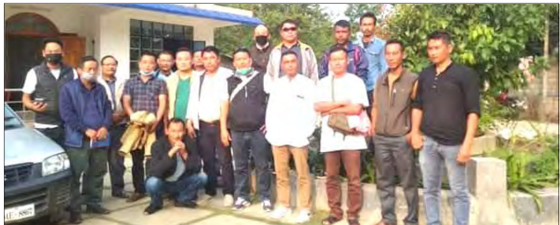
Watiyim nung Japukong Youth Organization (JYO) aser Tzurangkong Range Naga Youth Front (TRNYF) ketdangpurtem külemi agiba noksa angur.

Dimapur, November 22 (TYO): Japukong Youth Organization (JYO)-i Deobarnü Tzurangkong kübok Watiyim yimtsüing semdang aser Tzurangkong Range Naga Youth Front (TRNYF) den rongsenkettsüing mokdangba onük lemsatetep.