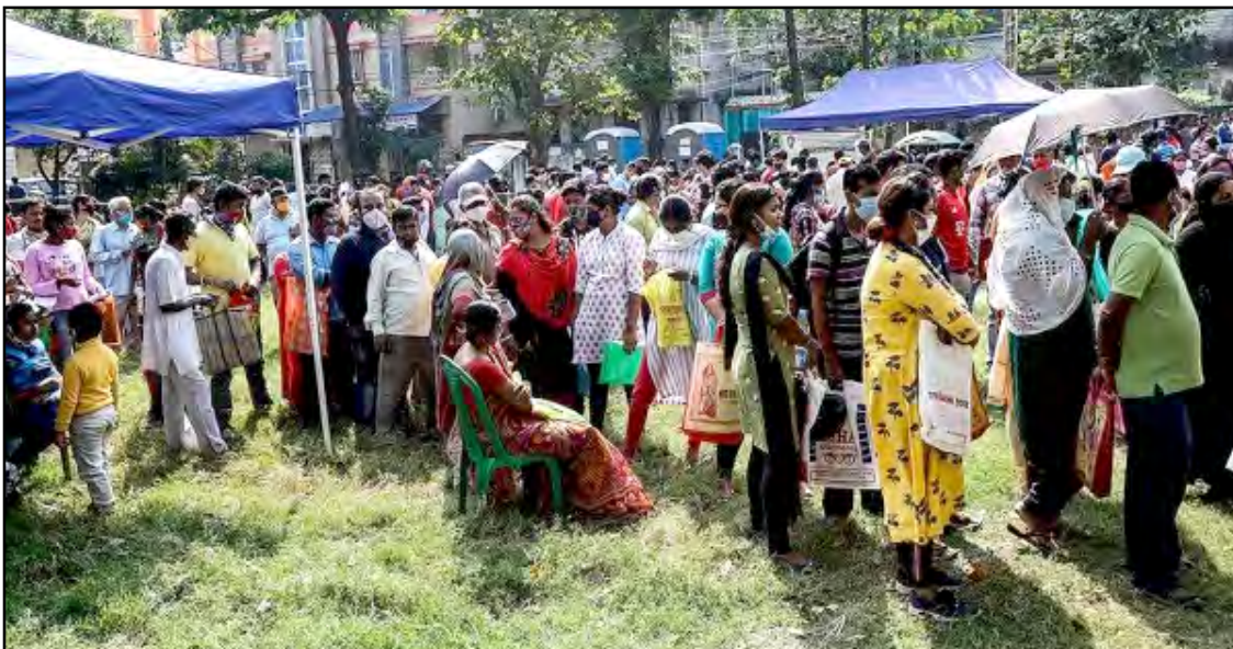
Kolkata, November 22, 2020: Amongnü Kolkata nung Scheduled Caste, Scheduled Tribe aser other backward classes (OBCs) tem backward classes welfare department nung pei temeden meshitsü atema certification camp ka kima tarensena nokdaka aliba noksa nung angur.

November 21, 2020 tashi nung samples crore 13.17 dak tema tendangogo, aser iba nungji Honibarnü samples 10,75,326 tendangba densema lir, ta ICMR-i metetdaksü.