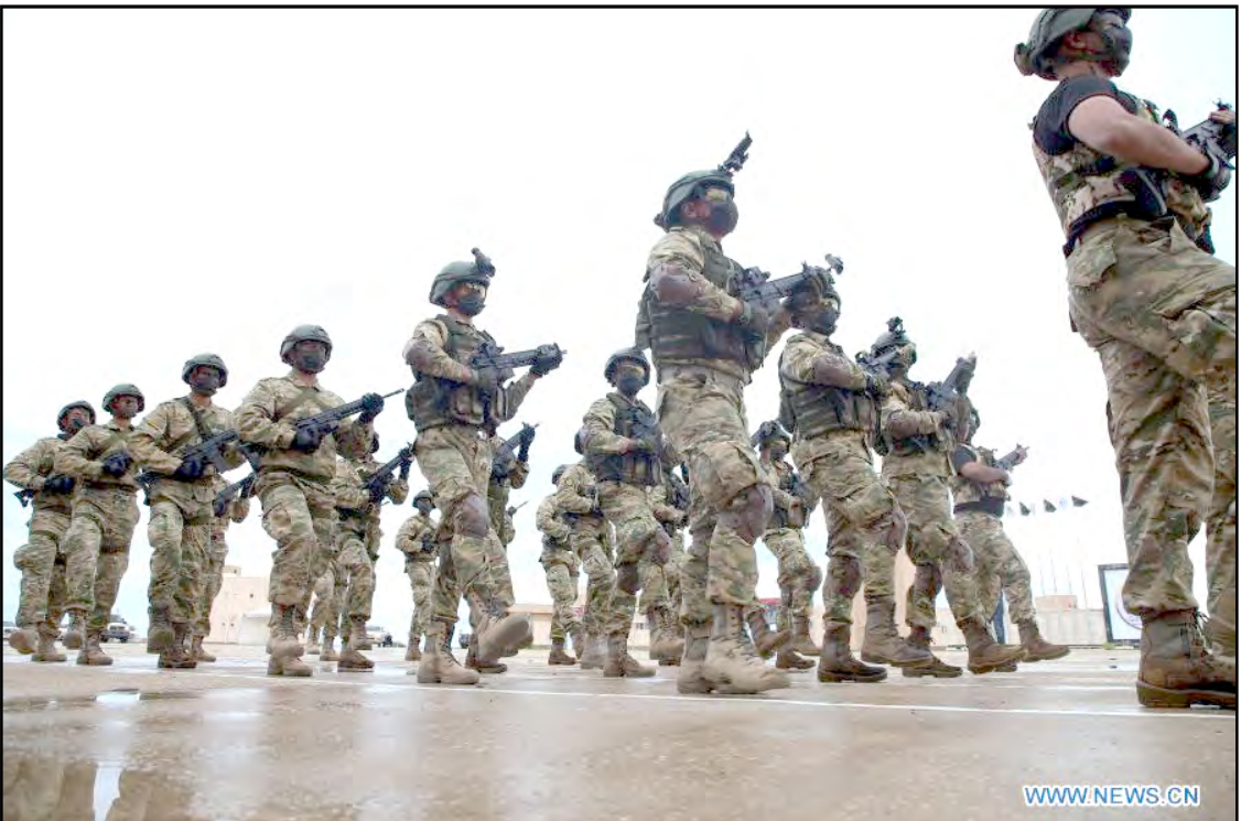
Tripoli, Libya anasa Omar Al-Mokhtar training center nung November 21, 2020 nü graduation day alidang UN-i busemba Libya mitkartem tsüngkang medema jajaba mapang tangokba noksa nung angur. Turkey ajanga training agütsüba special military forces telok mezüngbuba graduate süogo, ta UN-i busemba Libya sorkari Honibarnü sangdonga liasü.

Honibarnü KDCA ketdangsertemi ashiba agi, tang tashidak menatepyonga aoba menokdangtetra mezüngbuba aser tanabuba wave dang nungi tasembuba yagi ajatetsü akok. December 3 nü competitive annual college entrance exam nung kaketshirtem shilem agidaktsütsü nukjidong yur iba tenokdangba agütsüogo.