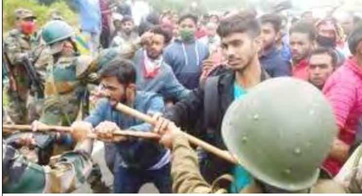
Joint Movement Committee (JMC) züngsemtemi Police den raraba noksa nung angur.

Agartala, November 22 (Agencies): North Tripura kübok Panisagar nung Honibarnü ano nisung ka süogo. Sepaitem aser Bru nung anema noktaktertem tsüingda raradang pa asü.