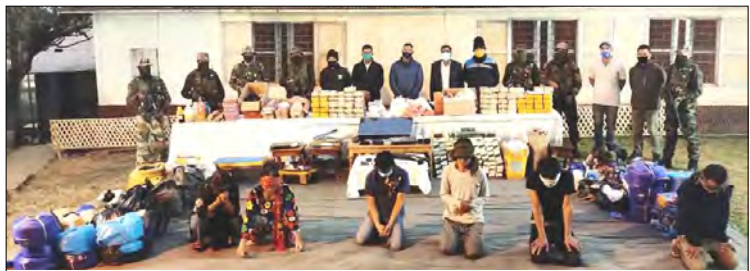
Manipur nung Assam Rifles, Manipur Police aser Narcotics Control Bureau-i Moreh jila nung mozü shibelenertem apuba sülen agiba noksa angur. (Imphal, December 8)

Imphal, December 8 (Agencies): Manipur nung ozüngi memelaba mozü Rs 165 crores alang shi puogo aser iba ya Northeast nung mozü timtiba apuba asütsü.