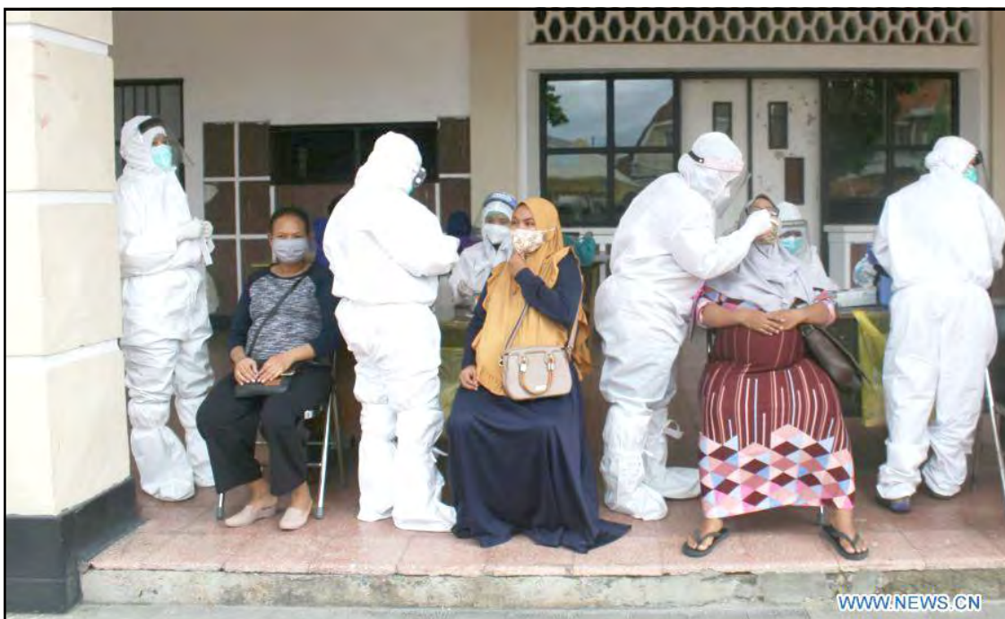
Jakarta, Luchii/Dec. 08 : Surabata, Indonesia nung December 8, 2020 nü medical ketdangsürtemi mashisa tetsürtem dak nungi COVID-19 tendangtsü atema sample agizükba noksa nung angur. Indonesia nung anogo ka tsungta COVID-19 positive 5,292 agi tali kuma tang 586,842 lir aser kasa mapang asüba 133 liasü, aser tang iba tashidak ajanga asüba ajak senteper nisung 18,000 jungogo, ta Health Ministry ajanga Mongulbarnü ashi. Iba virus ya Indonesia indang province 34 prong sünga prokshia lir.