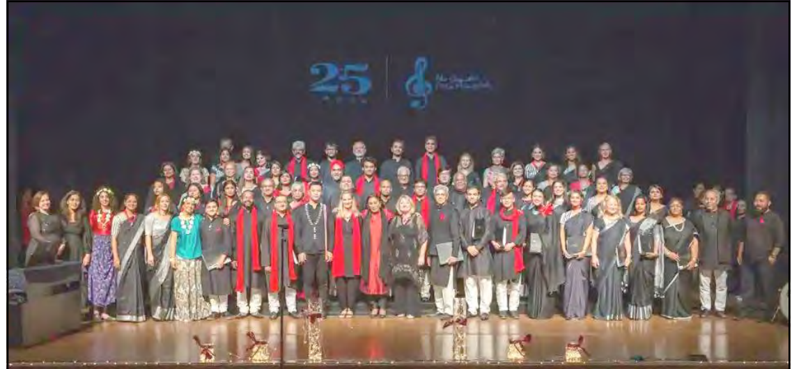
Delhi-NCR nung choir tejentiba, 'The Capital City Minstrels' telokpur noksa nung angur.