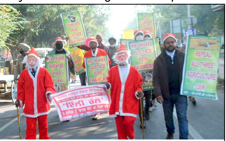
Punjab kübok Jalandhar yimti nung Khristantemi aluyimertem pusema longkak aitba noksa nung angur.

Jalandhar (Punjab), December 08, 2020 (Agencies): December 07, 2020 nü Catholic Yuva Dhara (CYD) nungi züngsemtemi Santa Claus sübotsü semer Jalandhar yimti (Punjab) nung alirtem dang aluyimertem pusema longkak aita Delhi-i aotsü ajungmesoa liasü.