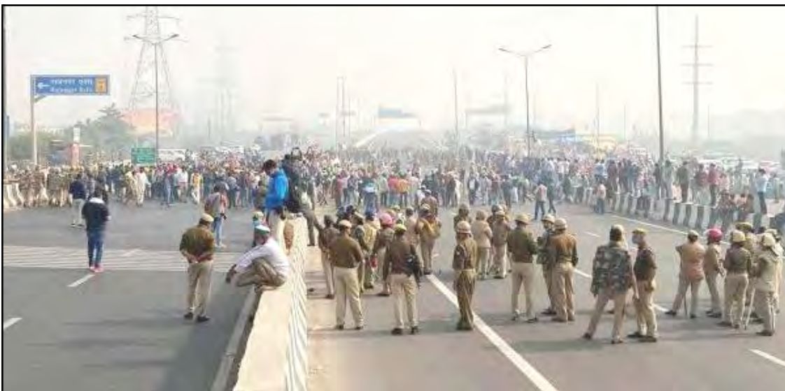
New Delhi nung longkak aiterem highway nung longkak aitba mapang police temi nüka ataba noksa nung angur. Agir law agintsü khanga aluyimertemi linük ajunga mokdanga ayutsü ayongzuka liasü. Ozüng tasentem ajanga parnok chiyongtsü jenjang ajemtsütsü ta bilema aluyimer meyirejang aikati longkak aitar.

"Linük ajunga nung aluyimertem pusema nokdakba anogo Centre sorkar home ministry-i Delhi Police dang Kejriwal kimai meyoktsü tuyu. Yashi Kejriwal den pa kübok Cabinet minister tem ajak Singhu arrtsüi oa aluyimertem den ajuruteptba sülen BJP-i aniba Centre sorkar tsübuadok. Kasaji aluyimertem puoka ayutsü atema khen asoshi stadiums teku tepuokdak kümdaktsütsü atema Kejriwal-i Delhi police nem temelaba magütsüba ajanga parnok mepelai liasü," ta Bhardwaj-i ashi.