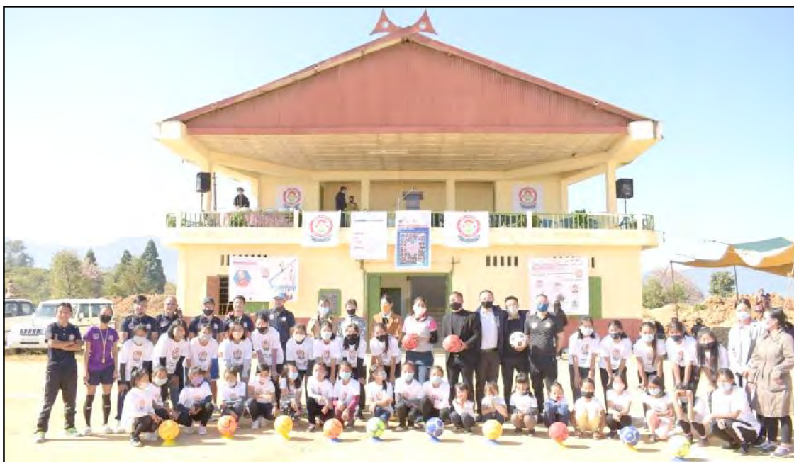
Phek, Luchii/December 08, 2020: Football coaching camp nung shilem agirtem aser DA & DLCW MSK Phek züngsemtem külemi tangokba noksa ka yangi angur.