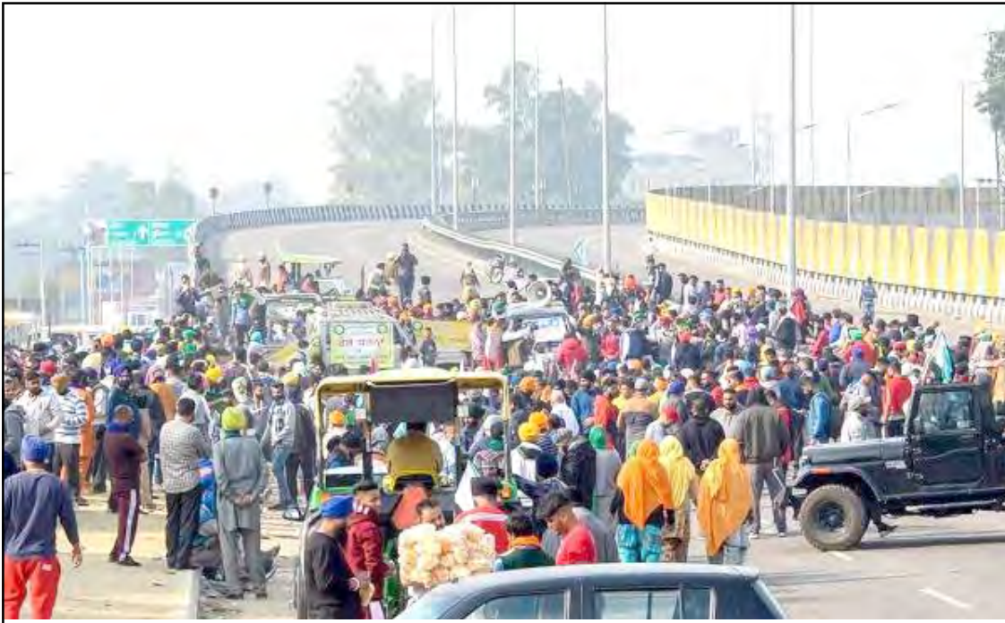
Mongolbarnü Jalandhar nung Center indang agri law agintsü khanga aluyimertemi Jalandhar-Delhi highway mokdanga ayuba noksa nung angur.