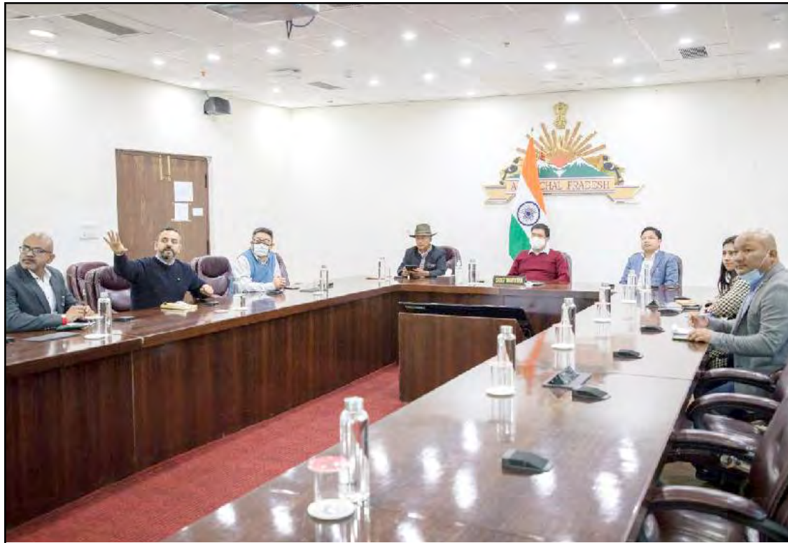
National Geographic teloki Itanagar nung Arunachal Pradesh chief minister Pema Khandu den ajurutepa sensaksem dang agiba noksa angur.

Guwahati, January 29 (Agencies): Arunachal Pradesh chief minister Pema Khandu-i Itanagar nung National Geographic channel telok ka den ajurutepa sensaksemogo.