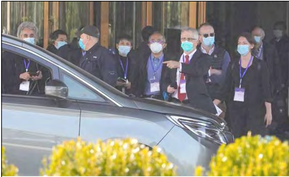
World Health Organization team of researchers nungi züngsemtem central China indang Hubei province kükob Wuhan-i aotsü renemba mapang tangokba noksa ka yangi angur. World Health Organization team of researchers ya Wuhan yimti nung COVID-19 tashidak poktetba tera bushitsü atema China-i arur tang mezüngbuba parnok anenzükdak hotel nungi Brehostibarnü temai adok.