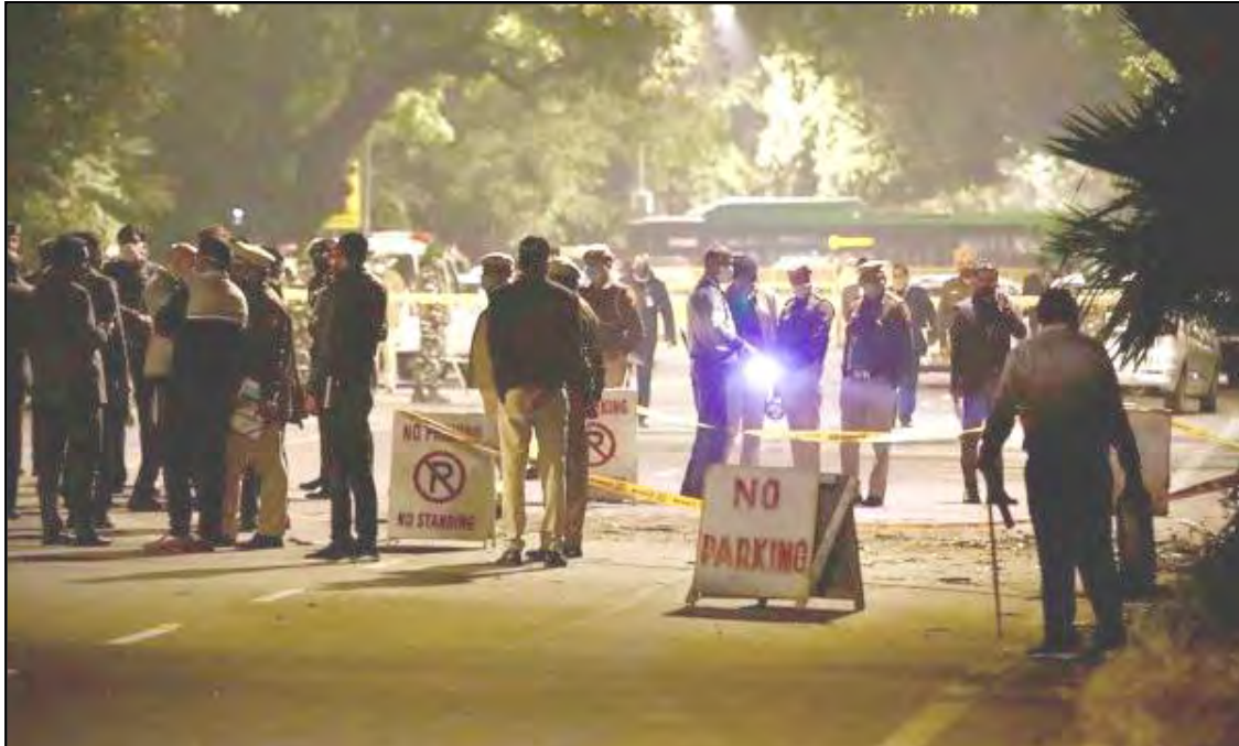
January 29, 2021 nü New Delhi nung aliba Israel Embassy anasa bomb ka apokba sülen iba tesem anasa police nokdaka aliba noksa nung angur. Israel Embassy anasa bomb tilaka apokba ajanga gari kar raksa, ajisüaka shinga meyiru, ta police-i metetdaksü.

New Delhi, January 29 (Agencies): Israel-India tesendaktep yanglur küm 29 ajungba anogomong nung (January 29) New Delhi nung aliba Israel Embassy anasa bomb ka apokba ajanga gari asem raksa, saka nisung yiruba mesüra asüamaba osang mali, ta Delhi police-i metetdaksü. Hokolbar nikongdang 5:05 ako meta bomb ji apokba sülen National Investigation Agency (NIA) aser Delhi Police Special Cell iba tesemji tonga oa bushisüngdang tenzükogo. Iba tesemji longbangogo aser police aika lezmüksüba dang masü saka Central