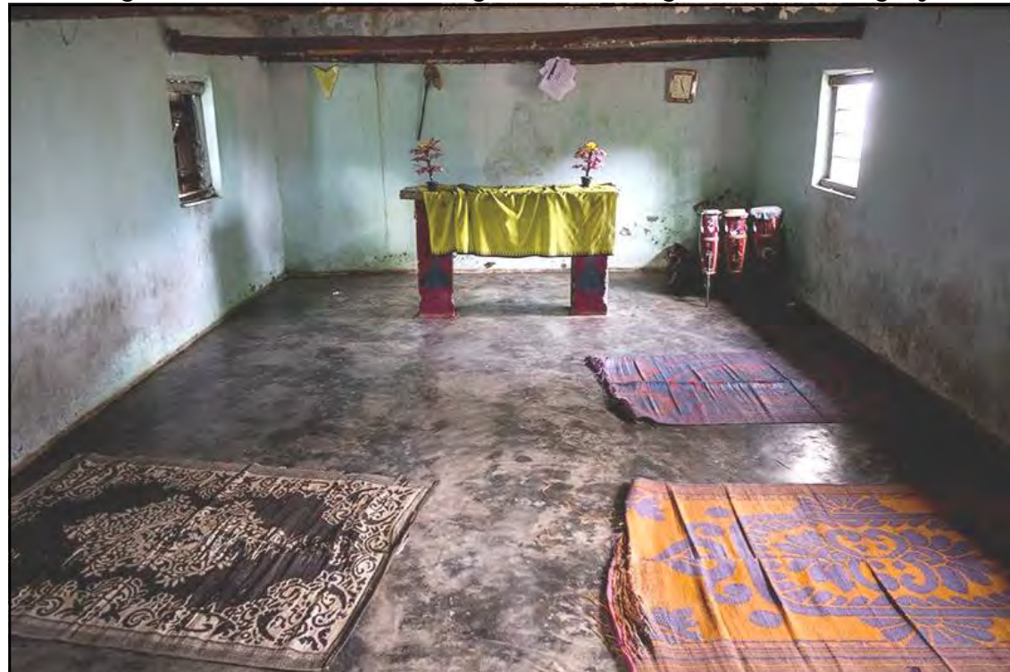
Andhra Pradesh nung Cudapa district kübok Chittimitti Chintala yimdak aliba Arogo Tenla ki noksa nung angur.

January 29, 2021: January 17, 2021 nü south India nung aliba Tenla ki ka nung nisung kari Hindu nunger saffron wako ka songa yutsü; coronavirus wara aliba agi iba Tenla kiji tesüiba ita 10 tashi shibanga liasü, ta ICC osang ajanga metetdaksü.