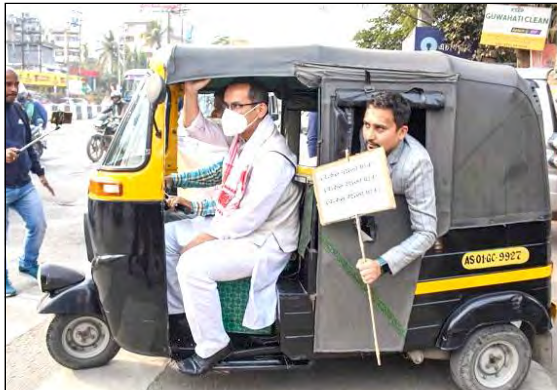
Guwahati nung Congress MP Gaurav Gogoi-i All India Professionals' Congress (AIPC) züngsemtem den külemi auto-rickshaw ka nung mener Greater Guwahati Auto Rickshaw Association senden nung adentsü atema aodang agiba noksa angur. (Guwahati, January 29)

Iba SOP nung, class metenzükdang, school classrooms, hostel rooms aser temeket ajunga merüktettsü shia lir.