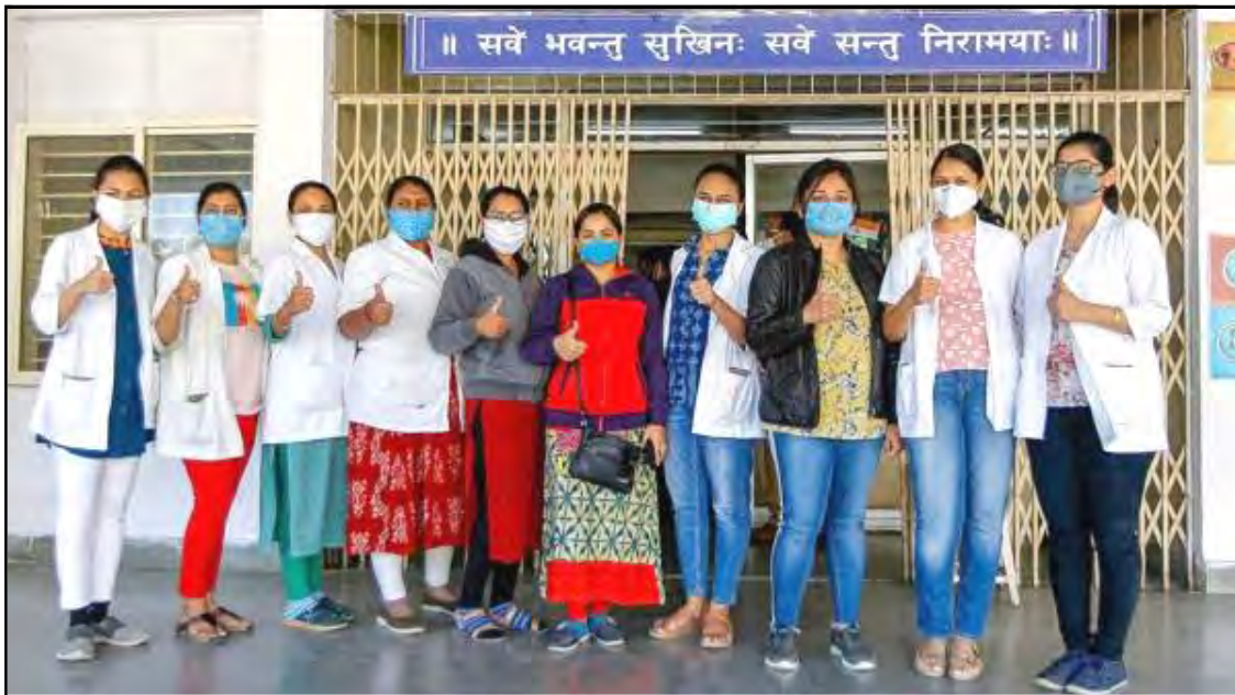
Ahmedabad, January 29, 2021: Hokolbarnü Ahmadabad nung aliba Civil hospital nung coronavirus vaccine agiba sülen health worker tem tangokba noksa nung angur.