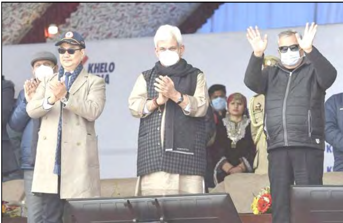
Gulmarg, Tsüklai/February 26, 2021: Hokolbarnü, Gulmarg indang ski resort kübok 2buba Khelo India National Winter Games asayamung lapokba sentong nung shilem agitsüpurtem march-past agiba mapang, Lt Governor Manoj Sinha (tiyong) aser Union Sports Minister Kiren Rejju (abilen) nati asayartem teka madena pela agizükba yangi angur.