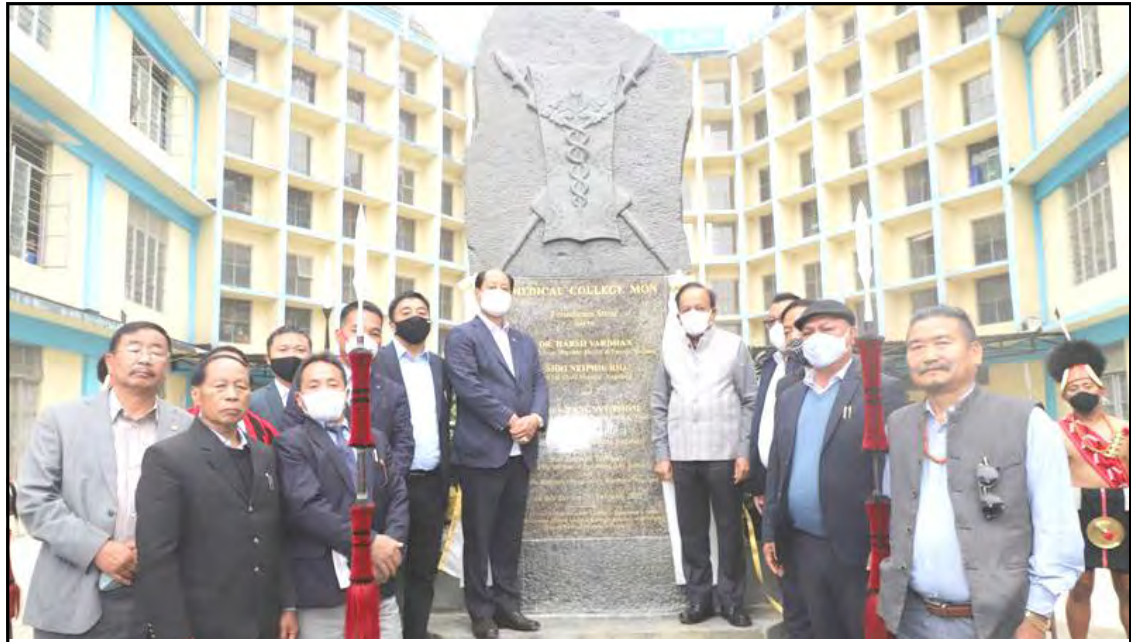
February 26, 2021 nü Mon Medical College indang lung azüngtsüdang Union Health & Family Welfare Minister Dr. Harsh Vardhan, Nagaland Chief Minister Neiphu Rio aser tangartem agiba noksa angur. (Mon, February 26)