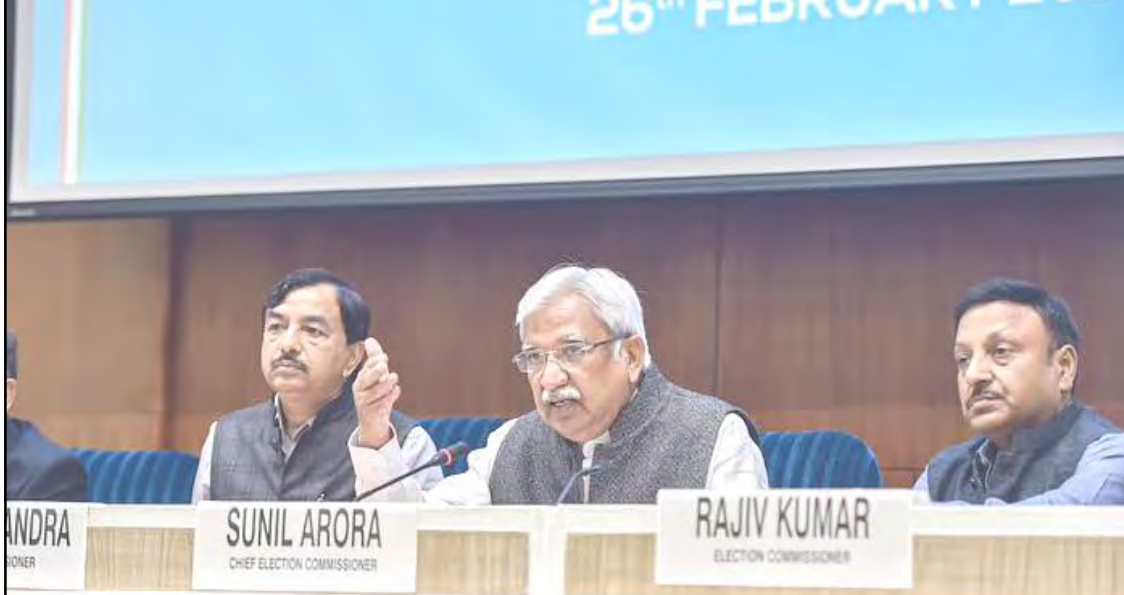
New Delhi, February 26, 2021: Hokolbarnü New Delhi nung osangbenertem senden nung Chief Election Commissioner, Sunil Arora (tiyong) aser Election Commissioners- Sushil Chandra aser Rajiv Kumar nungeri jembiba noksa nung angur. EC-i Assam, West Bengal, Tamil Nadu, Kerala aser UT- Puducherry nung assembly elections agitsü atema anogotem sangdongogo.