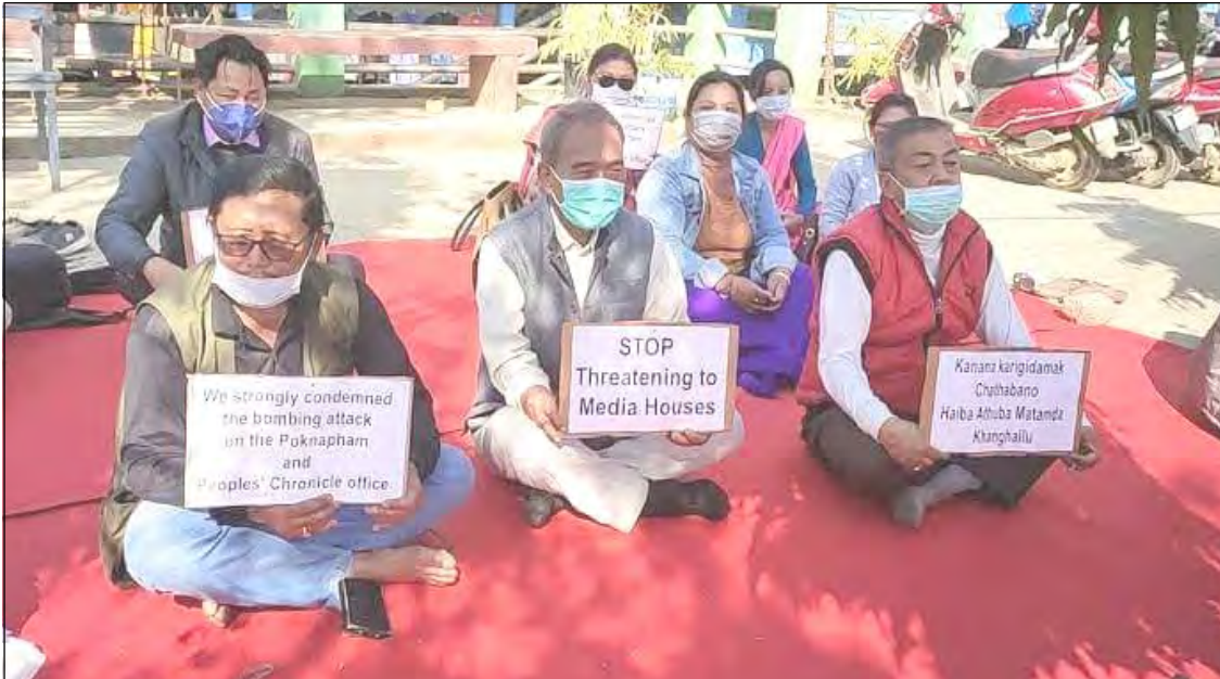
Hombarnü Prime Minister Narendra Modi-i Assam kübok Dhemaji district nung Silapathar nungi online ajanga Rs 3,000 crore alangba totzü mapatongtem lapoktsüdang agiba noksa angur. Iba sentong nungsa PM Modi-i Dhemaji Engineering College lapoktsü aser Sualkuchi Engineering College yanglutsü atema lung azüngtsü. (Silapathar, February 22)

Imphal, February 26 (Agencies): Manipur nung journalist temi lungkak aitba ajanga newspaper aser news channels ajak shibangogo.