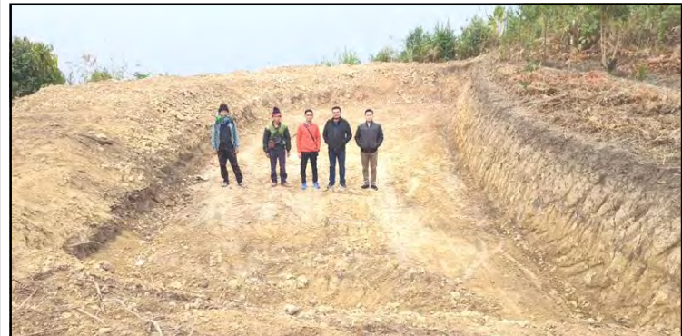
Tuensang, Tsüklai/February 26, 2021: Hokolbarnü, NABARD den department balala nungi teshimtet nübu temi Phir Ahi aser Chungtor village, Longkhim Block nung teinyakdak aliba NAGCC project semdangba mapang tangokba noksa ka yangi angur.

Tuensang, Tsüklai/February 26, 2021 (TYO): Tang teinyakdak aliba NAGCC project atema, Hokolbarnü (26.02.2021) NABARD den Fisheries & Aquatic Resources Department aser Sericulture Department, Tuensang longjemer Phir Ahi aser Chungtor village, Longkhim Block semdangogo.