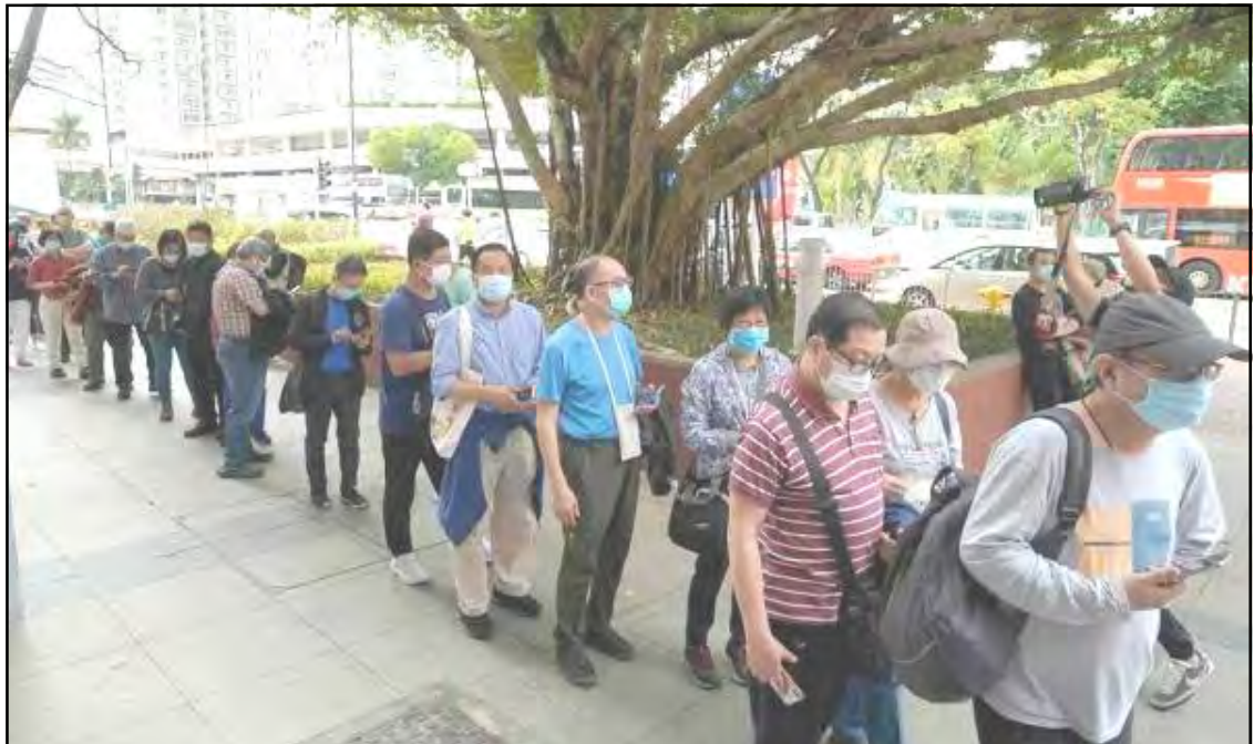
Hong Kong nung aliba community vaccine center ka nung nüburtem China indang Sinovac COVID-19 coronavirus mozü agitsü atatepa aliba noksa nung angur. Hong Kong nung Hokulbarnü nungi tenzüka COVID-19 mozü agütsür, kong nisung million 7.5 shi nem iba mozü angati agütsütsü sentong tenzüka lir.

Küm tenzüker iba region nung lendong tesashi aiben ataloka arur, kong lenmang tezülen bomb pokdaktsüba mapang Ivory Coast nungi United Nations peacekeepers pezü takum samaja liasü.