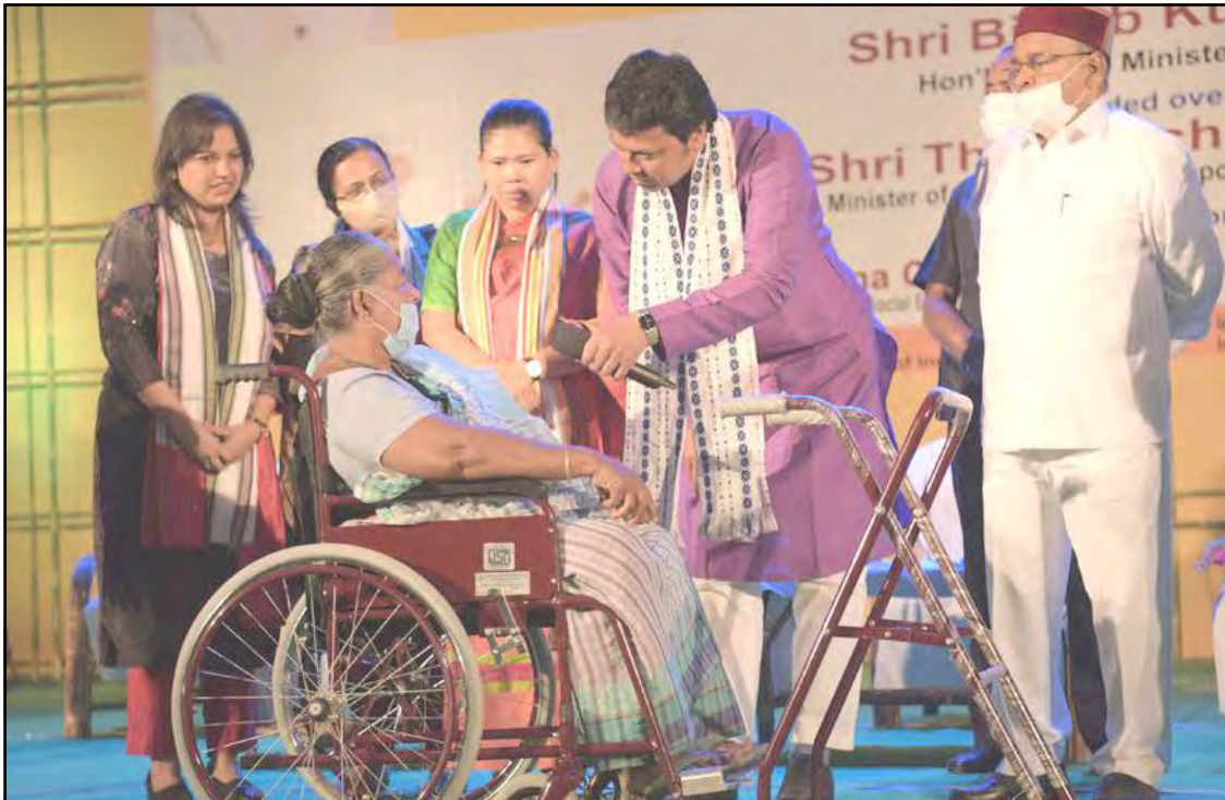
Hokolbarnü Agartala nung Tripura Chief Minister Biplab Kumar Deb aser Minister of social justice and Empowerment, Government of India, Thaawarchand Gehlot-i teintet rogotem nem living devices balala agütsüdang agiba noksa angur. (Agartala, February 26)