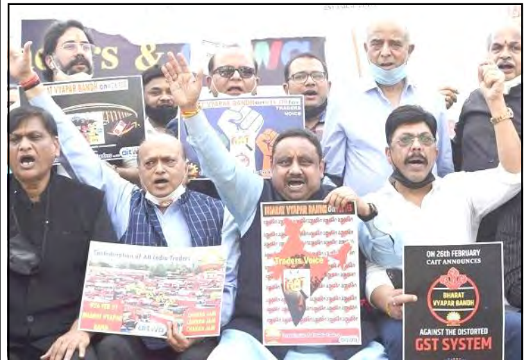
February 26, 2021 nü New Delhi nung Confederation of All India Traders (CAIT) züngsemtemi GST nung ozüng kar anema longkak aيتدang tangokba noksa nung angur.

Health Ministry-i ashiba agi, Lakshadweep nunga tang mezünga iba tashidak agi nisung ka süogo.