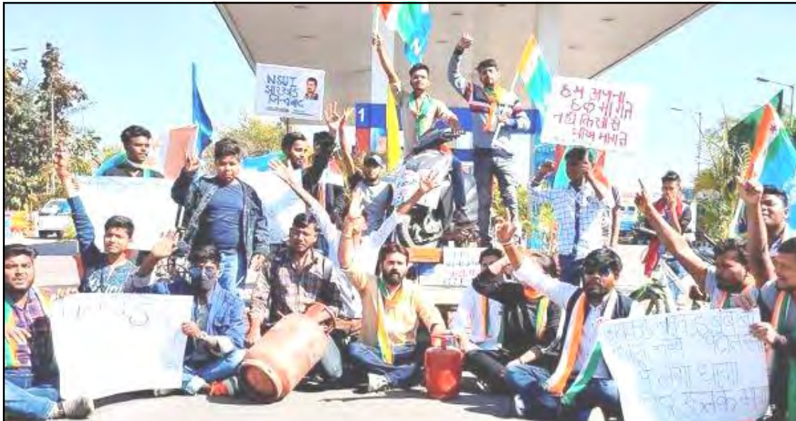
Ranchi, February 26, 2021: Petrol, diesel aser LPG gas jenjang atuba anema Hokolbarnü Ranchi nung National Students Union of India (NSUI) züngsemtemi LPG cylinder tazüng amer longkak aيتدang tangokba noksa nung angur.