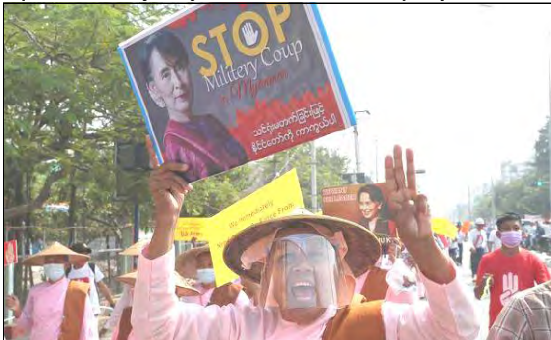
Mandalay, Myanmar nung Hokulbarnü Buddhist nun temi Myanmar lenir Aung San Suu Kyi indang noksa amer yimtung süa jajaba noksa nung angur. Mitkar temi tashiyim amshia sorkar atsüngdokba anema Mandalay nung Hokulbarnü nüburtemi longkak aita yimtung nung jaja.

Yangon, Tsüklai/February 26 (Agencies): Myanmar indang yimti tulutiba ana nung longkak aiter senshidaktsütsü atema police temi Hokulbarnü stun grenade, rubber bullets aser prangbong anünglen khaloktsü, ta tenük kuli alirtemi ashi, kong mitkartemi tanaben yimsü asütsü merangba anema nüburtem longkak aiter.