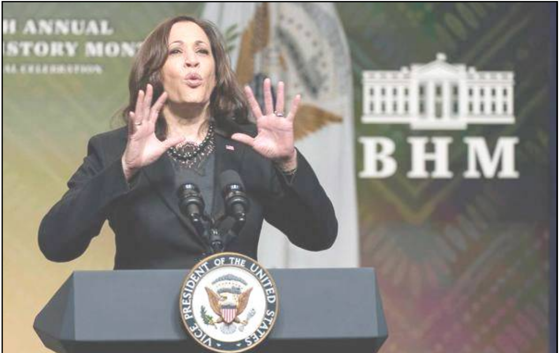
Washington nung White House kilung nung aliba Eisenhower Executive Office Building nung 40th Annual Black History Month virtual anogomung amungba mapang US Vice President Kamala Harris-i o jembidang tangokba noksa ka yangi angur.