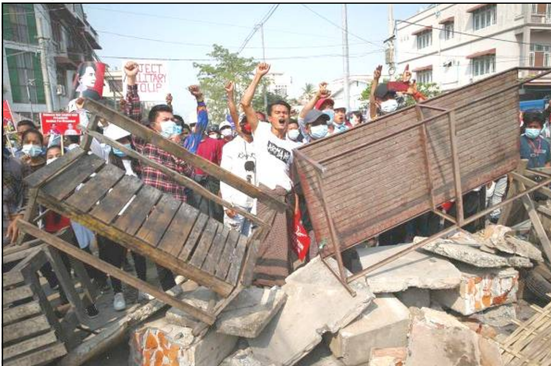
Mitkar tashi amshia sorkar atsüngdokba anema longkak aitdang Mandalay, Myanmar nung police aruba mapang longkak aiter temi yimyim ayimba mapang tangokba noksa nung angur. February 1 nü mitka temi sorkar atsüngdokba anema Myanmar nung longkak aiter azüoktsü asoshi police temi tashi tali amshia arur.

Yirur alir nisung kar külemi longkak aiter temi atsür ao, aser iba mapang lenmang nung