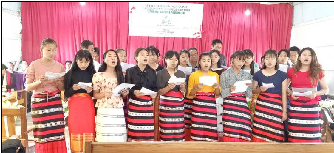
Liangmai Baptist Association nung züngsem akumba sentong ka February 28, 2021 nü agiba mapang Nkwarew Baptist Church choir temi temeja ken ka atenba noksa nung angur.

Dimapur, Tsüklai/February 28 (TYO): Liangmai Baptist Church Nkwarew pur affiliation sentong ka Liangmai Baptist Association (LBA) ajanga February 28, 2021 nü Peren District kübok Nkwarew Baptist Church nung ayongzüka liasü.