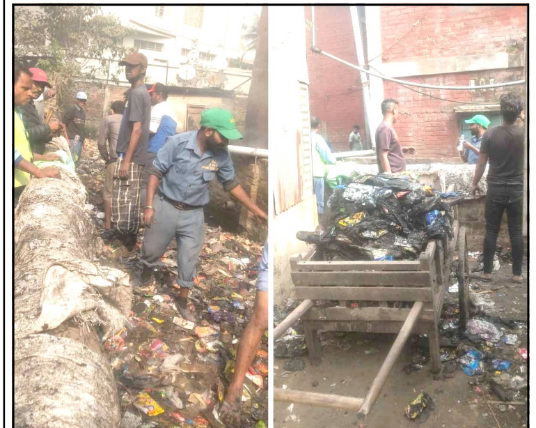
Dimapur Municipal Council ajanga Breeze Restaurant, Nyamo Lotha Road tesülen aliba colony nung nokdanga aliba kilentzü lenmang lapokja liasü. Ita aika iba ayonger nung jana-reja atsüngdena arrsanga lapoktsüba asoshi Breeze Restaurant tesülen Rajbari Area nung alirtemi Dimapur Municipal Council dang pelaba lemsatep. Taoba mapang iba tesem nung alirtemi CEO, Dimapur Municipal Council dangi parnok timtem shia shidi zülua liasü aser yamaji DMC ajanga anogo asem tashi iba ayonger nungi jana-reja indoka müreksü.

Kasa mapang paisa district/sub-division level consumer voluntary organizations dang iba sentong nung ajemdaker plastic amshiba ajemtsü aser asen meketa aliba ajunga wazüka ayutsü aser ajungkettsü ayongzüka liasü.