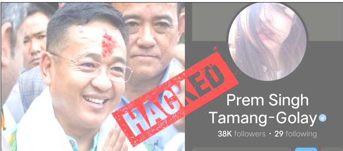
Honibar nikongdang mejangjaba nisung kari Sikkim Chief Minister PS Tamang indang official Facebook page nung tim mesüi teka ai. Iba page ajanga CM PS Tamang-i sorkar osangtem prokshir aser yashi nikongdang 5:00 ako meta hack asüba sülen aonung 9:00 ako meta page nung tetsür noksa ka enoker lapok. Ketdangsurtemi Deobarnep ang iba CM indang page azuoktet aser Sikkim Police-i ken o ka benoka bushisüngdang tenzükogo. (Gangtok, February 28)