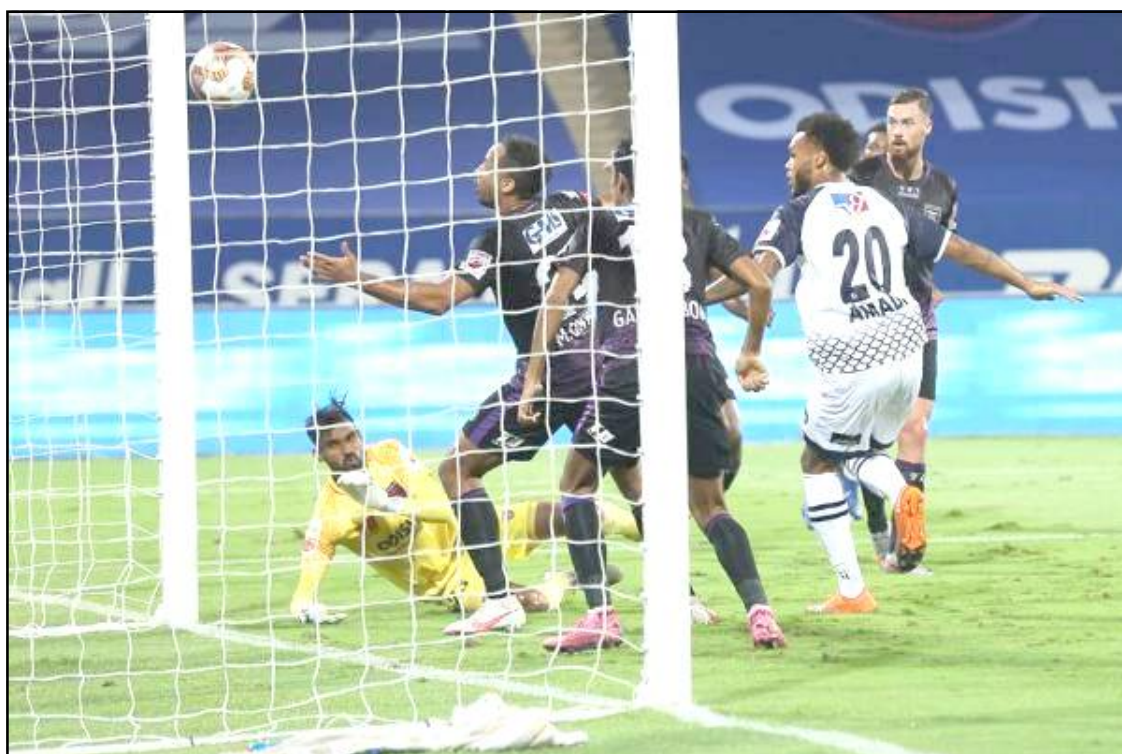
February 28, 2021: ISL 2020-21 asaya 108buba Odisha FC aser SCEB na asaya OFC-i goal 6-5 agi kokogo.