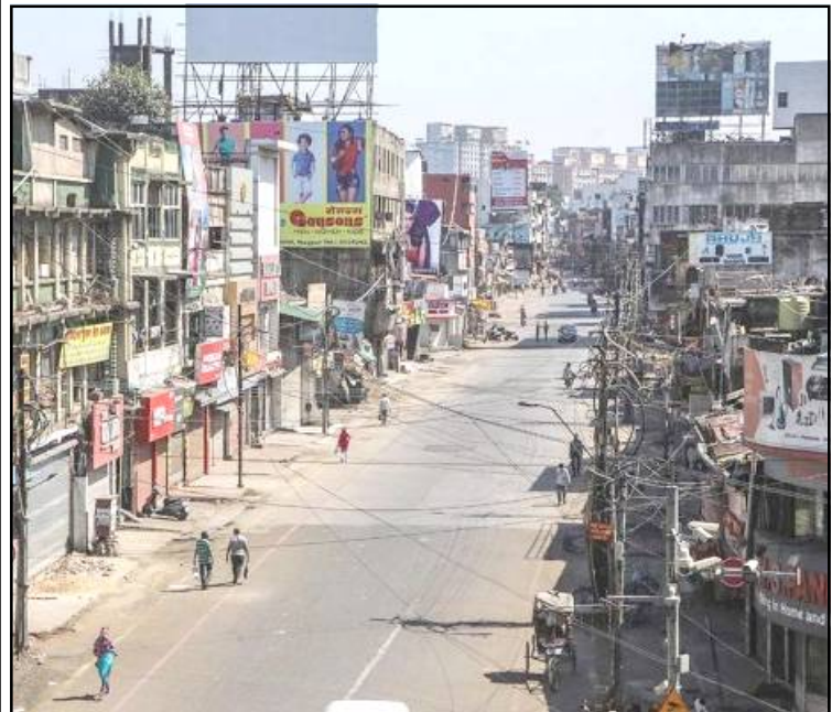
Nagpur, February 28, 2021: Coronavirus tashidak kanga bulua prokba agi Nagpur nung ketdangsertemi Honibar nungi Amongnü tashi tenokdangbatem benokba ajanga Nagpur nung aliba tongti market shibanga aliba noksa nung angur.

Aluyimertem onük bentettsü atema Centre sorkari aluyimertem union den senden 11 ben tashi menogo, ajisüaka tang tashi telemtetba kecha magiteter.