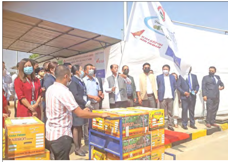
Dimapur, March 2 (TYO): Nagaland chief minister Neiphiu Rio-i Mongulbarnü Dimapur airport nungi mezüngbuba Air Cargo Services tenzüksüba noksa nung angur.

Dimapur, March 2 (TYO): Nagaland chief minister Neiphiu Rio-i Mongulbarnü Dimapur airport nungi mezüngbuba Air Cargo Services tenzüksüogo.