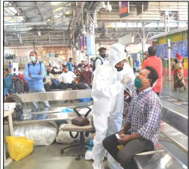
Mumbai nung COVID-19 tashidak kanga bulua potetba sülen CSMT railway station nung health worker temi passenger ka nung swab sample agizükba noksa nung angur.

Maharashtra nung taoba hoptatem nung anogo ka nung nisung 8000 tema dak tashidak potetogo aser iba ajanga ketdangsertemi night curfews aser tenokdangba balala agütsütsüsa aküm.