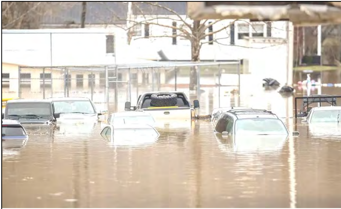
Louisville, Metsüremi/March 02 : Paintsville, Kentucky kübok Euclid Avenue nung gari anentena alidak tzumetsung adoka aliba noksa ka yangi angur. Iba tesem nung tzunglu kanga sashia arua tzumetsung adokba sülen county aser yimti ajak senteper 13 nung state of emergency sangdonga lir.