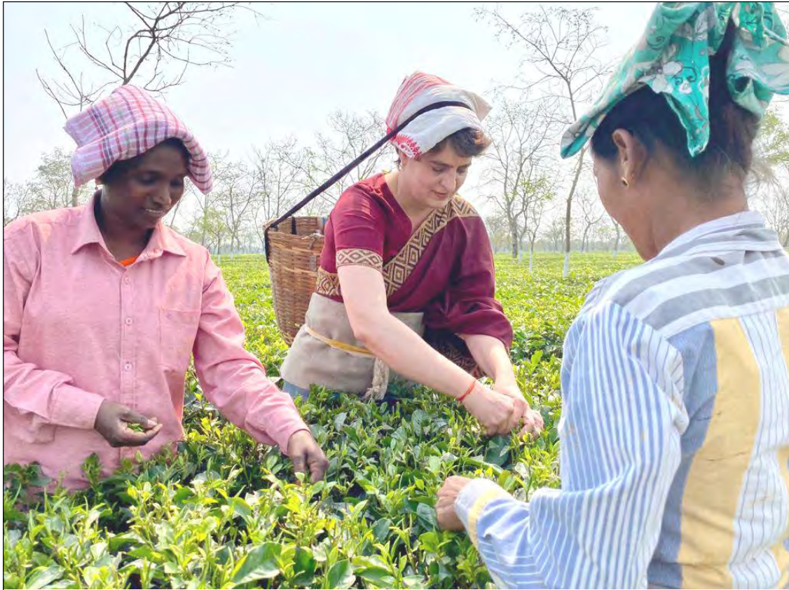
March 2, 2021 nü Priyanka Gandhi-i Biswanath district kübok Sadharu Tea Estate semdangdang agiba noksa angur.

Tezpur, March 2 (Agencies): Congress General Secretary Priyanka Gandhi-i 2021 Assam Assembly Elections atema 'Five Guarantee' campaign tenzüksüogö.