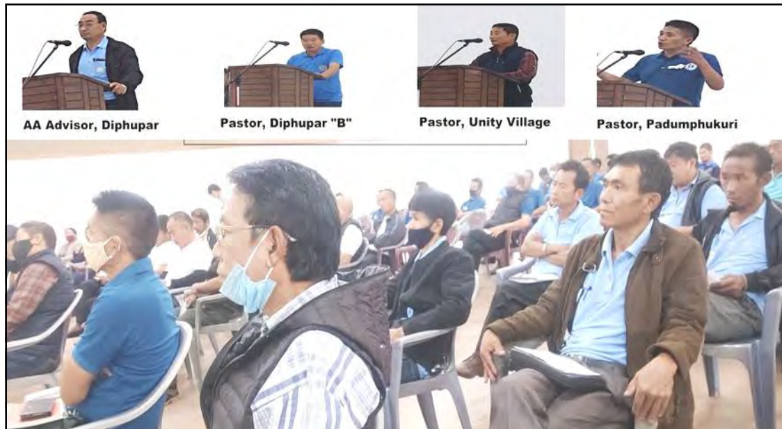
AA Advisor, Diphupar