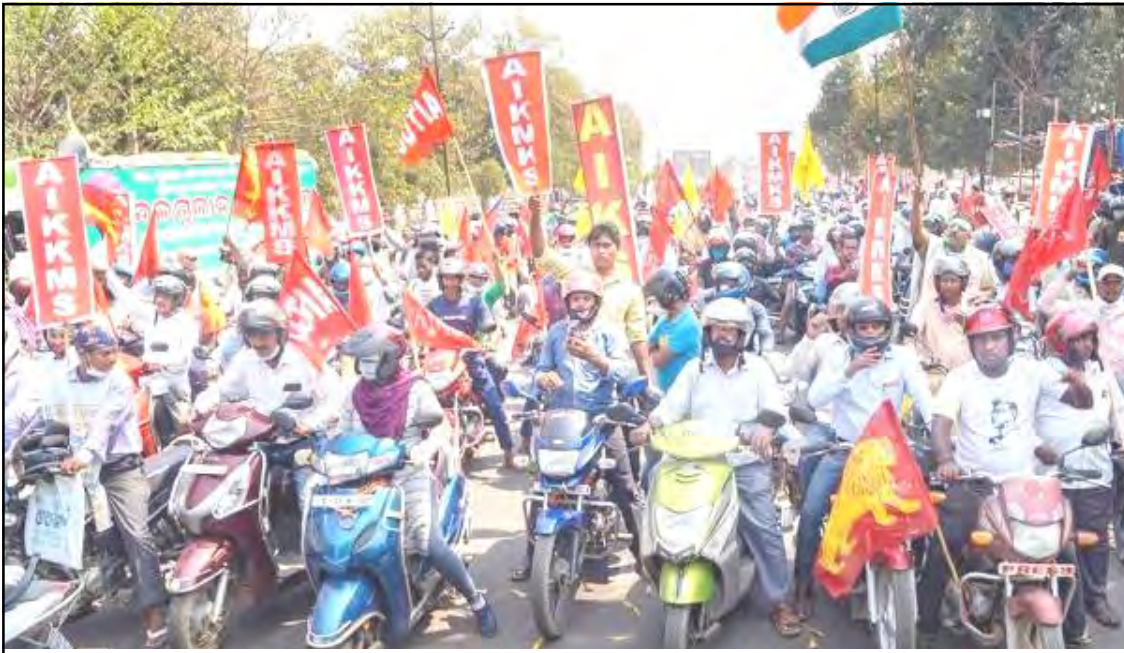
All India Kisan Sangharsh Coordination Committee kübok aluyimer pusemertemi bike rally ka ayongzüka agiba mapang Odisha Assembly nung Center indang aluyimba ozüing agintsü khanga tezüluba nung takhangba ka agütsüi aoba noksa nung angur.