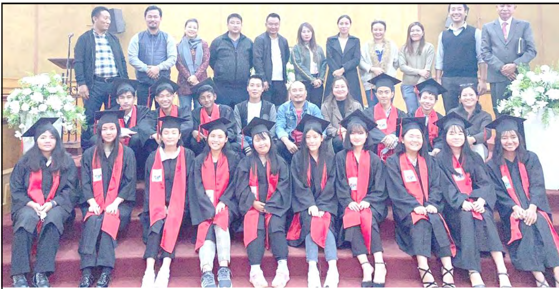
Dimapur Ao Baptist Arogo kubok Merali Fellowship nung 2020 kum Sunday school nung graduate asurtem, Covid-19 timtem aliba agi graduation sentong takum 2021 kum March 02 nu agiba mapang agiba noksa ka yangi angur.