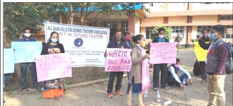
Meghalaya kübok Garo Hills district tem nung Hombar nungi SSA tesayurtemi class-i moi lungkak ait tenzükogo. All Garo Hills SSA School Teachers' Association-i Project Approval Board (PAB) ama ita 8 indang arrear salary meshia hopta ka lungkak aittsü ayongzüka agir. (Tura, March 2)

Pa ket nungi AK rifle ka, AK rifle magazines 3, AK rifle injang 184 rounds, KECHADO mobile phone ka, magazine pouch ka aser rifle sling ka ngutetogo. Sepaitemi UKLF züngsemji Moreh Police ket nung agütsü.