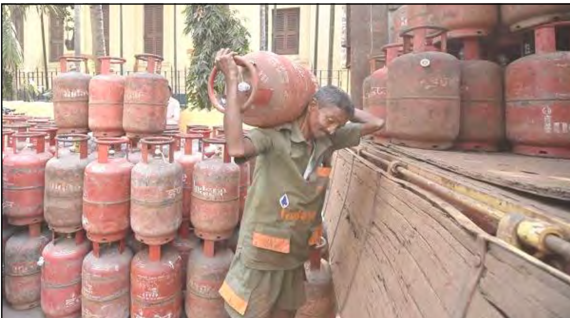
Kolkata nung mapa inyaker kati tata gari ka nung LPG cylinder belenokba noksa nung angur. February tetenzüklen nungi 14.2kg cylinder ka nung sen 125 talila kümogo.