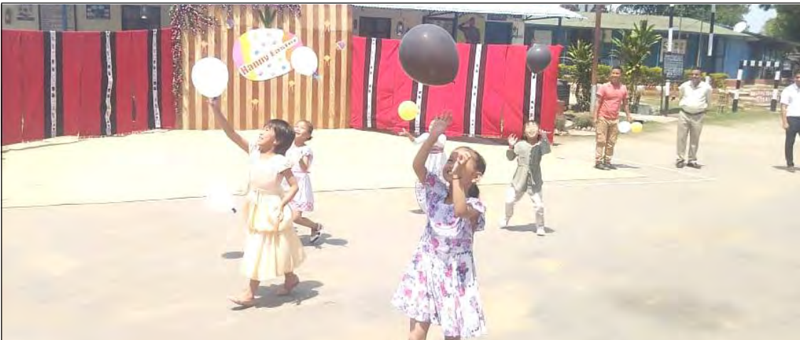
Assam Rifles nung 22 Sector AR/IGAR(East)-i Easter Sunday nung IWCF Tamenglong indang Child Care Homes semdangogo. Meta talang pilar aliba Azuiram, Dikhuiram aser Gelnel tesemtem nunga Easter benjungtem mongogo.

"Basumatary anema ozüngi melaba ama mapa inyaktsü mepishir. Peoples Act, 1951 nung arrla 123 nung lateta aliba ama Tamulpur Constituency nung election mapa anentsü mepishir" ta Assam Pradesh Congress Committee president Ripun Bora-i shidi nung ashi.