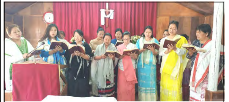
Kohima Liangmai Baptist Church nung tenzüklatemi April 4, 2021 nü Easter Sunday sentong nung temeja ken ka atenba noksa nung angur.

Dimapur, Rongchii/April 04 (TYO): Kohima Liangmai Baptist Church D. Block puri Yisu tasü madak takok ngur shia aruba anogomung nung April 4, 2021 nü tekülem kidang sentong tajung ka agia liasü.