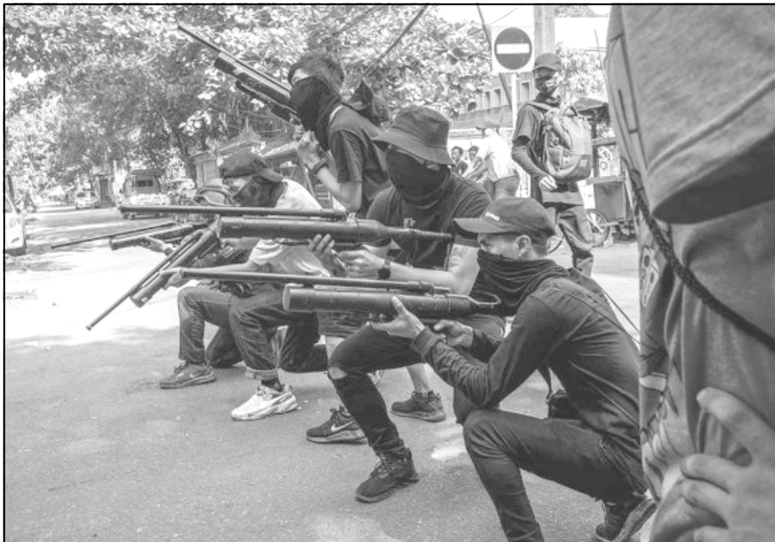
Mitkartemi sorkar atsüngdokba anema Yangon, Myanmar nung longkak aitba mapang nüburtemi teka agi yangluba air rifles amer nokdaka aliba noksa nung angur. Mitkartemi longkak aiter dak tashiyim amshiba aser apuba agi anogoshi Myanmar linük nung longkak aitba manener, shirnoki mitkar dang yimsüsüba menden yujang ta takhangba agütsür.