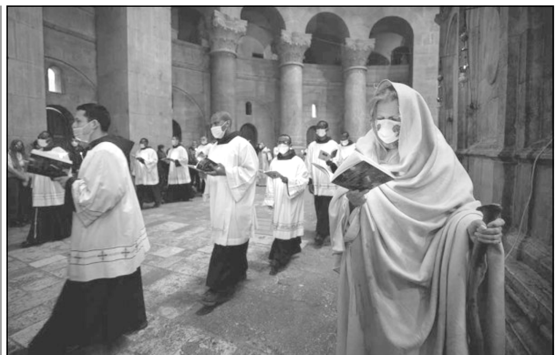
Jerusalem yimti nung aliba Church of the Holy Sepulchre nung Latin Patriarch-i anir putirtemi Easter Sunday mass agiba mapang tangokba noksa ka yangi angur. Iba tesem nungya Yisu Khrista arem, ta amanger.

nung tashidak tendanger shilem 70 shi dak E484K mutation putetogo, koba vaccine agiba ajanga kangabo teküzmükba magütsür, ta public broadcaster NHK-i ashi.