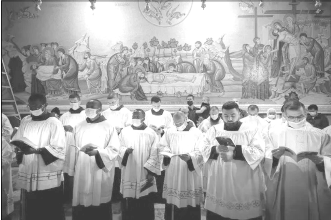
April 04, 2021 nü Easter anogo nung Yirusalem yimti nung aliba Holy Sepulchre Tenla kidang Khristan putirtemi sarasademba noksa nung angur.

April 04, 2021: Yaküm coronavirus wara prokba nokdangtsü atema linük aika shibangba ajanga Khristantemi tekülem kidang Easter sentong magiteti liasü, saka tangbo iba wara terabo süngjemba agi alima tesem balala nung aikati Tenla kidang Easter tekülem sentong agiogo.