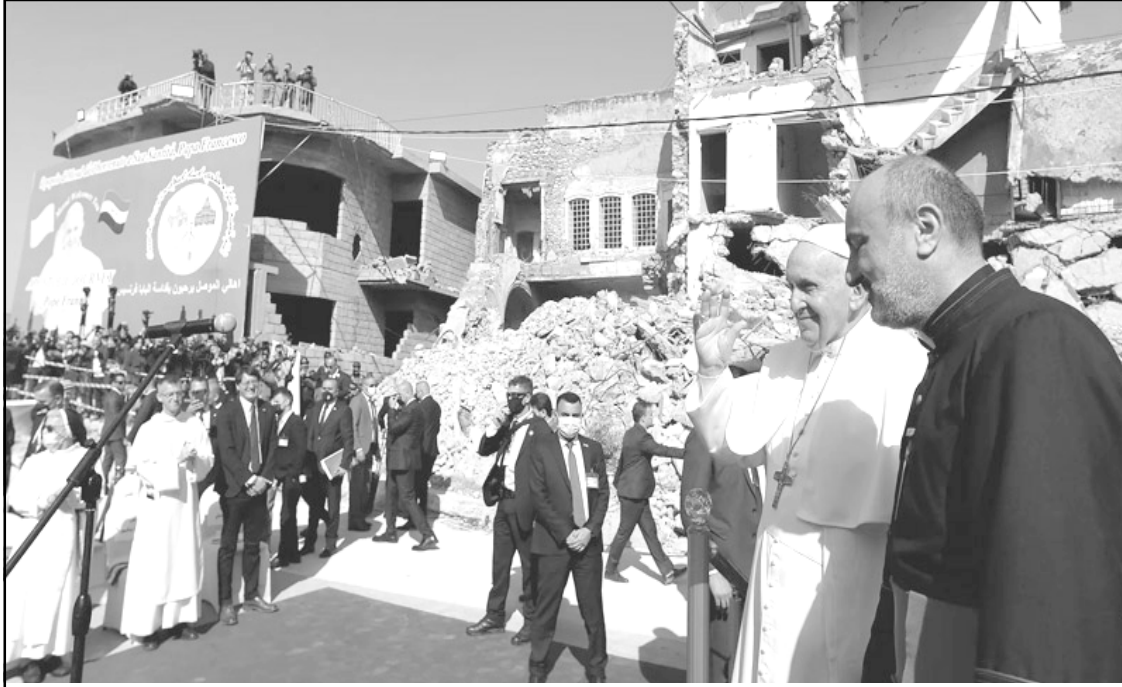
March 7, 2021 nü Iraq kübok Mosul nung Pope Francis, Syriac Catholic Arogo Tenla ki tonga arudang pai teka ayiploksüba noksa nung angur.

Bhagdad, Rongchii/April 08, 2021 (Agencies): Tamalen IS kiralongrartemi Iraq nung yimti ishika agiba mapang nung Khristan aika tepset, aser Khristan aika linük balalai jenshia liasü, ajisüaka taküm March ita nung Pope Francis-i Iraq semdangba sülen Khristan kibong aika Iraq linüki meyipa odar, ta osang ka ajanga metetdaksü.