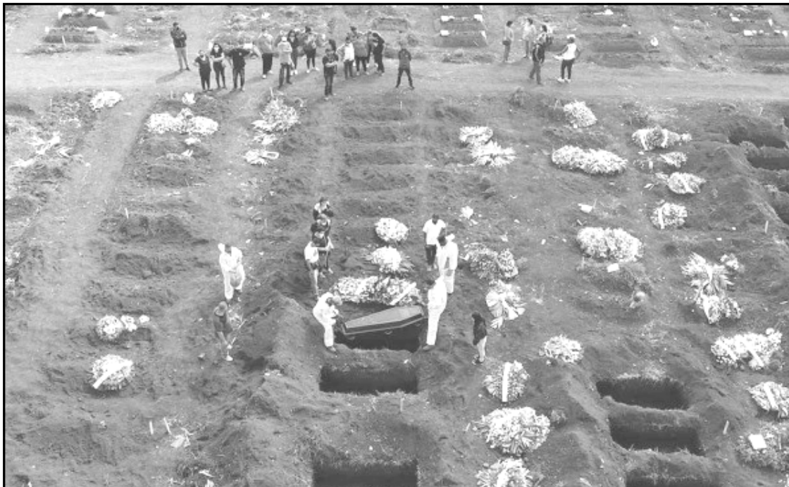
Sao Paulo, Brazil kübok Vila Formosa cemetery nung inyaker temi tashidak nungi kumzüksü süoshi agir COVID-19 agi asüba nisung ka indang süngten leper nung inokba noksa nung angur. Sao Paulo yimti nung anogoshi leper tasen 600 bendenloker.

Maneni linük tesem ajunga nung Ramadan mapang restaurant aser café tema shibangtsü. Anogoshi aonung 9:00 ako nungi anepdang 5:00 ako tashi curfew benokba maneni alitsü.