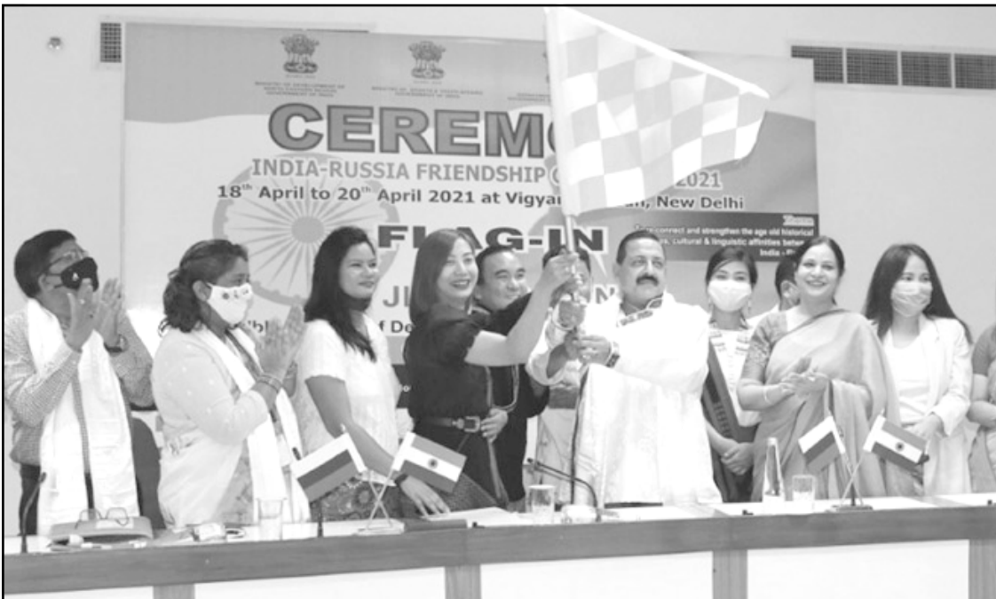
New Delhi, April 08, 2021: Brihostibarnü New Delhi nung Minister of State for Development of North Eastern Region (I/C), Prime Minister's Office, Personnel, Public Grievances and Pensions, Atomic Energy and Space, Dr Jitendra Singh-i India-Russia Friendship Car Rally-2021 tenzüksüba noksa nung angur.

Yoshihide Suga-isa China linüki East aser South China Sea nung ambangyima inyakba tebilemstsü lemsatepogo, ta kasa osang ajanga metetdaksü.