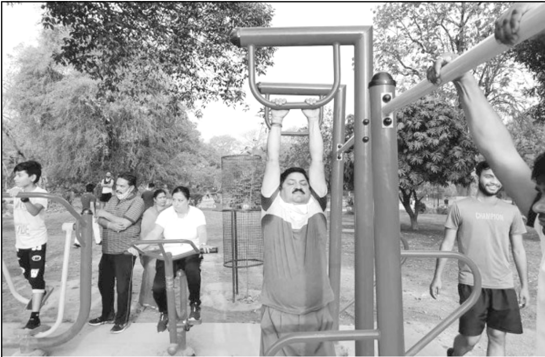
April 08, 2021 anepdang Uttar Pradesh kübok Prayagraj nung nisungtem gym nung exercise agiba noksa nung angur. Tang India nung anogo shia nisung aika dak coronavirus tashidak puteta arudar, aser tang tashi nung linük nung coronavirus case ajak senteperbo million 12.9 jungogo.