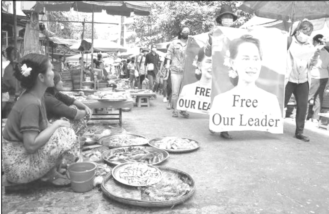
Mitkar tashi amshia sorkar atsüngdokba anema nokdakertemi Yangon, Myanmar kübok Kamayut township nung shishilempaba tesem ka ajanga Myanmar lenir Aung San Suu Kyi indang noksa amer aoba angur. Mitkartemi sorkar atsüngdoka tejashi sayua parnoki Kamayut township nung shishilempaba tesem aser yimtung nung yimyim ayima jaja.

Taze ya Kale jila anasa lir, kong Bodhbarnü sepai aser longkak aiter tsüngda kasa yimya nung raratepba mapang nisung 12 tepseta liasü, ta osang balala aser tenük kuli alirtemi