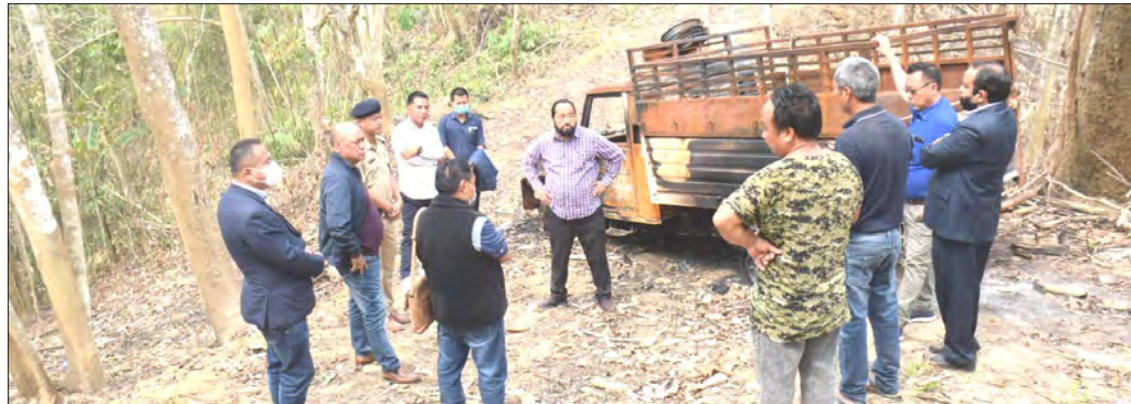
Nagaland Deputy CM Y. Patton, Cabinet Sub Committee züngsemtem, principal secretary Home, Commissioner Nagaland nungeri April 8 nü, Dimapur aser Peren arrtsü nung March 22 nü lendong atalokba tesem semdangba mapang tangokba noksa nung angur.

Dimapur, Rongchii/April 8 (TYO): Nagaland Deputy Chief Minister aser Home and R&B incharge, Yanthungo Patton-i April 8 nü LAMHAI NAMDI temeket nung aliba tesemtem semdanga Dimapur-Peren arrtsü nung tensa asadangogo.