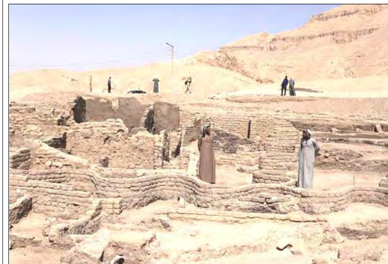
Luxor province, Egypt nung aliba küm 3,000 tain yimti ka nung nüburtem nokdaka aliba angur. Tang tesüsa ali nung totetba yimti ya Luxor nung Nile tzükum anüolen temple of King Rameses III aser colossi of Amenhotep III tsüngta nung lir. Iba yimti ya Amenhotep III'er semchir Tutankhamun, aser pa melener King Ay nati maneni amshia liasü.

Amokmerenba sülen osangbener kari police tanükba meshi, saka Karaivaz anüker meliasü, kechiaser pai tanüker memeshi, ta osang ajanga ashir.