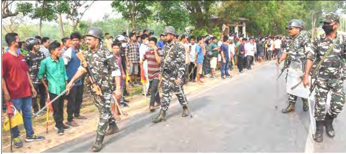
Tripura Tribal Areas Autonomous District Council (TTAADC) election agiba vote azüngba mapang neburtem kima sendena ataba noksa nung angur.

Agartala, April 10 (Agencies): Tripura chuba jabaso Pradyot Kishore Manikya Debbarma-i aniba TIPRA Motha-i Tripura Tribal Areas Autonomous District Council (TTAADC) election nung takok nguogo.