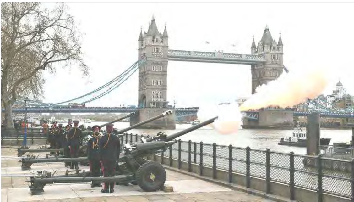
Prince Philip asüba temaitsü Honourable Artillery Company nungi 41-gun salutes Members temi April 10, 2021 nü Tower of London nung 41-round gun salute agütsüba mapang tangokba noksa nung angur. Britain indang Prince Philip, shiba Queen Elizabeth II kinungbo liasü, pai küm 70 dak tema pa kinungtsü yaria arur Hokulbarnü asü.