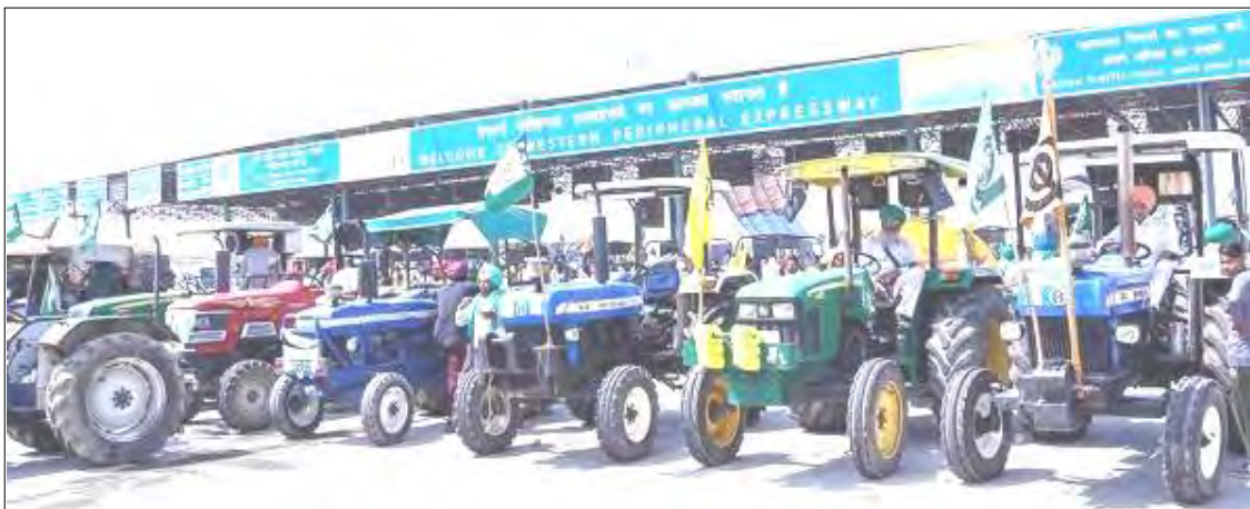
April 10, 2021 nü aluyimertemi aluyimba ozüing atasen anema longkak aitdang Sonipat distrtict anasa Kundli arrtsülen KMP Expressway mokdangba noksa nung angur.

Tesüiba ghonda 24 tsüingda India nung ano nisung 1,45,384 dak coronavirus putet aser ibaji densemabo tang tashi nung India nung nisung ajak agi 1,32,05,926 dak iba tashidak putetogo, ta Honibarneep Union Health Ministry-i metetdaksü.