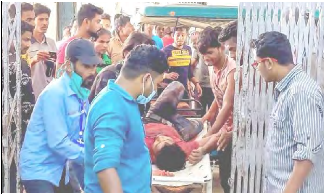
April 10, 2021 nü West Bengal nung Assembly Election shilem pezübuba agiba mapang Cooch Behar district nung rara adokba sülen yirurtem yariba noksa nung angur.

Kolkata, April 10 (Agencies): West Bengal nung assembly election mapang Cooch Behar nungbo tesüiba anogo ishika tensa tamajungba kümдар, aser Honibarnü election shilem pezübuba agidang iba district nung rara tuluka adoka nisung pongu khasetogo.