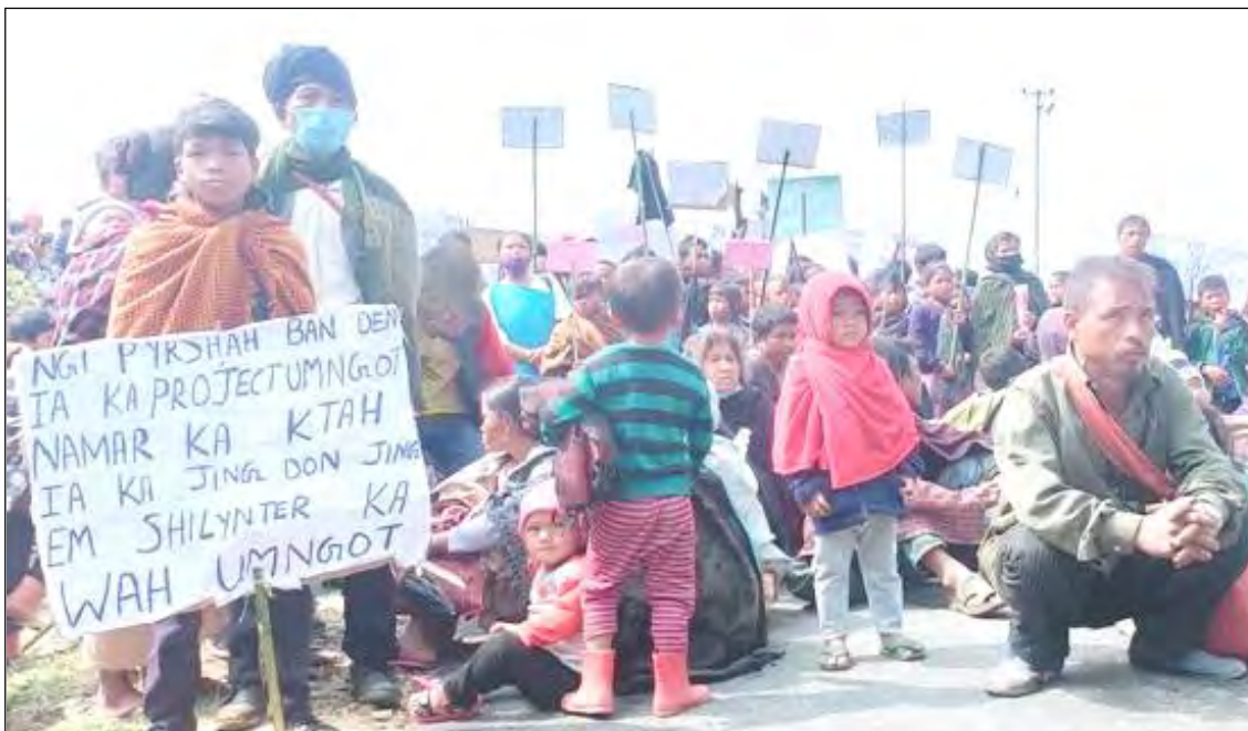
Meghalaya Energy Corporation Limited (MeECL)-i Umngot ayong nung power 210 megawatts adoktsü atema tünoktang ka yanglutsüba anema noktakerlemi lenmang mokdang lungkak aitba angur. Meghalaya State Pollution Control Board-i East Khasi Hills district kübok Siangkhnai yimdak sentong ka aser ano West Jaintia Hills district kübok Moosakhia yimdak sentong ka agitsüba liasü saka lungkak aiterlemi lenmang mokdangba ajanga additional district magistrate-i anir ketdangsürtem senden alidaki moutet.

Sentep nung mesüra tanga lokti adenshidak kentenba kecha malitsü ta state sorkarisa tetuyuba agütsüogo.