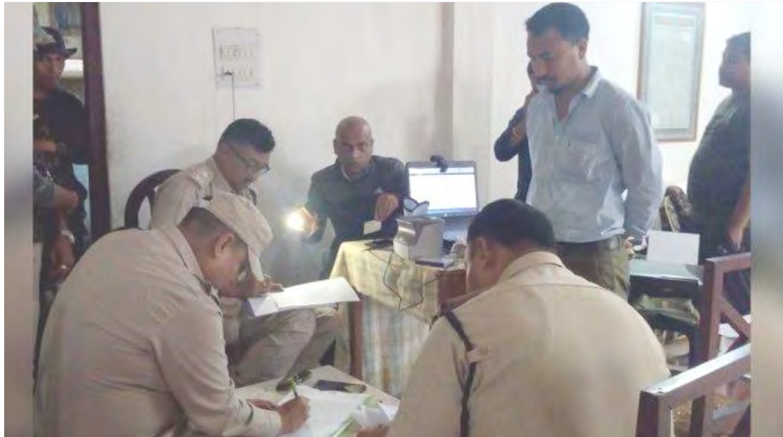
Dibrugarh Police-i Paltan Bazar nung özüngi memelaba Aadhaar card centre nung nisung asem apuba sülen asüngdangya asüba noksa nung angur.

Dibrugarh, April 11 (Agencies): Assam kübok Dibrugarh nung özüngi memelaba Aadhaar card centre ka makdokogo.