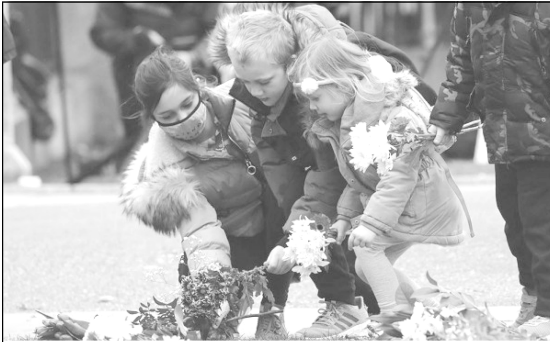
Britian indang prince Philip asüba sülen anogo ka lir tanurtemi Cambridge kikümtong nung naro toktsüi aruba noksa nung angur. Prince Philip ya Queen Elizabeth II kinungbo aser pai küm neter dak tema pa kinungtsü nongita aruba sülen Hokolbarnü süogo.