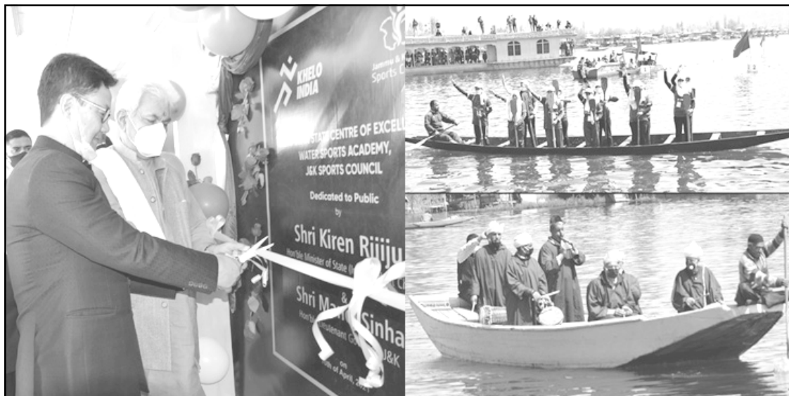
Srinagar, Rongchii/April 11, 2021: Honibarnü, Jammu aser Kashmir Lt Governor Manoj Sinha aser Union Minister of State (Sports) Kiren Rijiju nati Srinagar kübok Nehru Park nung Khelo India Centre of Excellence "Water Sports Academy" lapoktsüba mapang agiba noksa yangi angur.

Tanga tongtibang linük den medemdangra, Japan nung Covid-19 putetba ya tajemba alitsü. Ajisüaka, Japan nung Covid-19 tanaben adokba ajanga Games atema tebilemstü adoker.