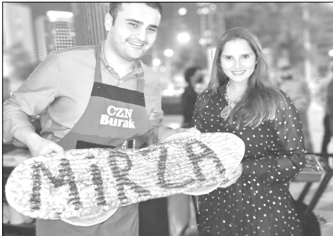
Dubai, Rongchii/April 11, 2021: Turkey nung nungtugu chef, Burak Özdemir (CZN Burak)-i amtsük ka nung 'Mirza' zülur Hyderabad nungi India tennis star Sania Mirza den külemi tangokba noksa ka yangi angur.

Company-i ashiba agi, online ajanga 6 GT mekaa ayur customer tem nem sen lakh 1.50 alang BMW lifestyle collection aser accessories agütsütsü terenemba lir. Iba nung BMW Display Key densema lir. Iba offer ya online ajanga mekaa ayur atema dang alitsü aser April 30, 2021 tashi dang lapoktsütsü.