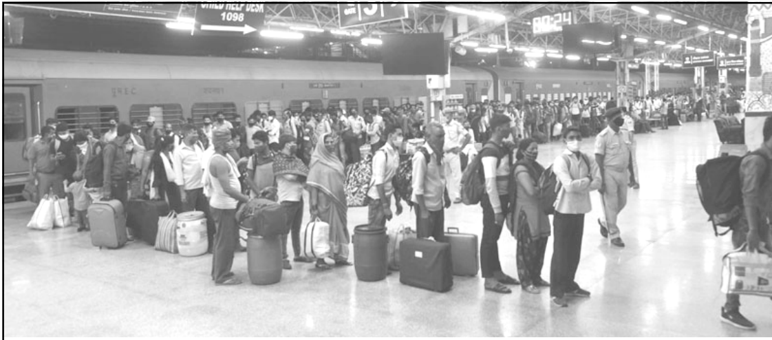
Linük aser Patna nung covid tashidak menar tali kuma aoba mapang ka nung Maharashtra nungi migrant tem pei talidaki aotsü atema Patna railway station-i aruba noksa nung angur.