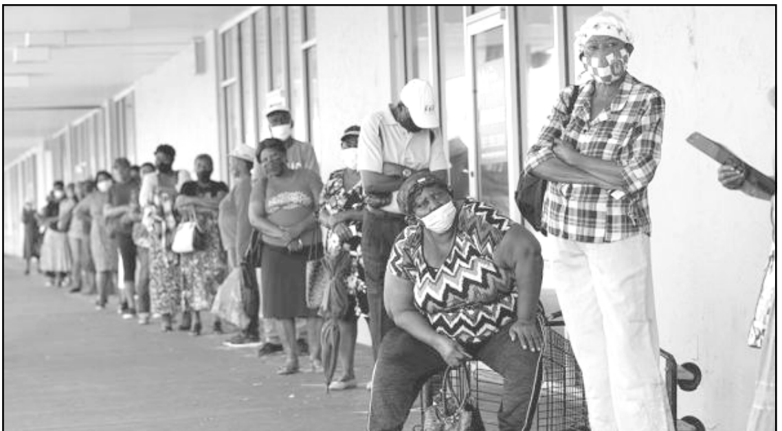
Immokalee, Fla kübok clinic ka nung nüburttem Johnson & Johnson vaccine agitsü atema tarensena nokdaker aliba noksa nung angur. Iba clinic nung bendanger aluyimertem aser parnok kibongtem nem vaccine agütsütsü asoshi rangloker inyakdar. Iba health care network ya Coalition of Immokalee workers (CIW) den longjemer item nisungtem nem vaccine agütsütsü atema inyakdar.

Taoba Küm annual military parade ka agiba mapang Pyongyang-i, nuclear-capable missiles arsenal ajungketshir aliba sayaogo aser hadir balala bendenlokba nung SLBM ajungketba ya tongtiba liasü.