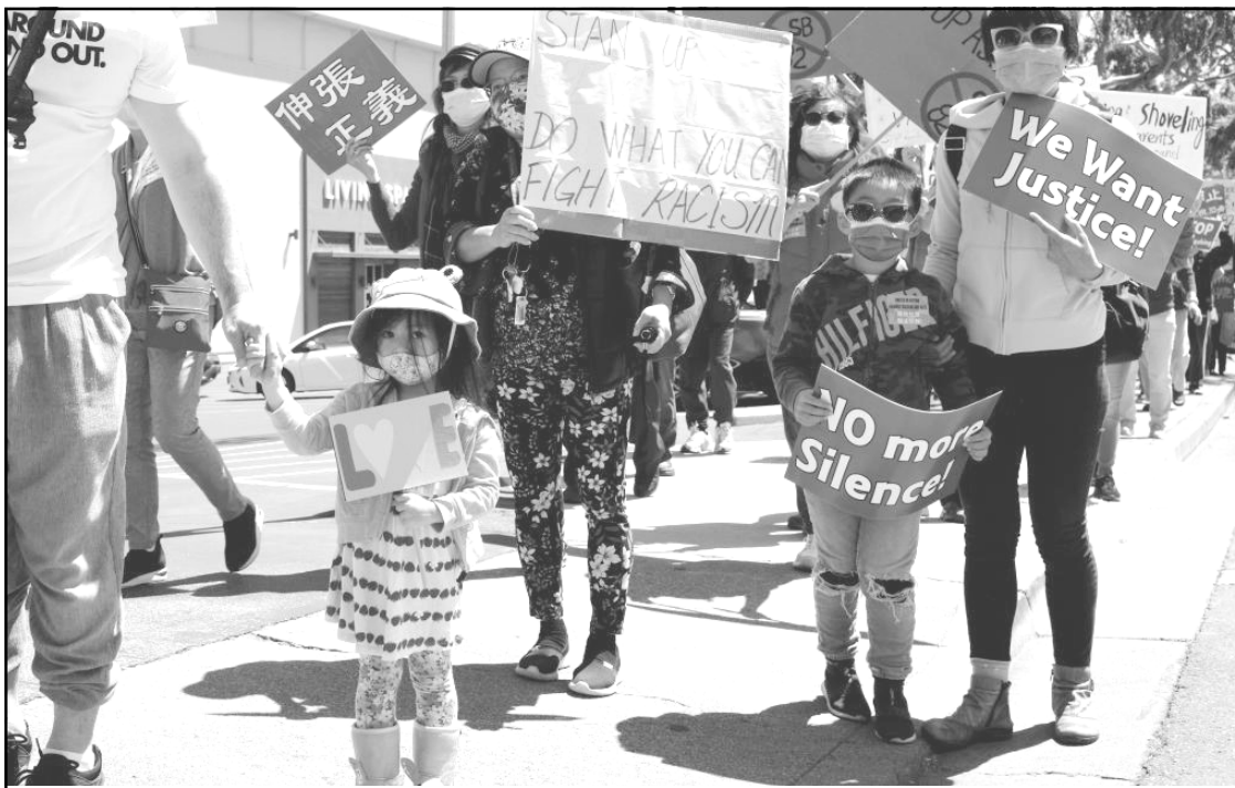
Asia nunger dak mapa tamajung inyakba anema Millbrae, California, United States nung April 17, 2021 nü rally ka agidang nüburtemi shilem agiba noksa nung angur. Asia nunger anema mapa tamajung inyakba aija Millbrae nung ayongzükba rally nung California Lieutenant Governor Eleni Kounalakis dena liasü.