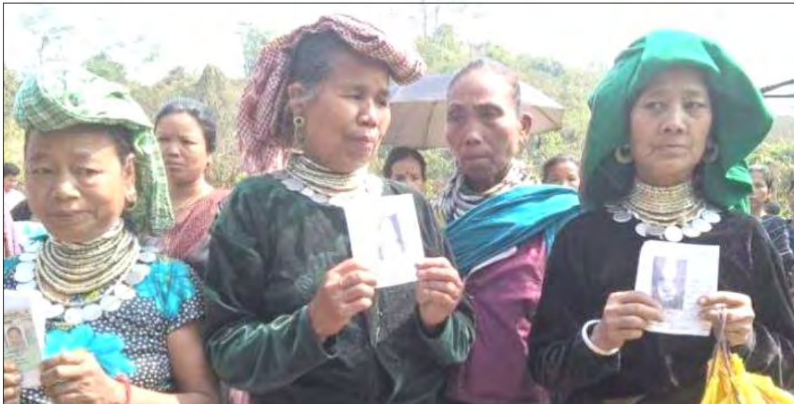
Honibarnü Mizoram kübok Serchhip assembly constituency nung by-election agidang tangokba noksa angur. Yashinep 7:00 ako nungi tenzüker yasüing 7:00 ako tashi nung 29 polling station 29 nung vote enoktsür 83.8% liasü.

Tesüiba hopta ana tejakdang Dibrugarh nunga nisung 347 dak puteta liasü.