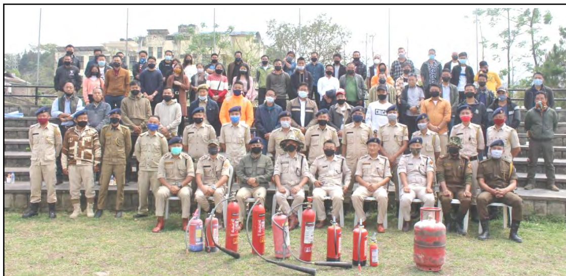
Fire Week 2021 nung shilem ka ama Naga Solidarity Park, Kohima nung mi lendong nungi kumzuka alitsü asoshi yimyatem sayuba aser lecturer agütsüba sentong ka agidang Nagaland Fire & Emergency Services ketdangsurtem aser sentong nung shilem agirtem tangokba noksa ka yangi angur.

Kohima, Rongchii/April 18 (TYO): Fire Week 2021 nung shilem ka ama Nagaland Fire & Emergency Services ajanga Naga Solidarity Park, Kohima nung mi lendong nungi kumzuka alitsü yimyatem sayuba den lecture agütsüba sentong ka April 17, 2021 nü agia liasü.