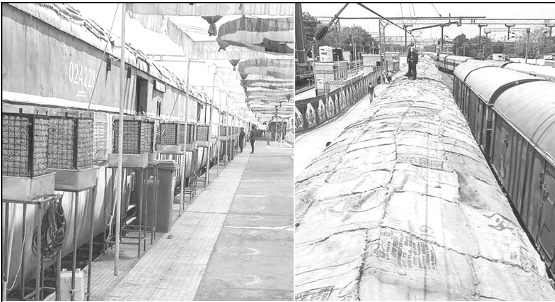
April 18, 2021 nü Nandurbar nung aliba Nandurbar railway station nung coronavirus agi shirangertem atema isolation coaches agütsür. Train coaches nung temperature ajemdaktsüsü atema gunny bags aser water drip system amshir.