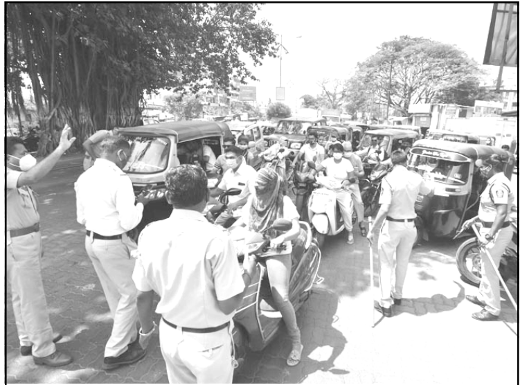
Mumbai, April 18, 2021: Amongnü Mumbai nung police-i coronavirus anema tenokdangbatem alema inyakba garitem soitba noksa nung angur.

"Ozüng kübok compulsory license agütsüsüla, ibaji ajanga company aikati vaccines yanglutetsü. Vaccine amshitsü atema license ngua aliba vaccines ji bendanglen nungi bener arutsü atema melatsüla. Linük nung supplies telatet ka dang, anungji European Medical Agency mesüra USFDA-i temelaba agüja aliba vaccine tembo bendanglen nungi bener arua yangi amshitsü atema melatsüla," ta paisa mepishia metetdaksü.