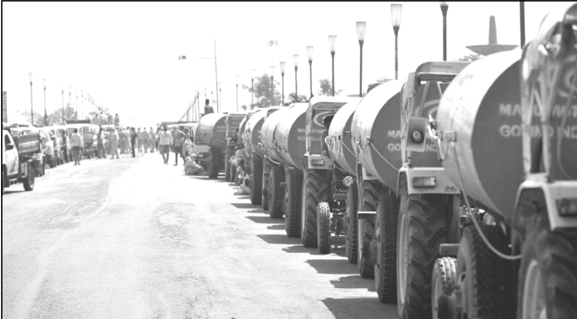
Lucknow, April 18, 2021: India nung coronavirus kanga prokba mapang Amongnü Lucknow nung Lucknow Nagar Nigam-i sanitization drive tenzükogo.

State nung shilem 8 lemsar assembly elections agir; April 29 nü election tembangtsü aser May 2 nü vote zünga election osang sangdongtsü.