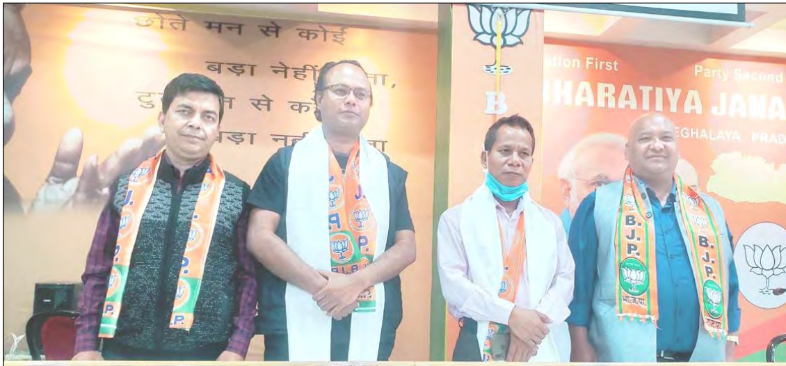
Shillong nung aliba BJP office nung Garo Hills Autonomous District Council (GHADC) nung takok angur BJP MLA 2 den state ketdangsürtem agiba noksa ka angur.

Tura, April 18 (Agencies): Meghalaya Governor Satya Pal Malik-i Garo Hills Autonomous District Council (GHADC) kümtetsü atema mezüingbuba session ayongogo.