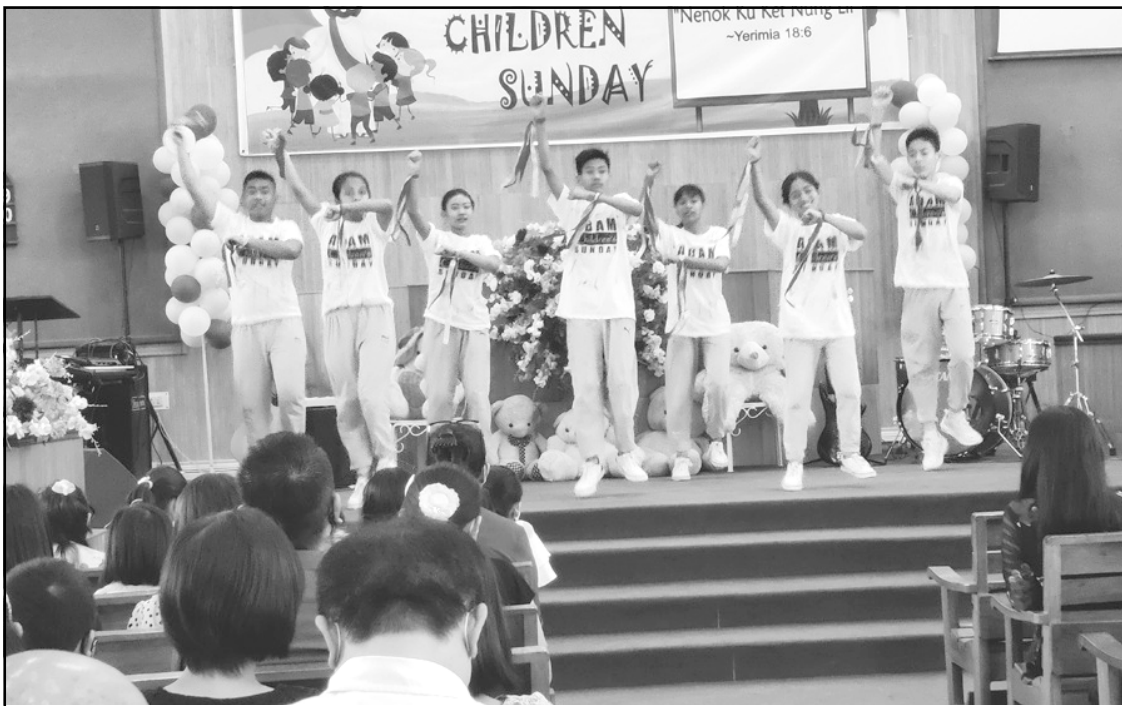
ABAM kubok aliba arogo ajak nung April 18, 2021 amongnu anogo ya tanurtem anogomong mongogo. Iba anogomong sentong nung DABA kubok Merali Fellowship nung tanurtemi shilem agiba noksa ka yangi angur.