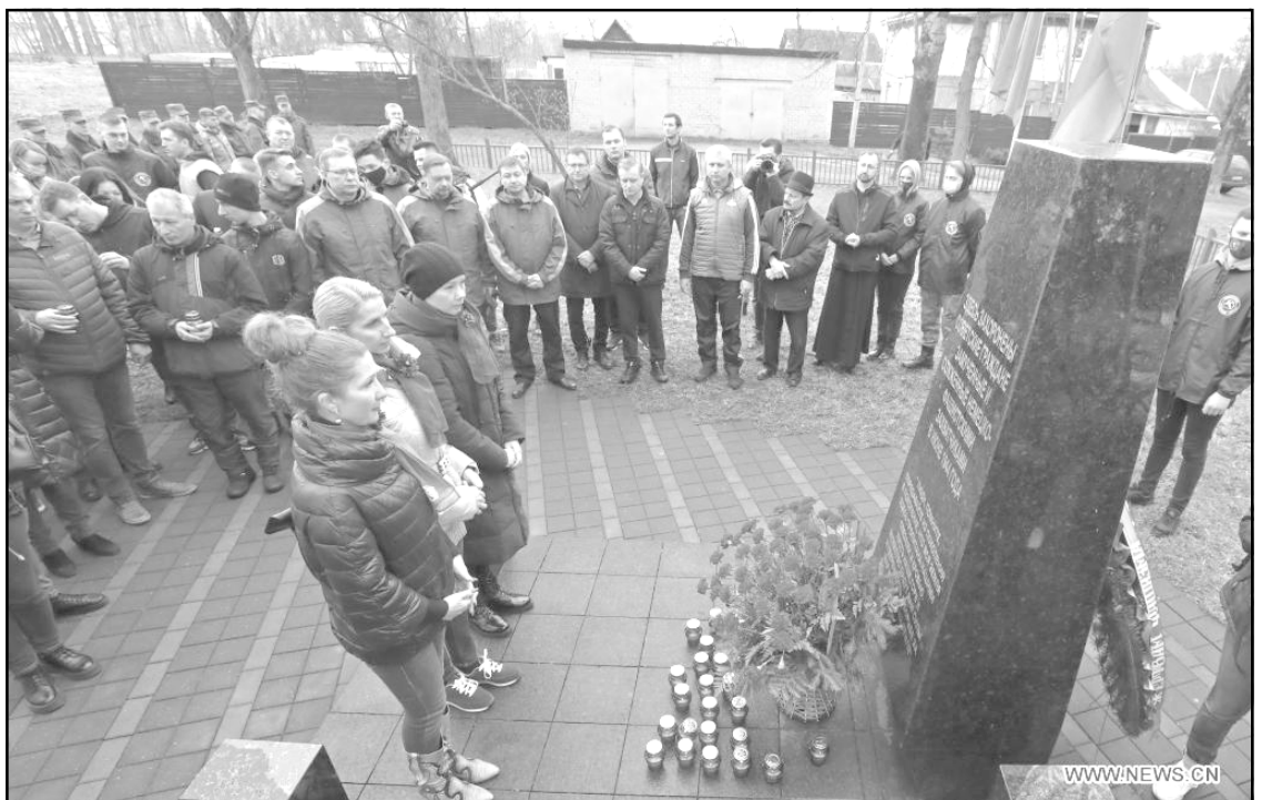
Belarus yimtiba, Minsk nung April 17, 2021 nü 'voluntary work of Saturday' sentong ka alidang nüburtemi war memorial ka nung naro yutsüba noksa nung angur. Iba anogo bendenba sen ajunga ya linük nung aliba medical institution temi amshia medical dak sendakha hadir aser mozü alitsü aser otsü aketba tejen oset aser war memorial tem yanglushitsü. Belarus nung küm shia April 20 meta iba anogo ya yimsü ka ama mongyonga arur.