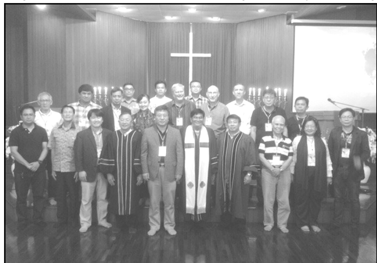
Church Planting networks-i Thailand nung training agütsüba mapang tangokba noksa nung angur.

Temeim Tsüngrem nai agütsüba shisatsü timi ketdangsüa amshiba ajanga tangar yaritettsü Nai ni maneni yariang ta sarasadema mepishir. Amen