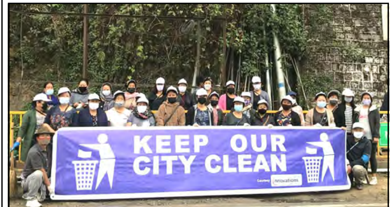
Keep Our City Clean (KOCC) team aser Kohima Chakhesang Churches Women Fellowship lungjemer Kohima nung aliba Classic Island nungi PHQ lemjem tashi April 17, 2021 nü mürekmejuba sentong ka agia liasü. Taruba Honibarnü Chakhesang Baptist Church, Minister's Hill den lungjemer PHQ lemjem nungi Mohonkhola tashi inyakttsü.

Naga nung tashitemeter aser shisa akar ajaki pa den nungita yariteptsü mepishia ayongzük, ta kasa sangdong nungsa shia liasü.