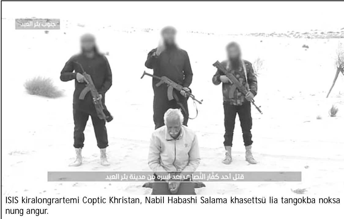
ISIS kiralongrartemi Coptic Khristan, Nabil Habashi Salama khasettsü lia tangokba noksa nung angur.

April 19, 2021: Egypt nung ISIS den tesendaktep aliba kiralongrar telok kati Coptic Khristan ka densema nisung asem khaseta Egypt nung Khristantem dang linük nung sepaitem pu-masemtsüla, ta amokmerenogo.