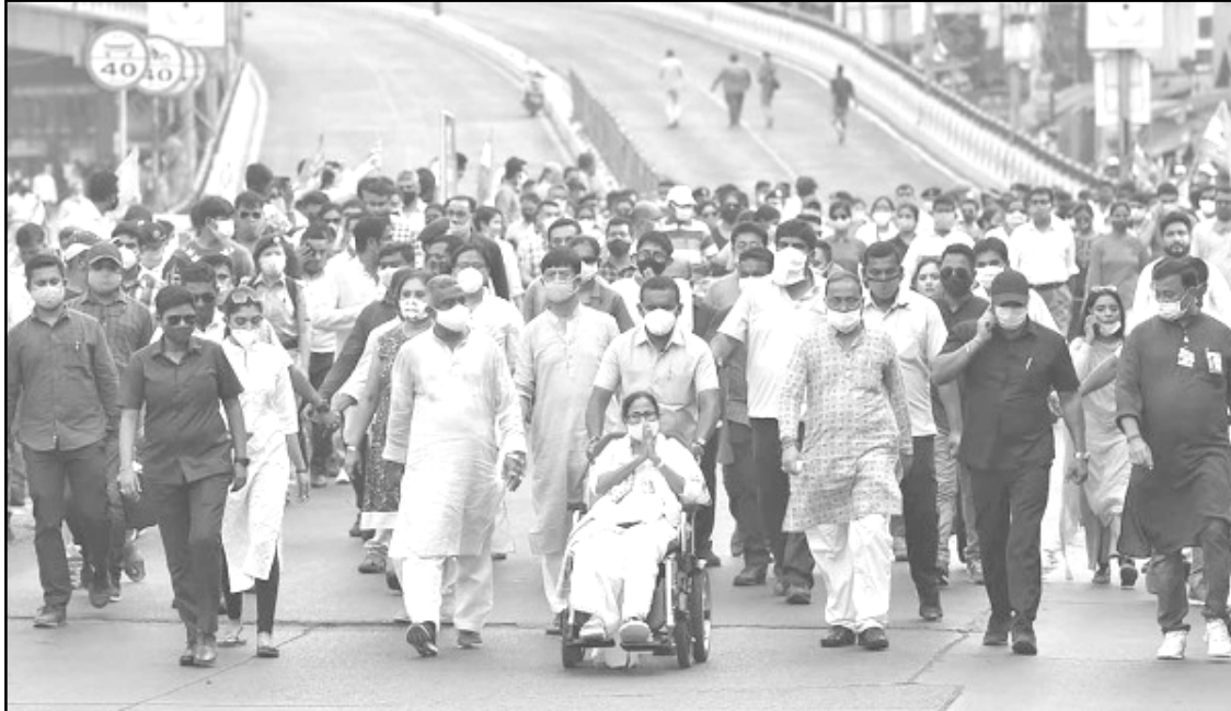
April 19, 2021 nü Kolkata nung TMC tongti aser West Bengal Chief Minister, Mamata Banerjee-i party candidate tem atema nüboyimja roadshow agiba noksa nung angur.

Kolkata, April 19 (Agencies): Linük nung coronavirus tensa tamajungba akümba nung ajemdaker Hombarnü West Bengal Chief Minister, Mamata Banerjee-i Election Commission dang state nung Assembly election shilem asemprong kenüyongi dang agitsü mepishi.