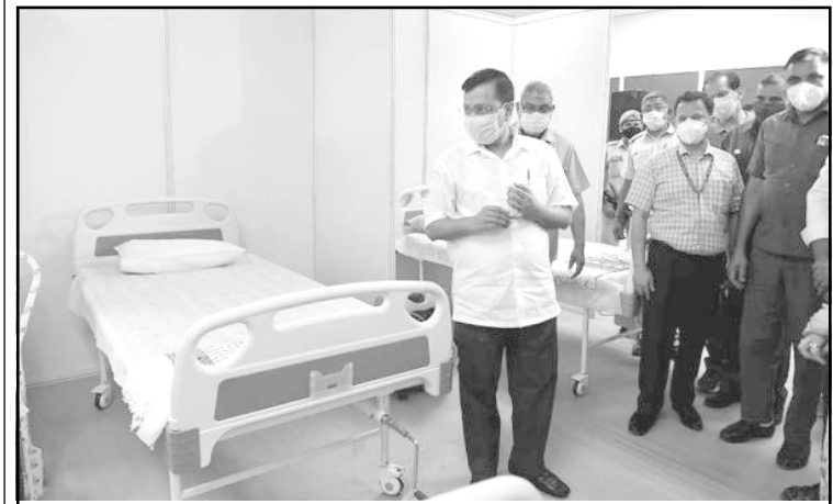
April 19, 2021 nü New Delhi nung Delhi Chief Minister, Arvind Kejriwal-i Covid care centre ka semdangba mapang tangokba noksa nung angur.

March 16 nü House of Commons nung jembidang Johnson-i, "Alima nung democracy tulutiba linük den tesendaktep tashi itshitsü atema ni India semdangtsü, ta ni tepela nung sangdonger," ta metetdakja liasü.