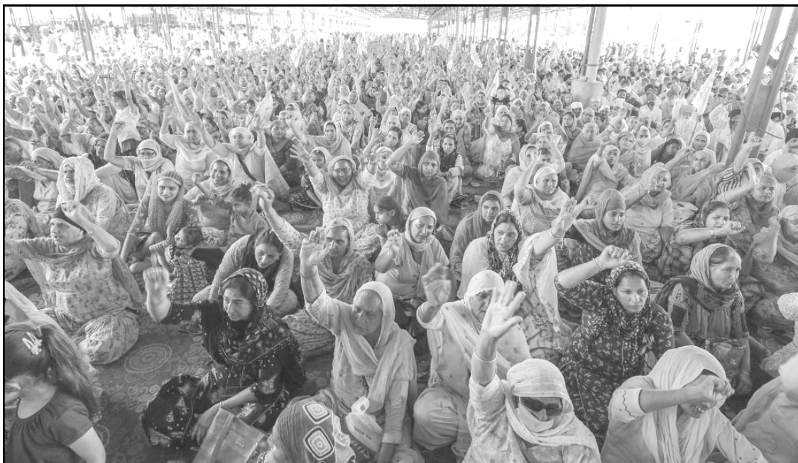
April 19, 2021 nü Amritsar nung aliba market ka nung aluyimertemi Centre sorkar dang aluyimba ozüng tasen asem agienang, ta takhangba agüja longkak aitba noksa nung angur.

ICMR-i ashiba agi, April 18 tashi nung linük nung samples ajak agi 26,78,94,549 tendangogo aser iba nungji Amongnü samples 13,56,133 tendangba densema lir.