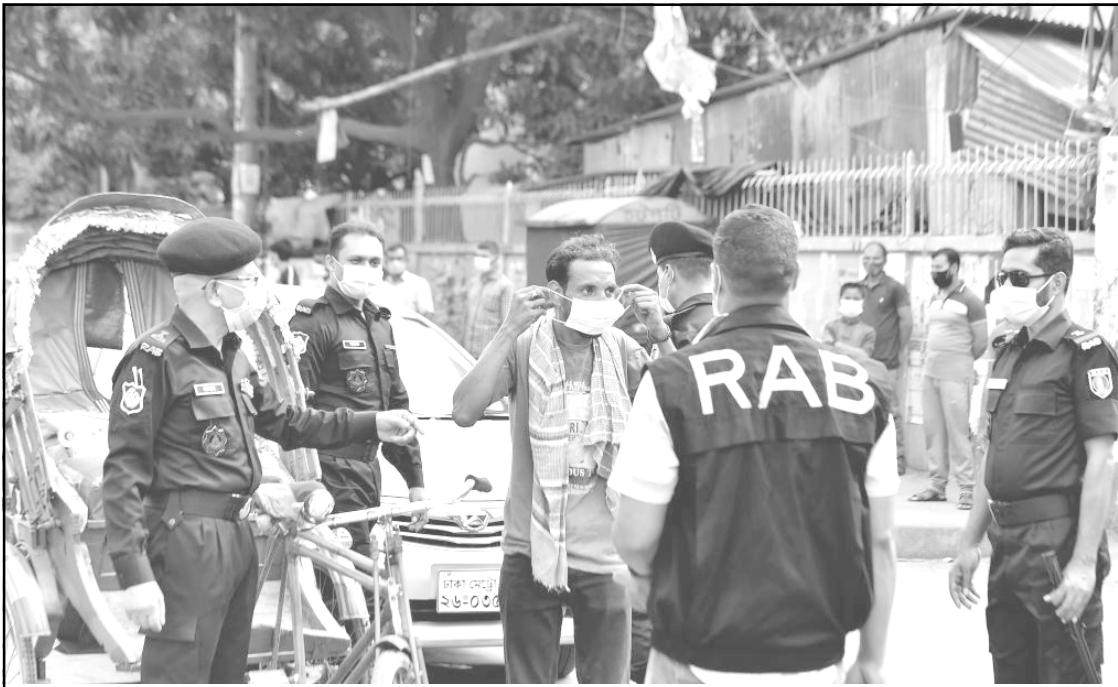
Bangladesh yimtiba, Dhaka nung ozüng amshirtemi rickshaw anir ka nem mask agütsüba noksa nung angur. Bangladesh nung COVID-19 tashidak wara tenzüker Deobarnü tamajungtiba liasü, kong iba tashidak agi nisung 102 asüba osang liasü. Iba linük nung COVID-19 agi asemnü atonga nisung 100 dak tema asür aser tang tashinung ajak agi nisung 10,385 süogo.