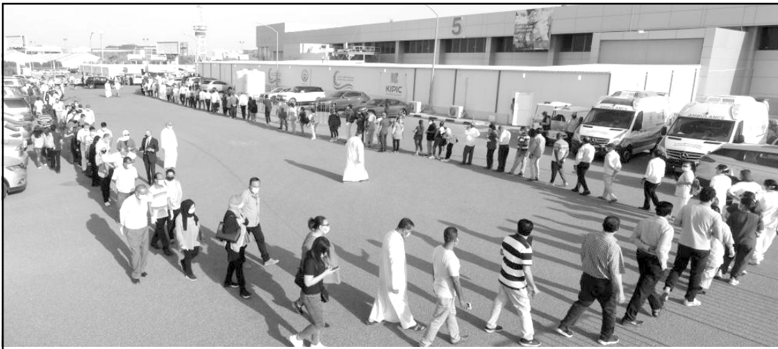
Kuwait City, Rongchii/April 21: Hawalli Governorate, Kuwait nung aliba Kuwait Vaccination Center nung nūburtem COVID-19 mozū agitsū nokdaktepa aliba noksa nung angur. COVID-19 tashidak prokshiba azüoktsü nūkjidong nung Kuwait-i Ramadan matem tashi 'partial curfew' benoka aliba amshitsü, ta Kuwaiti sorkari sangdongogo.