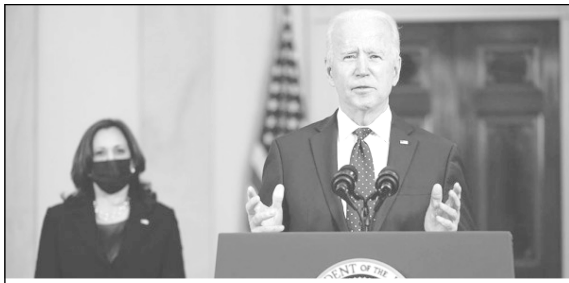
George Floyd asüba ken o nung taoba Minneapolis police Officer Derek Chauvin aitsüba sülen Washington nung aliba White House nung US Tir Joe Biden-i osangbener den jembiba mapang tangokba noksa nung angur. Noksa nung Joe Biden sülen Vice President Kamala Harris nokdaka aliba angur.