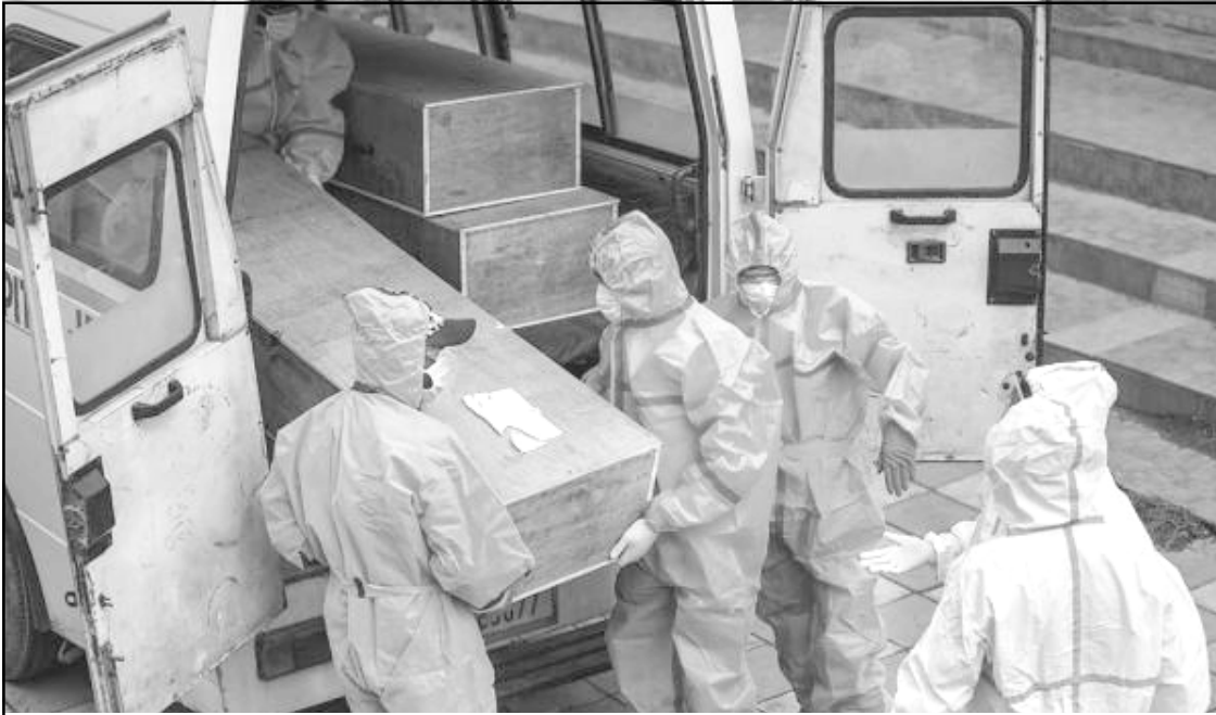
April 21, 2021 nü Jammu nung tasümang arongba tesem ka nung Health worker temi coronavirus tashidak agi shiranga asürtem tasümang süngden agizükba noksa nung angur. Coronavirus nokdangtsü atema Jammu & Kashmir kübok municipal aser urban local body limits ajak nung aonung curfew ozüng benokogo.