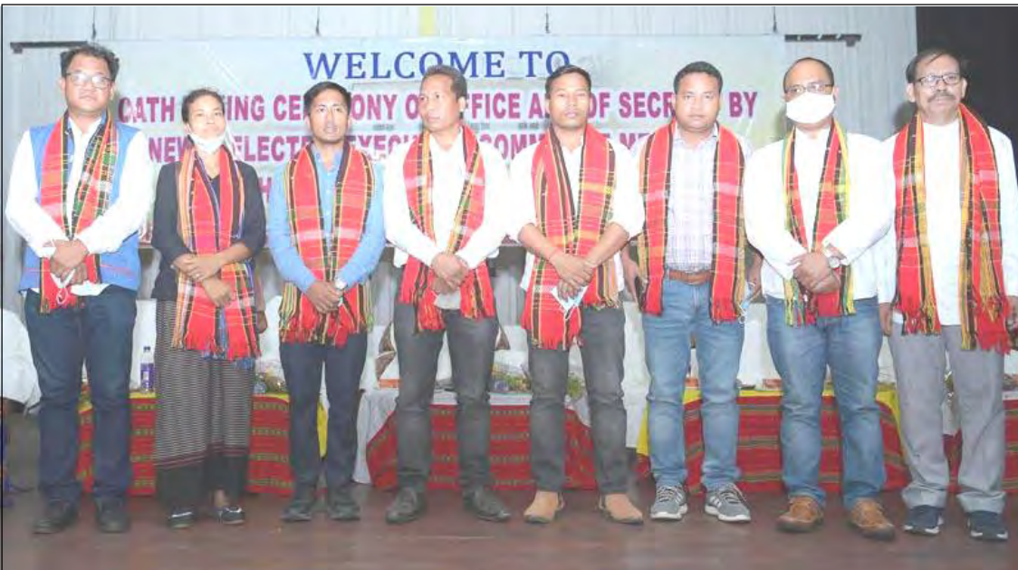
Agartala, Rongchii/April 21: Mongulbarnü Agartala nung TTAADC (Tripura Tribal Areas Autonomous District Council) indang executive committee züngsem tasentem tenangzüktep agiba sülen telok noksa ka tangokba yangi angur.

Iba tenokdangba nung medical & other emergency needs, health, police, security, power supply, drinking water supply amala essential services nung inyakertem madener, ta sorkarisa ashi.