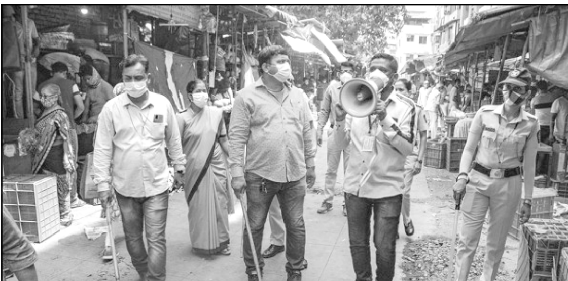
April 21, 2021 nü Thane nung police-i shishilembartem aser dokan kiburtem dang ketdangsertemi tuyuba COVID telatetba nung ajemdaker dokantem shibangtsü tuyuba noksa nung angur.

Bodhbarne ICMR-i ashiba agi, linük nung tang tashi nung coronavirus samples ajak agi 27,10,53,392 tendangogo aser iba nungji April 20 nü samples 16,39,357 tendangba densema lir.