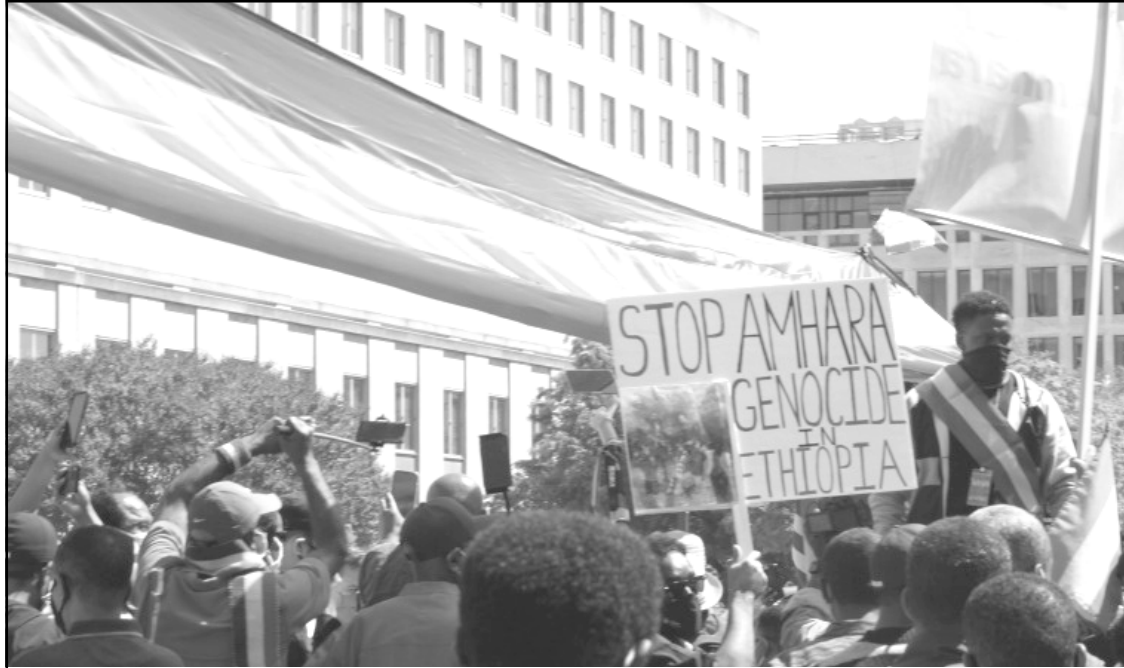
Washington, April 20, 2021: Mongolbarnü Washington nung U.S. State Department kima lokti adenshia Ethiopia nung Orthodox Khristan em anema inyakba nok dangtsü atema takhangba agüja longkak aitba noksa nung angur.

Washington D.C, April 21 (Agencies): Tang Ethiopia linük nung Amhara nung aser Orthodox Khristan em anema inyakba ajanga nisung meyrjang aika jenshiba mapang nung Mongolbarnü Washington D.C nung U.S. State Department kima lokti tuluka adenshia Ethiopia nung Khristan em anema inyakba nok dangtsü atema sorkar nem takhangba agüja longkak aitogo.