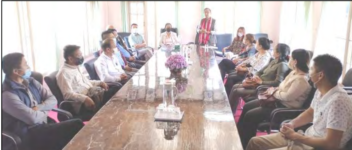
Land Resources Department (LRD), Government of Nagaland aser Kohima Science College (KSC) na tsüngda April 21 nü Directorate of Land Resources nung tenangzüktepba agiba sentong nung agiba noksa nung angur.

Dimapur, Rongchii/April 22 (TYO): Land Resources Department (LRD), Government of Nagaland aser Kohima Science College (KSC) na tsüngda April 21 nü Directorate of Land Resources nung tenangzüktepba ka yangluogo.