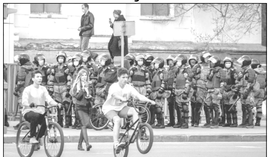
Tepuokdak yua alisang opposition lenir Alexei Navalny busema Moscow, Russia anüdoklen kilometer 6,100 pilar Khabarovsk jila nung longkak aittsü teimla nung Russia police tem renemshir nokdaka aliba noksa ka yangi angur.

"Pa (Putin) ya kidanger tamajung lir... khen-khen bo lendong keta lir, saka pa tang tashi lir asünung asenoki maneni jembishinütsü nüngdaker," ta Le Drian-i ashi. "Ukraine anema mitkartemi mera agitsü Russia tejangraba mali ta nibo bilemer, saka arrtsü nung sepaitemi yagi lendong ajurur." Ukraine anüdoklen arrtsü aser Crimea nung Russia sepaitemi yokba atema Ukraine-i alima teyari bushir, koba Kyiv nungi 2014 küm rakzüka liasü. Alexei Navalny tepuokdak ayuba anema Russia nung nisung meyririjang aikati temelaba melie Bodhbarnü longkak aita liasü. Parnoki tepuokdak alisang Navalny temang timi anepaluang, ta takhangba agütsür, kong longkak aiter nisung 1,000 dak tema puogo, ta osangtem ajanga ashi. February ita tepuokdaka yoksang arishi küm 44 tain Navalny ya teperem anguba aser tetsüng pezüba asoshi temang anepalutsü akhanger. Moscow yimti nung tulutiba longkak aita liasü, saka danga yimti tulutem nunga longkak aita liasü. Aser item rongnung Far East nung St Petersburg, Vladivostok, Siberia nunga yimti kar nung aser Navalny pua aliba Vladimir yimti nunga longkak aita liasü. Aikati Bodhbarnü longkak