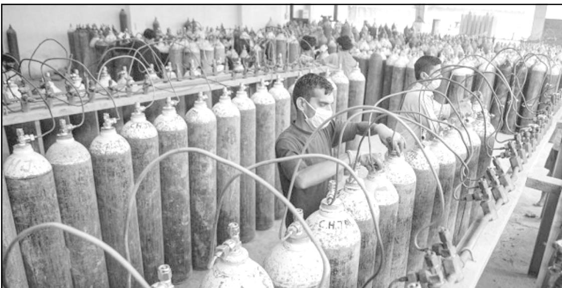
Jalandhar, April 22, 2021: Brihostibarnü Jalandhar nung aliba Shakti Oxygen Refill Plant nung hospital balala nung coronavirus tashidak agi shirangertem atema cylinders nung medical oxygen inokba noksa nung angur.

Iftar nung aluyimertemi coronavirus tenokdangba alema benshiogo, ta aitsüba dak sendakba nung Tikait-i, "Iba mapang nungji aluyimertem kanga pilar amen. Sorkari nisung 50 tashi adenshitsü temelaba agüja lir. Parnok 22-35 shi dang liasü aser parnok shinga majurutep mesüra mesalem," ta ashi.