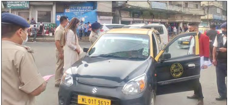
Kohima District Task Force (DTF)-i April 22 nü Kohima jila nung COVID 19 inyakyim asadanga reprangba noksa nung angur.

Dimapur, Rongchii/April 22 (TYO): District nung COVID-19 tashidak prokshia aoba nokdangtsü atema jenjang agitsü asoshi state sorkari tetuyuba agütsür aliba dak ajemdaker Kohima District Task Force (DTF)-i April 22 nü Kohima jila nung COVID 19 inyakyim aser talisa mask asemba yimya shidak benoka inyaker minyaker, aji asadangogo. Kohima District Task Force (DTF) nung District Administration, Police aser Dobashi tem densema lir.