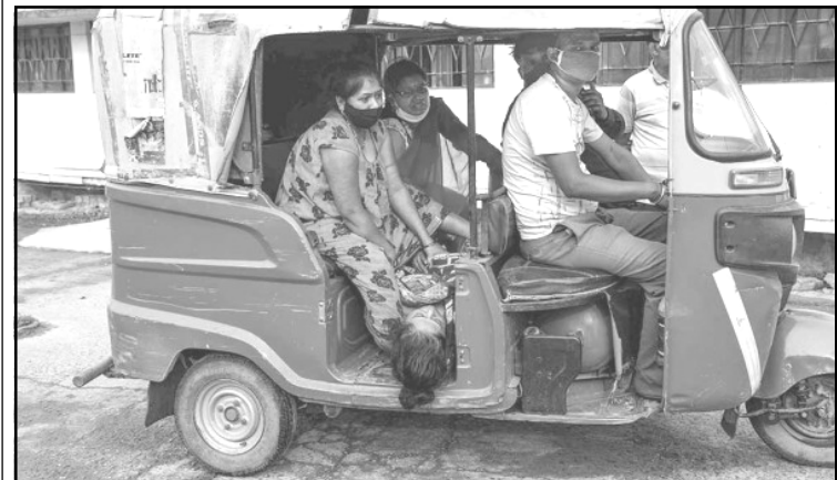
Patna, April 22, 2021: Brihostibarnü Patna nung coronavirus agi shiranger ka auto rickshaw ka nung hospital-i anir aruba noksa nung angur. Patna nung aliba hospital balala nung doctor aser paramedic staff 700 tema dak coronavirus putetogo.