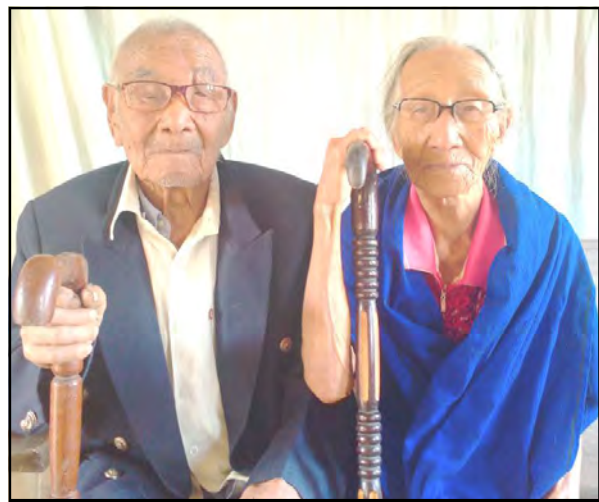
23 rd April 1943 - 23 rd April 2021