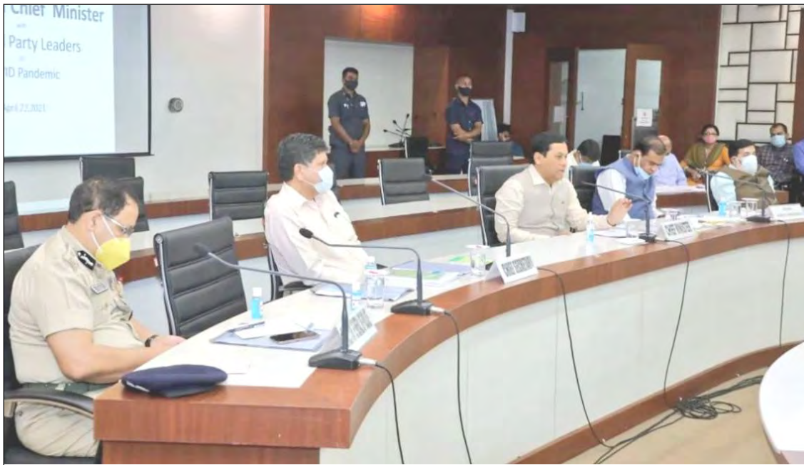
Guwahati, April 22: COVID-19 tensa dak sendakba nung Bresthibarnü Guwahati nung Assam CM Sarbananda Sonowal lenisüba nung all-party senden ka menogo. Assam nung political party balala nungi lenirtem den senden amenba mapang Sonowal-i state nung COVID-19 dak sendakba ken o balala benoka sensaksema liasü.