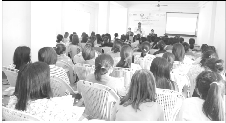
April 19 nungi tenzüka anogo asem nü India Hypertension Control Initiative (IHCI) indang training ka yangi IDSP Conference Hall, CMO, Mokokchung nung akadang tangokba noksa nung angur.

Dimapur, Rongchii/April 22, 2021 (TYO): IDSP Conference Hall, CMO, Mokokchung nung April 19 nungi 21, 2021 - anogo asem tashi India Hypertension Control Initiative (IHCI) nung training ayonga agiogo.