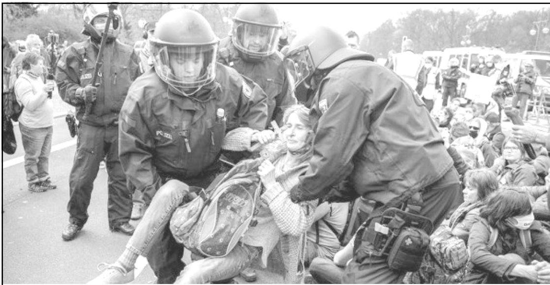
German sorkari coronavirus tashidak wara den raratsü sentong yangluba anema Berlin, Germany nung nüburtemi longkak aيتدang police temi longkak aiter ka ajunger aoba mapang tangokba noksa nung angur. Germany nung coronavirus tashidak den raraysü asoshi sorkar nem tashi tali agütsüsü atema parliament-i telemtetba agiogo.