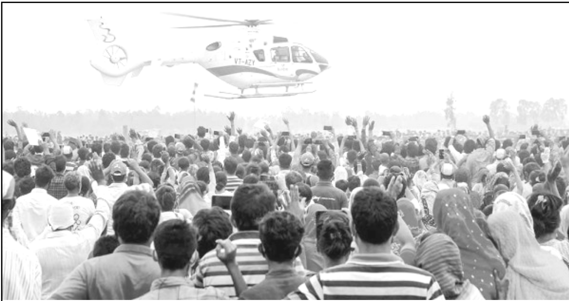
April 22, 2021 nü South Dinajpur district nung West Bengal assembly election nüboyim sentong ka nung shilem agitsü atema West Bengal Chief Minister aser Trinamool Congress tongti lenir, Mamata Banerjee helicopter ka nung aruba noksa nung angur.