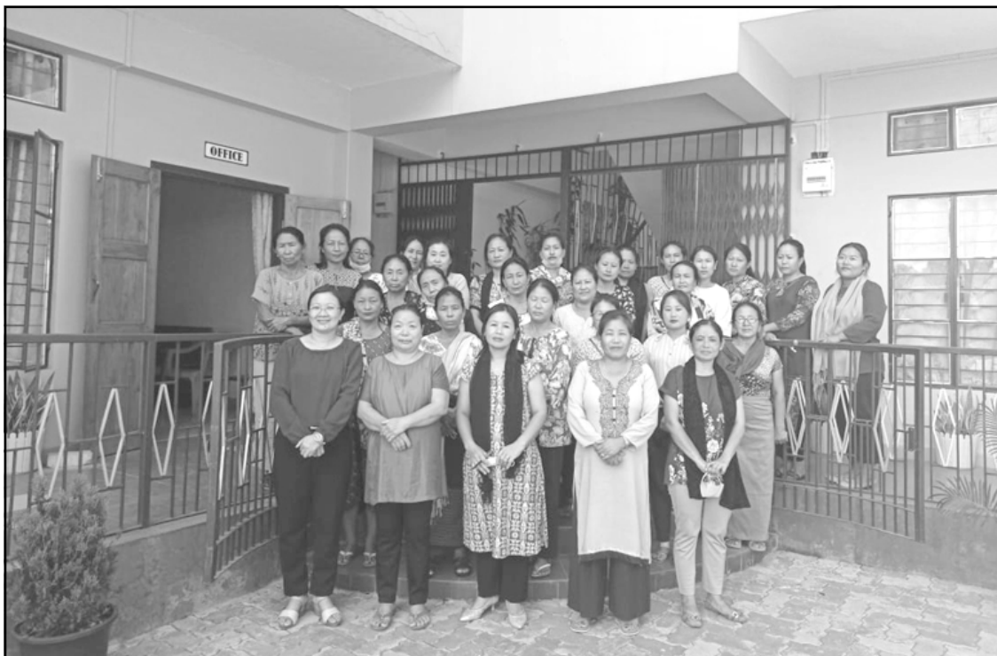
Mangkolemba Baptist Arogo Women Ministry ajanga Sisterly Care sentong ka April 24-25, 2021 anogotem Mangkolemba Baptist Arogo nung Bolen Baptist Arogotsür aser Longjemdang Baptist Arogotsür atema ayongzüka katsü.

Iba dak sendakba nung Nettleton-i alima tesem ajaklen Khristantem dang Pakistan nung Khristantem atema sarasademdaksünertemi mepishia metetdaksü.