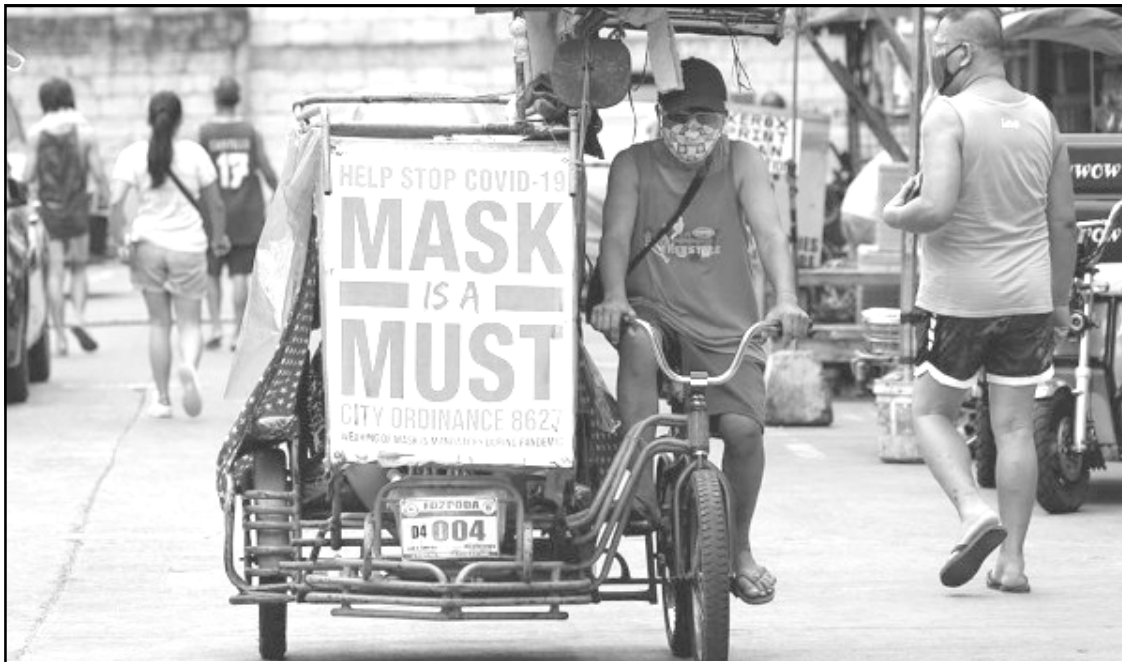
Manila, Philippines nung nisung kati pedicab ka anir senzuba noksa nung angur, kong nubur dang coronavirus tashidak menashia aoba nungi kumzüksü asoshi mask agiang, ta shia lir. Philippines nung COVID-19 tashidak agi Hombarnü tashinung nisung million ka dak tema menepogo aser ketdangsürtemi Manila aser anasa aliba province tem nung lockdown atsülangtsü asü mesüra salatsü, ta asadanga mapang ka lir.