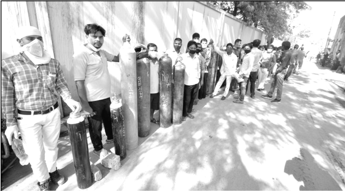
Lucknow, April 26, 2021: Hombarnü Lucknow nung Oxygen filling centre ka nung coronavirus tashidak agi shiranger kinüngertem cylinders nung medical oxygen inoktsü atema atatepba noksa nung angur.