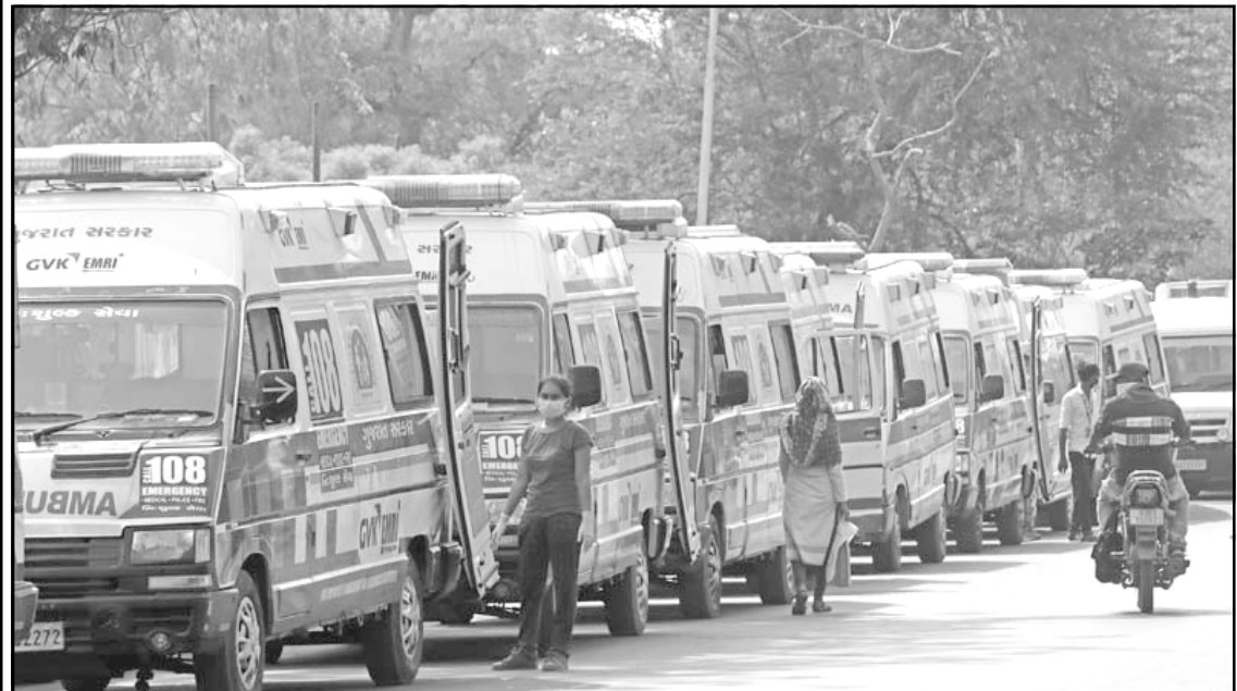
Ahmedabad, April 26, 2021: Hombarnü Ahmedabad nung aliba sorkar hospital ka kima ambulance nung coronavirus tashidak agi shirangertem anir aruba sülen hospital nung anioktsü atema atatepba noksa nung angur.

Uttar Pradesh aser Assam nati mezüng tain ajak nem coronavirus vaccine angati agütsütsü, ta sangdongba sülen Kerala, Chhattisgarh, Bihar, Madhya Pradesh aser Sikkim state temia coronavirus vaccine angati agütsütsü, ta sangdong. Tang tesüsa Delhi, Maharashtra, Gujarat, Odisha aser Rajasthan state temia vaccine angati agütsütsü, ta sangdongogo.