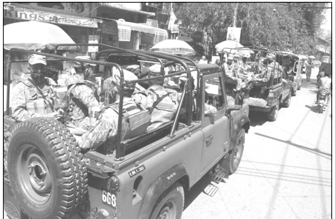
Coronavirus tashidak prokshia aoba azüoktsü asoshi sorkari shishilembar atema tenokdangba tasen sangdongba mapa kuma inyaksü atema Lahore, Pakistan nung mitkartem yimti sema jajaba noksa nung angur. Pakistan nung coronavirus tashidak agi nisung menepba aser asüba tali akumba mapang ketdangsürtemi mozüki nung yipten aser ventilator tali inoksemstü arrsangba mapang lir.