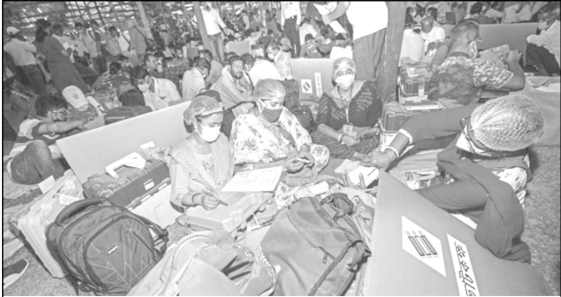
April 29, 2021 nü West Bengal nung election shilem 8buba (tatembangbuba) agitsü lia Brihostibarnü Birbhum district nung polling officials-i EVM aser tanga osettem reprangshiba noksa nung angur.

New Delhi, April 28 (Agencies): Brihostibarnü West Bengal nung assembly elections shilem 8buba agia election tembangtsü; tang state nung coronavirus kanga prokdar, anungji covid anema tetuyuba balala shidak benshia election agitsü.