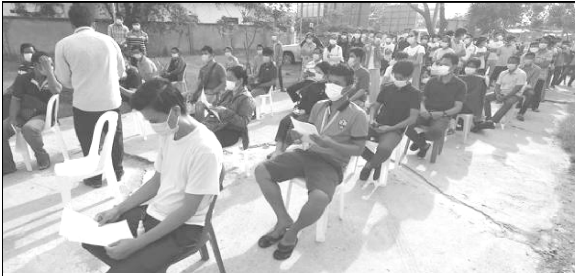
Phnom Penh, Cambodia tezulen mozü agiba tesem ka nung yimdaklirtem Sinopharm COVID-19 mozü dose tanabuba agitsü atatepba mapang tangokba noksa ka yangi angur. COVID-19 cases kanga sashia akumba ajanga Cambodia nung tawa ang capital region shibang aser yangji sorkari nüburttem dang chiyongtsü alitsü atema ki yutsür mao tajungba, ta ashiba sülen nüburttem nem chiyongtsü ki tonga bener arua agütsüsü atema online store tem lapoka lir.