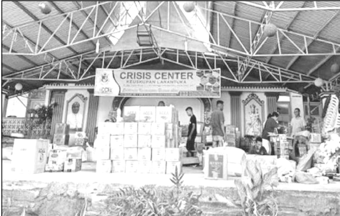
Indonesia nung 'Seroja' cyclone lendong atalokba sülen iba yipru agi kongshirtem yaritsü atema East Nusa Tenggara province nung aliba Larantuka Arogo nung renemshiba noksa nung angur.

April 28, 2021: Khristan telok-Caritas Indonesia (Karina)-i tawa anüdoklen aliba province nung yipru mopung tesashi agi kongshirtem nem ki sütsütsü, ta sangdongogo.