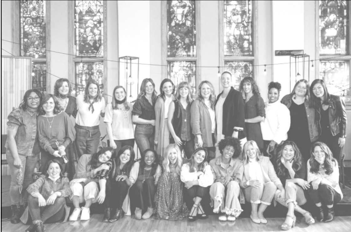
May 1, 2021 aonung Faithful project Livestream nung shilem agir kentenertem aser kaketzülurtem külemi tangokba noksa nung angur.

May 02, 2021: Laishiba otsü nung aliba tetsürtem nungtem nung osangtajung kentener Amy Grant densema tetsür kentenertem aser kaketzülurtem longjemer Faithful Project tenzük; iba project nung otsütem aser kentem densema lir.