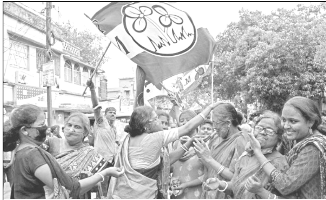
May 02, 2021 nü West Bengal state assembly elections osang sangdongba anogo nung TMC-i takok anguba sülen Birbhum nung TMC pusemertem benjungtepba noksa nung angur.