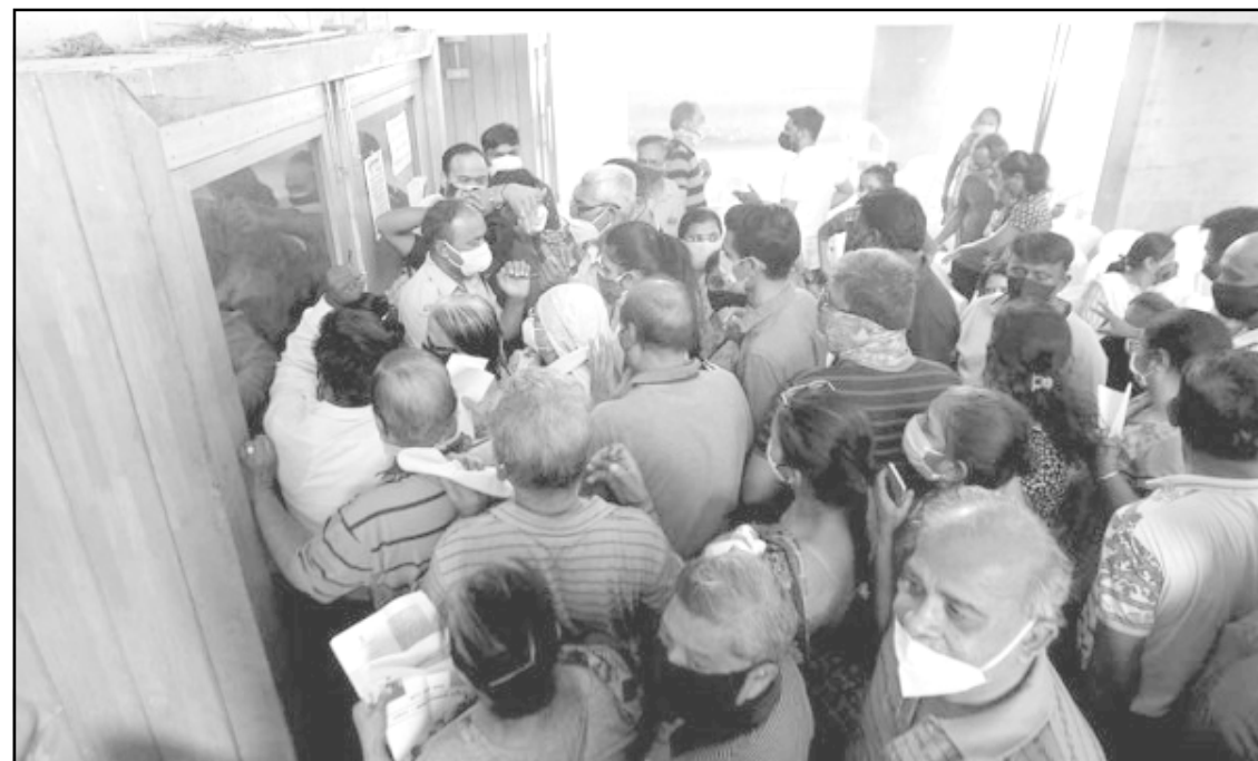
May 02, 2021 nü Ahmedabad (Gujarat) nung aliba Vaccination centre ka nung coronavirus vaccine atemba sülen nisungtemi ketdangsertem den raraba noksa nung angur.

"Ni nisung ajak nem tenüngsang agütsür. Ni Bengal nüburtem dang pelar. BJP-i tesempatsü politics asayayonga parnoki election nung tamakok nguogo," ta laisa shisem.