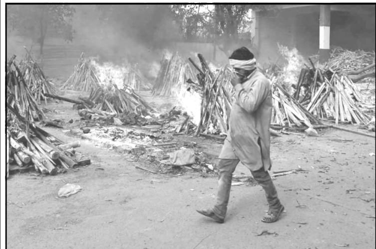
May 02, 2021: Amongnü Delhi nung aliba Ghazipur cremation ground nung coronavirus tashidak agi asürtem rongdokba noksa nung angur. Tesüiba ghonda 24 tsüngda Delhi nung coronavirus tashidak agi shiranger 412 süogo.

May 4-6 anogotem nung Kerala aser Mahe nung, May 4-6 nung interior Karnataka aser May 5 nü Karnataka tzüyinkümlen tesem kar nung tzünglu sashia arutsü, ta India Meteorological Department-isa metetdaksü.