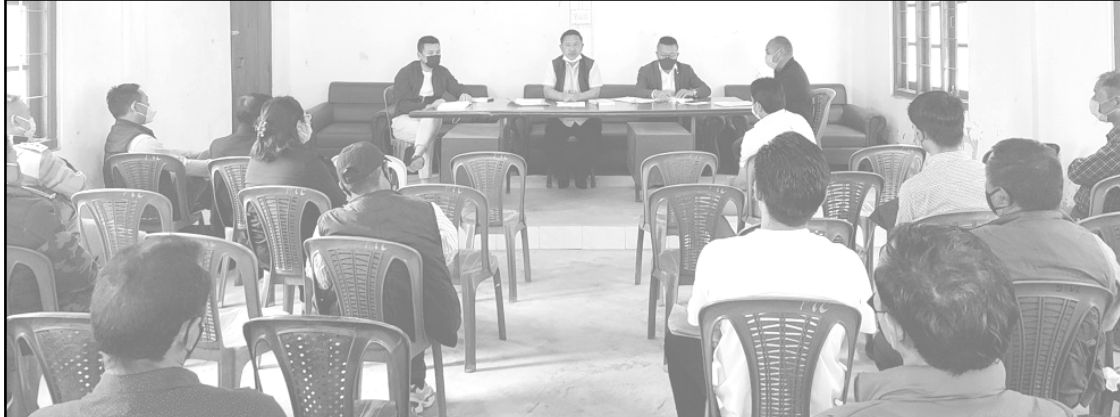
Block Level Task Force on COVID-19 senden ka ADC, Pfutserto indang Conference Hall nung May 03, 2021 nü ADC Pfutsero menden sür amenba mapang tangokba noksa ka yangi angur.

Dimapur, Monupii/May 05 (TYO): COVID-19 tashidak wara nungji jembua alitsü atema state sorkari teinyakstütem sangdongba nung ajemdaker Block Level Task Force on COVID-19 senden ka ADC, Pfutserto indang Conference Hall nung May 03, 2021 nü ADC Pfutsero menden sür mena liasü.