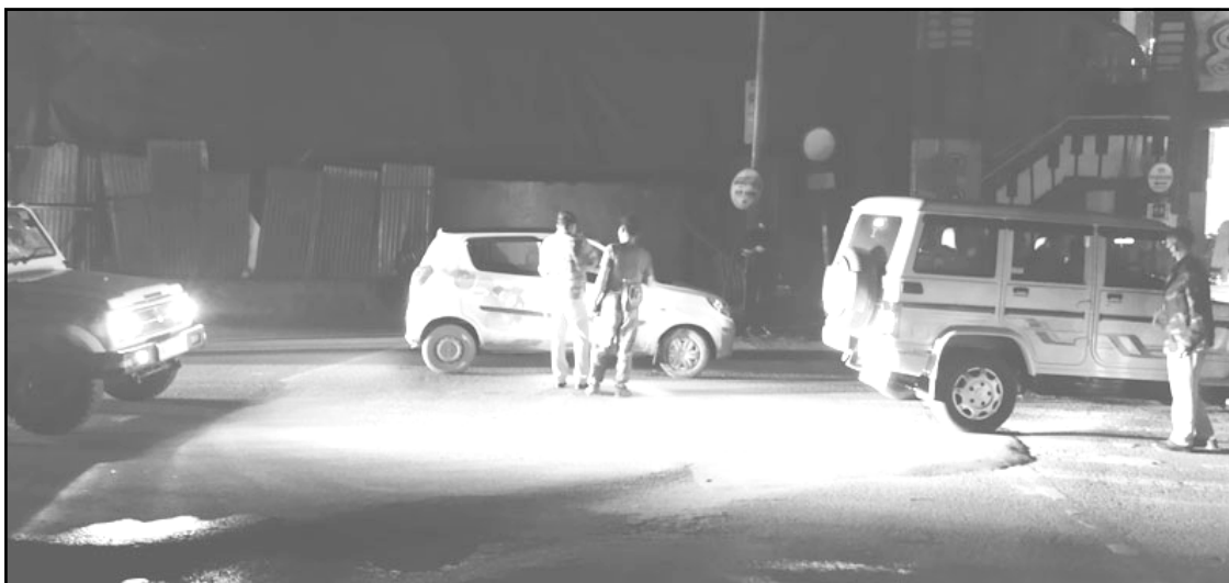
Kohima, Monupii/May 05: Kohima nung May 5, 2021 aonung nungi 'Night curfew' tenzüka mapang police temi gari aser nüburtem senzüsempongba nokdangba noksa nung angur. State yimtiba nung COVID-19 cases kanga kera zünba mechi aser state sorkari Kohima Municipal Council kübok aliba tesemtem 'containment zone' ta sangdongba yong Kohima district administration ajanga municipal ward 19 aser New Capital Complex küboki aitiba colony tem nung May 5, 2021 aonung nungi 'Night curfew' ya benoker.

Danga nung aliba shiranger temia 'prescription' den mozü abeni arutsüpur tenüng aser mobile number tem WhatsApp number 9612633069 dangi yoker mozü ya abeni arutsü akok, ta ash.