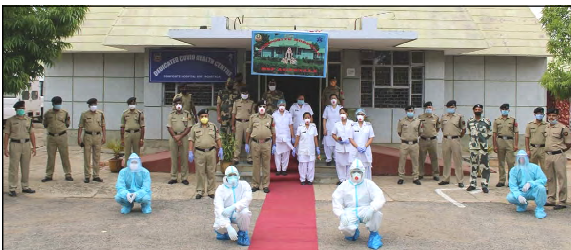
BSF Tripura Frontier-i Covid Care Centre 12 lapok

Agartala, May 5, 2021 (Agencies): Tripura nung Covid19 kanga prokshiba mapang ka nung BSF Tripura Frontier-i Covid Care Centre 12 tashi lapokogo.