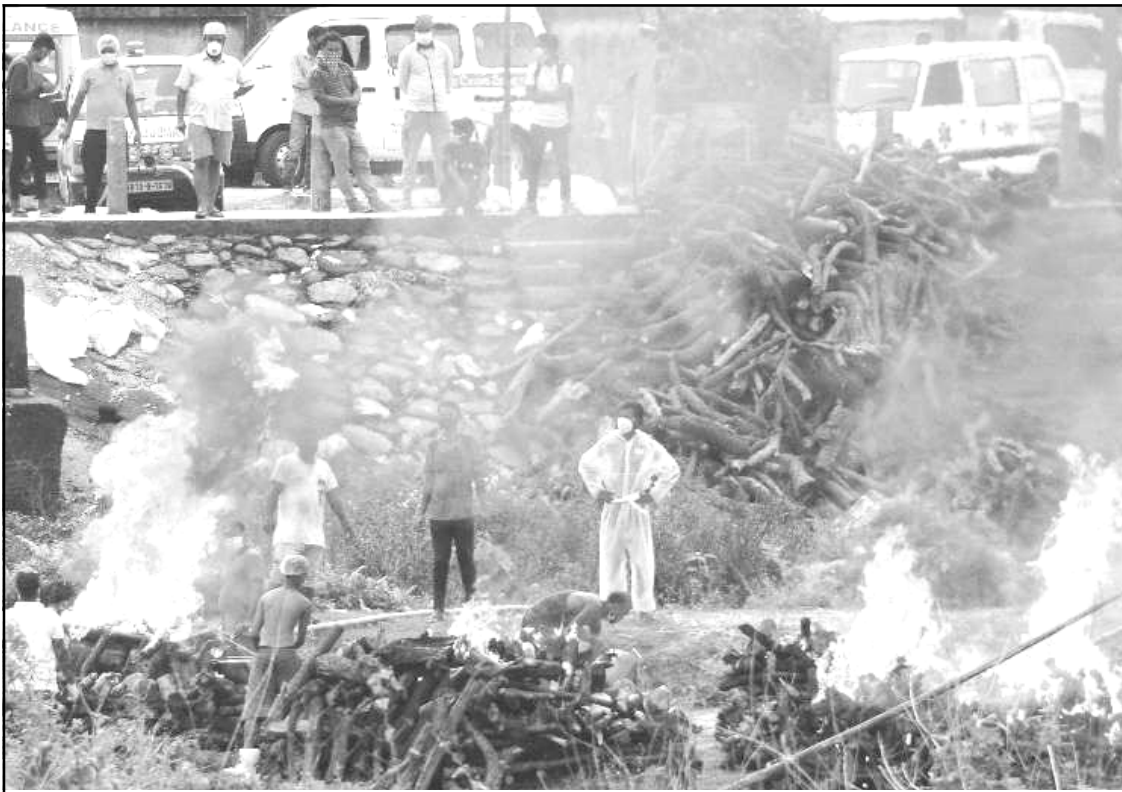
May 4, 2021 nü Siliguri anasa Sahudangi Crematorium nung coronavirus tashidak agi shiranga asürtem tasümang rongdokba noksa nung angur.