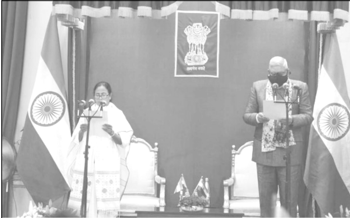
Kolkata, May 05, 2021: Bodhbarnü Raj Bhavan, Kolkata nung West Bengal Angh, Jagdeep Dhankhar-i ketdangsüa TMC tongti, Mamata Banerjee nem Chief Minister tenangzükba agidaksüba noksa nung angur.

Kolkata, May 05 (Agencies): Bodhbarnü Trinamool Congress tongti, Mamata Banerjee-i tang agi tasembenbuba West Bengal Chief Minister inyaksü atema tenangzükba agiogo.