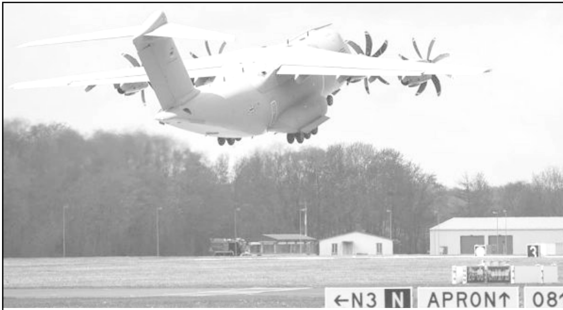
Hanover, Germany anasa Wunstorf nung aliba Wunstorf Air Base nungi Air Force Airbus A400M tayimtsü ka ayamesoba mapang tangokba noksa nung angur. Mobile oxygen production unit aliba German military cargo aircraft ya linük north tsütsü Wunstorf airport nungi India-i apusogo, kong coronavirus agi shirangertem yaritsü.