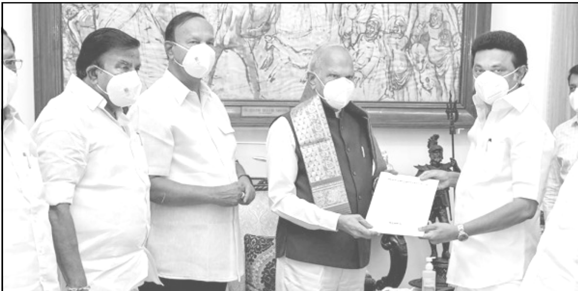
May 05, 2021 nü Chennai nung DMK Tir, MK Stalin aser party lenirtem Raj Bhavan-i oa sorkar akümtsü atema asüngdangtsü asoshi Tamil Nadu Angh, Banwarilal Purohit ajuruba noksa nung angur.

Chennai (Tamil Nadu), May 05 (Agencies): Tamil Nadu nung sorkar tasen akümtsü atema Bodhbarnü state Angh, Banwarilal Purohit-i DMK Tir aser Legislature Party lenir, M.K. Stalin jaoka liasü.