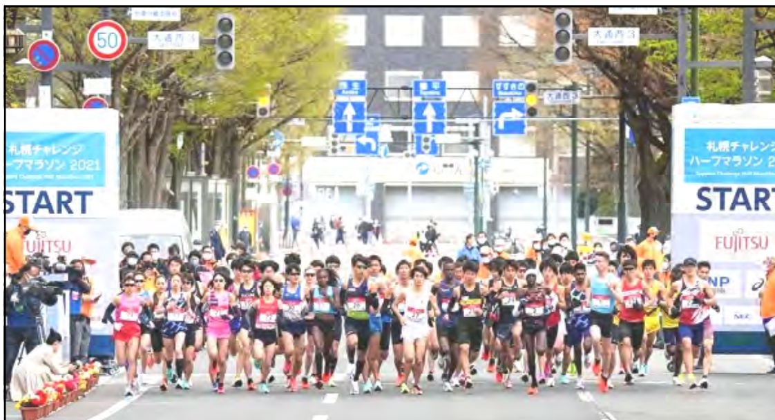
Japan kübok Sapporo tesem nung Tokyo 2020 Olympics test event ka ayongzüka asayaba mapang half-marathon asemtepba noksa nung angur. Track and field world governing body tekolakba Sebastian Coe-i, half-marathon test event ayongzüka agiba ajanga Tokyo Olympic marathon takok ngua agitettsü ta temulung lema bilemba lemsatetogo.

"Roma fan tem tejangraba ajanga iba mapa agizüktsü atema ni ajungmesoa liasü aser taruba season atema matateter," ta paisa ashi.