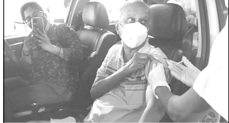
May 05, 2021 nü Mumbai nung 'drive-in vaccination' kübok teintet senso ka nem coronavirus vaccine agütsüba noksa nung angur.

Tesüiba ghonda 24 tsüingda iba tashidak agi asürtemji (3,780) Maharashtra nung 891, Uttar Pradesh nung 351, Delhi nung 338, Karnataka nung 288, Chhattisgarh nung 210, Punjab nung 173, Rajasthan nung 154, Haryana nung 153, Tamil Nadu nung 144, Jharkhand nung 132, Gujarat 131, West Bengal nung 107 aser Bihar nung nisung 105 asüba densema lir.