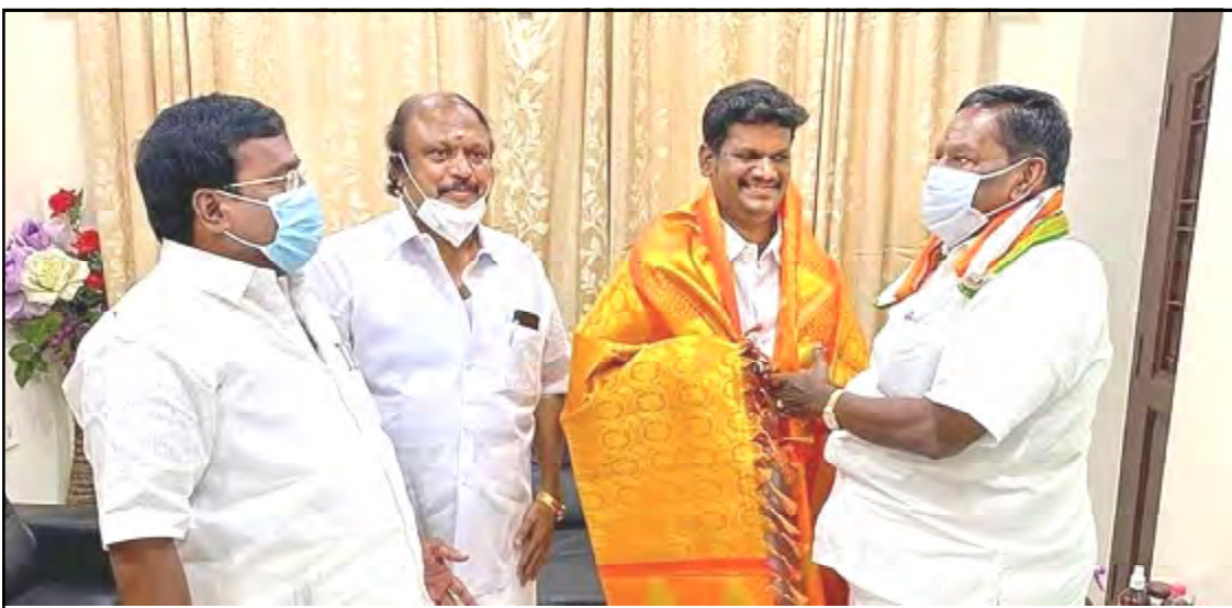
May 06, 2021 nü Puducherry nung taoba mapang Chief Minister, V Narayanasamy-i Congress-DMK teloktep nungi takok angur MLA tem nem tetushi agütsüdang tangokba noksa nung angur.

Delhi nung Petrol litre ka nung poisa 25 aser diesel litre shia nung poisa 20 atuba sülen tang Delhi nung petrol litre ka nung sen 90.99 aser diesel litre ka nung sen 81.42 agi yokdar.