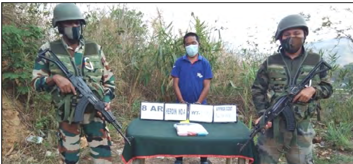
Mizoram, Champhai district kübok Indo-Myanmar arrtsü anasa Zokhawthar-Melbuk lenman nung Assam Rifles aser excise & narcotics department-i Bodhbarnü heroin gram 57.4 puogo. Temesepba mozü ya sen lakh 22.96 alang liasü, koba Myanmar nungi shibelener aruba lir. Shibelensang aser pai bena aliba temesepba mozü ya excise and narcotics department nem bendanga agütsüogo, ta AR ketdangsur kati metetdaksü.

2015 küm January 31 nü pa CBI-i apu. Pa criminal conspiracy, tangar ashiooktsüba aser Saradha Chit Fund scheme nung sen crore 28 mashiymi amshiba atema aija apu.