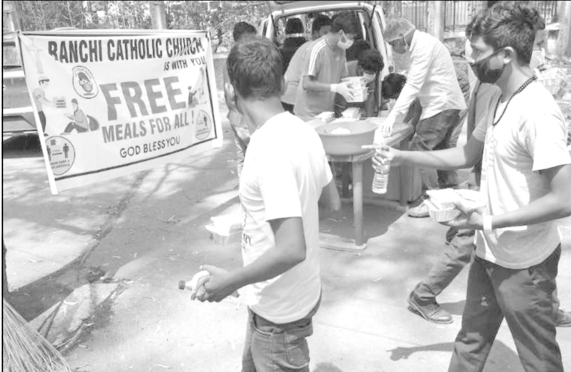
Jharkhand yimtiba, Ranchi nung aliba Catholic Arogoi Rajendra Institute of Medical Sciences kima chiyungtsü lema agütsüba noksa nung angur.

Ranchi, May 06 (Agencies): India anüdoklen aliba state, Jharkhand nung Catholic Arogo kati coronavirus tashidak agi shiranger anüker kinüngertem nem anogo shia chiyungtsü lema agütsü tenzükogo, ta osang ka ajanga metetdaksü.