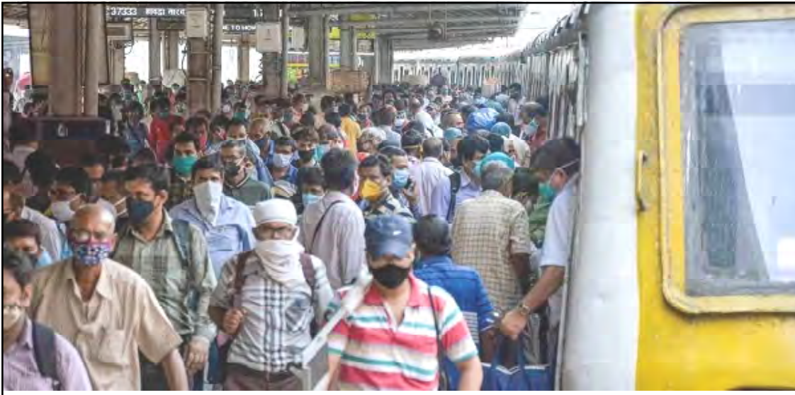
Howrah (West Bengal), May 06, 2021: Coronavirus wara liaka Brihostibarnü Howrah nung aliba railway station ka nung nisungtem kanga anasatepa senzuba noksa nung angur. West Bengal nung wara nokdangtsü atema local train services anentsü.