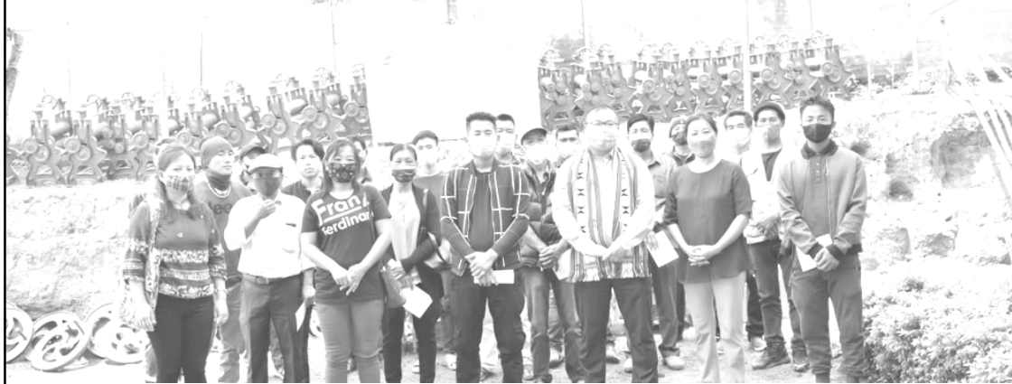
Land Resources Department Peren-i, May 6 nü ADC Jalukie, Dr. Tinojongshi Chang matsüngdang beneficiaries 15 nem Rubber Sheet Roller aser beneficiaries 15 nem Coffee Pulping Machine agütsüogo.

Dimapur, Monupii/May 6 (TYO): Local coffee ajungkettsü aser productivity aser sustainable farming ajungkettsü atema aluyimertem ajungmesotsü asoshi Department of Land Resources, Peren-i May 6 nü DPO Office, Jalukie nung sentong ka ayongzüka agiogo. Iba sentong nung Peren district nung aliba aluyimertem nem Rubber Sheet Roller machine 15 aser Coffee Pulping machine 15 agüja liasü. Iba project atema North East Council (NEC)-i senotsü teyari agüja liasü.