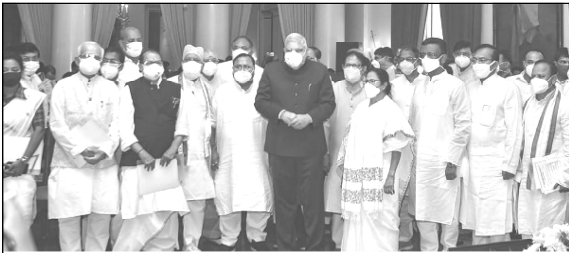
May 10, 2021 nü Raj Bhavan Kolkata nung West Bengal Angh, Jagdeep Dhankar-i ketdangsa Minister tem tenangzükba agidaktsüba sülen tangokba noksa nung angur. Kasa noksa nung West Bengal Chief Minister, Mamata Banerjee-a angur.