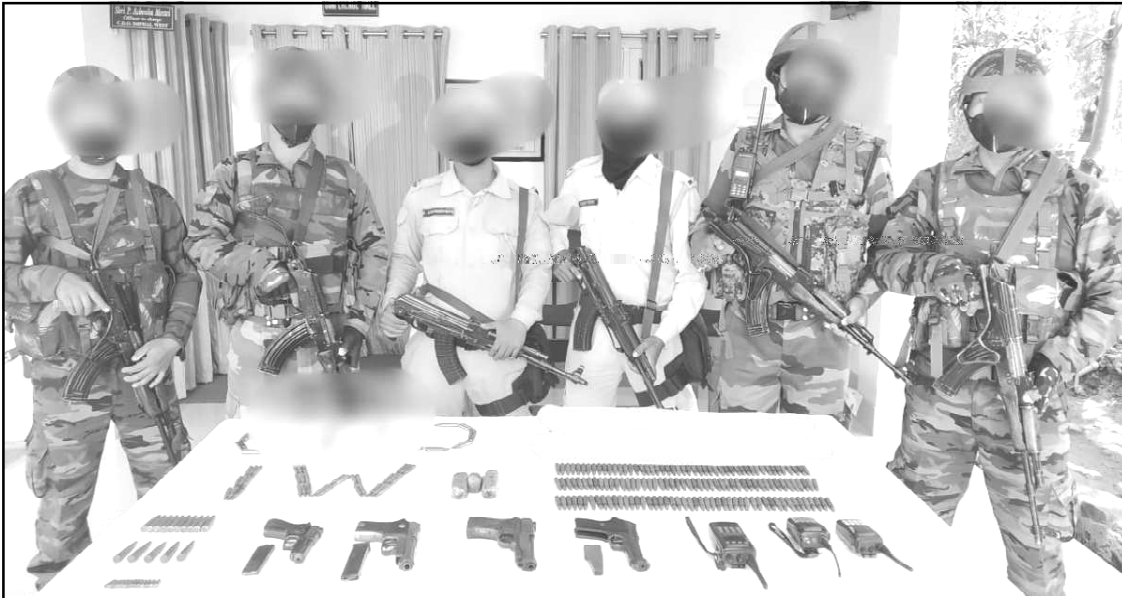
Deobarnü HQ IGAR (south) kübok Mantripukhri Battalion aser Manipur police yaritepa Imphal West district kübok Samurou tesem mita aodang prangpong-injang aika ngutetogo. Osang tejangja ka angazükba sülen parnoki Samurou nung mobile vehicles check post ka mendanga atadang pistol 4, PEK plastic explosives, rifle balala indang injang aser radio set 3 ngutet.