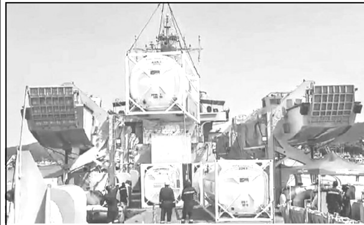
Visakhapatnam, May 10, 2021: Hombarnü INS Airawat rong nung Cryogenic Oxygen tank 8 den Oxygen Cylinders 3,898 Visakhapatnam tonga bener arua aliba noksa nung angur. Oxygen tanks aser Cylinders ya Singapore nungi bener aruba lliir.

Hombarnü Indian Council of Medical Research (ICMR)-i, tang tashi nung linük nung samples 30,37,50,077 tendangogo aser iba nungji Amongnü (May 9) samples 14,74,606 tendangba densema lir, ta metetdaksü.