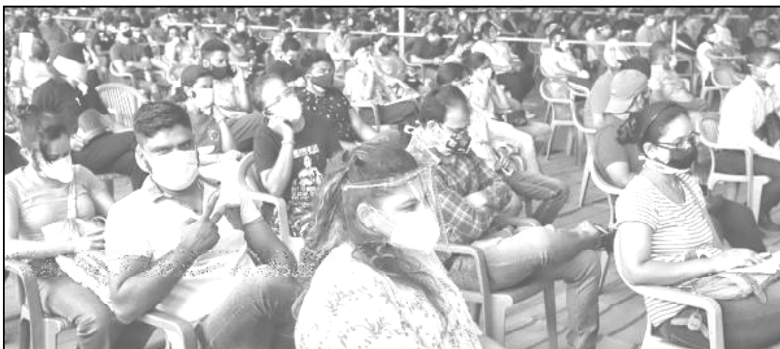
May 10, 2021 nü New Delhi nung aliba BLK-Max Hospital nung arrshi küm 18 ser temapurtem coronavirus vaccine agitsü atema ataba noksa nung angur.

Tang Kerala nung coronavirus agi teshirangdakpur lakh 4.23 lir.