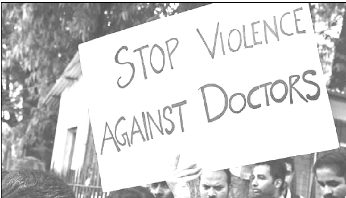
Indian Medical Association-Arunachal Pradesh (IMA-AP)-i lungkak aitiba anenogo. Taoba Hombarnü Naharlagun nung aliba Samaritan Hormin Hospital nung doctor ka dak teka sangshiba aser osettsüet raksatsüba anema IMA-AP aser APDA züingsemtemi anogo ananü lungkak aittsü ayongzuka liasü aser Arunachal Pradesh health minister-i mapa inyaksü nangzükba sülen parnoki lungkak aitiba anenogo. (Itanagar, May 10)

Sorkari tekaratiba nung ADC election agitsü atema bilemer aser mapa inyakdar ta Additional Chief Secretary (TA&H)-isa metetdaksü.