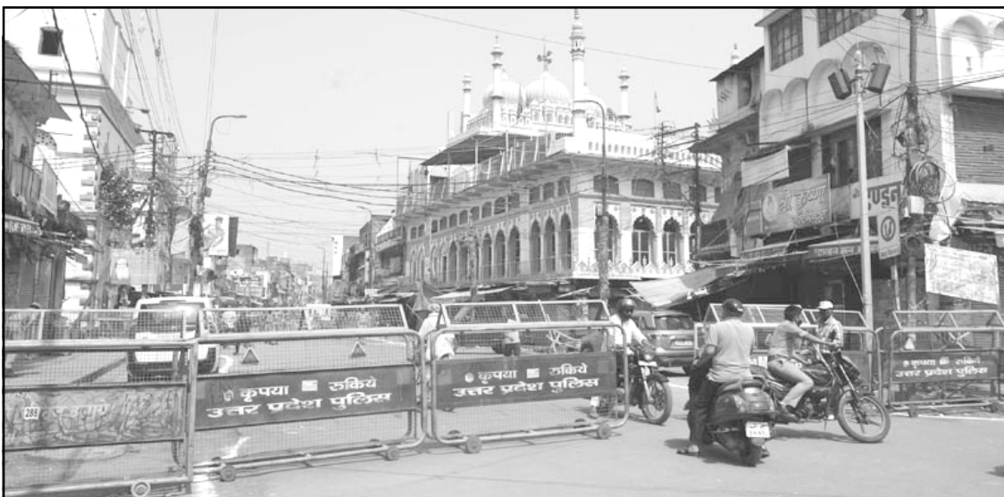
Prayagraj (Uttar Pradesh) May 14, 2021: Coronavirus prokba nokdangtsü atema lockdown aliba mapang Hokolbarnü Prayagraj nung Eid benjung anogo nung Muslim nunger tekülem kidangi aoba (Jama Masjid) lenmang nokdanga aliba noksa nung angur.

Taruba anogo ishika tsüingda lendong atema renema alitsü asoshi National Disaster Response Force, State Disaster Response Force, Indian Navy aser tanga agencies dang tuyuogo.