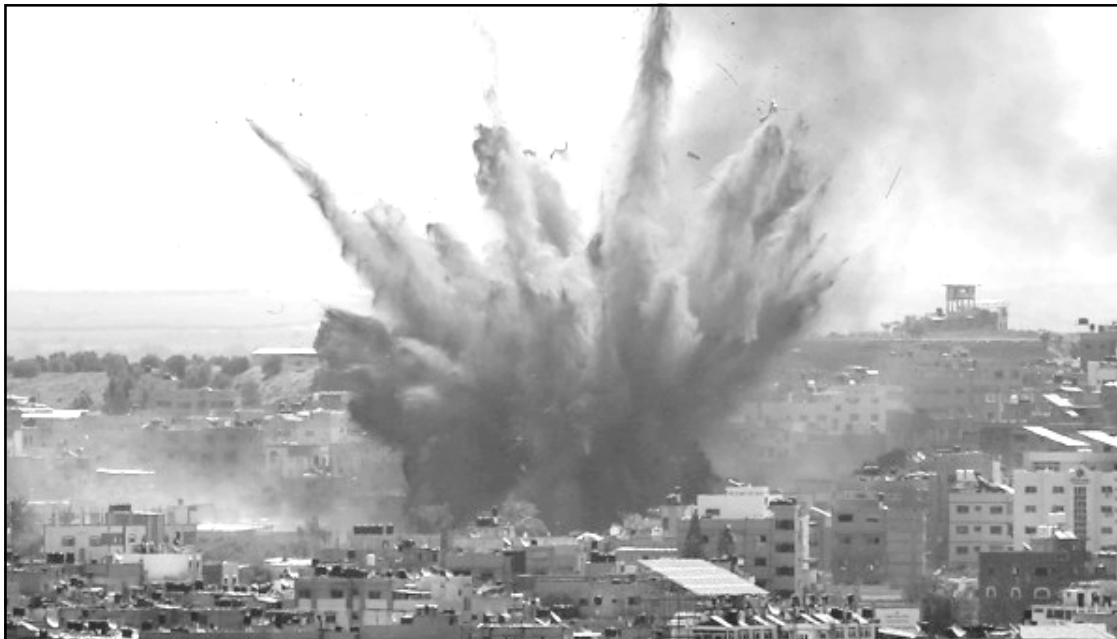
Gaza City nung Israel nungeri tayimtsü amshia amakba sülen ki ka nungi mokozü adokba noksa nung angur. Muslim nunger temeshi ita, Ramadan tembangba mapang Israel linük tesem balala ung Jewish aser Arab nunger tsungta rongrong adoka lir aser Hamas o Israel na rocket tem khaloktsüteper.