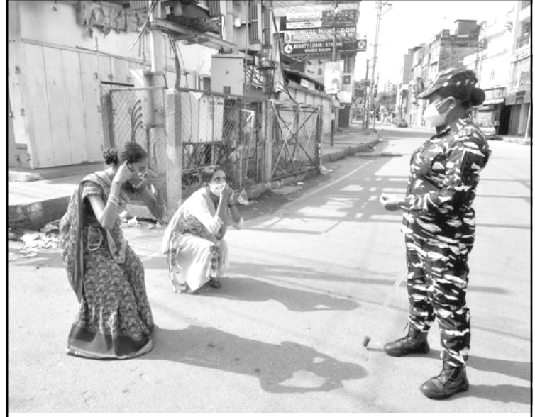
Guwahati nung tetsür anati COVID inyakyim sülen manidakba atema sepai kati merenshiba angur. (Guwahati, May 14)