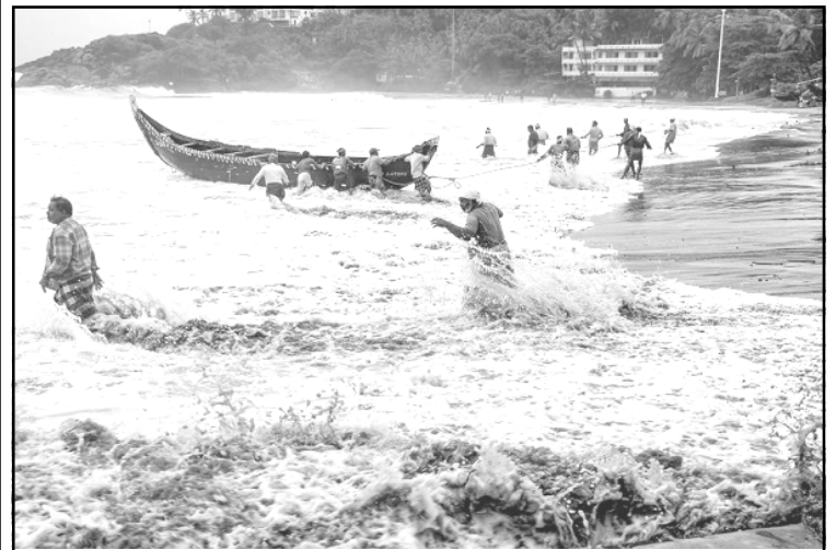
Thiruvananthapuram, May 14, 2021: Arabian tzüyim nung cyclone ka kümetetba atema tekümdangtsü osang ka sangdongba sülen Kerala yimtiba, Thiruvananthapuram nung nisungtemi rong tükümi bener aruba noksa nung angur.