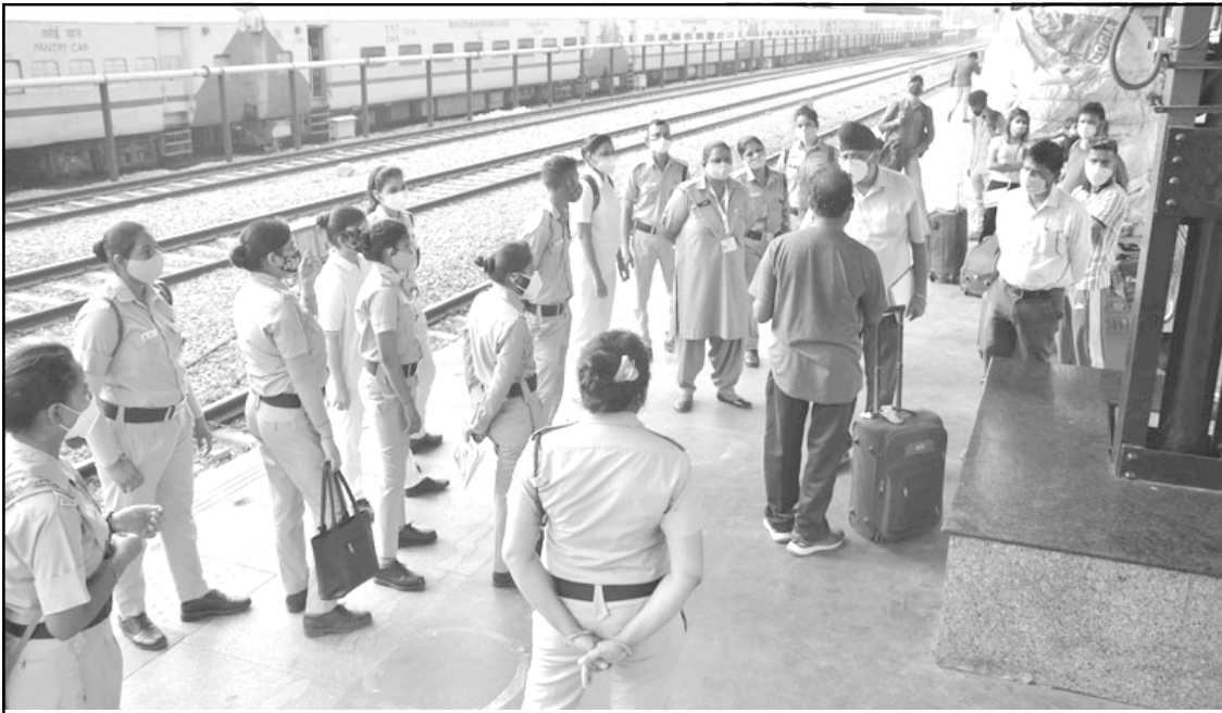
New Delhi, May 14, 2021: Hokolbarnü Delhi sorkar ketdangsertemi Hyderabad nungi train ajanga Delhi nung Hazarat Nizumuddin Railway station tonga arurtem indang RT-PCR report reprangba noksa nung angur.