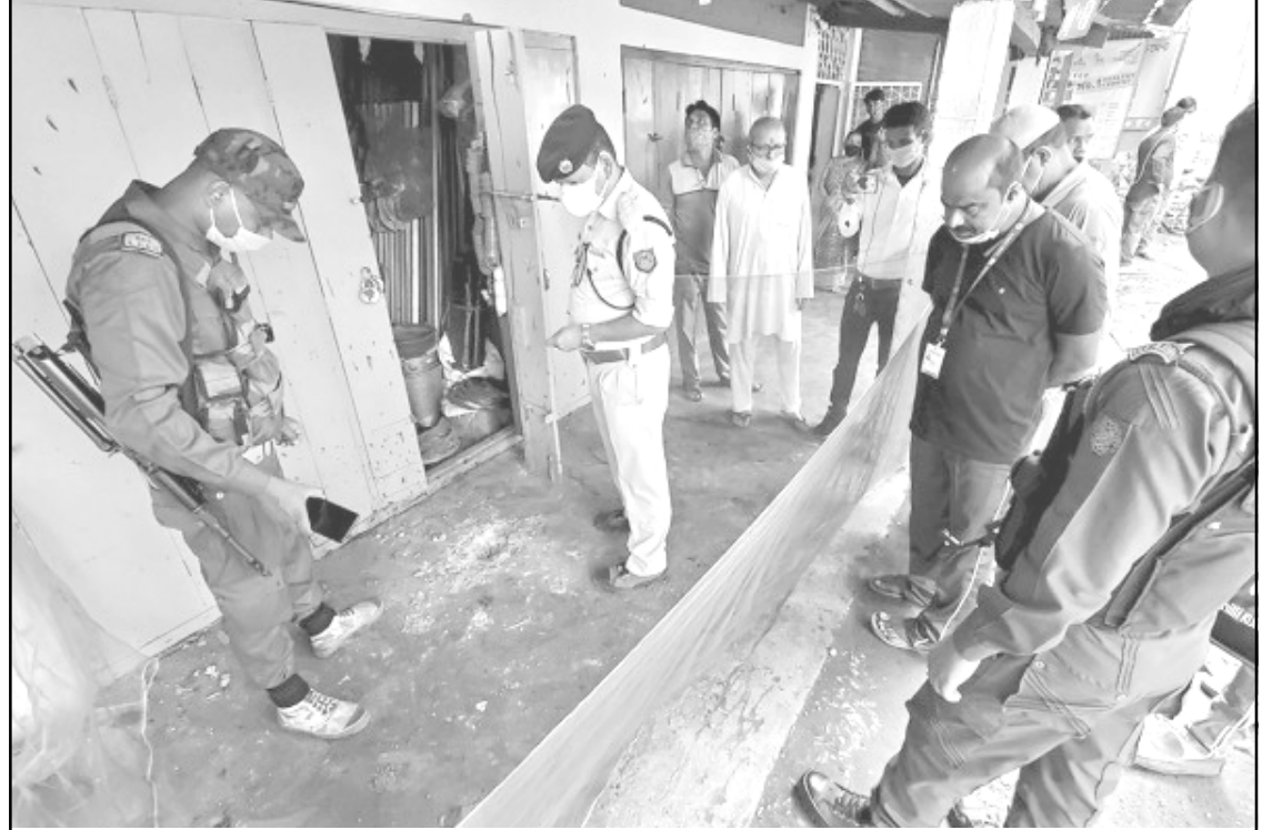
Tinsukia district nung aliba Tingrai Bazaar nung police tem tanü grenade ka apokdak bushisüingdangba angur. (Tinsukia, May 14)

Police Special Branch headquarters nung temai adok. Parnoki Pistol ka den injang round 5 aser NLFT (BM) indang tashiyim agi sen meshiba shiditem bener arua agütsüogo. Par asem ya 2018 küm NLFT (BM) nung aden aser Myanmar o Bangladesh nung training agia liasü.