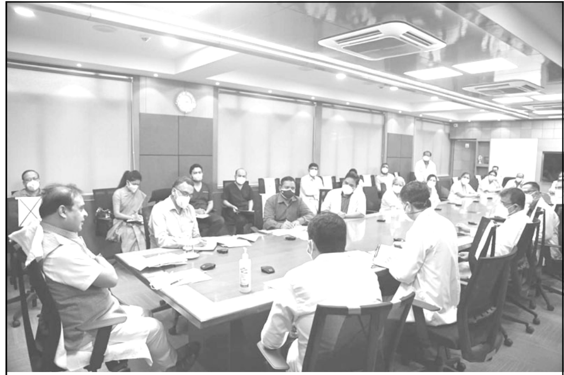
Hokolbarnü Assam Chief Minister Himanta Biswa Sarma-i Gauhati Medical College and Hospital nung COVID-19 atema senden ka ayonga amendang agiba noksa angur. Tanü pai GMCH nung COVID-19 agi shirangertem atema yipden 200 renemba maparen reprangdanga liasü.

Guwahati, May 14, 2021 (Agencies): Assam nung alirtemi lockdown asütsü akok ta bilemba mapang ka nung Chief Minister Himanta Biswa Sarma-ibo state ajungalen lockdown asütsü tebilemba mali ta metetdaksüogo. COVID-19 kanga putetba tesemtem nung lockdown benoktsü akok ta paisa ashi.