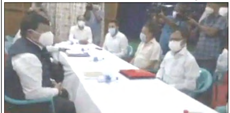
Atul Bora-i Brehostibarnü Guwahati nung AASU (All Assam Students' Union) office - Swahid Nyas semdangba noksa nung angur.

Guwahati, Monupii/May 20 (Agencies): Assam Accord minister Atul Bora-i Brehostibarnü Guwahati nung AASU (All Assam Students' Union) office - Swahid Nyas semdang.