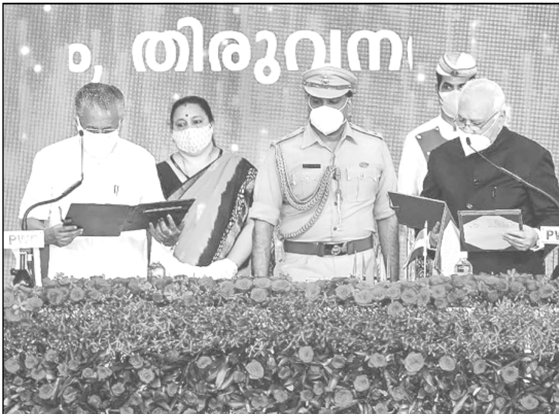
May 20, 2021 nü Kerala yimtiba, Thiruvananthapuram nung Pinarayi Vijayan-i (abelen) Chief Minister inyaktü atema tenangzükba agidang tangokba noksa nung angur.

New Delhi, May 20 (Agencies): Brihostibarnü CPM lenir, Pinarayi Vijayan-i tang agi tanabenbuba Kerala Chief Minister inyaktü atema tenangzükba agiogo.