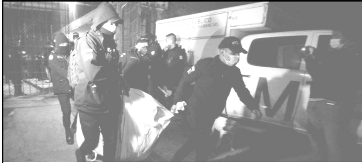
Guatemala City anüolen tsütsü kilometer 205 pilar Quetzaltenango department nung aliba Cantel Prison nung rongrong adokdak asüba tepuokdak alir tasü mang ka police temi bener aoba noksa nung angur.