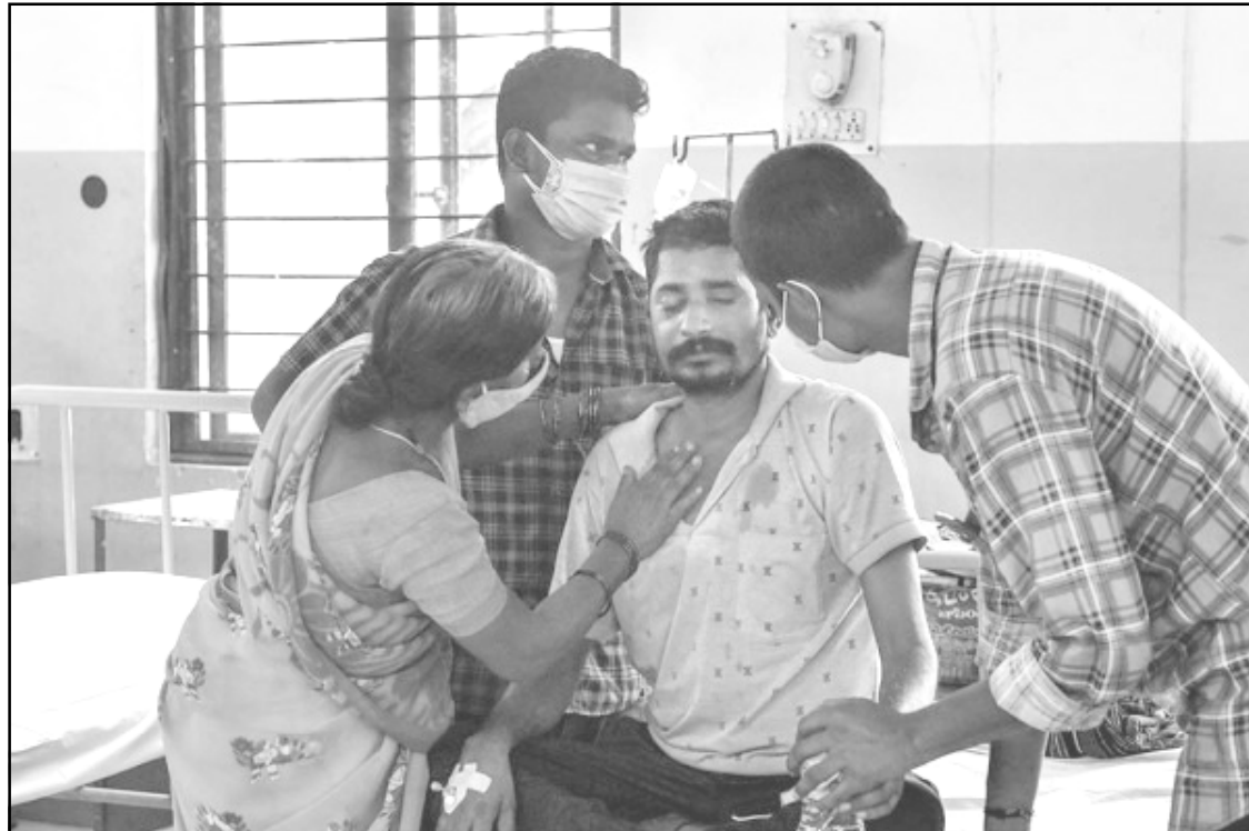
May 20, 2021 nü Hyderabad nung aliba ENT Hospital ka nung Black Fungus agi shiranger ka Mucormycosis ward nung yariba noksa nung angur.

April 29 nungi May 5, 2021 tashi nung linük nung district 201 nung Covid-19 case ajema aküm aser May 13 nungi May 19 tashi nungbo district 303 nung covid case ajema kümogo, ta Health Ministry-isa metetdaktü.