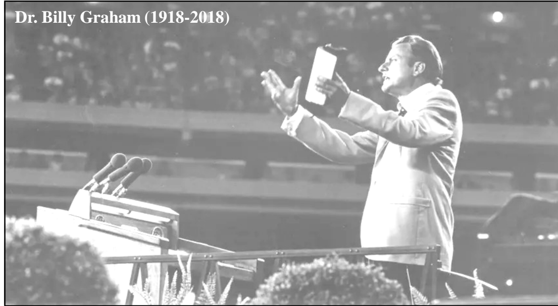
Dr. Billy Graham (1918-2018)

May 18, 2021: Alima nung nungtugu sayutsüngir asür, Rev. Billy Graham-i pa akümüli mapang nung pai sayutsüngiba ajanga nisung million aika Khrista dangi anir arua liasü; pa taküm otsü nung ajemdaker Public Broadcasting Service (PBS)-i documentary tasen ka sayaogo.