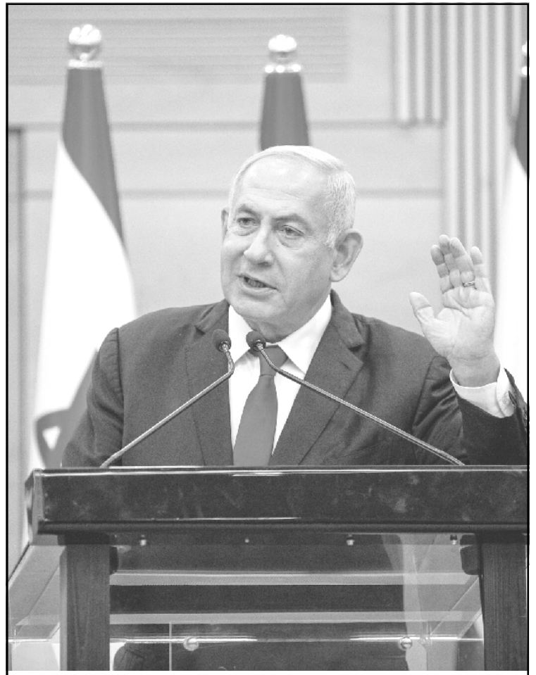
Ato Kilonser Benjamin Netanyahu

Nisung aliba residential tower 184 aser media center 33 aoyi kuma poksatsüogo