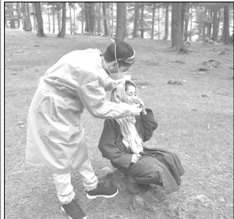
May 20, 2021 nü Budgam district nung door-to-door campaign kübok health worker kati coronavirus tendangtsü atema tetsür ka dak nungi sample agizükba noksa nung angur.

"May 23 nungi iba mopung ya ghonda ka nung kilometer 50-60 tashi kera aontsü; ghonda ka nung kilometer 70 tashia kera aontsü. May 24-26 anogotem nung central Bay of Bengal aser north Bay of Bengal aser May 25-27 tashi nung Odisha-West Bengal-tzüyimkümlen atongtsü," ta IMD-i metetdaktü.