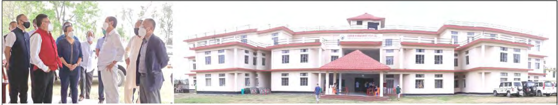
Mongulbarnü Nagaland Chief Minister Neiphiu Rio-i State Institute of Hotel Management, IHM nung Covid-19 makeshift hospital semdangba agiba noksa angur. (Dimapur, May 25)

Dimapur, May 25, 2021 (TYO): Mongulbarnü Nagaland Chief Minister Neiphiu Rio-i Nagaland Police Referral Hospital, Chumukedima nung Covid-19 hospital lapoktsüogo.