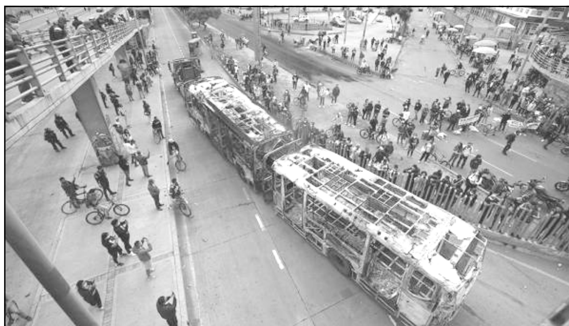
Bogota, Colombia anasa San Mateo nung sorkar anema longkak aitba mapang rongtsüba double car public bus ka gari kati atsür aoba noksa nung angur. Public services, totzü, taa aser pension nung saru temlochtsü atema sorkari ken o benokba sülen Colombia nüburtemi hopta aika yimti-yimtung nung longkak aita jajar.