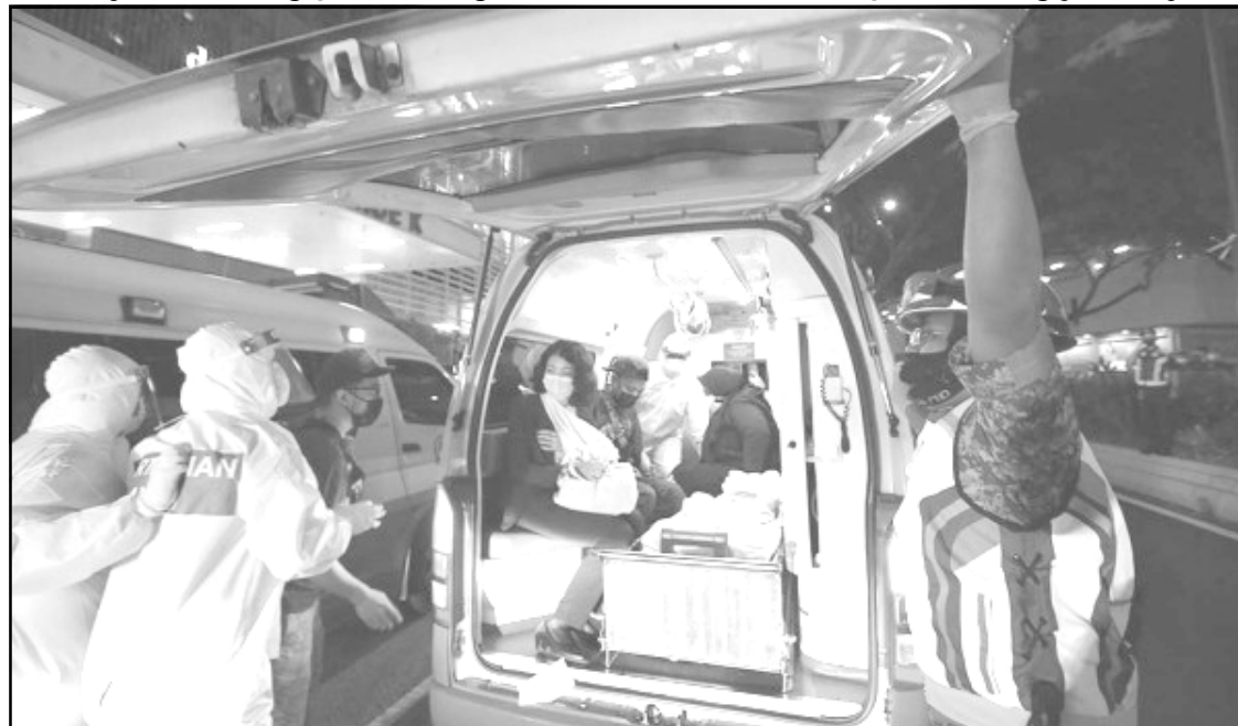
Kuala Lumpur, Malaysia nung KLCC station anasa train ana tsüktepba nungi ketdangsürtemi yirur alirtem anizükba mapang tangokba noksa ka yangi angur. Iba lendong nung nisung 213 dak tema yiru, ta Transport Minister Wee Ka Siong-i ashi.

Kuala Lumpur, Monupii/May 25 (Agencies): Malaysia yimtiba, Kuala Lumpur kübok Petronas Twin Towers anasa lai telung nung lenmang yanglua alidak (underground tunnel) train ana lenmang kasa nung ajurutepa tsüktepba lendong nung nisung 200 dak tema yiru, koba nisungi aibelenba lendong ka lir, ta Transport Minister-i ashi.