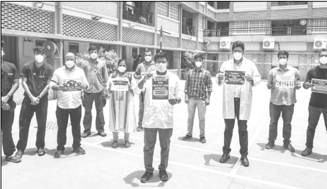
Baba Ramdev-i allopathy dak sendakba nung pa tebilemba lemsatepba sülen, linük ajunga nung Black Day longkak aitba sentong ayongzüka agiba mapang New Delhi nung Federation of resident doctors associations (FORDA) aser Resident doctors Association (RDA) Safdarjung Hospital nungi doctor temi ribbon tanak mesüba noksa nung angur.