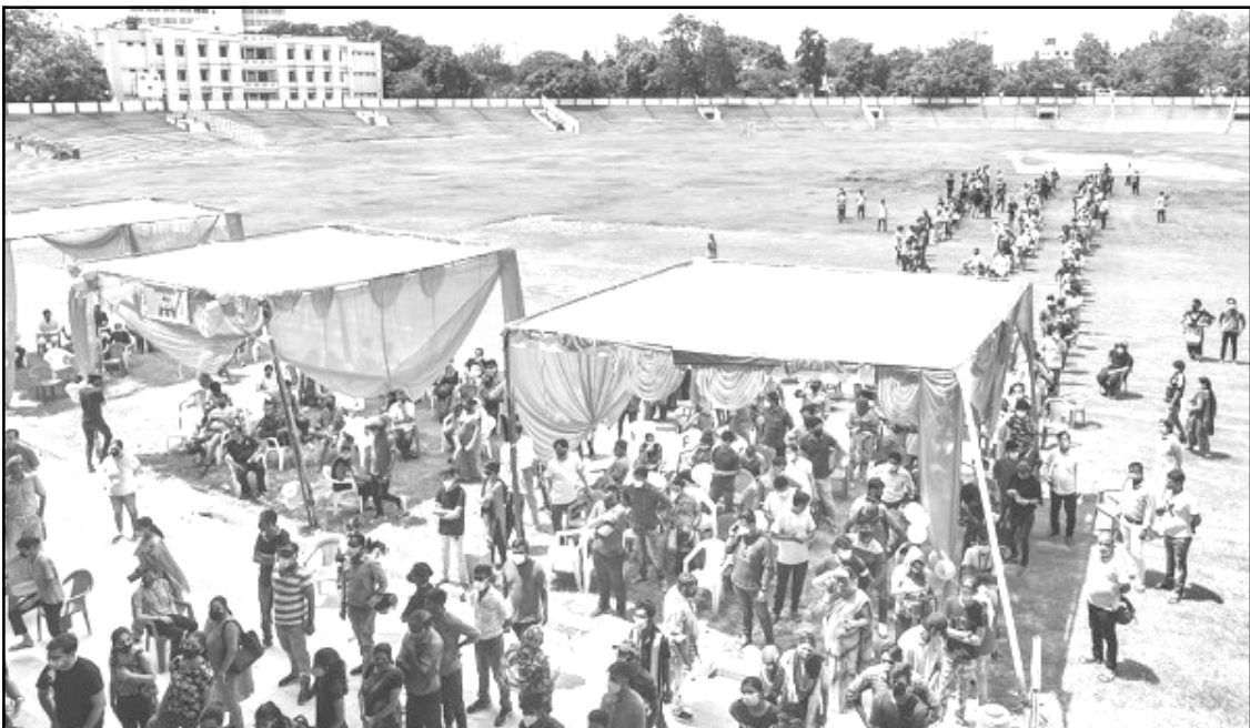
Lucknow kübok K D Singh Babu Stadium nung amenoka aliba COVID-19 vaccination center nung vaccine agitsü atema nüburtem tarensena nokdaker aliba noksa nung angur.