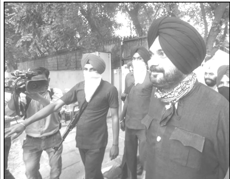
New Delhi nung Congress panel on Punjab den senden amenba sülen Punjab Congress MLA Navjot Singh Sidhu Congress 'war room' nungi adokba noksa nung angur.

Uttar Pradesh nung Assembly election 2022 küm agitsü. Iba state nung Lok Sabha menden 80, assembly menden 403 aser nütsünyongsük million 200 dak tema lir.