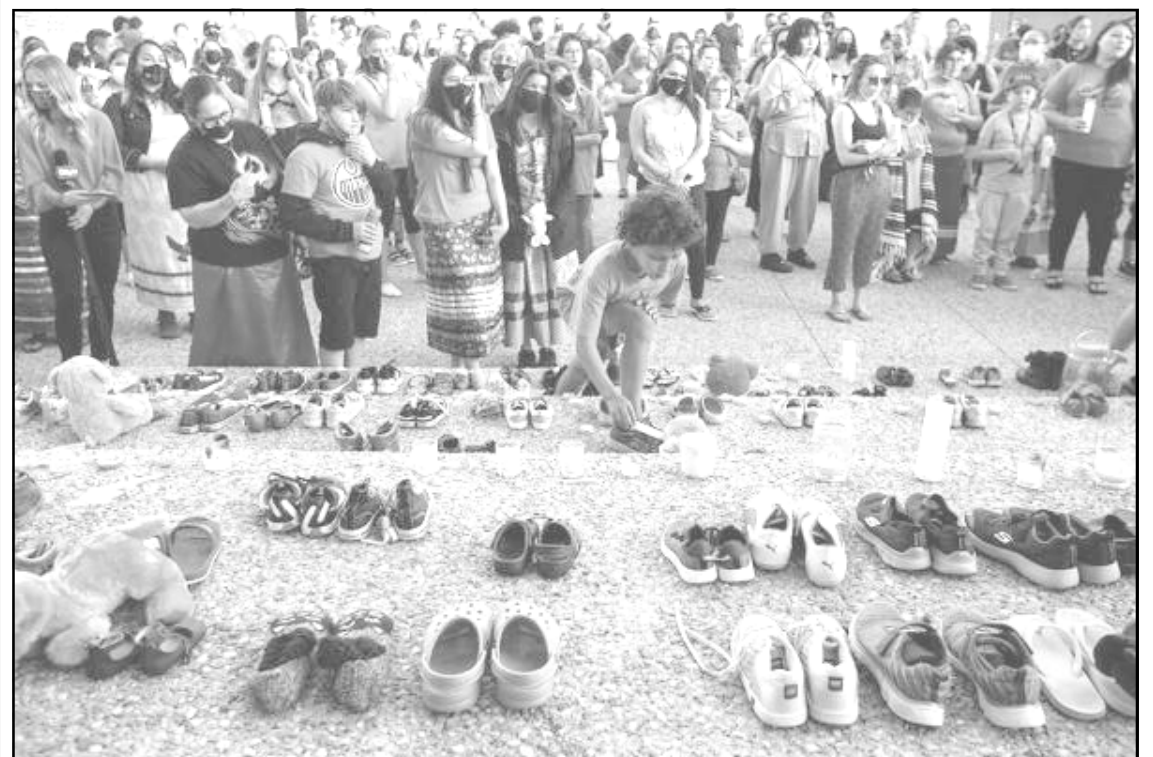
Edmonton, Alberta kübok Kamloops, British Columbia nung taoba mapang residential school ka alidak tila tanur 200 dak tema indang tasü mang ngutetba temaitsü nüburtem adenshia parnok indang tsüngsem yutsüba noksa ka yangi angur.

US nung November 2020 nung mezüing jangjatetba coronavirus tabu ka, B.1.526 dang Iota ajatsü aser India nung October 2020 nung mezüing putetba B.1.617.1 variant dang Kappa ajatsü.