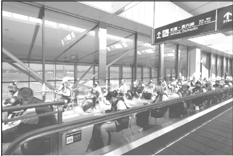
Tokyo, Aami/June 01, 2021: Mongolbarnü, Australia national softball team asayatem Tokyo anüdoklen tsütsü Narita, Chiba kübok Narita International Airport tonga arur sülen 'antigen test' atema ataba mapang tangokba noksa ka angur.

Tokyo, Aami/June 01, 2021 (Agencies): Olympics atema Japan tonga arur mezüing athlete tem rongnung Australia indang softball team alitsü. Mongolbarnü (01.06.2021) Australia Softball team pur Japan tonga aruogo.