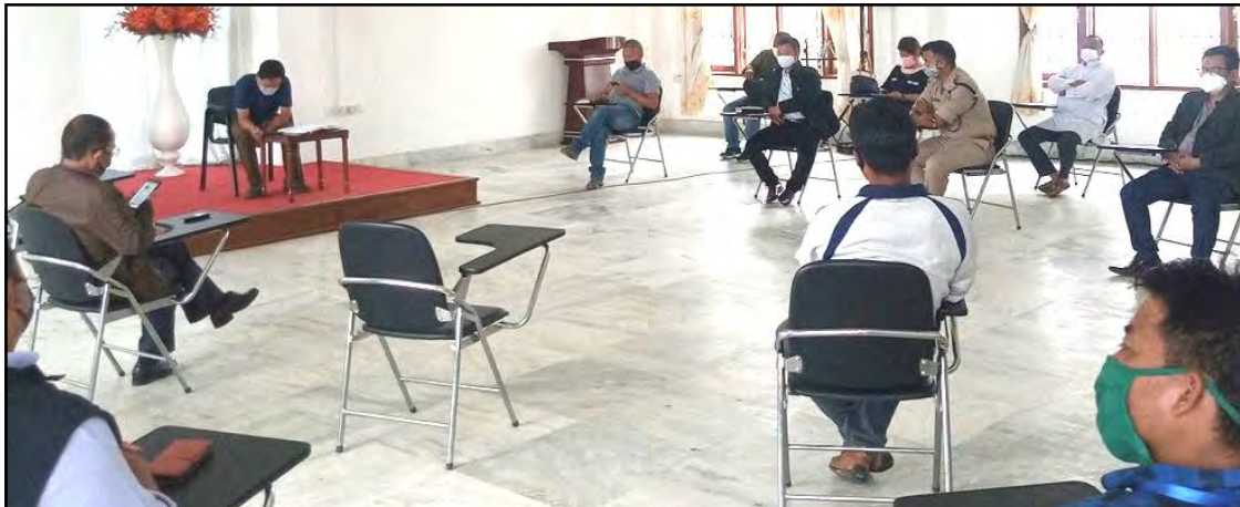
June 1, 2021 nü Tuensang Task Force COVID-19 senden CBLT Conference hall nung nung senden amenba noksa nung angur. (IA Tuensang)

Dimapur, Aami/June 01 (TYO): Tuensang District Task Force for COVID-19 pur senden ka June 1, 2021 nü CBLT Conference Hall nung senden ka mena Covid Care Center (CCC) Tuensang tenzüksü atema jembia liasü.