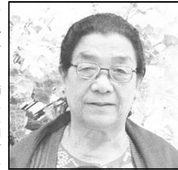
Temeim Kinungbo aser Kinungertem.

Onoki kanga meimba kinungtsü/ojala mapang talangka shiranga arudang aser la iba alima nungi pilar mangyimba mapang kija, medemerterem, temeimerterem, Arogotem aser lokti tentet balalai ozü dang tauchi sayuba atema tebang agi rasa meshitetba pelaba metetdaksür. Nenoki sarasadem, nübo, rongsen aser shisatsü agi nungita yariba ajanga ozü kibong nem tashi agütsüogo. Tulusang Tsüngremi nenok ajak maneni molamoshia moajangma.