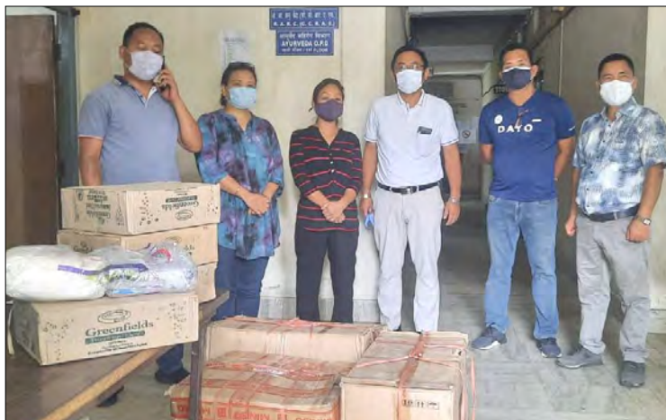
June 1, 2021 nü Dimapur Area Ao Baptist Churches aser Ao Civil Societies Co-Ordination Committee on Covid-19 nungi züngsemtemi mozü kidang chiyongtsü agütsüdag agiba noksa angur. (Dimapur, June 1)

Dimapur, June 01 (TYO) : Dimapur nung Covid mozü kitem nung inyakterem tasüba wara tongpang tulu nung nokdaka yur shi temang aser tanüla nung meluladaksüi tashi aser tasü itshidaksütsü nükjidong nung, Dimapur Area Ao Baptist Churches & Ao Civil Societies purtem telongjemi parnok inyakba mozü kitem ajak tonga orr sarasadem mapang agüja chiyongtsü agütsüba sentong ka tenzüko.