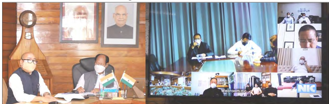
Chief Minister aser NSDMA Chairman, Neiphiu Rio menden ser tzüngluruwa atema renemshiba senden amenba noksa nung angur. (DIPR)

Dimapur, June 2, 2021 (TYO): June 2, 2021 nü Chief Minister aser NSDMA Chairman, Neiphiu Rio menden ser tzüngluruwa atema renemshiba senden ka menogo.