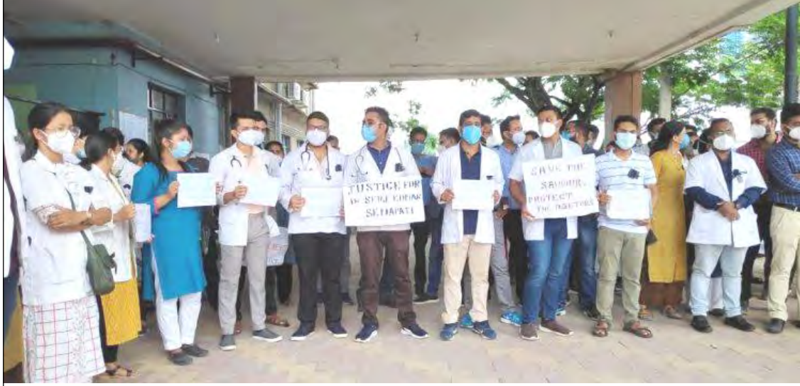
Hojai nung Covid Care Centre ka nung junior doctor ka züka merenshiba anema Jorhat Medical College and Hospital (JMCH) nung Junior Doctors' Association-i tanü lungkak aitba noksa nung angur.