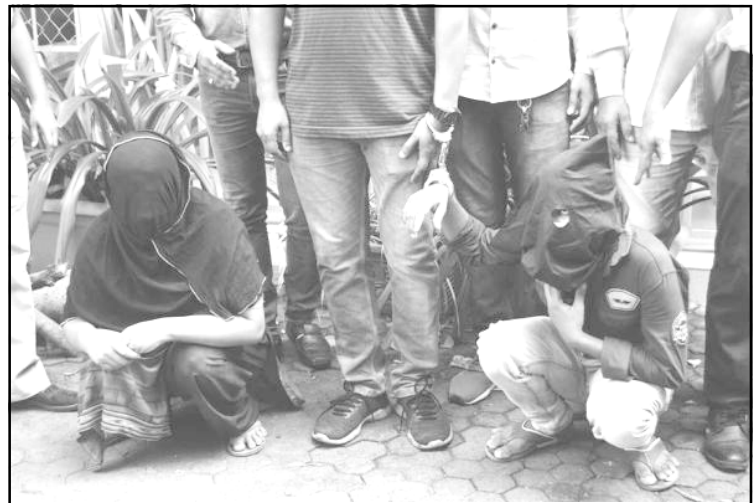
Mumbai, June 02, 2021: Mumbai nung nisung tepsetba ken o nung nisung ana apuba sülen police-i osangbenertem den jembiba noksa nung angur. Mumbai nung arrshi küm 28 tetsür ka den lai meimsang nati la kinüingbu tepseta liasü.

pai ashi. "Parnoki state sorkar den supply contracts meyangluner. Linük nung vaccine yanglurtemi supply tsütsü timtem ajangshir aser supply asütsü menangzükteter," ta chief minister-i ashi. Iba ama tensa ka nung nüburttem nem tekaratiba nung vaccine agütsütsü atema lenmang tajungtibaji Centre-i dang vaccines alizüker state tem nem lema agütsütsüla, ta pai ashi. Patnaik-i ashiba agi, pai iba tebilemsü onük ya Centre sorkar den dang masü saka chief minister kar denbo lemsatepogo. "Iba tebilemsü tekaraba nung koktettsü atema state sorkar ajaki telemtetba ka agitsü ni mepishir. Coronavirus wave tasembuba arua timtem magütsüdangyongi asenoki tekaraba nung inyaktsüla," ta paisa metetdaksü. India nunger nüchiso atema raraba sülenbo linük nung tayongzüka tulutibaji coronavirus wara ya lir, anungji state temi party balala tangatetba toktsür chief minister ajak longjemer inyaktsüla, ta paisa shisem.