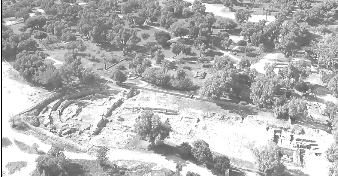
Ashkelon, Israel nung archaeologist temi tutetba Tenla ki noksa nung angur.

June 02, 2021: Tawa Israel nung archaeologist temi Ashkelon yimti nung küm 2,000 dak tema indang Tenla ki ka tutetogo.