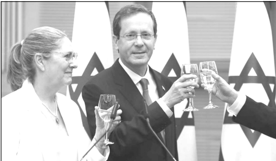
Knesset special session ka nung Israel nunger özüng yanglurtemi tir asütsü shimba sülen tir Isaac Herzog aser pa kinungtsü Michal na Jerusalem kübok Knesset, Israel parliament nung pelatepba mapang tangokba noksa nung angur.

Jerusalem, Aami/June 2 (Agencies): Yimden yimsüsür tejen aser Israel nung nungtuugu kibong ka nungi jakzüksang Isaac Herzog, Mongolbarnü linük tir asütsü shimogo.