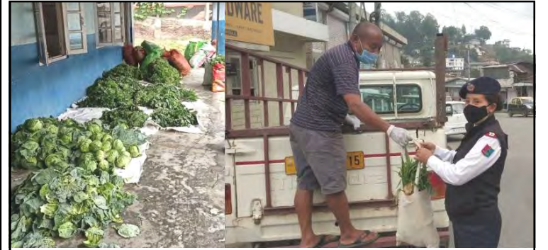
Pfutsero Town Baptist Church, Leshemi Women Welfare Society, Kalos Society aser Pfutsero nung aliba aluyimer temi aonsotsü lema agütsüba yangi noksa nung angur.

Dimapur, Aami/June 02 (TYO): Pfutsero Town Baptist Church, Leshemi Women Welfare Society, Kalos Society aser Pfutsero nung aliba aluyimer temi mozü mamshi züsentepta anosotsütem (organic vegetables) Bayavü nung aliba nürbur aser frontline worker nem June 2, 2021 nü tenlaba atema pelar, ta Bayavü Area Panchayat, Bayavü Covid Action Committee aser Bayavü colony, Kohima nung alirtemi sangdong ka ajanga ashi.