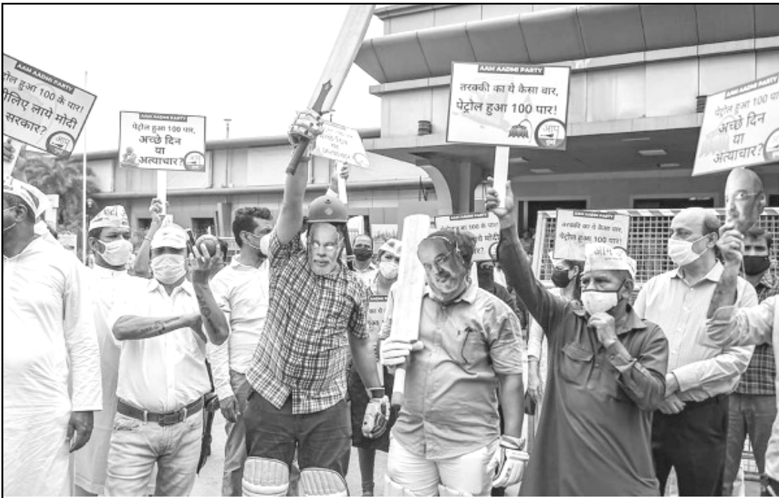
Mumbai, June 02, 2021: Mumbai nung petrol totzü litre ka nung sen 100 dak tema ajungba anema Bodhbarnü Mumbai nung Aam Aadmi Party (AAP) züngsemtemi sorkar anema longkak aitba noksa nung angur.