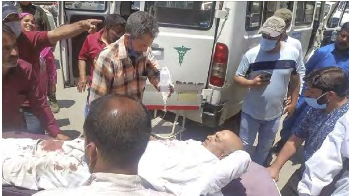
June 12, 2021 nü Srinagar kübok Sopore jila nung kiralongrartemi sepaitem amakba mapang nung yirur civilian ka hospital nung yariba noksa nung angur. Kiralongrartemi amakdang police ana densema civilian aika asü aser asem yiruogo.