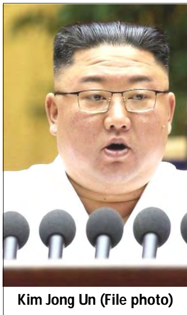
Kim Jong Un (File photo)

Pyongyang, Aami/June 12 (Agencies): North Korean media sangdong balala ajanga, linük lenir Kim Jong Un Central Military Commission senden ka nung adenba aser military tashi tali ajungkettsü atema ayongzükba Honibarnü metetdaksüogo.