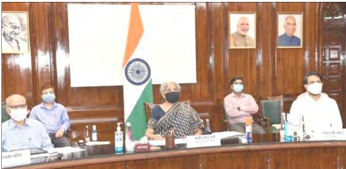
June 12, 2021 nü New Delhi nungi video conferencing ajanga Union Finance Minister, Nirmala Sitharaman leniba nung 44buba GST Council senden amenba noksa nung angur.

IMA-i ashiba agi, 2020 küm India linük nung coronavirus tashidak prok tenzüokba sülen tang tashi nung doctor 1,400 dak tema süogo.