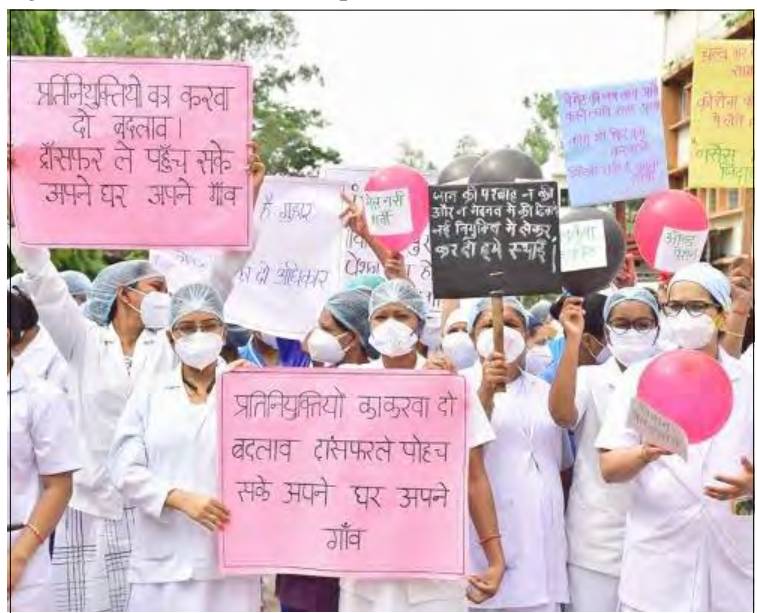
June 12, 2021 nü Jabalpur nung aliba NSCB Medical College kima nurse temi parnok itasen tujang aser permanent mapa agüjang, ta takhangba agüja longkak aitba noksa nung angur.

"Pai mejanga aliba nungi saaker 2020 küm tom nung vaccine manga asü nungbo pai nisung jenti kümzüker lila," ta lai ashi.