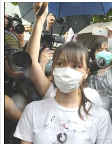
Hong Kong pro-democracy activist Agnes Chow

Hong Kong, Aami/June 12 (Agencies): Hong Kong pro-democracy activist Agnes Chow, ita tenet shi tepuokdak ayuba sülen Honibarnü chiokogo. 2019 küm yimti nung sorkar anema longkak aitba mapang temelaba makai lokti adenshiba nung shilem agiba atema la apu.