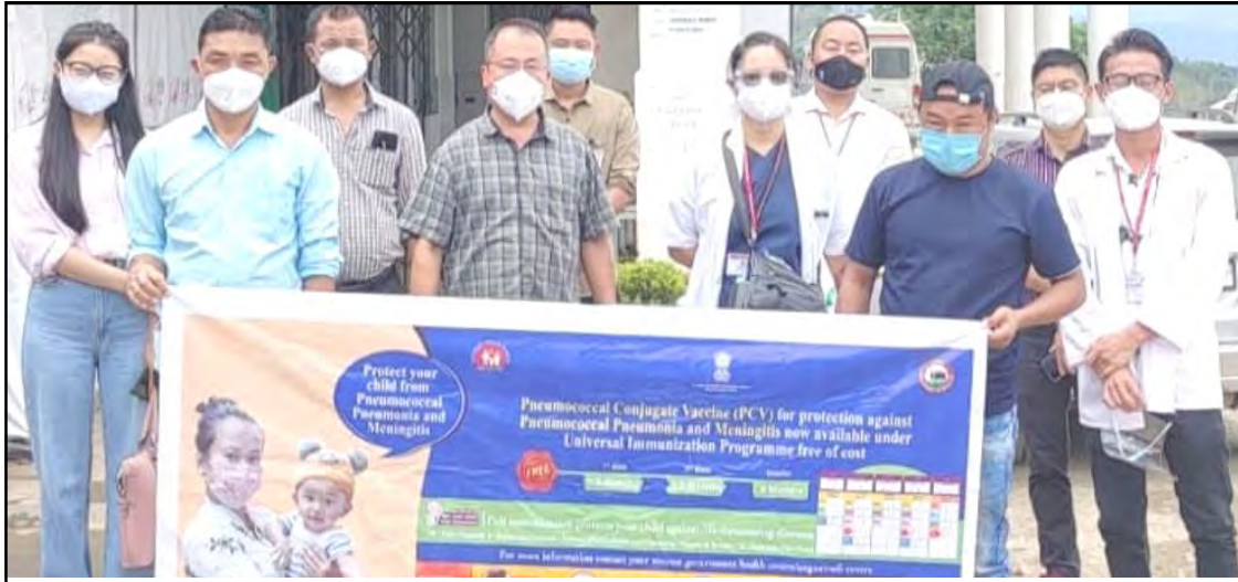
District Hospital, Kiphire nung Pneumococcal Conjugate Vaccine (PCV) amenokdang tangokba noksa nung angur.

Dimapur, Aami/June 12 (TYO): Universal Immunization Program (UIP) kübok Kiphire District nung June 11 nü District Hospital, Kiphire nung Pneumococcal Conjugate Vaccine (PCV) amenokogo.