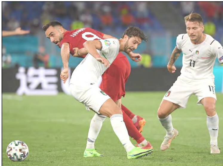
European Championship asayamung tenzuka Italy aser Turkey mezüing asayaba nosa nung angur.