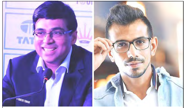
Viswanathan Anand & Yuzvendra Chahal

Taoba mapang national under-12 champion, Chahal-isa April 5 nü online blitz event ka