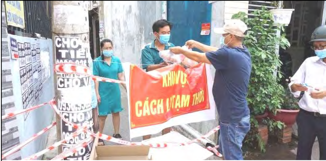
June 06, 2021 nū Vietnam kūbok Ho Chi Minh City nung Khristanemi sensakertem nem chiyungtsū lema agütsüba noksa nung angur.

June 12, 2021: Tang Vietnam linük nung coronavirus wara mapang nung sorkar ketdangsertemi Khristanem anema inyaker aser house-church organization ka anema-ken o benoka bushisüngdangdar, ta osang ka ajanga metetdaksü.