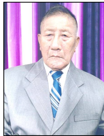
"KIBUBAI NI MEYARILASANG KÜ NÜLA SÜR LILA" (T. KEN 94:17)

Tsüngremi küm 85 tashi kinungtsü, chirnur aser semchirtem akümdong asütsü wazüka toktsü nung tepela tasoba anogo bilemteta Tsüngrem nem tenüngsang agütsür. Maneni arishi anogo temjena moajang ta onok sarasadem.