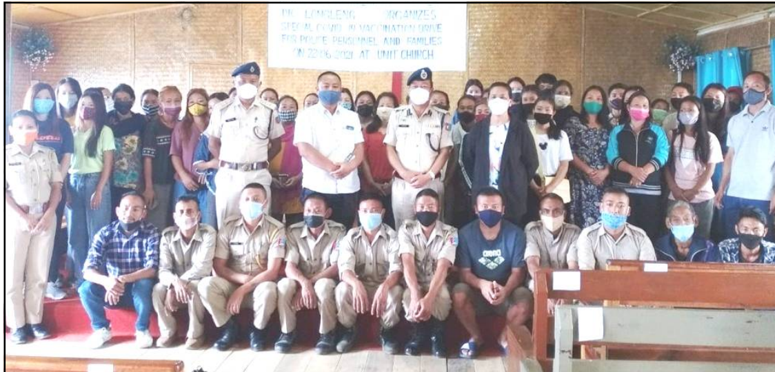
Longleng, Aami/June 22, 2021: Superintendent of Police, Longleng indang office complex nung, Mongolbarnü police aser parnok kibong tem atema Vaccination Drive sentong ayonga agiba mapang, Sr. SP, Longleng, Yanithung Ezung, CMO, Longleng, Dr. Obangjungla aser ketdangsurtem den tajangzük angutsüpur tem külemi tangokba noksa ka yangi angur.

Longleng, Aami/June 22, 2021 (TYO): Police aser parnok kibongtem atema, Mongolbarnü (22.06.2021) Superintendent of Police, Longleng indang office complex nung Covid-19 Vaccination Drive sentong agiba den, DEF Longleng-i, police aser parnok kibong ajunga nem Covid-19 vaccine indang mezüing dose takok ngua agütsüba osang sangoktsü. Kasa drive mapang, police nübu timbaka nem Covid-19 vaccine tanabuba dose agütsüogo, ta sangdong ka ajanga metetdaksü.