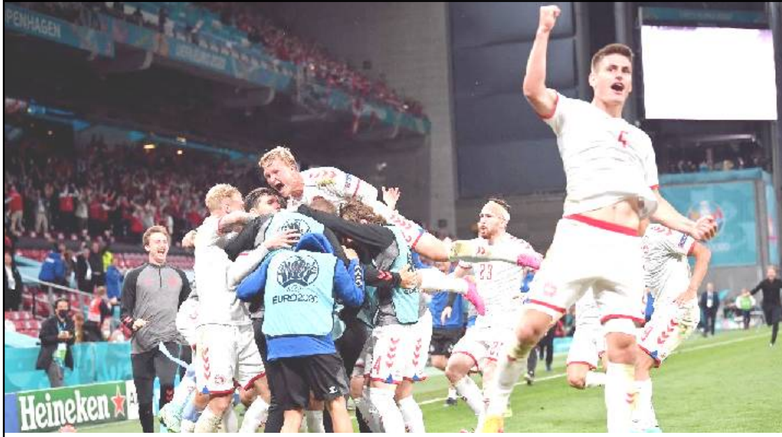
Copenhagen, Aami/June 22, 2021: Euro 2020 asayamung Group B nung Denmark-i goal 4-1 agi Russia aokba sülen asayartem pelatepba noksa nung angur.

Copenhagen, Aami/June 22, 2021 (Agencies): Parken Stadium, Copenhagen nung Denmark aser Russia na tsüngda Euro 2020 asaya liasü. Denmark-i Russia madak goal 4-1 agi takok ngua parnoki iba asayamung indang Round of 16 tongtetogo.