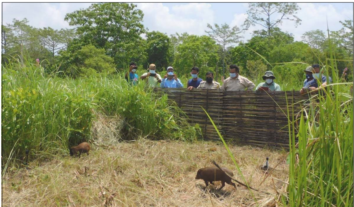
Mongulbarnü Assam nung aliba Manas National Park nung pygmy hogs 8 puokogo. Pygmy Hog Conservation Programme (PHCP)-i June 22 aser June 25, 2021 anogotem Manas National Park nung pygmy hogs 12 tashi pua aliba chioktsü sentong renema lir. (Guwahati, June 22)