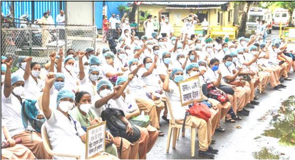
7th Pay Commission recommendation benoktsü khanga longkak aitba mapang Mumbai nung JJ Hospital nurse temi yimyim ayimba noksa nung angur.