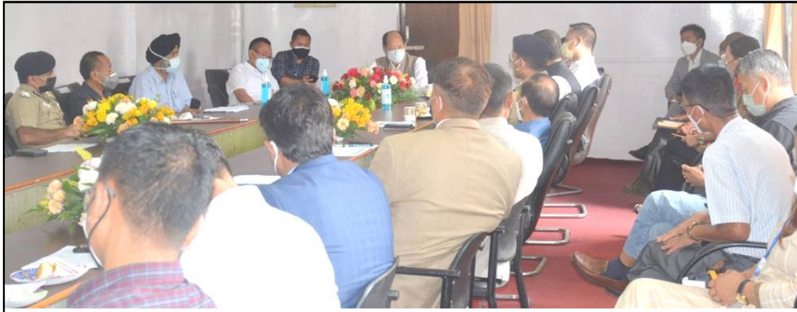
Chief Minister, Neiphu Rio-i DC, Tuensang indang Conference Hall nung Tuensang District Task Force for COVID-19 züngsemtem den senden amanba noksa nung angur.

Dimapur, Aami/June 22 (TYO): Nagaland Chief Minister, Neiphu Rio-i June 22, 2021 nü Deputy Commissioner, Tuensang indang Conference Hall nung Tuensang District Task Force for COVID-19 züngsemtem den senden mena liasü.