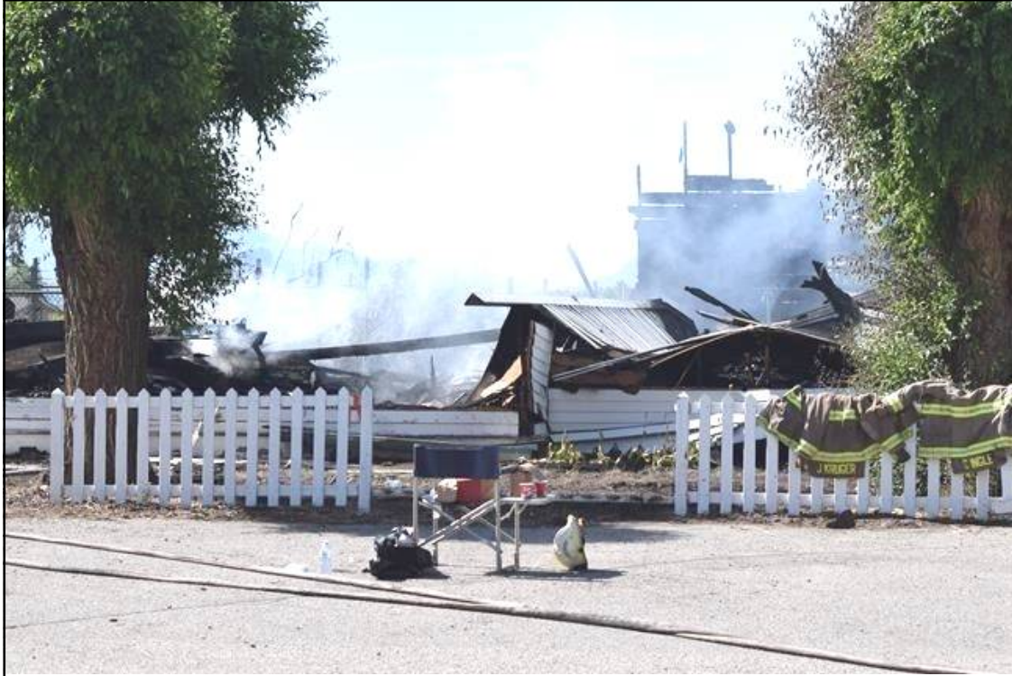
June 21, 2021 anepdang British Columbia kübok Penticton anasa Sacred Heart Arogo Tenla ki rongdoker aliba noksa nung angur.

Oliver (British Columbia), June 22, 2021 (Agencies): British Columbia nung Roman Catholic pur Tenla ki ana rongdokogo, ta June 21 nü Canada national police-i metetdaksü.