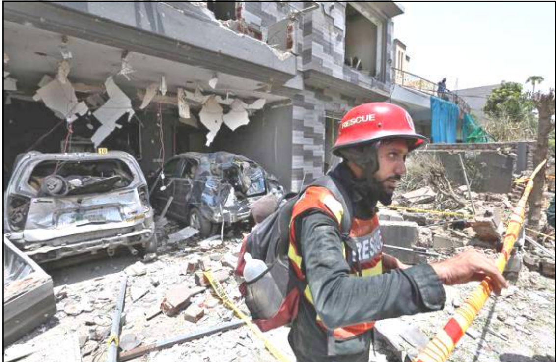
Ketdangsür kati Lahore, Pakistan nung bomb apokba tesem asadangba noksa nung angur. Bodhbarnü Pakistan anüdoklen Lahore yimti nung nisung aliba tesem ka nung bomb tesashi ka poka nisung kar tasü aser ishika yirua liasü, ta ketdangsürtemi ashi.

security law nung aibelen, ta ashi. Iba osangkaket ketdangsür apuba ajanga yangji inyaker tsüba akum aser aika idangjisa mapa nungi anen. Iba osangkaket ajanga 2019 küm nungi tenzüka danga linüktem dang Hong Kong aser mainland China anema tenokdangba agüjang ta article 30 dak tema züluogo, ta police temi tai tonglokja lir. Parnoki iba osangkaket indang editor-in-chief aser ano ketdangsür pezü tashi pei kidang nungi apu aser Apple Daily den sendaktepa aliba company asem - Apple Daily Limited, Apple Daily Printing Limited aser AD internet Limited - meyong sen million $2.3 jenjang rongsen soita ayu. Iba sülen akhi ama hopta ishika inyaksü atema dang sen lir, ta osangkaket ajanga shia liasü.