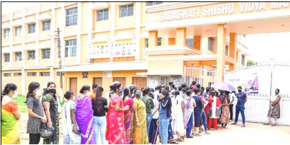
June 23, 2021 nü Ranchi nung Saraswati Shishu Vidya Mandir School- vaccination centre nung nisungtem coronavirus vaccine agitsü atema nokdaka aliba noksa nung angur.