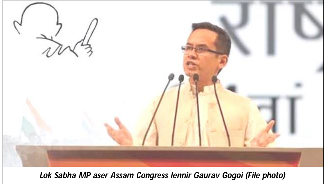
Lok Sabha MP aser Assam Congress lennir Gaurav Gogoi (File photo)