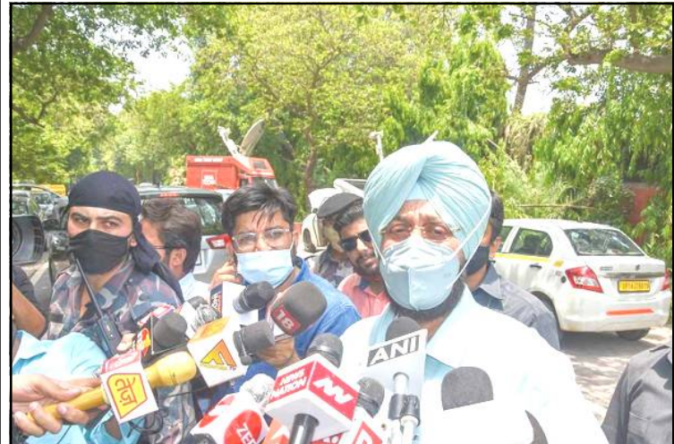
New Delhi, June 23, 2021: Tang Punjab nung Congress party telung nung mangatettep adoka lia Bodhbarnü New Delhi nung Congress MP, Pratap Singh Bajwa-i party lenir Rahul Gandhi ajuruba sülen osangbenertem den jembidang tangokba noksa nung angur.