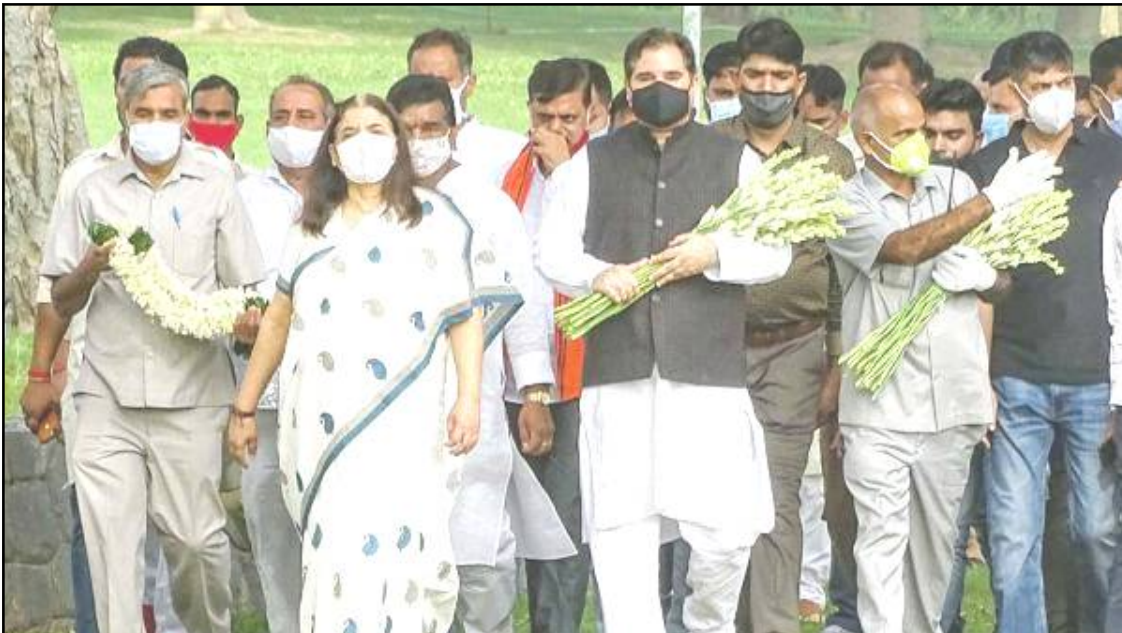
New Delhi, June 23, 2021: Sanjay Gandhi sür küm 41 abensaba anogomong nung BJP MPs-Maneka Gandhi aser Varun Gandhi nati asür indang memorial semdanga akhüm agütsüba noksa nung angur.

video ji social media nung prokshiba sülen Indian Medical Association-i pa jembiba o anema ola adok. Linük tesem ajaklen doctor temi Ramdev dang tatok meshitsü takhangba agütsü aser Union health minister Harsh Vardhan-ia Ramdev-i jembiba oji aija liasü. Taoba ita Ramdev-i allopathy aser allopathic doctor tem tenüng menükja jembiba atema IMA-i pa anema sen crore 1,000 indang defamation notice agütsü. IMA-i, Ramdev-i IPC Arrla 499 kübok ozüing alema inyakogo, ta shia pa dang anogo 15 tsüingda tatok meshitsüla, aser pai tatok memeshira IMA züngsem shia sen lakh 50- sen crore 1,000 temenok meshitsü, ta metetdakja liasü. IMA-isa Ramdev dang video clip ka ajanga pai jembibaji tai, ta pasasa nangzükba social media platforms nung prokshitsüla, ta takhangba agütsüba den külemi pa dang, pai social media nung coronavirus atema mozü ta shia "Coronil kit" advertise asüba ajak agentsüla, mesüra pa anema ken o benoktsü, ta metetdakja liasü.