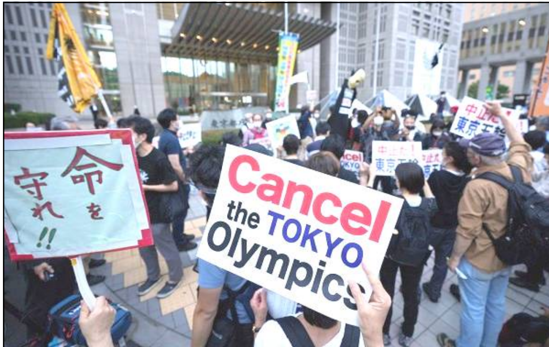
July ita nungi tenzüka asayatsü aliba Tokyo 2020 Olympics anemertemi Tokyo Metropolitan Government building kima iba asayamung athitsü khanga longkak aitba noksa nung angur.

Aami/June 23, 2021 (Agencies): Olympics tenzüksü anogo 30 anunga lia Tokyo Olympics organizers temi Bodhbarnü Olympics asayaba tesemtem nung yi meyokdaksütsü atema telemtetba agiogo.