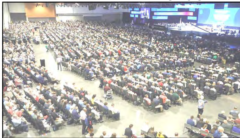
June 15, 2021 nü Music City Center, Nashville nung Southern Baptist Convention (CBC) senden agidang tangokba noksa nung angur.

Mongolbarnü Nashville nung SBC senden nung adener messenger 1,500 nem iba bangzüng agütsü. Bangzüng nungji China nung Communist Party-i Uyghur nunger reshikangshiba osang tejangja shia lir- item rongnung Uygher nunger kangshia tanur raksaa indoktsüba, tashiyim amshia raksatsüba, tanur masotsü atema sterilize sütsüba, temang shilem agiba, nisung shibelenba aser