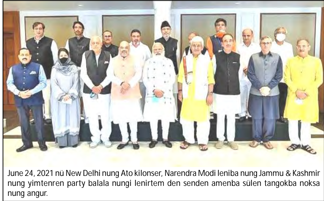
June 24, 2021 nü New Delhi nung Ato kilonser, Narendra Modi leniba nung Jammu & Kashmir nung yimtenren party balala nungi lenirtem den senden amenba sülen tangokba noksa nung angur.

New Delhi, Aami/June 24 (Agencies): Brihostibarnü New Delhi nung Ato kilonser, Narendra Modi-i Jammu & Kashmir nung yimtenren party balala nungi lenirtem den ghonda asem shi senden menogo; 2019 küm Jammu & Kashmir nung Arrla 370 agienba sülenbo tang mezüing pai J&K nungi lenirtem den senden amener.