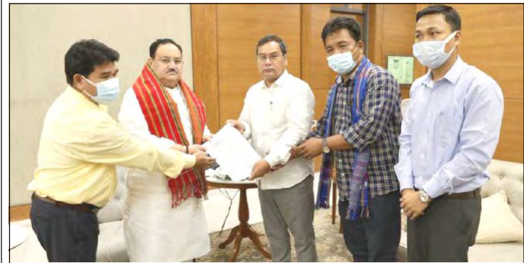
IPFT lenirtemi BJP national tir JP Nadda den Bodhbarnü nikongtsütsü New Delhi nung ajurutepba noksa nung angur.

Agartala, Aami/June 24 (Agencies): Tripura nung BJP den longjemer aliba Indigenous People Front of Tripura (IPFT) party lenirtemi BJP national tir JP Nadda den Bodhbarnü nikongtsütsü New Delhi nung ajurutepogo.