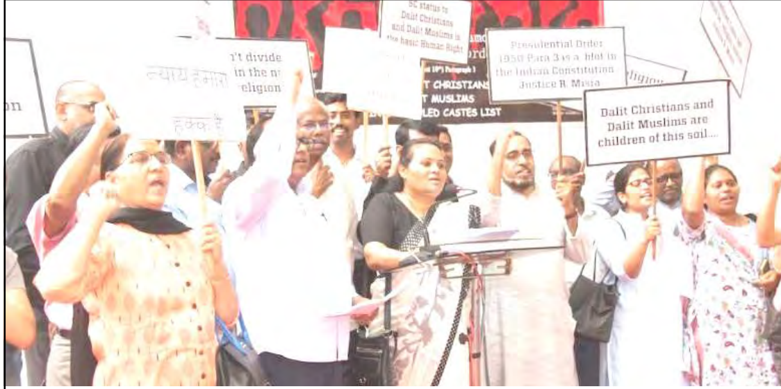
2019 kum August ita nung New Delhi nung Dalit Khristantemi linük nung senso ajak nem kasa temeden agüjang ta takhangba agüja longkak aitba noksa nung angur.

June 24, 2021: India kübok Telangana state nung police-i reshikangshiba ajanga Dalit tsür Khristan ka süogo, ta osang ka ajanga metetdaksü.