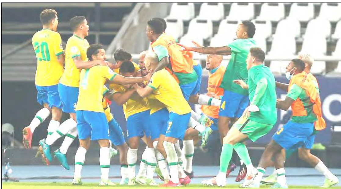
Rio de Janeiro, Aami/June 24, 2021: Copa America asayamung nung Brazil-i Colombia madak takok anguba sülen, asayatem pelatepba yangi noksa nung angur.