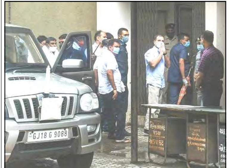
Surat, June 24, 2021: Ato kilonser, Narendra Modi nem tenüing jasatsüba ken o dak sendakba nung Brihostibarnü Congress Party lenir, Rahul Gandhi Surat nung aliba magistrate court kati aoba noksa nung angur.

SCO senden aliba mapang nungsa jurila senden ka nung Doval-i Russia NSA, Nikolai Patrushev den ghonda ana shi senden amendang linük ana dak sendakba onük aika nung o lemtepogo.