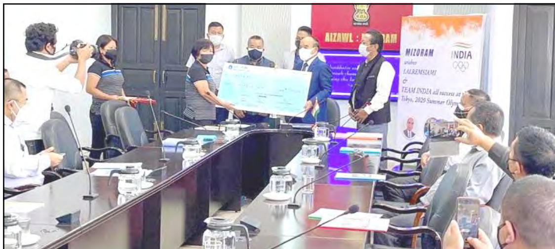
Aizawl, Aami/June 24, 2021: Brehostibarnü, Mizoram Chief Minister, Zoramthanga-i Lalremsemi nem sempet ama sen lakh 10 indang cheque ka agütsüba noksa nung angur. Aruya aliba Tokyo Olympics atema Indian Women's Hockey Team nungi Lalremsemi asayatsü.