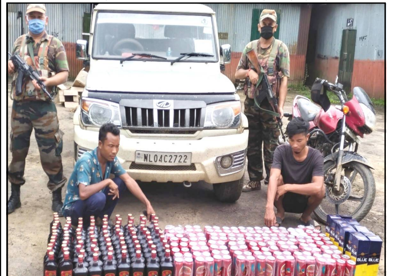
Security Forces temi June 29, 2021 nü Mon district kübok Tizit nungi Bolero gari ka nung sen lakh ka jenjang yi nguteta nisung ana apu. Pua alisang nisung ana den tena ket nungi ngutetba yi ya maneni asüngdangyatsü atema Tizit Police Station nem agütsüogo.

Iba ajanga COVID-19 agi shirangertem kidang dang süaka jungjunga repringtsü aser parnok nem Home Isolation kits agütsüsü, ta paisa ashi.