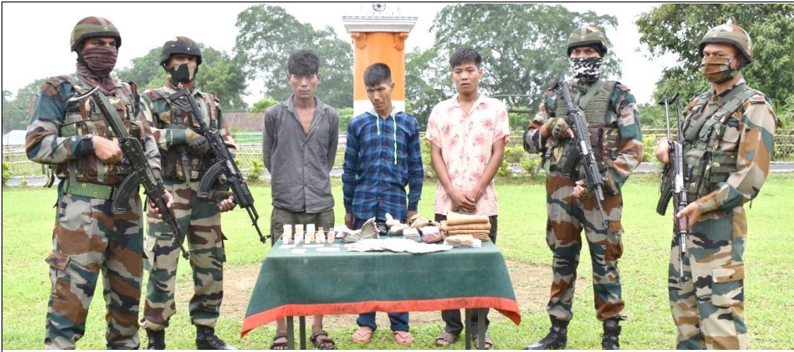
Arunachal Pradesh kubok Longka yim anasa Jairampur Battalion-i Police den yaritepa mita aodang mozü shibelener nisung 3 apu. Iba mapang par asem ket nungi Rs 3.79 lakh alang Ganja aser Rs 1.15 lakh alang Cocaine Grade 4 bena aliba apu.