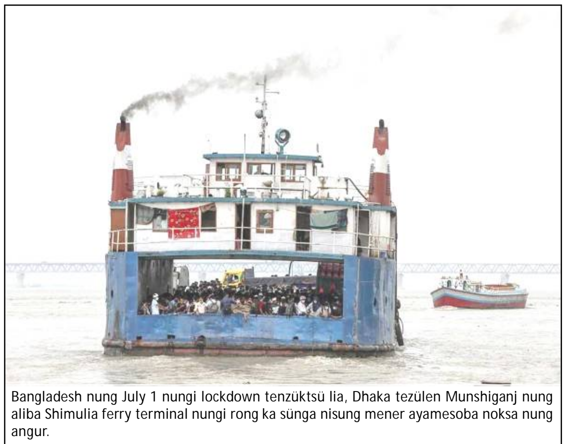
Bangladesh nung July 1 nungi lockdown tenzüktsü lia, Dhaka tezülen Munshiganj nung aliba Shimulia ferry terminal nungi rong ka sünga nisung mener ayamesoba noksa nung angur.

Ramen agi asüba ya shilem 90 dak tema Africa nung lir, timbaka tanurtem alitsü, koba nosung 265,000 dak tema alitsü.