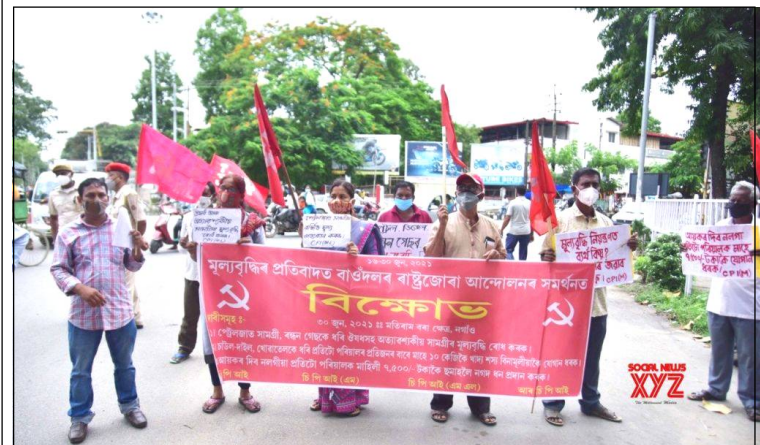
Bodbarnü Assam kubok Nagaon district nung CPI aser tanga Left party zungsemtemi petrol o diesel jenjang atuba anema lungkak aitba angur. (Nagaon, June 30)