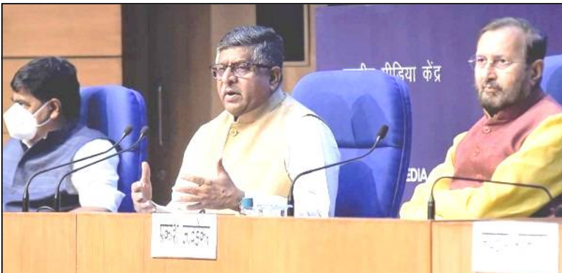
June 30, 2021 nü National Media Centre, New Delhi nung Union Ministers- Prakash Javadekar aser Ravi Shankar Prasad nati Cabinet aser CCEA-i telemtetba balala agiba dak sendakba nung osangbenertem den jembiba noksa nung angur.

Health ministry-i ashiba agi, asürtem shilem 70 bo comorbidities ajanga asü.