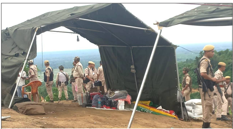
Mokokchung district nung Tzurangkong kübok Vihoto nunger lushi nung Assam police atuagi bunker aser ki yanglur amongba noksa nung angur. June 30, 2021

Dimapur, June 30 (TYO): Taoba ita May 27 nü Mariani assembly constituency nungi adokba MLA-i anir Nagaland arrtsü telongi aitba mapang timtem tera adokba sülen, ano yashi Mongolbar nübo Assam police-tem noklang dak tali atuagi