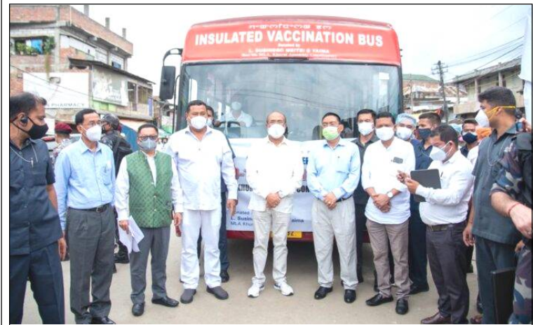
Bodbarnü Manipur CM N. Biren Singh-i Covid-19 anema vaccine agir 100% atongba constituency nem Rs 20 lakh alang sempet agütsütsü ta metetdaksüogo. Manipur nung Member of Legislative Assembly (MLA) temi pei pei constituency nung 100% vaccination asütsü atema maparen ketdangsüa inyaker. (Imphal, June 30)

Par party-i Tipraland maparen anenba ajanga MLA menden yutsür ta Brishaketu Debbarma-i ashi.