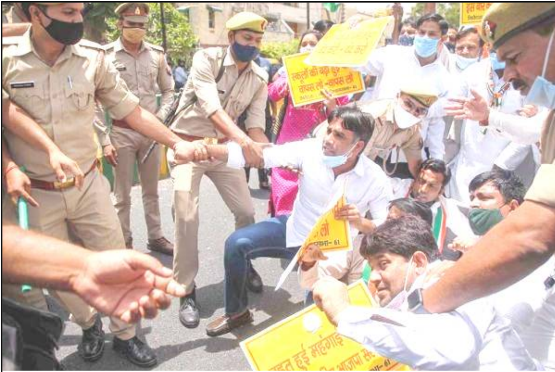
Noida, June 30, 2021: Linük nung petrol aser diesel jenjang atuba anema Bodhbarnü Noida nung Congress züngsemtemi longkak aitdang police-i nokdangba noksa nung angur.