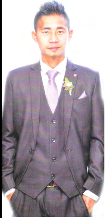
Aso: 27/06/1992 Asü: 26/06/2021

-Temeim Tsürapur, Adianu, Anükabang aser Kinungertem