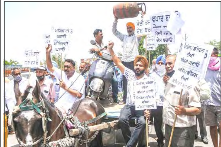
July 01, 2021 nü Patiala nung Punjab Pardesh Beopar Mandal nungi züngsemtemi linük nung petrol aser diesel jenjang atuba anema longkak aitba noksa nung angur.

State temi vaccination inyakyim junga meinyaktetba agi Centre-i vaccination inyakyim bendanga agitsüsa aküm, ta paisa shisem.