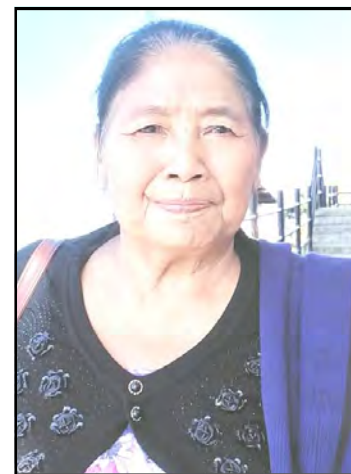
TASOBA : 1944