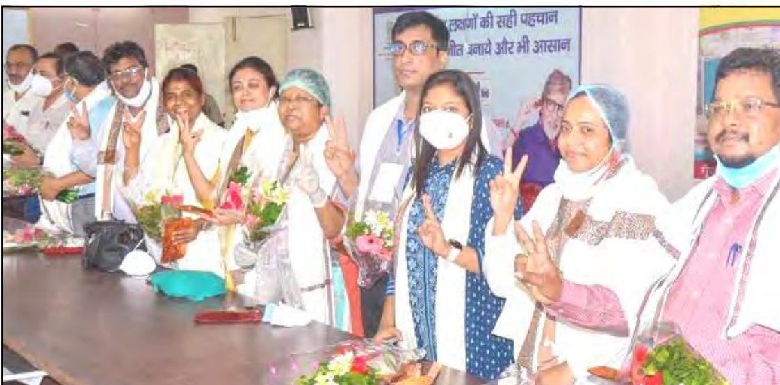
July 1, 2021 nü Ranchi nung National Doctors Day amongdang doctor tem tangokba noksa nung angur. Tanü Jharkhand Pradesh Congress Committee (JPCC)-i doctor tem nem tetushi agüja liasü.

Tawa Uttar Pradesh nung panchayat election nung menden 3,050 nungi Independents-i menden 1,081 nung takok angu, Samajwadi Party-i pusemba candidate temi menden 851 angu, BJP-i pusemba candidate temi menden 618 angu aser BSP-i pusemba candidate temi menden 320 dang ngua liasü.