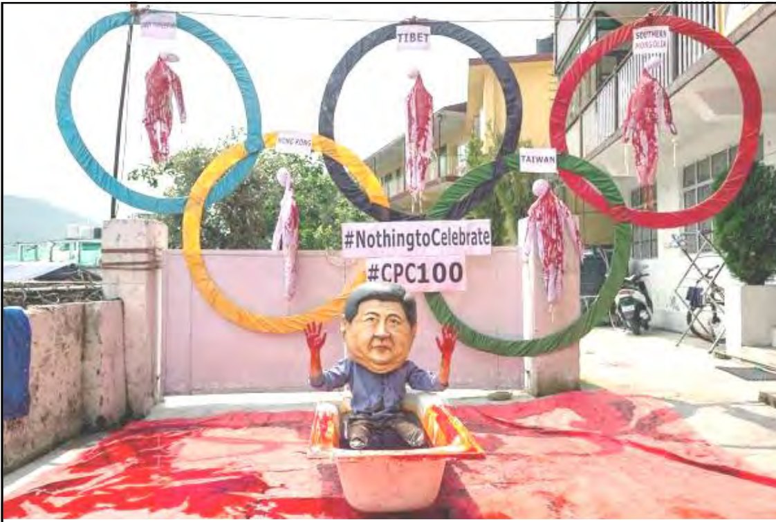
Dharamsala, July 01, 2021: Brihostibarnü Chinese Communist Party (CCP) küm 100 ajungba anogo nung Dharamsala (Bihar) nung Tibet nungeri longkak aitba mapang nisung kati China Tir, Xi Jinping ama sobur azü mesükba tzu nung mena aliba noksa nung angur.