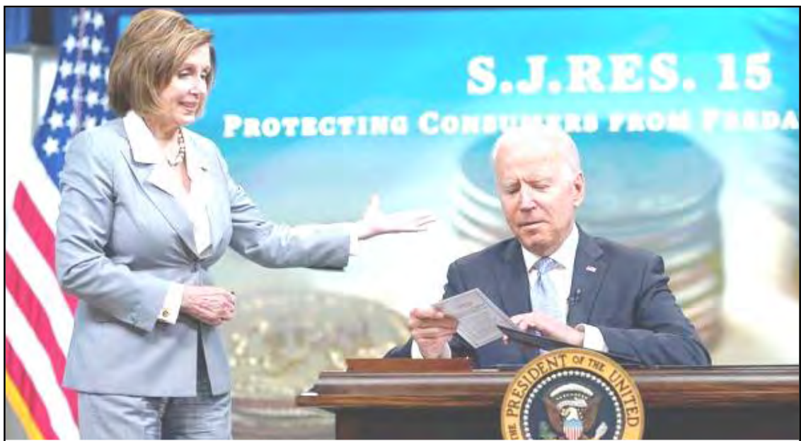
Washington nung aliba White House indang South Court Auditorium nung sentong ka akaba mapang bill kar nung US Tir Joe Biden-i meyongnem agütsüdang pa anasa House Speaker Nancy Pelosi nokdaker pa den o jembiba noksa ka yangi angur.

Java nung mozüki ajunga shiranger agi tasünger lir. Linük yimtiba, Jakarta nung emergency ward karbo mozüki kima gari anentsü mesemteta alidak süki amenoka amshir, aser kidang shiranga aliba kinungertem atema oxygen tank alitsü nüburtem atatepa liasü.