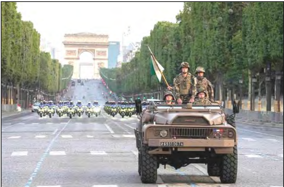
Paris nung Bastille Day parade agitsü atema renemshia sepaitemi Champs Elysees avenue nung jeep ka anir aoba noksa nung angur. Bastille Day ya France nunger national holiday ka lir, aser ibai 1789 küm July 14 nü French Revolution tenzükba bilemteta amunger.

Sri Lanka nung Brehostibarnü tashinung COVID-19 tashidak agi nisung 268,676 menepa lir aser nisung 3,351 süogo, ta health ministry ajanga ashi.