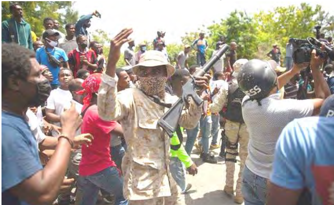
Haiti Tir Jovenel Moïse tepsetba anema nüburttem Port-au-Prince, Haiti nung aliba Petion Ville nung police station anasa longkak aitdak police nokdaka aliba noksa nung angur. Tir Moïse tepseter aser pa kinungtsü Martine kanga sashia yirutsürtem ajunga bushiteta tapet temerenshi agütsü, ta ketdangsürtemi nangzüka lir.

Port-au-Prince, Chiteni/July 09 (Agencies): Colombia sepaï mapa nungi anisüngzüka alir densema bendanger sepaï 28 agi tentetba telok kati hopta tetenzüklen Haiti Tir President Jovenel Moïse ya tepset, ta police temi ashi.