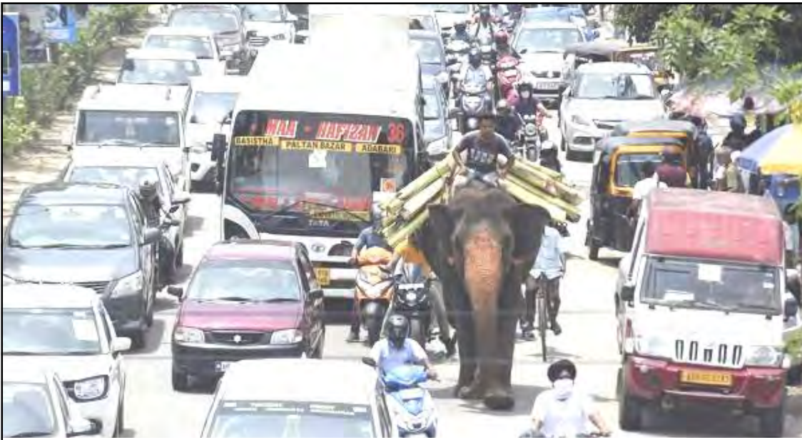
Guwahati nung COVID lockdown nung talenba kar salaba sülen kanga dang mazüngi senzüba GS Road nung mahout ka shiti nung mener aoba angur. (Guwahati, July 9)