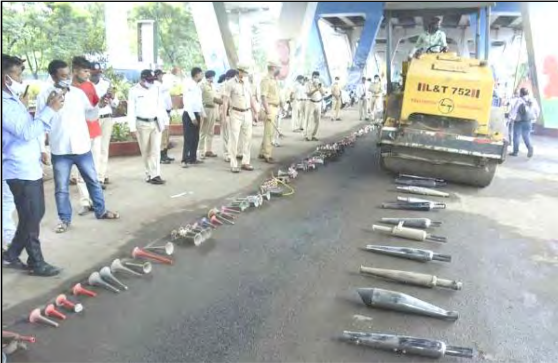
July 09, 2021 nü Mumbai kübok Thane nung ozüing alema ola tulu adokba silencers motorbikes nungi agizükba sülen police-i road rollers nem menüngsadaksüba noksa nung angur.