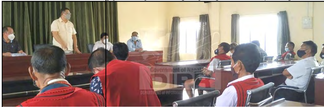
Kiphire Covid-19 District Task Force senden akaba noksa nung angur.

Dimapur, Chiteni/July 10 (TYO): Kiphire Covid-19 District Task Force-i senden nung Kiphiri kübok kiyong 11 nung vaccine noklang nung noklang agütsüjemba kiyong aser yimtsüng jenjang nung vaccine timtiba agiba yimtsüng nem sempet agütsütsü telemtetba agiogo. Kiphiri Covid-19 District Task Force senden ya July 9 nü DPDB, Conference hall, Kiphire nung DC & Chairman DTF, T.Wati Aier lenisüba nung agia liasü.