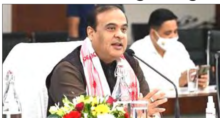
Assam chief minister Himanta Biswa Sarma (File photo)

Guwahati, July 10, 2021 (Agencies): Assam police-i ali atsünga agir ket nungi state arrtsü kümzüka ayutsü atema mapa inyaker, ta Assam chief minister Himanta Biswa Sarma-ia ashi. Paisa kidanger state tem