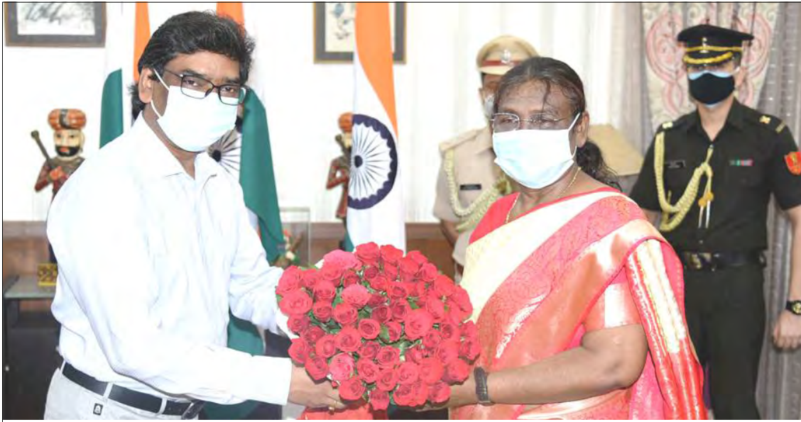
July 10, 2021 nü Raj Bhavan, Ranchi nung Jharkhand Chief Minister, Hemant Soren aser Jharkhand Angh, Draupadi Murmu na senden amendang tangokba noksa nung angur. State terenlok tsütsü onük aika nung tenati o lemtepa liasü.