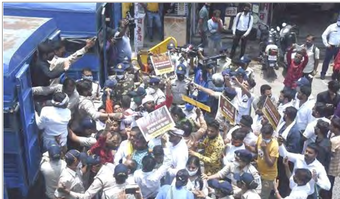
Jabalpur, July 10, 2021: India linük nung LPG aser gari totzü jenjang kanga atuba anema Honibarnü Jabalpur nung Youth Congress züngsemtemi longkak aيتدang police-i longkak aiterem apuba noksa nung angur.

Libaliro jenjang tajungba akümtsü aser terenlok alitsü atema state nung nütsüing tali arenba nokdangtsü nungdak, ta draft bill nungsa shia lir.