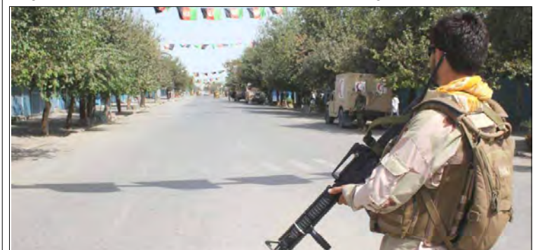
Afghan sepai o Taliban na raratepdang Afghan security lenmang nung mita ataba noksa nung angur.

Kandahar, Chiteni/July 10 (Agencies): Afghanistan anüolen tip nung province ana nung Hokolbarnü sorkar sepaitem aser Taliban kiralongrar na khatepba sülen kiralongrar 109 tepsetogo aser 25 yirutsüogo, ta military-i Honibarnü metetdaksü.