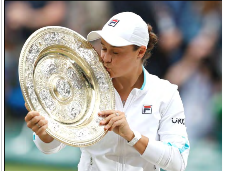
Honibarnü Wimbledon tetsür kija final asaya nung Barty-i Karolina koker takok jong amer tangokba noksa nung angur.

London, Chiteni/July 10, 2021 (Agencies):