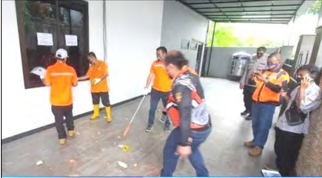
July 8, 2021 nü East Kalimantan province yimtiba, Samarinda nung nisung kari Congregation of Christ Arogo Tenla ki raksatsüba sülen police-i bushisüngdanga kuli bushiba noksa nung angur.

July 10, 2021: Indonesia kübok East Kalimantan province nung nisung kari Protestant Arogo Tenla ki ka raksatsüba sülen police-i aibelener asem puogo.