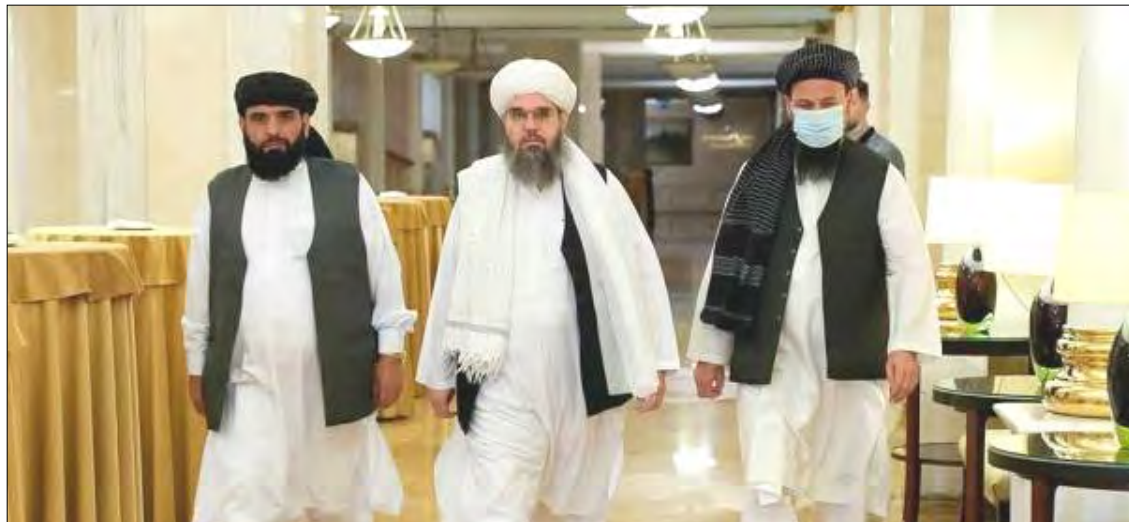
Taliban otongdar Suhil Shaheen-i (tabelen) China ya Afghanistan tembar ta shia Xinjiang province nungi Uyghur Islamic militants tem nem teyari magütsütsü nangzüko. Taoba mapang Xinjiang nungi Uyghur separatist sepaitem karbok Afghanistan nung jenoka liasü.

Moise-i tatemsa Ariel Henry Ato kilonser asütsü shimtsüogo, saka pa tepsetba mapang nung office mapa mebelenzüki liasü. Moise tepsetba sülen taoba PM Claude Joseph-i pai mapa abentsü ta sangdonga liasü.