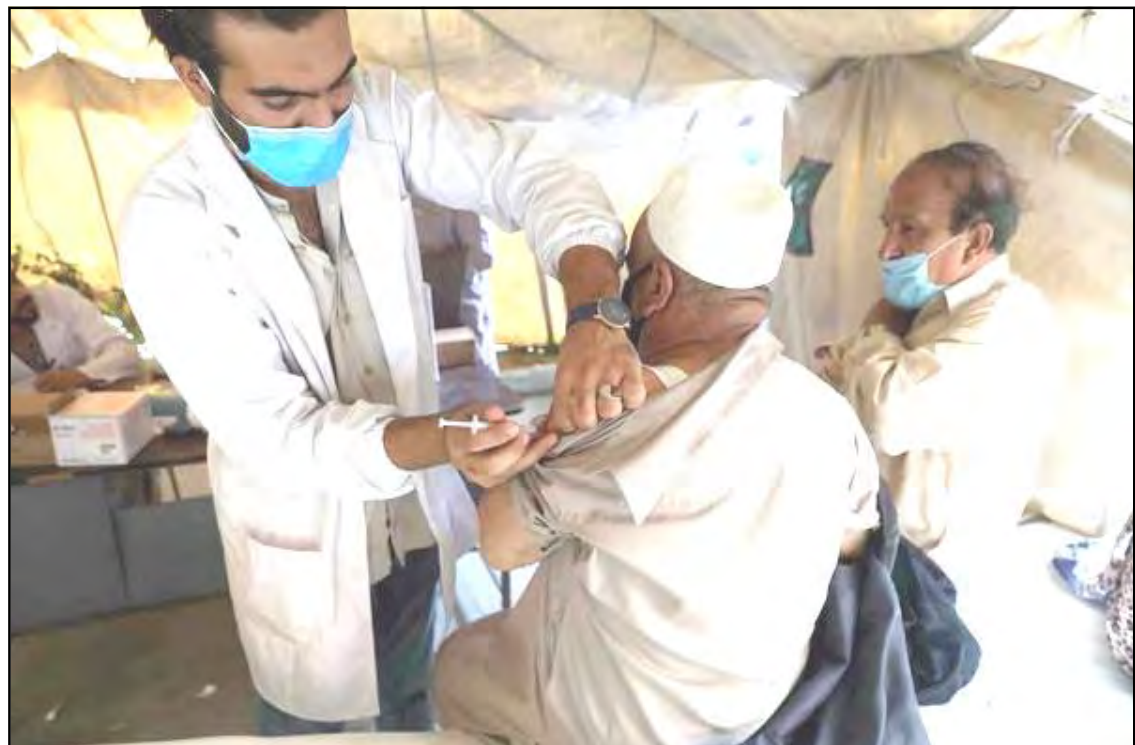
Kabul, Afghanistan nung vaccination center ka nung nisung ka nem Johnson & Johnson COVID-19 vaccine agitsüba noksa nung angur. Iba COVID-19 mozü ya United States-i agütsü aser U.N. indang teyari nung COVAX sentong kübok bener aruja liasü. Ita tatemlen ano iba mozü ya Afghanistan nem agütsütsü imlar.

Ajisüaka atakzükja aliba anogo ghonda ishika agi süierang Deobar ayaterem süier Netanyahu-i PM ki toktsür ao.