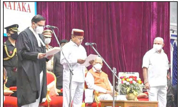
July 11, 2021 nü Raj Bhavan, Bengaluru nung Chief Justice, Karnataka High Court, Justice Abhay Srinivas Oka-i ketdangsüa Thawarchand Gehlot nem Karnataka Angh tenangzükba agidaktsüdang tangokba noksa nung angur. Kasa noksa nung Karnataka Chief Minister B.S. Yediyurappa-a angur.

Bengaluru, July 11 (Agencies): Tawa Union Minister menden nungi anensang, Thawarchand Gehlot-i Karnataka Angh inyaktsü atema Amongnü (July 11) Raj Bhawan, Bengaluru nung tenangzükba agiogo.