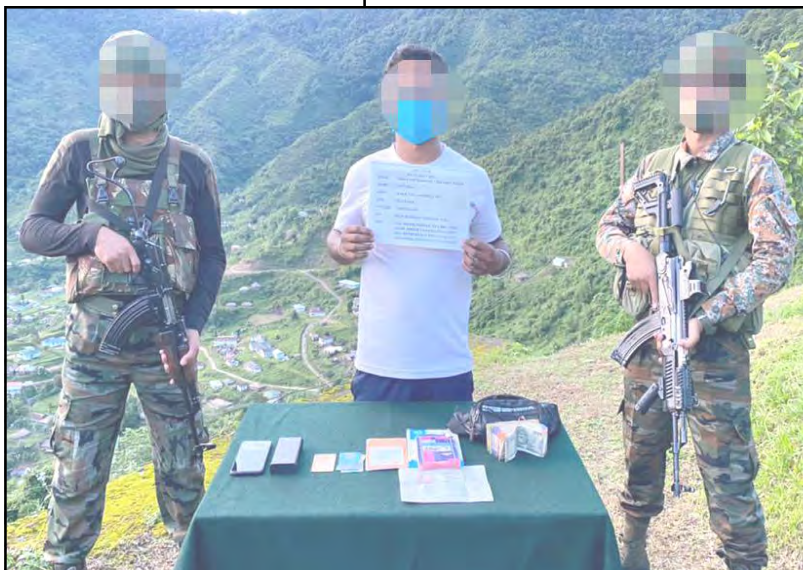
Security Forces temi state police den lungjemer July 10, 2021 nü Arunachal Pradesh nung Tirap district kübok general area Chop village nung operation ka agidang Kamtapura Liberation Organisation (KLO) nungi züngsem ka pua liasü. Ken o maneni asüngdangyatsü atema pua alisang den pa ket nungi ngutetba osettem Wakka Police Station, Tirap District nem agütsüogo.

India ya democracy lima ka lir, aser state ajaki welfare state ka ama inyaksüla, anungji nüburtemi ola adokba sorkari angashitsüla, ta NVCO ajangasa ashi.