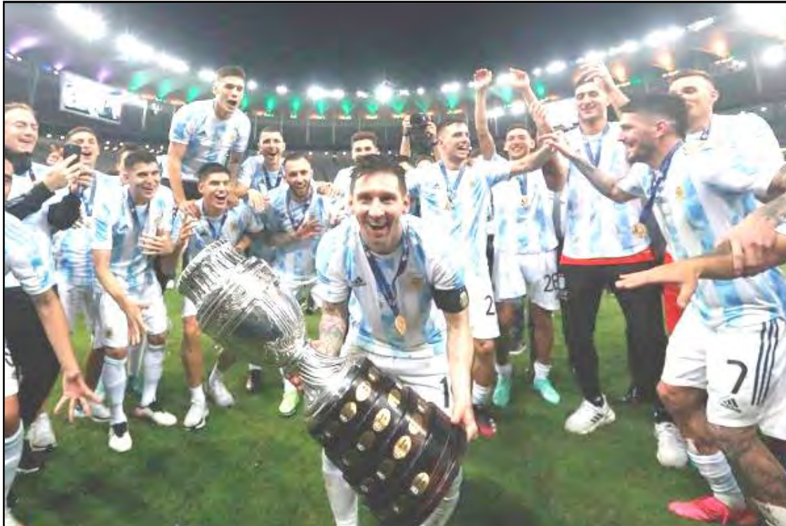
Rio de Janeiro kübok Maracana stadium nung Copa America final nung Argentina-i goal 1-0 agi Brazil akokba sülen Lionel Messi-i takok marok amer Argentina nunger asayartem pelatepba noksa nung angur.