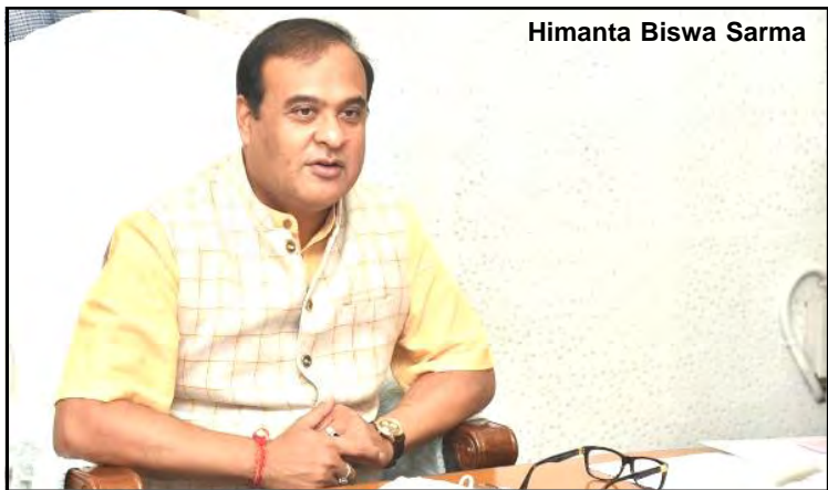
Himanta Biswa Sarma

Guwahati, July 11, 2021 (Agencies): Assam nung Opposition lenir aikati tanü Speaker Biswajit Daimary aser Governor Jagadish Mukhi dangi ao aser Chief Minister anema ken o tem benokogo.