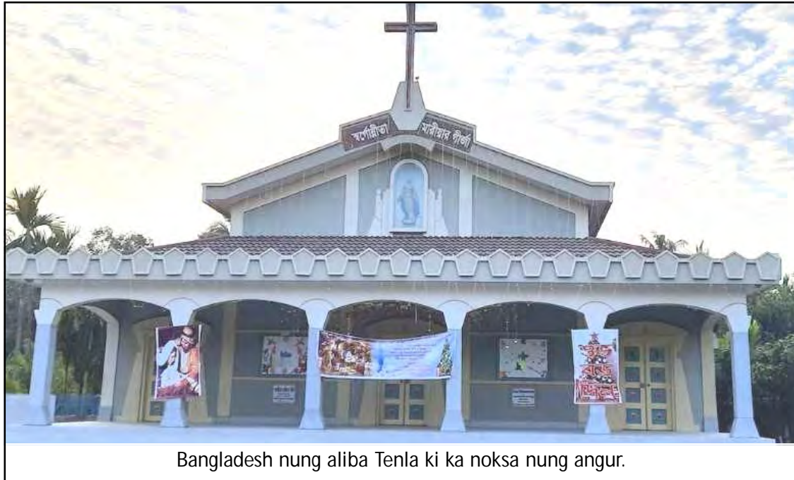
Bangladesh nung aliba Tenla ki ka noksa nung angur.

July 11, 2021: Bangladesh nung coronavirus wara mapang nung Tenla kitem shibangba ajanga tenla aruba lenmang anenogo, aser ibaji ajanga Arogotem kanga timtemdar; Arogotem ket nung sen peria maliba agi bilemba ama timtemertem meyariteter. Tang Bangladesh nung coronavirus wave tasembuba ya tamajungba, kechiyong Delta variant ajanga shirangertem aika kümogo aser iba tashidak agi shiranger aika südar. July 8 kija nunga nisung 11,651 dak coronavirus puteta liasü. Tang Bangladesh nung yimtsüngtem nunga nisung aika dak iba tashidak puteter saka hospital nung yipten peria maliba