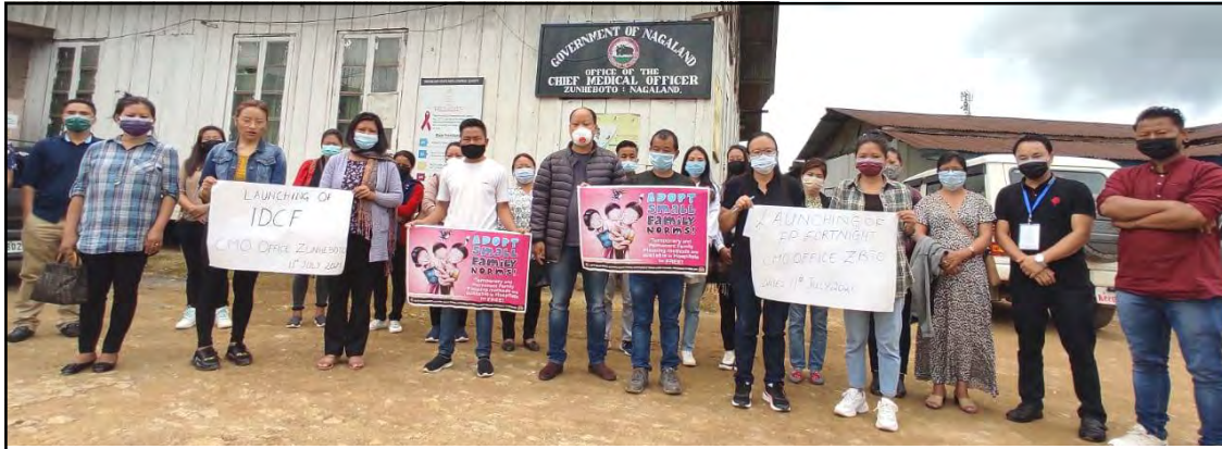
CMO Office, Zunheboto nung July 11, 2021 nü World Population Day amungba mapang tangokba noksa ka yangi angur.

Dimapur, Chiteni/July 11 (TYO): District Health Society, Zunheboto ajanga "Provision of Family Planning Services Even in a Crisis, for Self Reliant Nation and Family" omen nung ajemdaker CMO Office, Zunheboto nung July 11, 2021 nü World Population Day munga liasü.