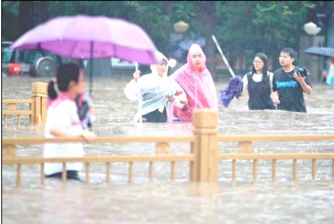
Central China nung aliba Henan Province kübok Zhengzhou yimtung nung nüburtem tzümetsüng ajanga jaja aoba noksa ka yangi angur. Nütsüng yongsük onsara aliba province nung tzümetsüng lendong tesashi nungi kumzüksü mechi China mitkartemi tzünokdang ka poksaa tzümetsüng yimdokdaksü. Zhengzhou nung tzümetsüng tesashi adoka nisung aika sür lia Luoyang yimti nung mitkartemi Mongulbar aonung iba mera ya agitsüsa akum.