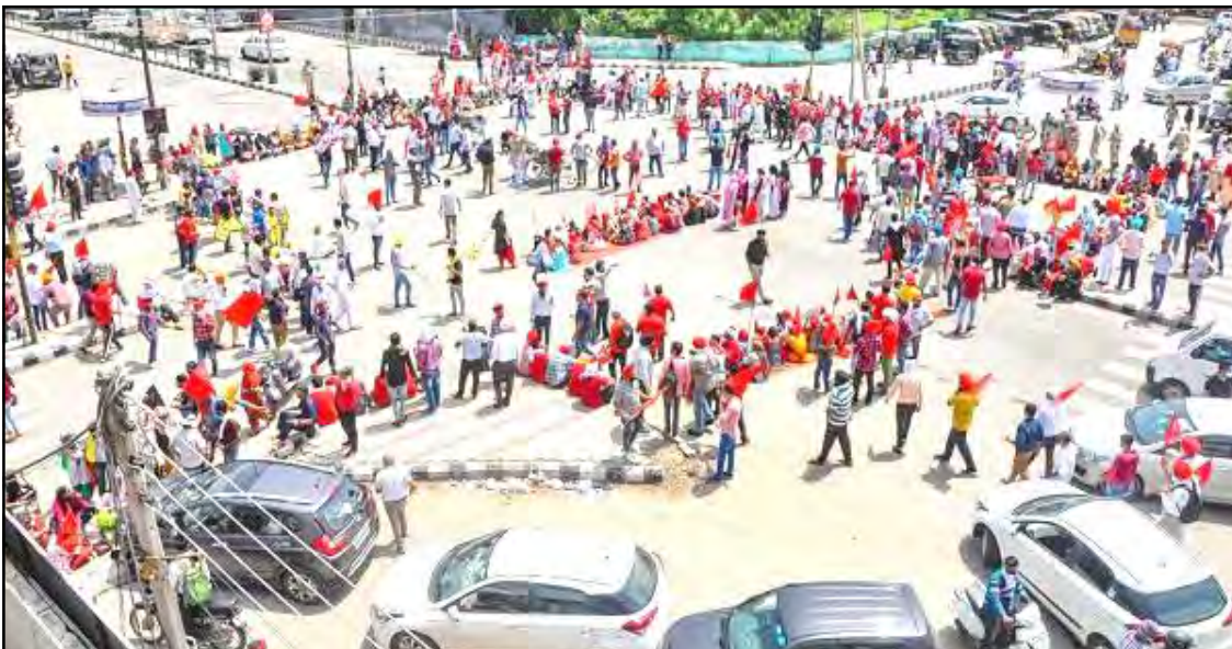
July 21, 2021 nü Patiala (Punjab) nung NSQF (National School Qualification Framework) züngsemtemi sorkar dang mapa agüjang, ta takhangba agüja Punjab sorkar anema longkak aitba noksa nung angur.

liasü. Taoba mapang Haryana Chief Minister, Chautala ya tesayurtem shimba ochimashi ken o nung küm 10 tepuokdak ayuba sülen tawa chioka liasü. "Item ozüng ya agentsüla. India nung rongsenkettsüng tamendakdakji aluyimba lir. India nung rongsenkettsüng tongtiretji aluyimba lir. Longkak aitba ya aluyimertem aser alu nung aayangertem atema dang masü saka linük nübur ajak atema lir. Onoki aluyimertem temeden atema raratsü," ta pai metedaksü. Delhi Police-ia Jantar Mantar nung longkak aitsü atema aluyimertem nem temelaba agütsügo. Aluyimertem lenir kati, aluyimertemi Jantar Mantar nung tesünep nung longkak aitsü aser aluyimertem shinga Parliament-i maotsü, ta metedaksü.