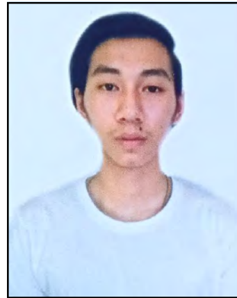
Sp. YANGERTEMJEN TOP 4, HSLC