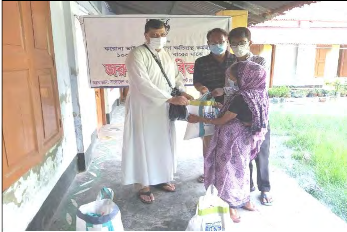
Bangladesh nung Khristantemi coronavirus wara agi kongshiba kibongtem nem chiyungtsü lema agütsüba noksa nung angur.

July 22, 2021: Muslim nung ner nütüning timba aliba linük, Bangladesh nung tang coronavirus wara kanga prokba mapang nung Khristan lanur tentetemi linük nung coronavirus wara agi kongshiba kibongtem aser sensakertem yaridar.