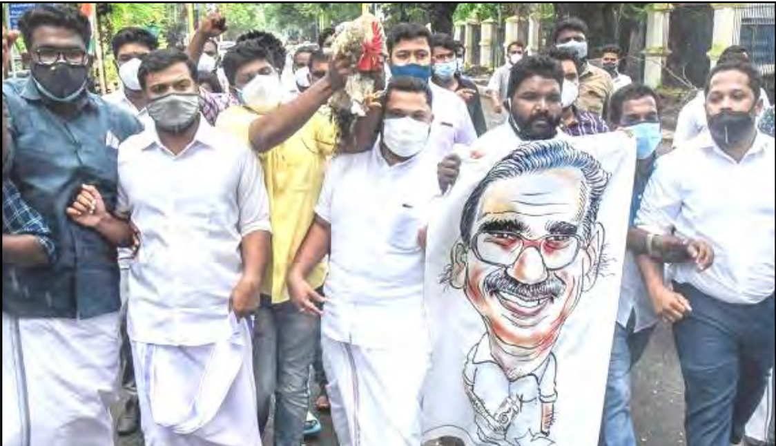
July 22, 2021 nü Kochi (Kerala) Youth Congress züngsemtemi Forest Minister, A K Shashindran-i minister menden toktsüsü, ta takhangba agüja longkak aitba noksa nung angur. Kollam nung party züngsem kati tetsür dak tim mesüi benshiba ken o ka Saseenndran-i bentetsüsü merangogo, ta minister nem tai tonglojka lir.

New Delhi, Chiteni/July 22 (Agencies): Brihostibarnü Union Health Ministry-i, India nung tang tashi nung nisung 45,374 dak Mucormycosis (Black fungus) putetogo aser iba tashidak agi shiranger 4,332 stüogo, ta metetdaksü. Rajya Sabha senden nung Black fungus dak sendakba tasüngdangba ka langzüdang Minister of State Health & Family Welfare, Dr. Bharati Pravin Pawar-i, "Mucormycosis mesüra Black Fungus ta ajaba tashidak ya tashidak tasen ka masü, saka taküm May ita tashi nungbo iba tashidak ya sorkar nem osang metetdaksüsa aliba tashidak ka masü liasü, saka linük nung iba tashidak asadangtsü atema May ita nung Ministry of Health & Family Welfare-i state tem dang Epidemic Disease Act, 1897 kübok Mucormycosis ya 'sorkar nem osang metetdaksüsa aliba tashidak ka' ta sangdongtsü atema mepishia liasü," ta metetdaksü. Union Minister-isa, "Tesüiba ita ana tsüngda linük nung Mucormycosis tashidak ya kanga ajema kümдар," ta Mucormycosis mesüra black fungus ta ajaba tashidak ya fungal infection ka lir. Iba tashidak indang fungus ya teküp nung komo/tarak balala keta aliba ajanga temangi aiter, ta Union health ministry ajanga metetdaksü. Iba tashidak ya talisa coronavirus tashidak nungi anepba mapang mesüra aneper alirtem dak kanga bulua puteter. Iba dak alia diabetes agi shiranger aser temang nung tashi meiti alirtem dak iba tashidak melamela adoker.