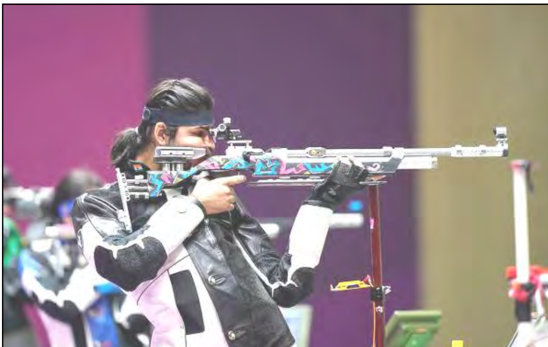
Tokyo, Chiteni/July 22, 2021: 2020 Summer Olympics tenzüksü anogo ka lia, Brehostibarnü Asaka Shooting Range nung India nung Divyansh Singh Panwar-i khashishiba yangi noksa nung angur.

Sania Mirza tanur sor sülen, lai Nadiia den longjemer taoba küm Hobart Open asayamung takok nguogo.