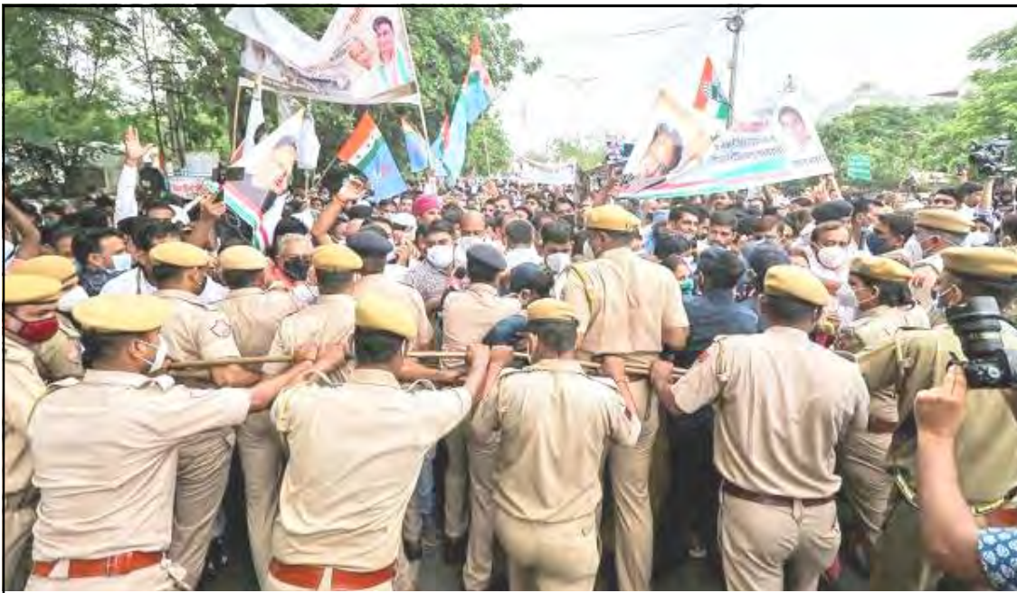
Jaipur, July 22, 2021: Pegasus spyware ken o dak sendakba nung Brihostibarnü Jaipur nung Congress züngsemtemi Centre sorkar anema longkak aitba noksa nung angur.