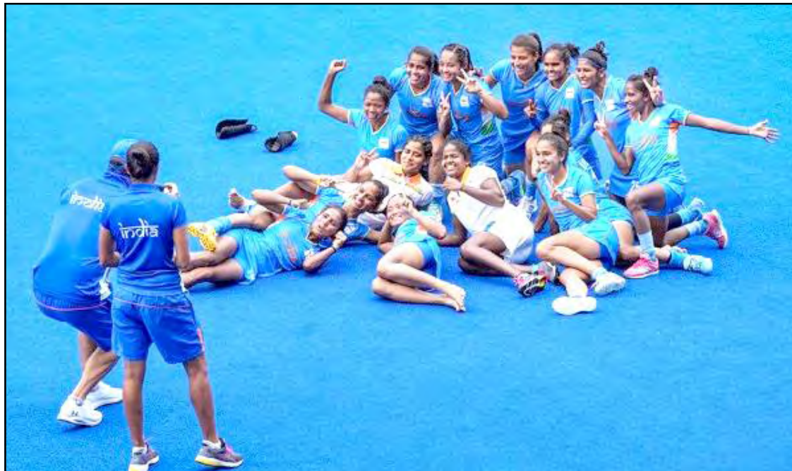
Tokyo Olympics tetsür hockey asaya quarter final asaya nung Australia team akokba sülen India tetsür team tangokba noksa nung angur.