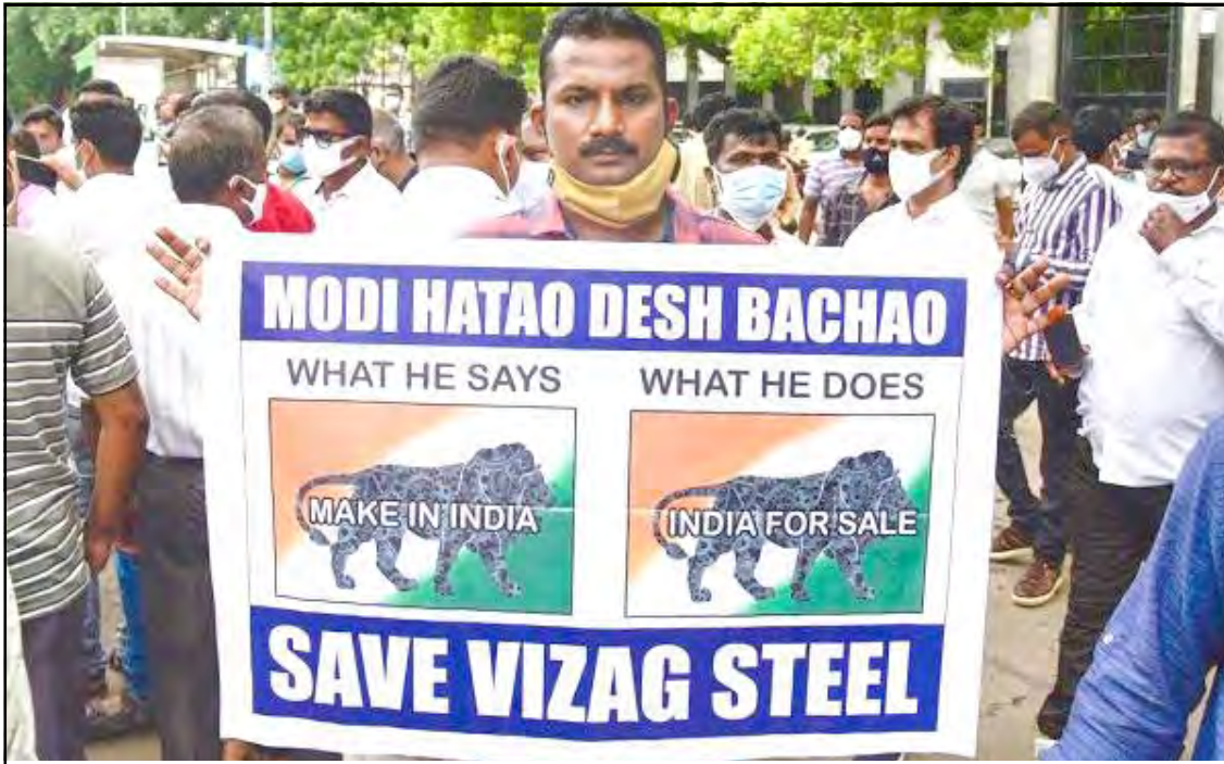
New Delhi, August 02, 2021: Visakhapatnam Steel Plant nija nem agütsüba anema Hombarnü New Delhi nung Jantar Mantar anasa steel plant nung inyakertemi sorkar aija longkak aitba noksa nung angur.