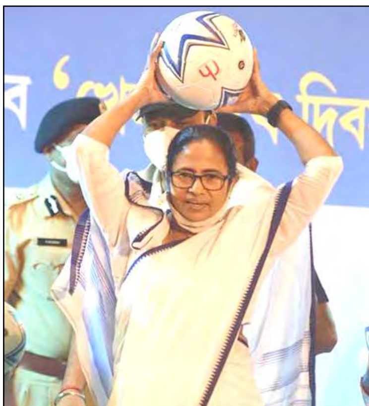
Kolkata nung 'Khela Hobe Diwas' lapokba sentong nung West Bengal Chief Minister Mamata Banerjee-i football ka yokba noksa nung angur.

Bangladesh: Mahmudullah (captain), Soumya Sarkar, Naim Sheikh, Shakib Al Hasan, Nurul Hasan Sohan, Afif Hossain, Shamim Hossain, Shaif Uddin, Taskin Ahmed, Shoriful Islam, Nasum Ahmed, Shak Mahedi Hasan, Mustafizur Rahman, Mohammad Mithun, Taijul Islam, Musaddek Hossain Saikat, Rubel Hossain.