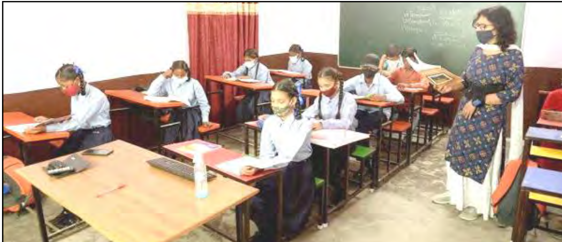
Jalandhar, August 02, 2021: Punjab nung school tem tanaben lapokba sülen Jalandhar nung aliba sorkar school ka nung tanurtem pila mener class nung adenba noksa nung angur.

Taküm July ita nung India kübok station 567 nung tzünglu kanga (115.6 nungi 204.5 mm) arua liasü aser station 112 nung tzünglu kanga sashia (204.5 mm dak tema) arua liasü.