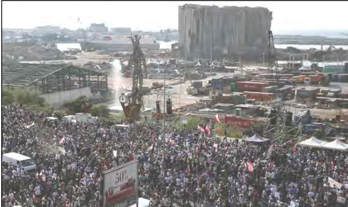
Beirut, Lebanon nung rong anendak ki tuluka poksar küm ka ajungba anogomung bilemteta nüburttem iba tesem nung adenshia aliba noksa nung angur. Linük nung rongsenketzüng jenjang kanga mejungi aser yimtenren tsütsü atsütepba ajanga sorkar ka mali küm ka ajungba mapang iba anogomung ya amunger.