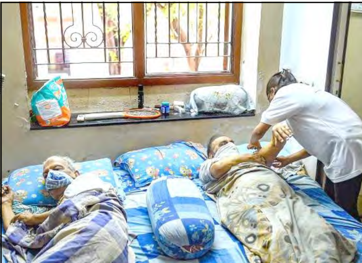
August 05, 2021 nü Mumbai nung healthcare volunteer kati tambur ka nem coronavirus vaccine tutsüba noksa nung angur. Kidang nungi mayazükter shirangertem aser matamabensartem nem ki tonga oa vaccine tutsütsü atema sorkari door to door vaccination campaign tenzüko.

Anogo ana tejaklen Editors' Guild of India-ia Supreme Court dang spyware contract osang sorkar dang meshitsü aser iba ken o bushisüngdangtsü mepishia liasü.