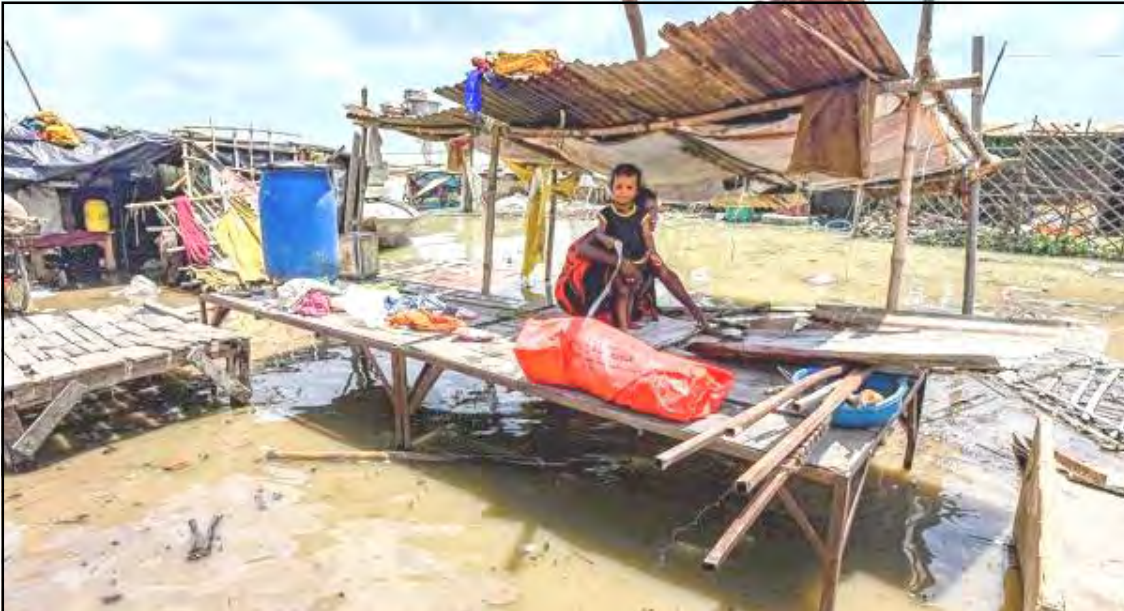
August 05, 2021 nü Uttar Pradesh kübok Prayagraj nung aliba Ganga ayong nung tzü kanga metsünga ayimba ajanga ayongküm anasa aliba kibong ka meyong ki raksar aliba noksa nung angur.