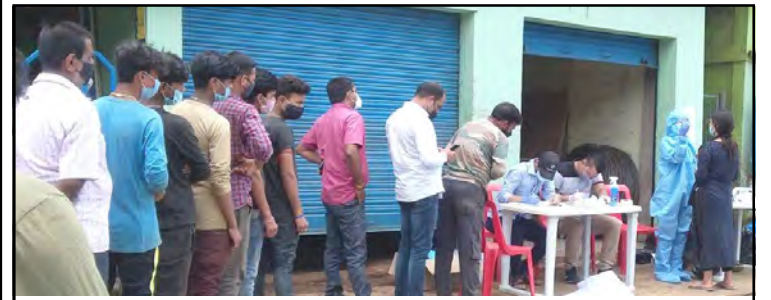
August 5 nü Mokokchung jilakübok Sewak Gate nung COVID tashidak tendangba noksa nung angur.

Dimapur, Luroi/August 5 (TYO): District Task Force, Mokochung-i, July 26 nungi August 5 nü tashi Mokochung jila nung dokan amenertem, kou mejepertem, lendi nung shishilembartem, aahyangertem aser temulungertem dak Covid-19 tashidak tendanga liasü.