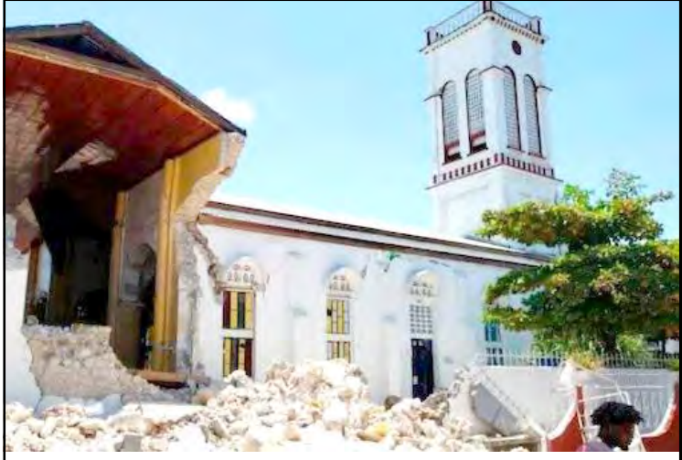
August 14, 2021 nü Haiti nung menoknok sashia anokba ajanga Les Cayes nung aliba Sacred Heart Arogo Tenla ki raksaa aliba noksa nung angur.

August 16, 2021: Honibarnep (August 14) Haiti nung menoknok magnitude 7.2 nung anokba sülen tasü mang 300 angu; iba menoknok ajanga Tenla kitem densema building meyirjang aika chirepogo; Amongnü nikongdang tashi nungbo tasü mang ajak senteper 1,297 nguogo aser nisung 5,700 dak tema yiruba jangjaogo.