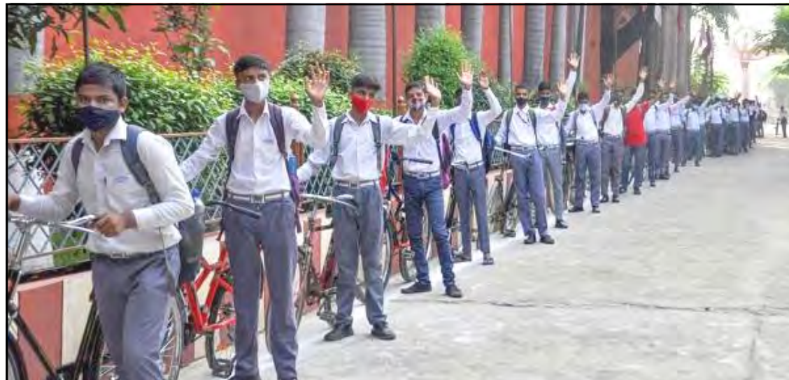
Meerut, August 16, 2021: Uttar Pradesh nung Class 9-12 purtem school tanaben lapoktsü melaba sülen Meerut nung kaketshirtem school-i aoba noksa nung angur.

Union Health Minister, Mansukh Mandaviya-i twitter ajanga, "Otsü tasen ka yanglua India-i coronavirus vaccine dose crore 55 agütsüogo. Asenoki India nung coronavirus anema raraba tashi taitba kümdaktsüdi. Asenoki vaccine agidi," ta metetdaksü.