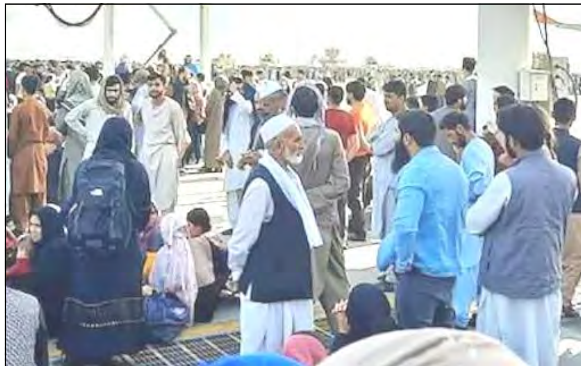
Taliban teloki Afghanistan agiba sülen iba linük toktsür ajentsü atema nisung aika Kabul airport nung adenshia aliba noksa nung angur.