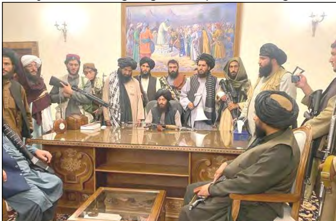
Afghanistan Tir Ashraf Ghani linük yutsür jena aoba sülen Taliban züngsemtem Kabul, Afghanistan nung aliba Afghan presidential palace (Afghan tir aliba ki) nung tangokba noksa ka yangi angur.

Taliban odongtar Suhail Shaheen-i Twitter nung ashiba agi, nisung shinga meyirutsütsü aser timtem magütsütsü asoshi