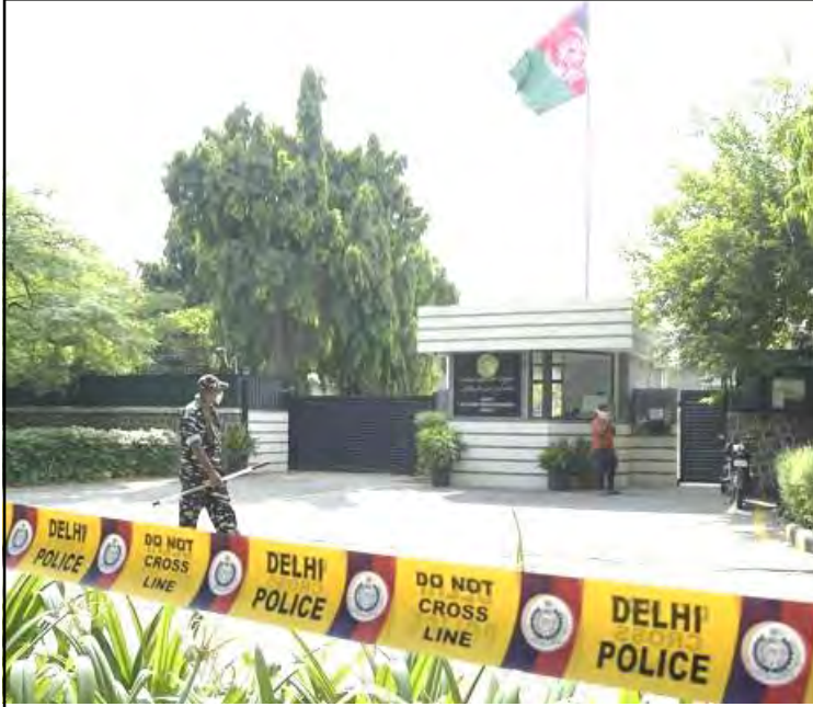
August 16, 2021 nü New Delhi nung security sepaitemi Afghanistan Embassy anükba noksa nung angur. Afghanistan Tir, Ashraf Ghani-i linük toktsür ajenba sülen Taliban kiralongrartemi Afghan presidential palace agiogo.

New Delhi, August 16 (Agencies): Indian Air Force (IAF)-i parnok indang tayimtsü ajanga Afghanistan nung aliba India nunger aser ketdangsertem anir arutsü; tang Afghanistan nung India nunger ketdangser aser security staff 500 shi lir.