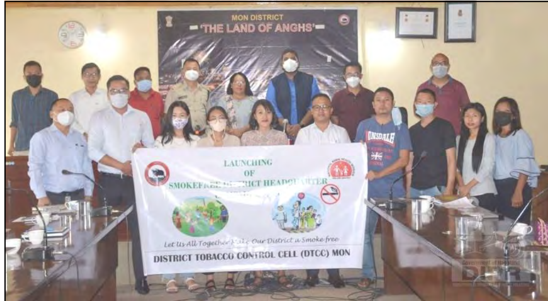
Mon, Luroi/August 17, 2021: Deputy Commissioner, Thavaseelan K, IAS-i Mon nung 'Smoke Free District Headquarter Campaign' tenzüksüba mapang tangokba noksa ka yangi angur.

Mon, Luroi/August 17, 2021 (TYO): Hombarnü, Mon DC Office, Conference Room nung, Deputy Commissioner, Thavaseelan K, IAS-i 'Smoke Free District Headquarter Campaign' tenzüksüogo. District Level Coordination Committee senden agiba mapang iba campaign tenzüksüba liasü, ta sangdong ajanga metetdaksü.