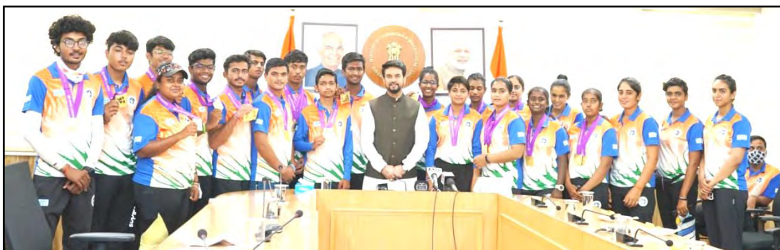
New Delhi, Luroi/August 17, 2021: Mongolbarnü, Union Minister of Youth Affairs & Sports, Anurag Thakur-i World Youth Archery Championship nung takok angur India team den külemi tangokba noksa ka yangi angur. Iba asayamung nung takok tulu ngua India nem tenüng tajung bener arutsüba asoshi Thakur-i team nem tenüngsang agütsüogo. Wrocław, Poland nung ayongba World Youth Archery Championship nung India team-i gold medal 8, silver medal 2 aser bronze 5 densema medal 15 angu.