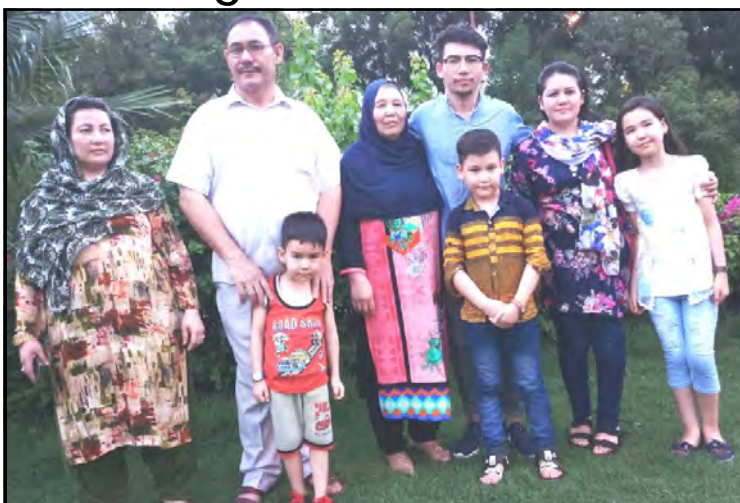
2018 küm Afghanistan nungi India-i jena aruba Khristan kibong ka noksa nung angur. Afghan Embassy-i ashiba agi, tang Delhi nung Afghanistan nunger refugee 30,000 shi lir.

Iba linük nung Khristan timbaka Islam yimsü toktsür