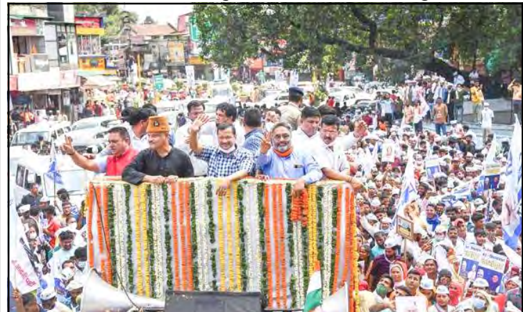
Delhi Chief Minister Arvind Kijriwal aser Uttarakhand election atema chief ministerial candidate, retired Colonel Ajay Kothiyal na Dehradun nung 'Devbhoomi Sankalp Yatra,' Sentong agiba mapang tangokba noksa nung angur.

New Delhi, Luroi/August 17 (Agencies): 2022 küm agitsü aliba Uttarakhand Assembly election atema Aam Aadmi Party's (AAP) chief ministerial candidate ji retired colonel Ajay Kothiyal asütsü. AAP convener aser Delhi chief minister Arvind Kejriwal shiba tang Dehradun nung oa lir, pai Uttarakhand ya AAP-i, alima ajunga nung prokshia aliba India nungertem atema spiritual capital kümdaksütsü ta ashi. Paisa, sorkar kümtettsü atema AAP nem maongka agütsüra par party-i lanurtem atema mapa balala agütsütsü, ta tenangzükba agütsü.