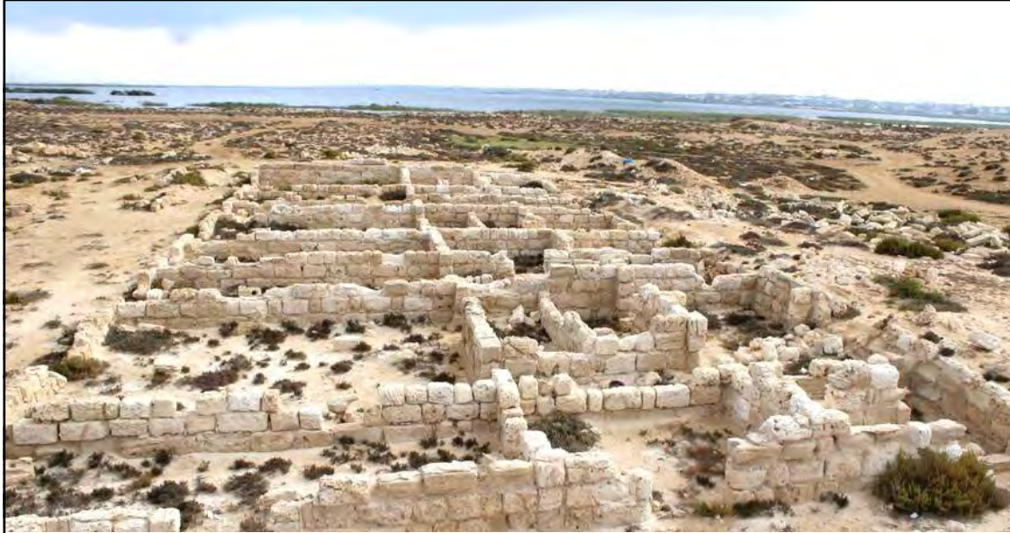
Egypt kübok Mariout awatsüing anasa akhidang Khristantem aliba jila ka nung parnoki yangluba kiojen ka noksa nung angur.

Cairo, August 17 (Agencies): Poland nunger research agirtemi akhidang Aso 6buba mapang Egypt nung aliba Marea yimti nung Khristan jila ka aliba ngutetogo.