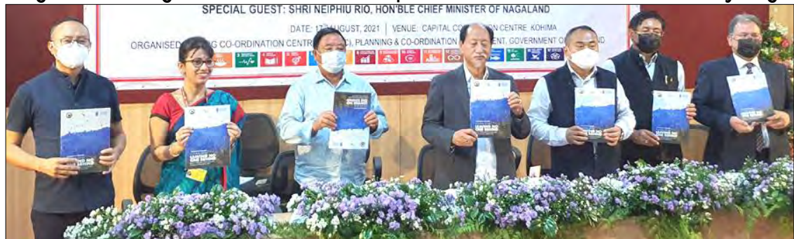
August 17, 2021 nü Kohima nung Vision 2030 document aser District SDG Localisation & Integration Manual sayaba sentong nung Chief Minister Neiphiu Rio aser tangartem agiba noksa angur.

Kohima, August 17, 2021 (TYO): Mongulbarnü Nagaland sorkari Vision 2030 document aser District SDG Localisation & Integration Manual sayaogo.