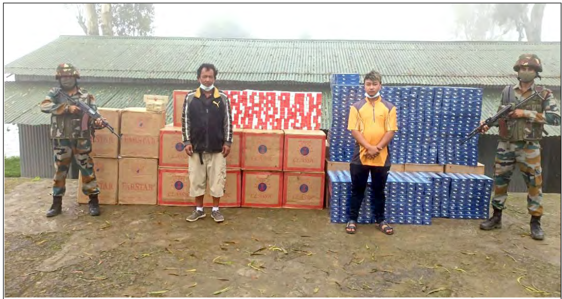
Assam Rifles-i Mizoram nung Heroin gram 119.6 aser foreign cigarettes case 82 ngutetogo. Osang tejangja ka angazükba sülen Assam Rifles aser Customs Department ketdangsurtemi Zokhawthar tesem mita aodang Rs. 47, 84,000 jenjang heroin apu. Ano Chhungte tesem nunga parnokki mita aodang Rs. 1,06,60000 jenjang foreign cigarettes apu. (Aizawl, August 17)