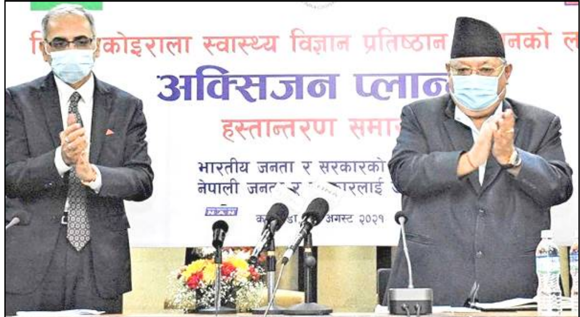
August 26, 2021 nü BPKIHS, Dharan nung India-i Nepal nem 960 LPM medical oxygen plant agütsüba sentong nung Ambassador of India to Nepal, Vinay Mohan Kwatra aser Nepal State Minister of Health & Population, Umesh Shrestha na tangokba noksa nung angur.