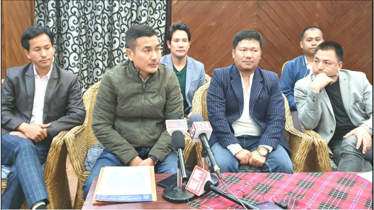
All Arunachal Pradesh Students Union (AAPSU) tanishirtem (file photo)

Itanagar, Luroi/August 26 (Agencies): Arunachal Pradesh sorkari Chakma aser Hajong nunger refugee tem state adena orr lidaktsütsü asoshi sentong aliba All Arunachal Pradesh Students Union (AAPSU)-i pelashishia agizükogo.