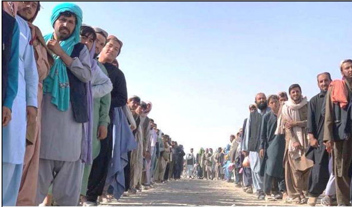
Chaman, Pakistan nung aliba 'common border crossing' ajanga Afghan nungertem Afghanistan-i aotsü atema atatepa aliba noksa ka yangi angur. Kinunger semdangtsü, temang anepalutsü aser shishilempaba maparen balala inyaksü atema anogoshi Pakistan aser Afghan nunger iba arütsü ya alema senzür. Tang Kabul nungi nüburtem anizüker aoba mapang ka nung liaka Pakistan-i arütsü nung tenokdangba agüja mali.

Kabul, Luroi/August 26 (Agencies): Anüolen linüktem nungi sepaitemi August 31 matongdang akok tashi nüburtem anizüker aotsü aritepba mapang Islamic State (IS) telungpuri kiralongra mapa inyaksü akok ta tetsübu nung United States aser külem linüktemi Brehostibarnü nüburtem dang Kabul airport nungi ainshitsü ajungshia liasü. Taliban den küm 20 raradang anüolen linüktem yariba Afghan nunger aser bendanger meyrirjang aika iba linük nungi anizüker aotsü tebilemstü tuluba akumer, kechiaser US aser allied sepaitem ya taruba hopta iba airport yutsür ainshitsü lir. Bodhbar nikonkdang tekümdangtsü osang ka sangdongba mapang Kabul nung aliba US embassy ajanga nüburtem dang airport-i maotsü ajungshi aser yangji oa gate nung alirtem tekeraba nung yutsür ainshitsüla, ta ashi. Britain-ia airport tesem nung