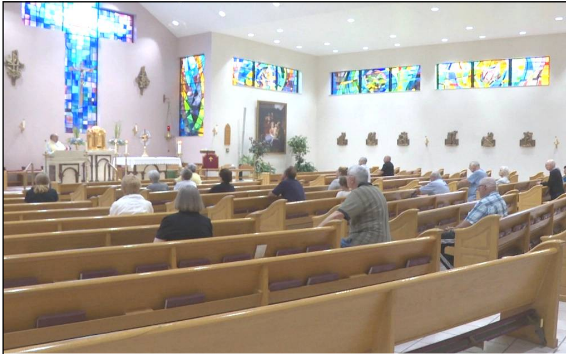
August 25, 2021 aonung Steubenville, Ohio nung aliba Holy Family Arogo nung Khristantemi Afghanistan atema sarasademtsüdang tangokba noksa nung angur.

August 26, 2021: Afghan nunger Khristan missionary kati alima tesem balala nung Khristantem dang Afghanistan nung underground Arogo atema sarasademjang, ta mepishi.