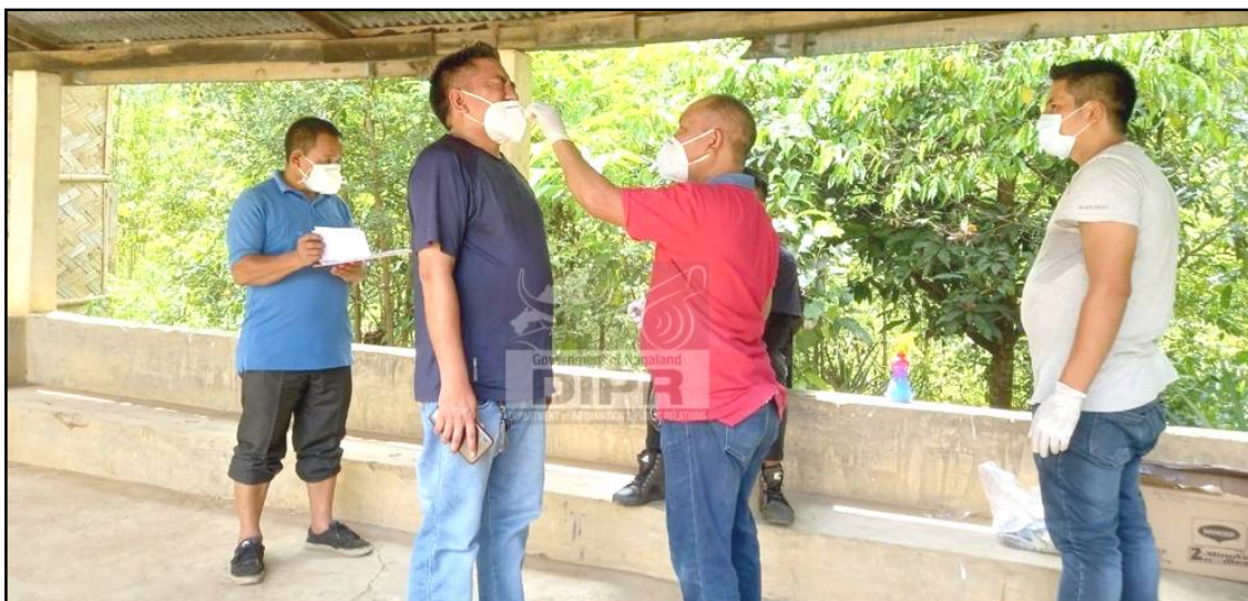
Peren, Luroi/August 26, 2021: Brehostibarnü, Lamhai Namtsi Police Check Point, Jalukie nung Peren Medical Department-i tapi agi Covid-19 tendanga aoba (Random Covid-19 Test Drive) mapang tangokba noksa ka yangi angur.

'Dance Deewane' ya COLORS channel nung sayudar.