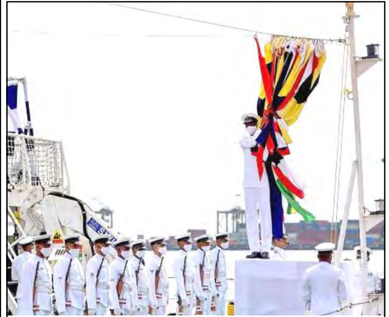
August 28, 2021 nü Chennai Port nung Indian Navy-i India Coast Guard Ship 'Vigraha' semzükdang tangokba noksa nung angur.

Hokolbarnüa Minister of State for Defence Ajay Bhatt-i anüdoklen Ladakh kübok Chushul sector nung Line of Actual Control (LAC) len security tensa asadanga liasü, iba sülen pai Leh nung Army tongti ketdangsertem ajuru. Bhatt-i anogo asemnü atema Union Territories of Ladakh aser & Jammu & Kashmir semdang.