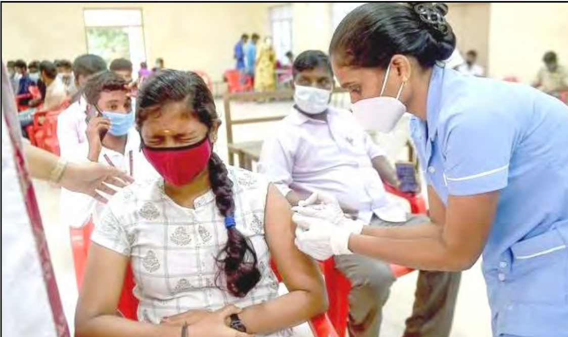
August 28, 2021 nü Chennai nung aliba Nandanam Government Arts College nung arrshi küm 18 ser temapur kaketshirtem nem coronavirus vaccine tutsüba noksa nung angur.

yimtsüngtem rongsenkettstung ajungkettsütsü atema terenlok mapa aika inyaksüogo ta shiogo," ta kasa osang ajangasa metetdaksü. CM Baghel pusemertemisa Congress in-charge Chhattisgarh, PL Puniya aser Congress General Secretary, KC Venugopal na ajurua senden menogo. 2018 küm December ita nung Chhattisgarh assembly election nung Congress-i takok tulu ngua liasü. Taküm June ita nung Baghel-i aniba sorkar küm ana ser tasadang ajungba mapang nungi Deo pusemertemi chief minister melentepa inyaksü akhanger. Ajisüaka Baghel aser Deo napronglai party bangdak lenirtemi kechi shidir angatsü, ta shiogo.