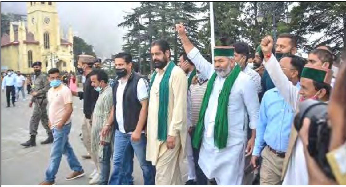
August 28, 2021 nü Shimla nung Bhartiya Kisan Union lenir, Rakesh Tikait leniba nung aluyimertemi aluyimba ozüing tasen asem anema longkak aita jajaba noksa nung angur.