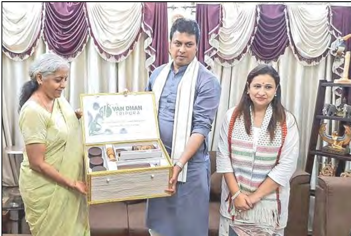
Tripura yimtiba Agartala nung Union Finance Minister Nirmala Sitharaman-i Tripura Chief Minister Biplab Kumar Deb den ajurutepdang la nem aou agi yangluba handicraft items agütsüba angur. (Agartala, August 28)

malitsü atema Central forces mapa lezmükja lir. Assam-i par lushi nung gari lenmang yanglur ta Mizoram-i tai tongloksür. "Iba tesem nung alirtemi gari lenmang yangluba anema noktak aser onok nem osang sangoktsü. Assam nungeri Mizoram lushi telungi aitba atema onoki mapa inyakba noktang. Onoki tensa tiptema süngjemdaktsütsü meranger" ta Mizoram nung Kolasib district SP Vanlalfaka Ralte-ia ashi.