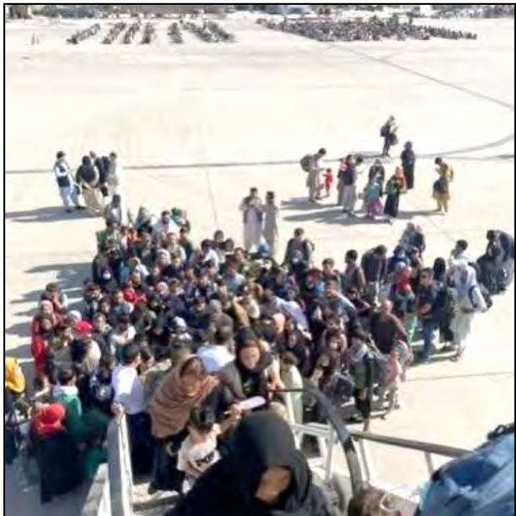
Tan hopta Narazene Fund-i kümzükba Afghan Khristantem aser tangartem tayimtsüi ayaketdang tangokba noksa nung angur.

August 28, 2021: Mercury Radio Arts CEO, Glenn Beck-i, nijai sponsor süa kümzükba mission ka kübok Afghan nunger Khristantem aser Afghanistan nung lendong ajurutsüsa alir 5,100 kümzükogo, ta metetdaksü.