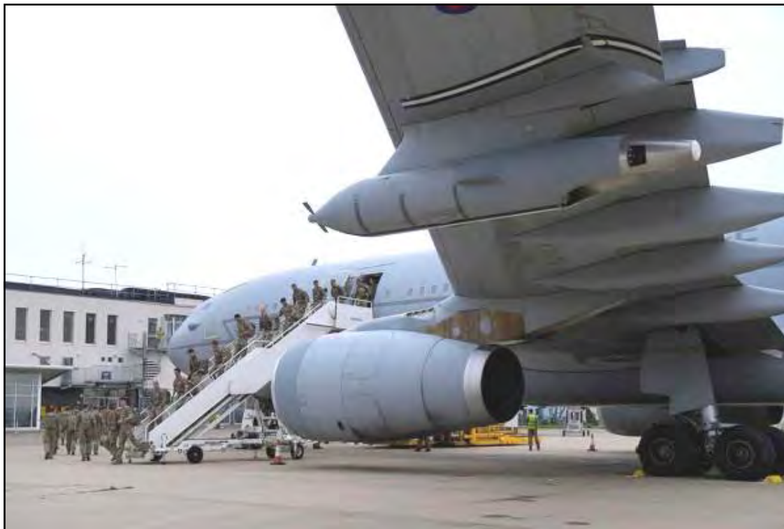
Afghanistan kübok Kabul airport nung nüburtem aninba nung teyari agütsüba sülen British armed forces 16 Air Assault Brigade nungi sepaitem RAF Voyager aircraft nung Brize Norton, England tonga aoba sülen air terminal-i aoba noksa nung angur. Kabul airport ajanga nisung 100,000 dak tema takok ngua aninogo, ta US-i ashi, ajisüaka nisung meyirejang aika ano Afghanistan toktsür moteti lir.