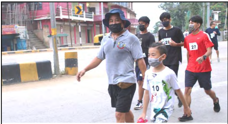
Dimapur, Luroi/August 28, 2021: Dorians Society-i ayongba 'Nature-Fitness Walk 2021' sentong nung shilem agirtem tangokba noksa ka yangi ankur.

Dimapur, Luroi/August 28, 2021 (TYO): Fit India Movement mapatong shilem ama, Honibarnü (28.08.2021) Dorians Society, Dimapur-i 'Nature-Fitness Walk 2021' ayongzükka liasü. Impact Ministry aser Dimapur District Basketball Association den Dorians Society longjemer Dimapur kübok kilometer 18 shi ayimjema 'non-competitive