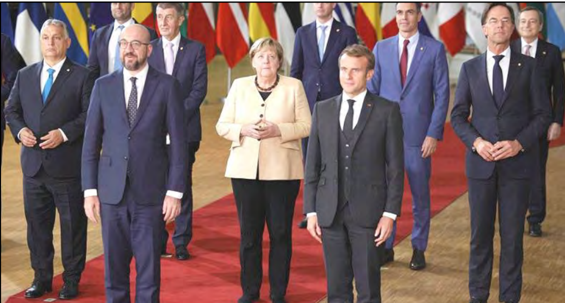
Brussels nung European Union senden ka amenba mapang tangokba noksa ka nung abelen nungi, Hungary Ato Kilonser Viktor Orban, Malta Ato Kilonser Robert Abela, European Council Tir Charles Michel, Czech Republic Ato Kilonser Andrej Babis, German Chancellor Angela Merkel, Belgium Ato Kilonser Alexander De Croo, French Tir Emmanuel Macron, Spain Ato Kilonser Pedro Sanchez, Dutch Ato Kilonser Mark Rutte aser Italy Ato Kilonser Mario Draghi nungertem angur.