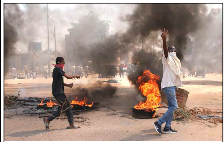
Civilian yimsüsüba nem sorkar agüjang ta Sudan nūburtemi linük yimtiba, Khartoum nung longkak aitba mapang tangokba noksa ka yangi angur. Linük tarutsü jenjang atema mitkar lenirtem aser Sudan nunger democracy busemba telok tsünga tesendaktep tamajungba kuma otagi.

Bhasan Char ya Bangladesh southwest tsütsü tziikum nungi kilometre 50 shi pilar lir, koba linük yimtiba, Dhaka nungi south tsütsü kilometre 193 pilar alitsü, kong sorkari cluster house 1,400 yanglu aser ki shia takdang 16 lir.