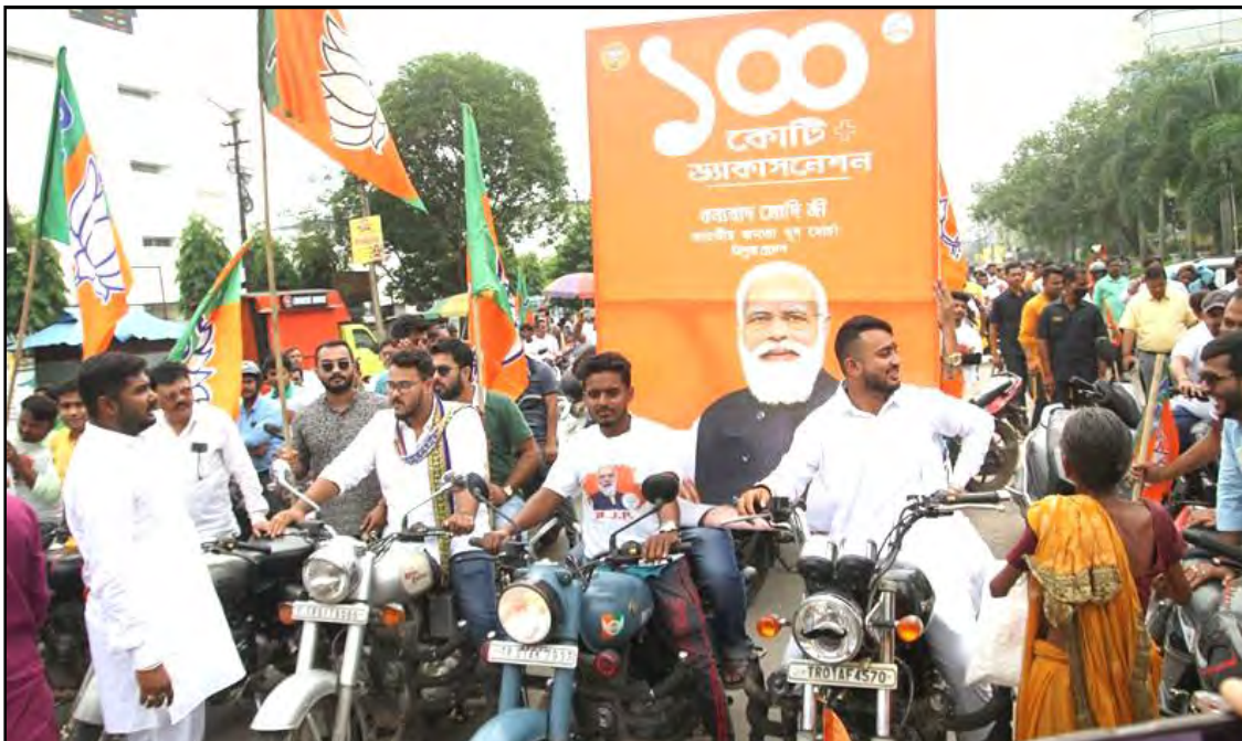
India nung Covid-19 vaccine billion ka agütsüba alizüng tongtetba nungtem nung Agartala nung ayongzükba cycle rally ka nung BJP züngsemtemi shilem agiba noksa nung angur.

Meghalaya minister James Sangma-i, "Taoba mapang State tir, NPP Arunachal Pradesh Unit, Gicho Kabak asüba osang angashia mang ayimer. Arunachal State nung Party (NPP) ajungkettsütsü aser tejakleni anir aotsü asoshi pai shilem tulu agiogo. Asür Kabak-i toktsür aoba adianutem dem mangyim jashi lemsateper. Pa tanela teti tatem maka tesünep nung anisüngzükdakjangma," ta lemsatepa liasü.