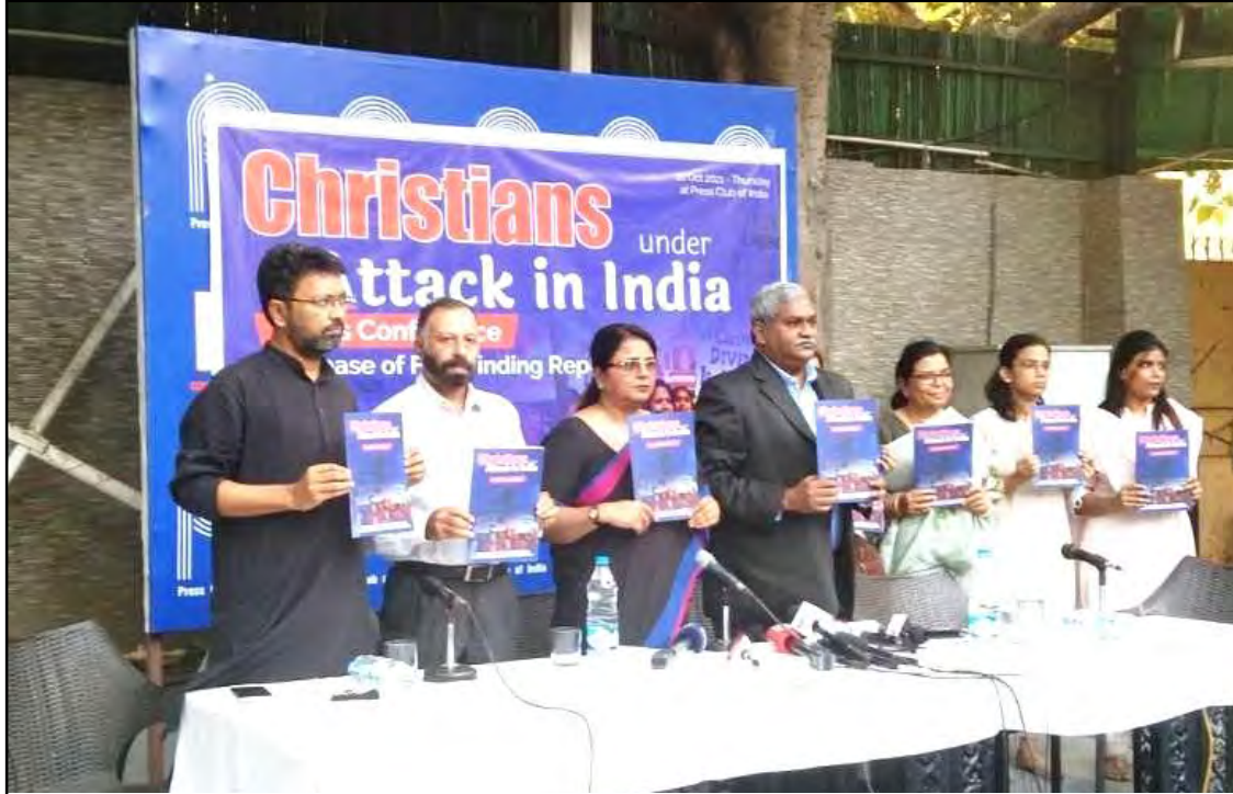
October 21, 2021 nü New Delhi nung osangbenertem senden ka nung India nung Khristanem anema inyakba report ka sayaba mapang tangokba noksa nung angur.

New Delhi, October 22 (Agencies): October 21, 2021 nü New Delhi nung osangbenertem senden ka nung India nung Khristanem anema inyakba report ka sayaogo.