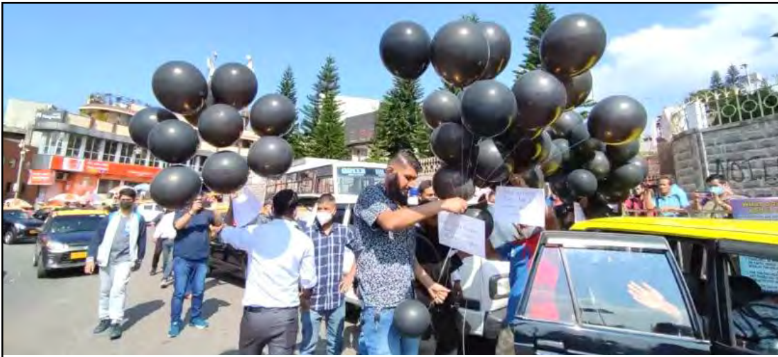
Shillong, Oct 22: Hynniewtrep Youth Council (HYC) züngsemtemi October 22 nü totsü jenjang ajungketba anema longka aitogo. Parnoki petrol, diesel aser LPG nung saru shilem 50 agi ajemtsütsü khanga liasü. Placards aser banner tem amer council züngsemtem aser nüburtemi Motphran nungi Khyndailad (Police Bazaar) tashi yimyim ayima yimtung süa ao.