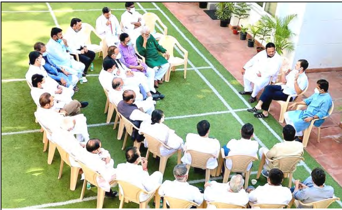
October 22, 2021 nü New Delhi nung Congress Party lenir, Rahul Gandhi-i Gujarat nungi Congress lenirtem den senden amendang tangokba noksa nung angur.