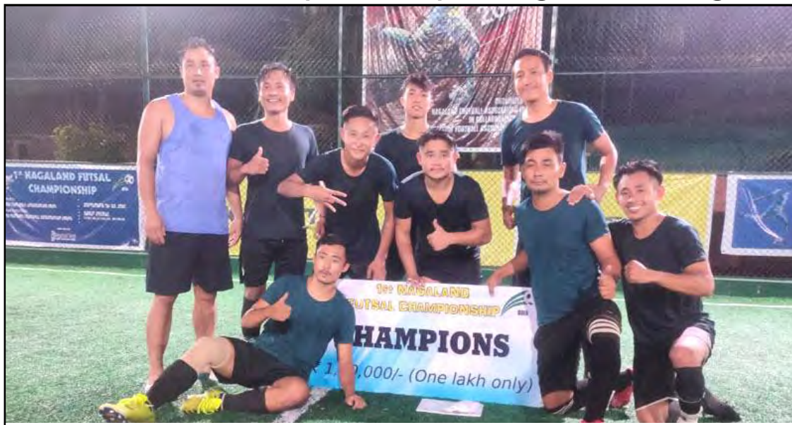
Telongjem FC asyartem 1st Nagaland Futsal Championship 2021 nung takok angundang tangokba noksa.