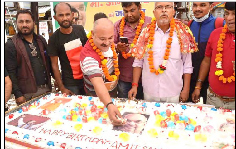
Bhopal, October 22, 2021: Hokolbarnü Union Home Minister, Amit Shah asoba anogomong nung Bhopal nung BJP lenirtem benjungtepba noksa nung angur.

Osang angazükba agi, Centre sorkari totzü export asüba linüktem dang crude oil jenjang ajemtsü atema mepishidar.