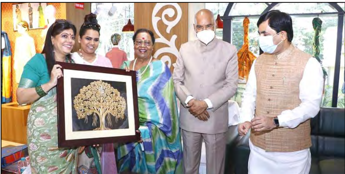
October 22, 2021 nü Patna nung Bihar Industries Minister, Shahnawaz Hussain (ajichilen noksa)-i linük Tir, Ram Nath Kovind aser kinüngtsü, Savita Kovind na nem sempet ka agütsüdang tangokba noksa nung angur.

Sangküm küm tenzüklen Uttar Pradesh densema state pongu nung assembly election agitsü lia asükwa mongpu Parliament amentsü.