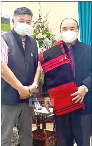
Abu Metha-i tanü Mizoram Chief Minister Zoramthanga den ajurupetba noksa nung angur.

Mizoram Youth Commission (MYC)-i jaokba atema Abu Metha ya tang Mizoram nung oa lir.