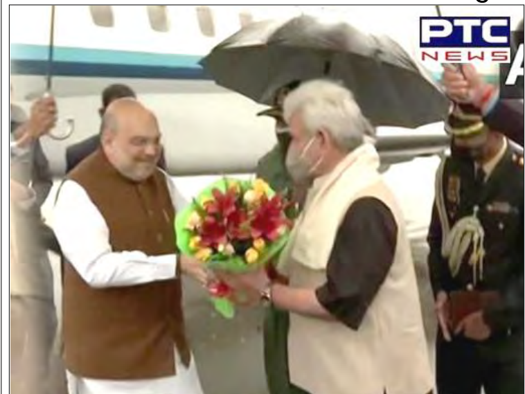
October 23, 2021 nü Union Home Minister, Amit Shah Srinagar airport tonga aruba mapang nung Lieutenant Governor, Manoj Sinha-i pa agizükba noksa nung angur.

Srinagar, Mongputeni/October 23 (Agencies): Tawa Jammu & Kashmir nung kiralongrartemi civilian aika tepsetba ajanga tensa mejungi aliba mapang ka nung Union Home Minister, Amit Shah-i anogo asemnü atema J&K semdanga Honibarnü Srinagar tonga ogo.