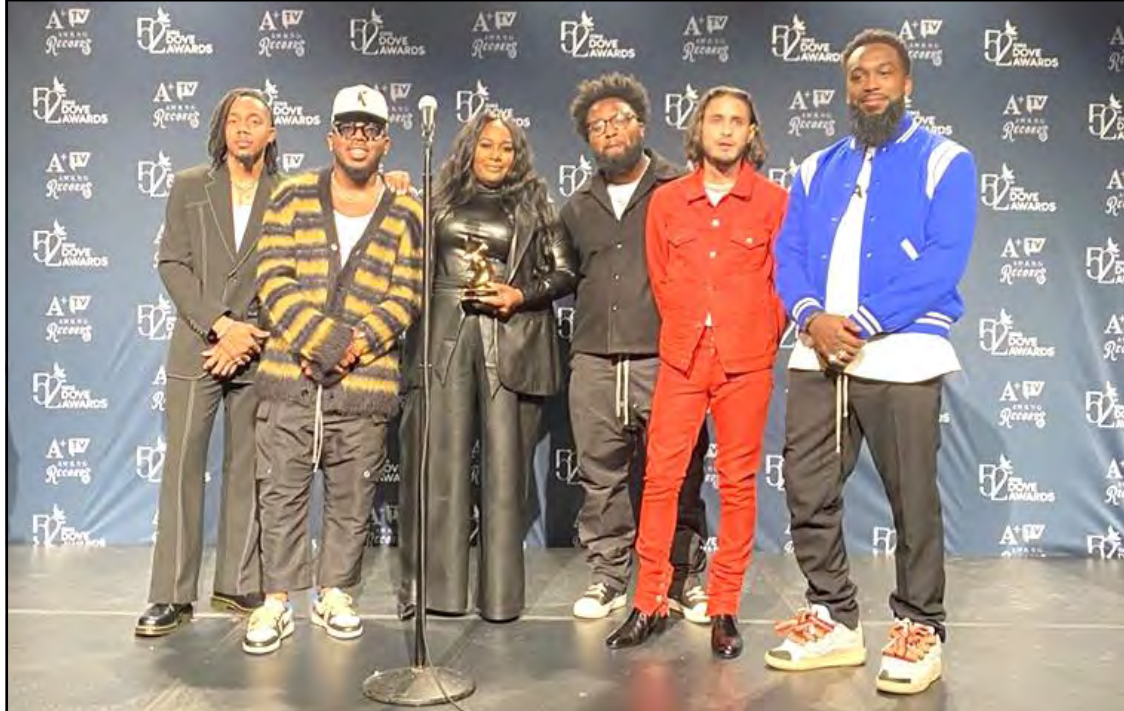
October 19, 2021 aonung Nashville, Tennessee nung 52buba Gospel Music Association Dove Awards sentong nung New Artist of the Year award anguba sülen Maverick City Music telokpur tangokba noksa nung angur.

Nashville, October 23 (Agencies): October 19, 2021 aonung Nashville, Tennessee nung 52buba Gospel Music Association Dove Awards sentong agiogo; iba sentong nung Maverick City Music teloki New Artist of the Year award ngua liasü.