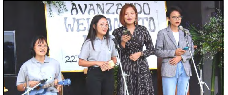
MCTE nung azüngertemi Freshers Day sentong nung shilem agir

Mokokchung, 23 Oct (TYO): Mokokchung College of Teacher Education (MCTE) pur 10buba Freshers' Meet sentong "Avanzando - moving forward" omen dak rangloker 22nd October, 2021 nü parnok college kilem nung mungogo, ta MCTE osang ka ajanga metetdaksü.