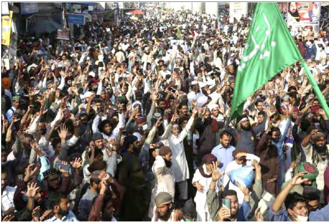
Radical Islamist political party; Tehreek-e-Labiak Pakistan pusemertem Islamabad-i apusoa mao tsüngda Lahore yimti nung yimyim ayima senzüba noksa nung angur.

Lahore, Mongputeni/October 23 (Agencies): Radical Islamist party kati Honibarnü ashiba agi, Pakistan kübok Lahore yimti nung ketdangsürtem den mangatettep adokba sülen parnok pusemer pongu süogo. Iba mangatettep nung police ketdangsüra ana asü.