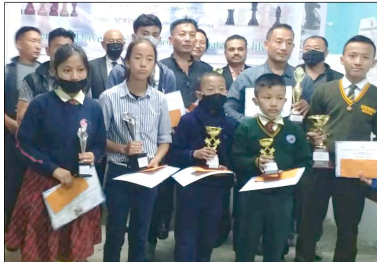
1st Rapid Nagaland State Chess Championship nung takoker aser ketdangsertem külemi tangokba noksa nung angur.